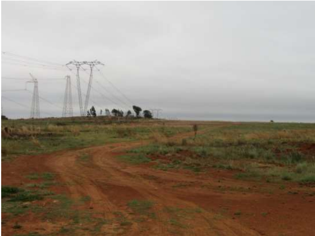
Figure 10: A general view of the area between the Delmas Road & Garsfontein Road sections.