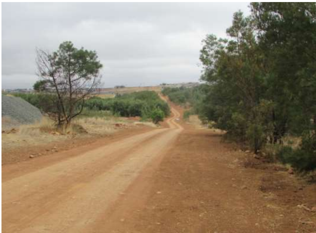
Figure 5: Another section of the K147 Road section between the Hills & Atterbury Road.