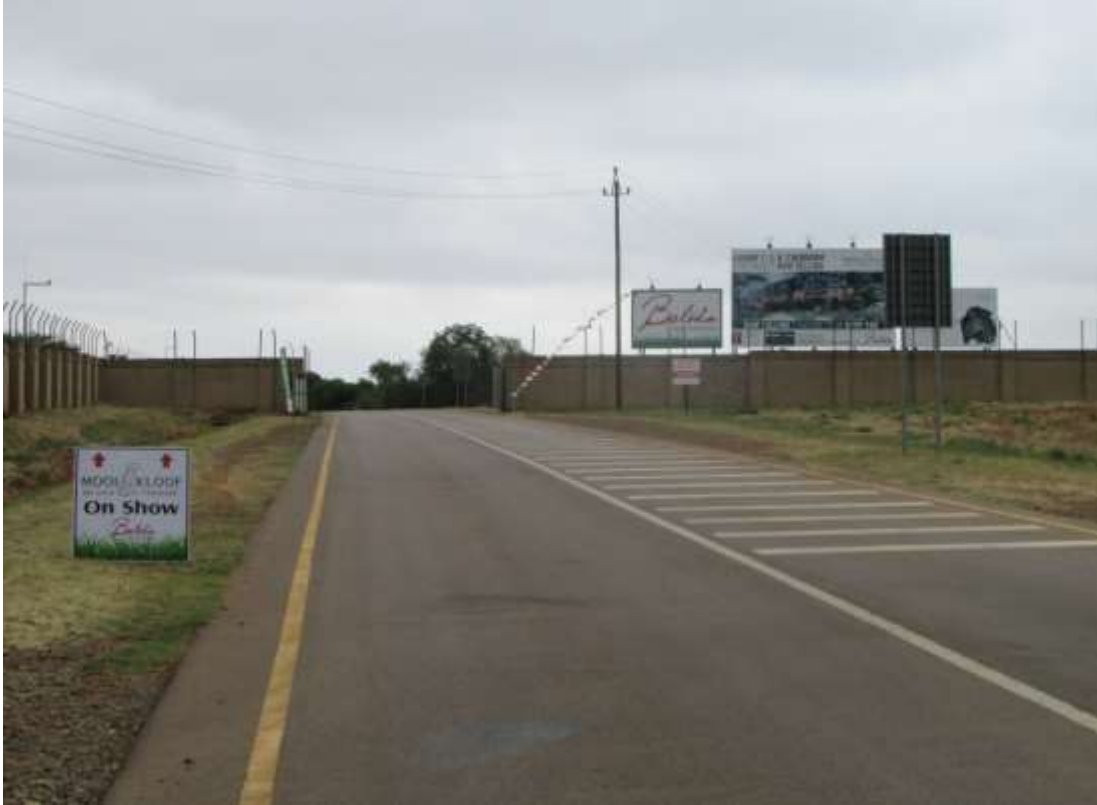
Figure 3: A view of the Atterbury Road link to the K147 at The Hills Eco Estate entrance.

alignment of the K147 Road has been determined and access to these private properties has been obtained that this section be assessed in more detail for inclusion in a Final Heritage Report.