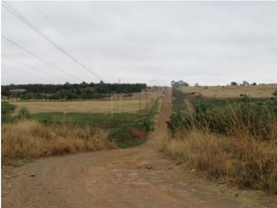
Figure 12: Another general view of the area between the Garsfontein Road and Delmas Road intersection. It needs to be noted that the current proposed alignment does not follow this existing route.