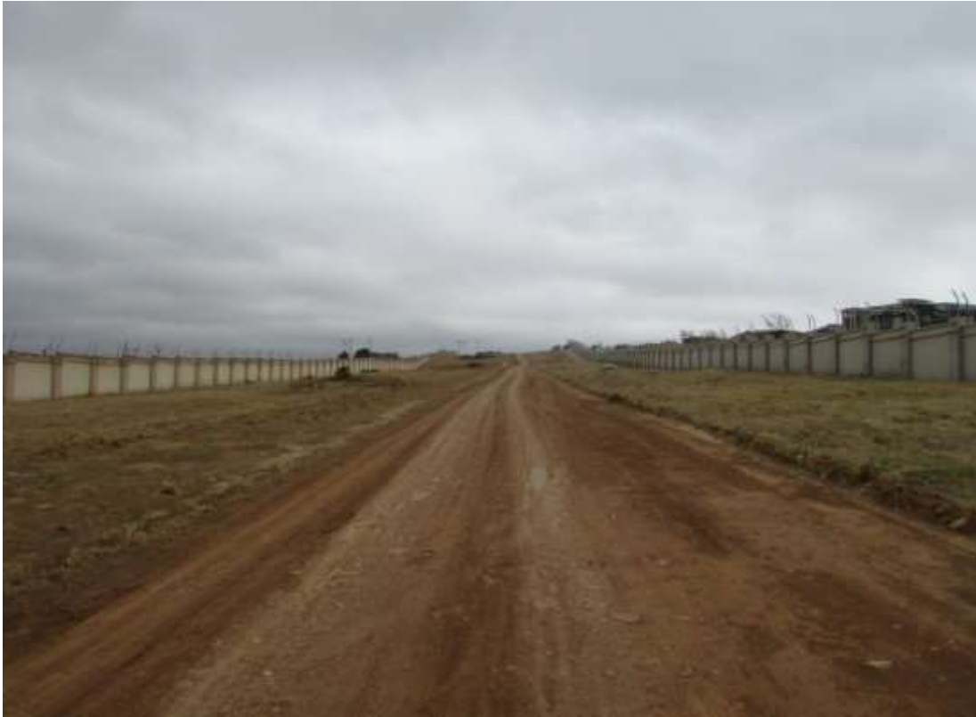
Figure 6: Part of the proposed K147 Road from the Garsfontein Road junction towards the Atterbury Road link.