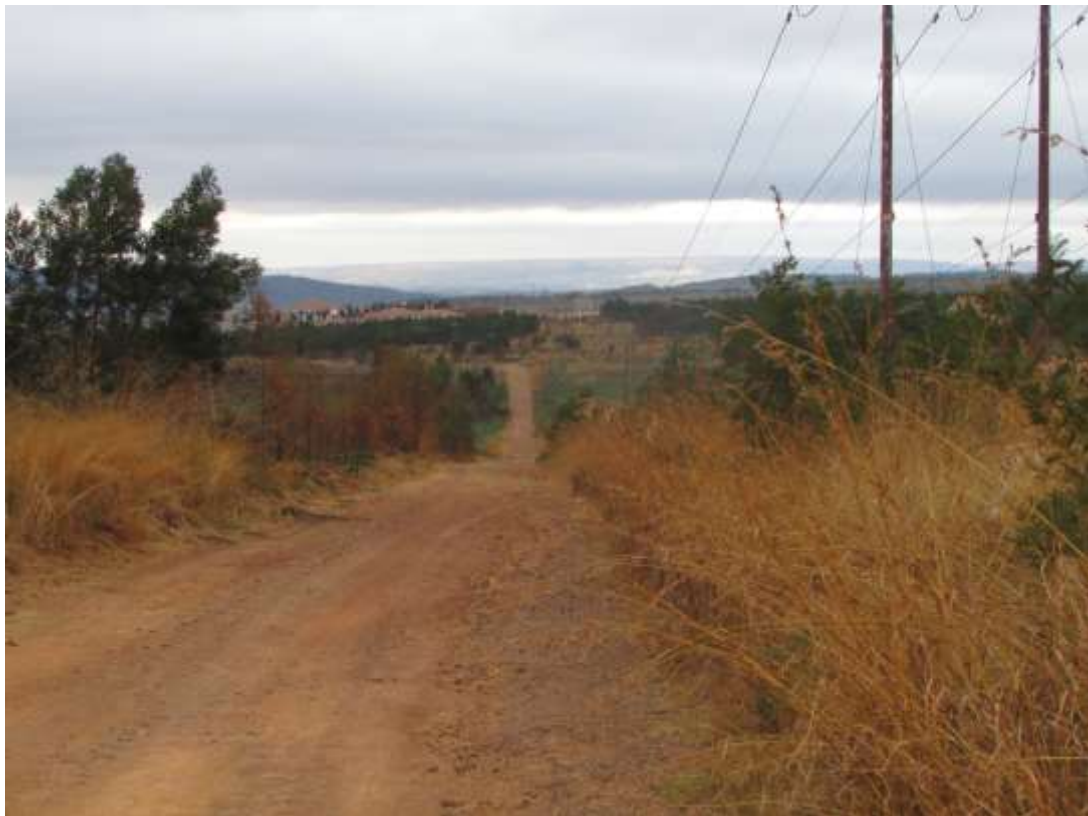
Figure 13: A general view of the area.