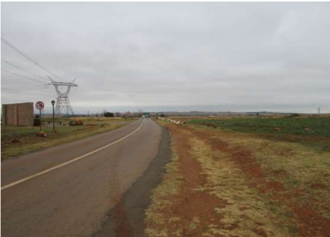
Figure 7: A section of the new K147 Road towards the Delmas Road intersection.