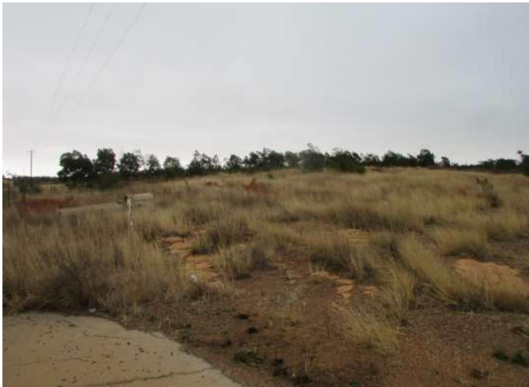
Figure 11: A few rocky ridges/outcrops are located here.