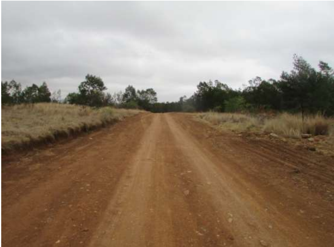
Figure 4: Part of the proposed K147 Road will follow an existing route inside the Hills property.