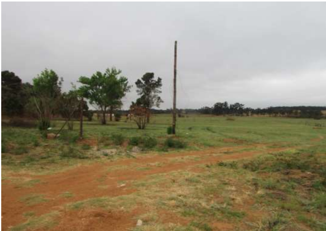
Figure 9: Sections of the proposed road traverses private property in the area.