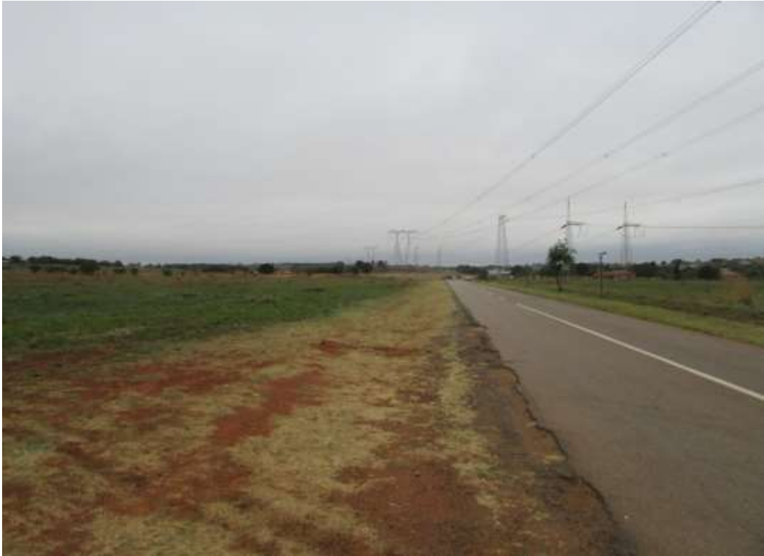
Figure 8: Taken from the Delmas Road intersection towards the northeast.