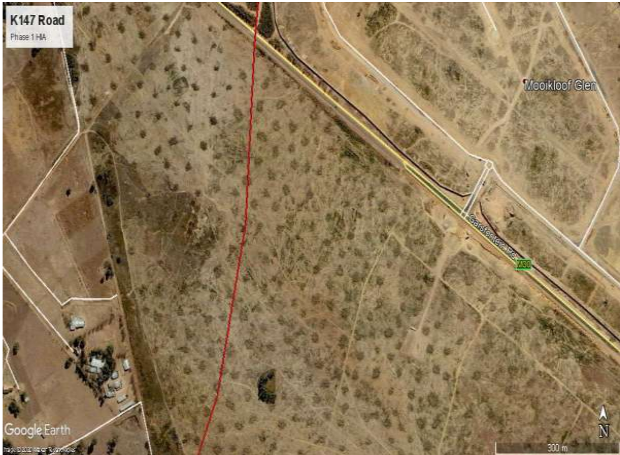
Figure 14: A section of the proposed road from the Garsfontein Road intersection towards the south. This image dates to 2008. At the time the area was fairly clear of trees and seemed to have been cleared at the point. No sites or features are visible (Google Earth 2020).

It should be noted that although all efforts are made to cover a total area during any assessment and therefore to identify all possible sites or features of cultural (archaeological and/or historical) heritage origin and significance, that there is always the possibility of something being missed. This will include low stone-packed or unmarked graves. This aspect should be kept in mind when development work commences and if any sites (including graves) are identified then an expert should be called in to investigate and recommend on the best way forward.