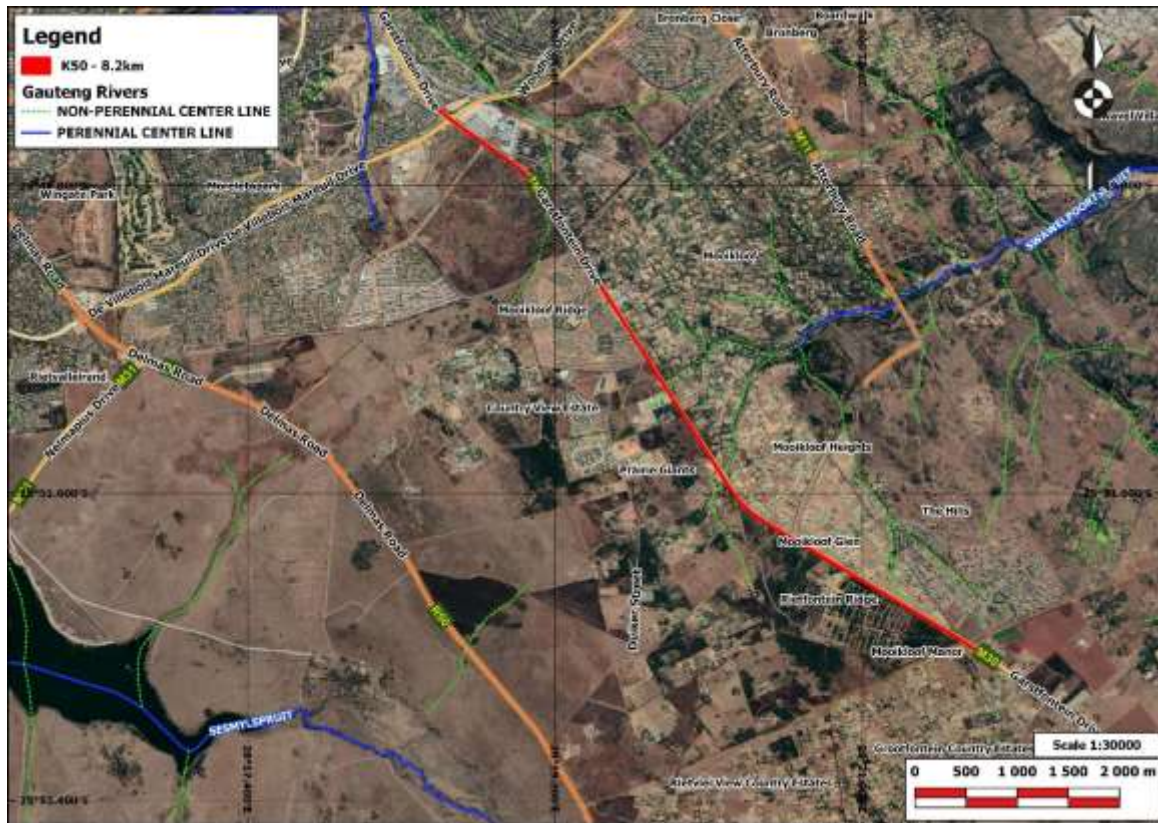
Figure 1: General location of the M30/K50 (Garsfontein) Upgrade Project (Google Earth 2020).

features or material of cultural heritage (archaeological and/or historical) origin or significance still existing. If was present here in the past it would have been extensively disturbed or destroyed as a result of recent urban and related developments.