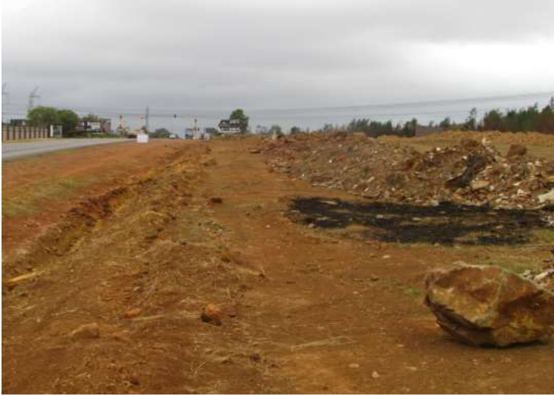
Figure 5: More evidence of current impacts on the road reserve.