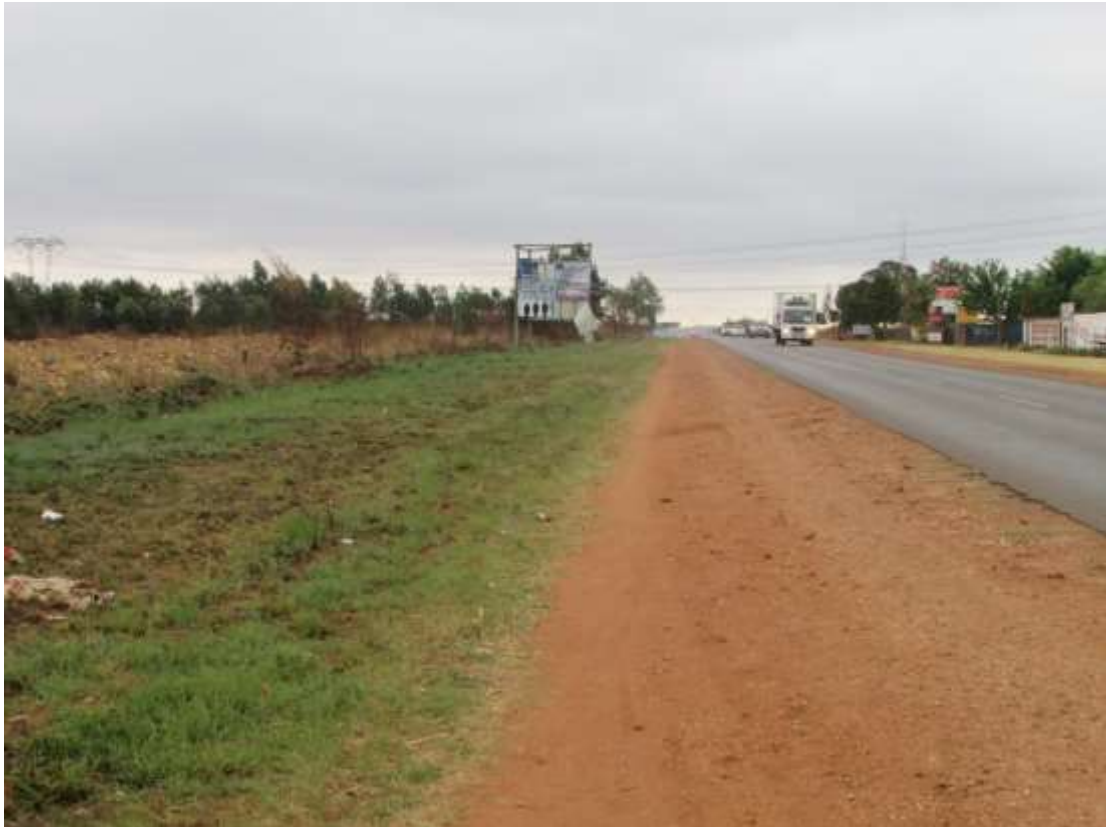
Figure 3: A view of the M30/K50 (Garsfontein) Road showing the road reserve.