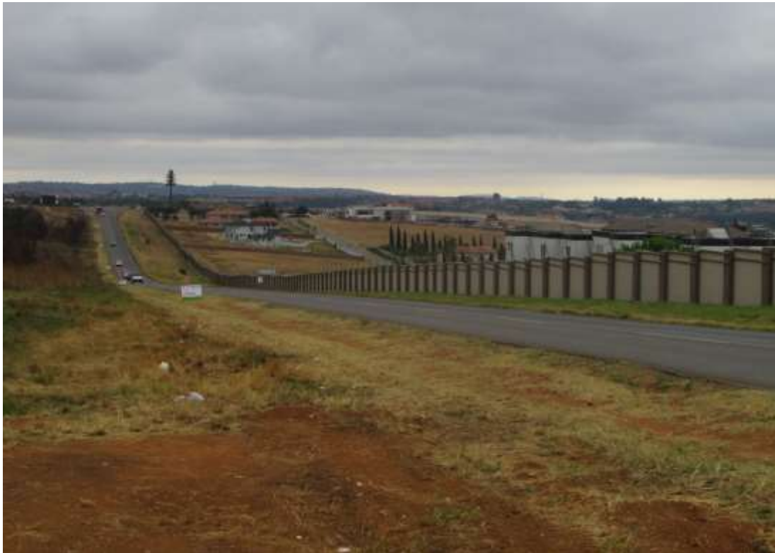
Figure 6: A general view of the road showing the developed nature of the study area.