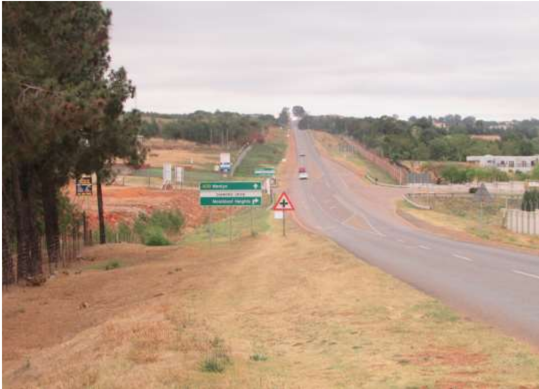
Figure 7: A section of the road close to Mooikloof Heights.