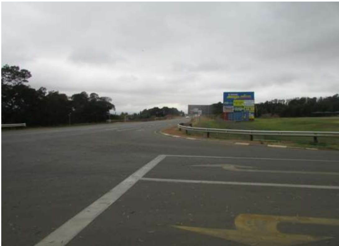
Figure 8: A view of the road at one of the intersections. This is close to Rafters Pub.