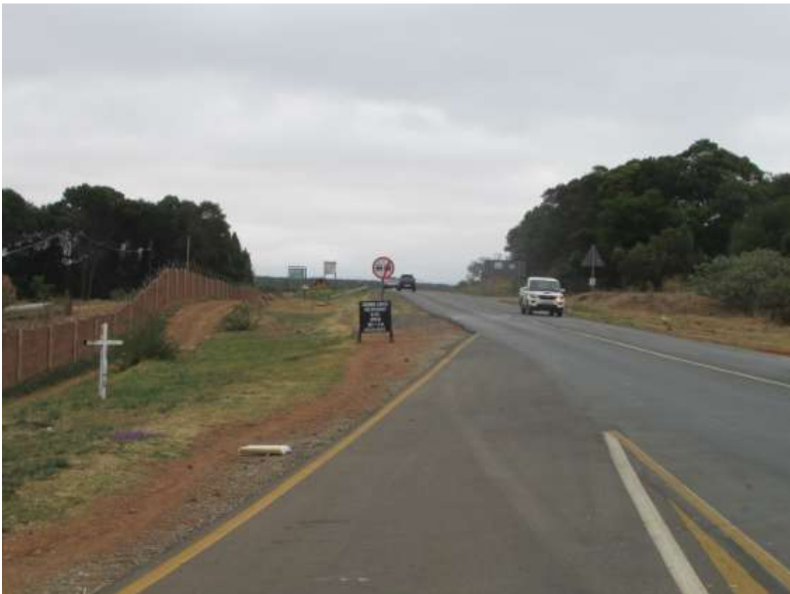
Figure 10: Another general view showing the road and reserves available for the upgrade.