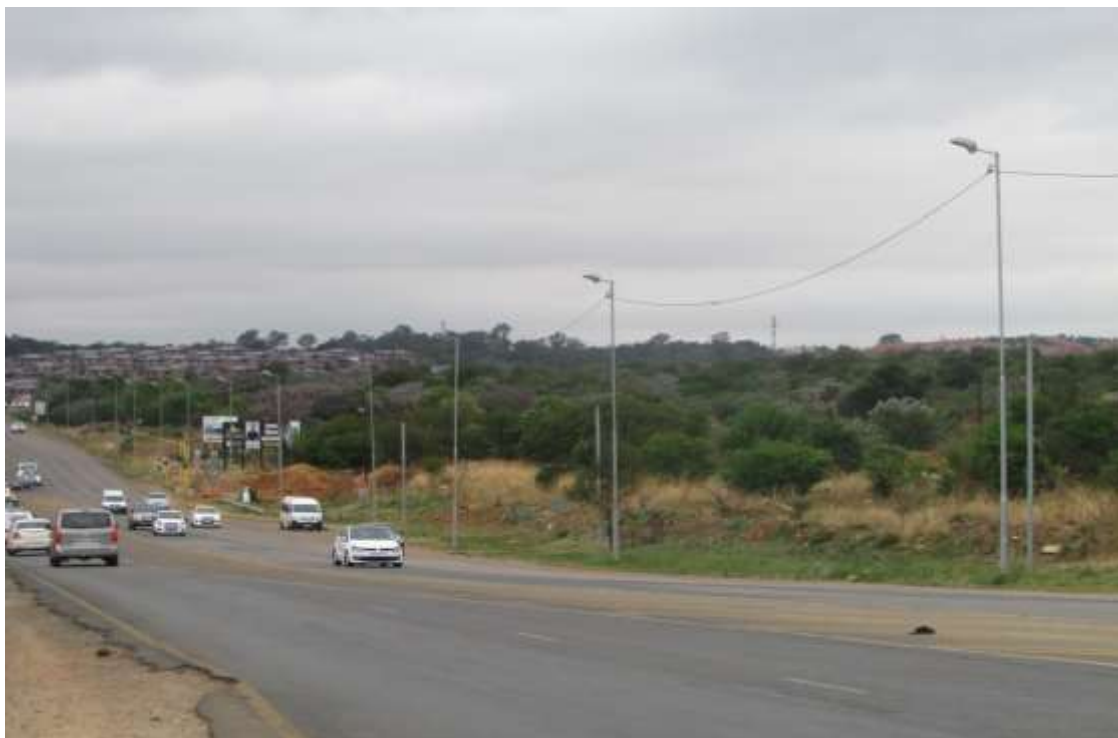
Figure 3: A view of the road from the De Villebois Mareuil Drive Intersection.

As indicated no sites, features or material of archaeological and/or historical nature or significance were identified in the study area during the assessment. The area has been completely developed and the original landscape altered as a result of urban and related developments. This includes the existing M30/K50 (Garsfontein) Road and the development will basically just entail widening the road, by two lanes per direction within the existing road reserve. Intersections along the abovementioned route will also be upgraded.