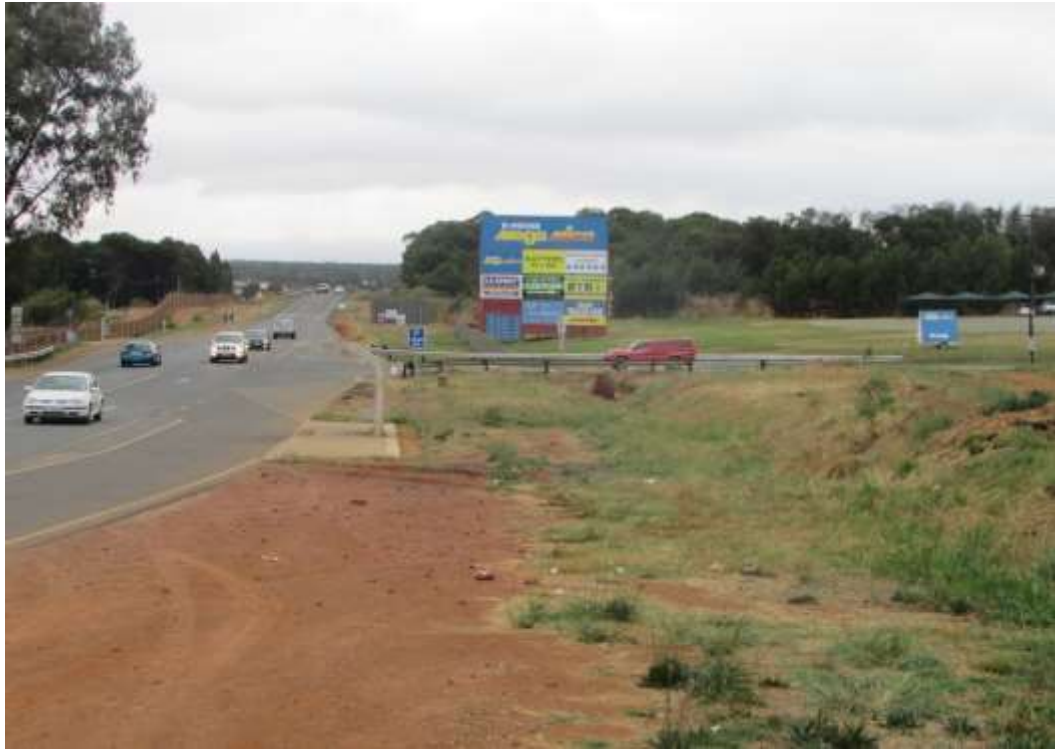
Figure 9: Another view of the M30/K50 (Garsfontein) Road. The volumes of traffic on the road is dense hence the necessity for the proposed upgrade.