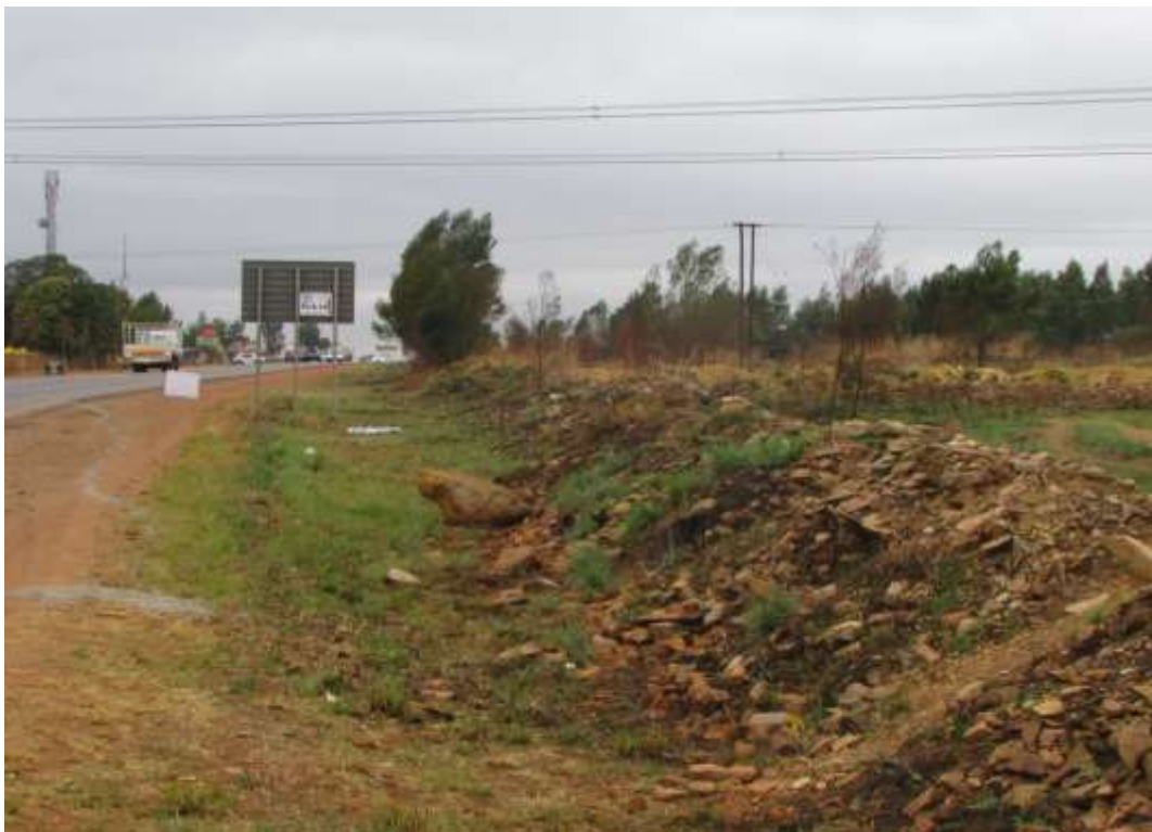
Figure 4: Sections of the road reserve has also been impacted already by trenching & earthworks.