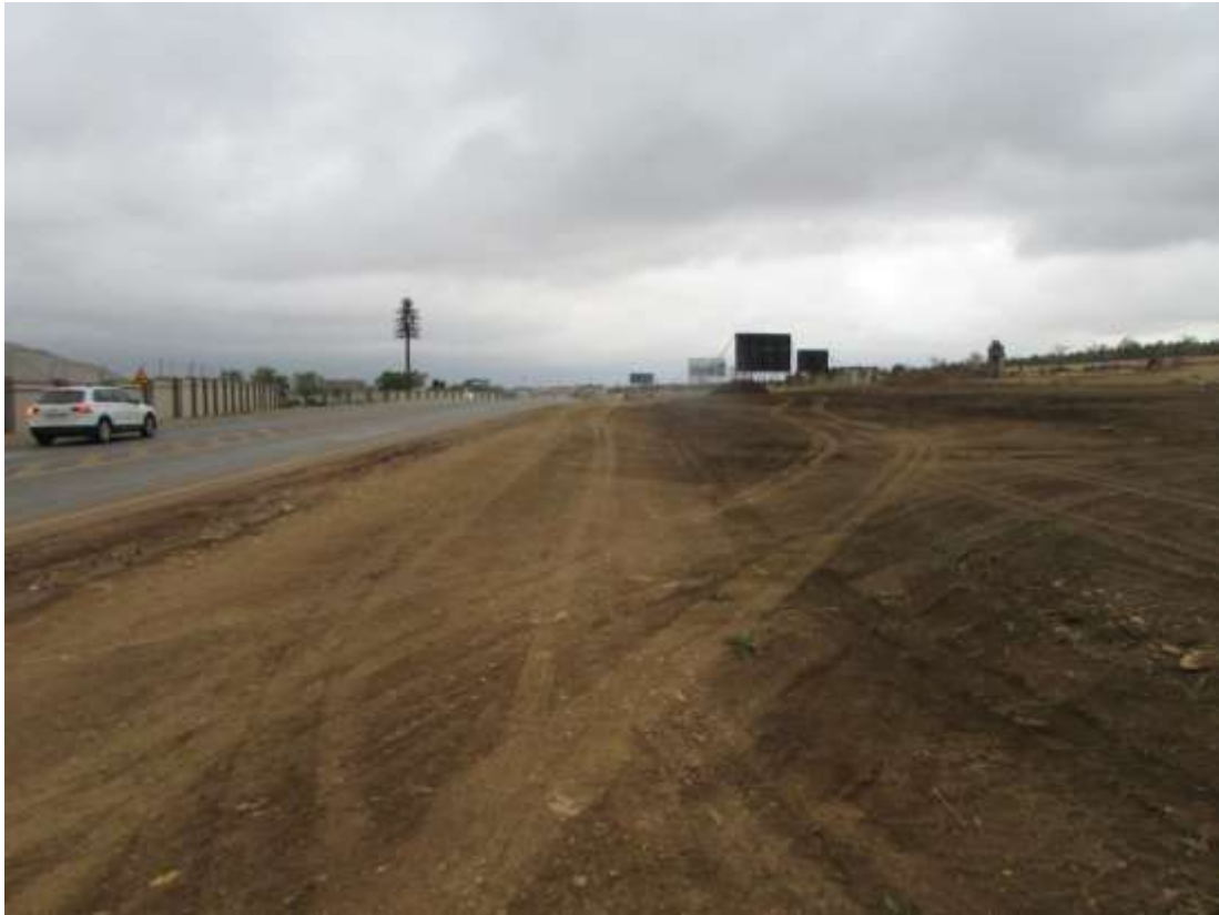
Figure 11: The road reserves on many sections of the road has been recently impacted by trenching, earthworks and other actions related to current developments.

It should be noted that although all efforts are made to cover a total area during any assessment and therefore to identify all possible sites or features of cultural (archaeological and/or historical) heritage origin and significance, that there is always the possibility of something being missed. This will include low stone-packed or unmarked graves. This aspect should be kept in mind when development work commences and if any sites (including graves) are identified then an expert should be called in to investigate and recommend on the best way forward.