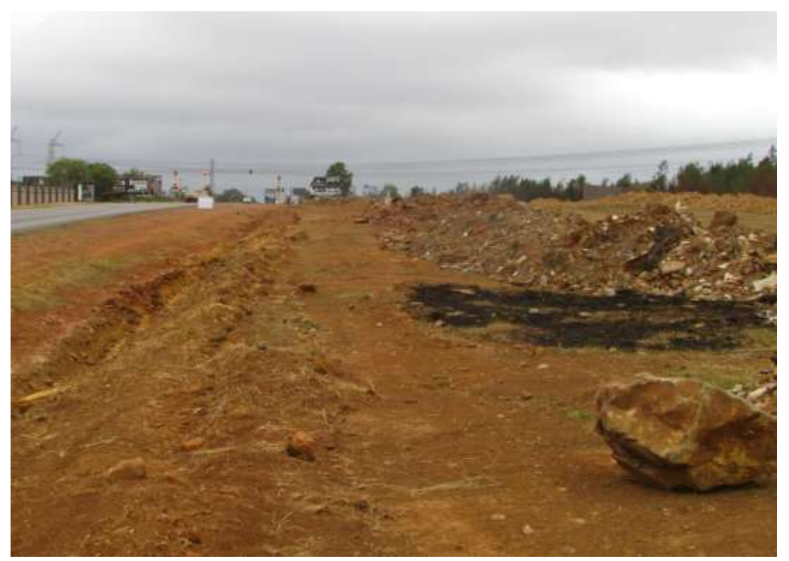
Figure 5: More evidence of current impacts on the road reserve.