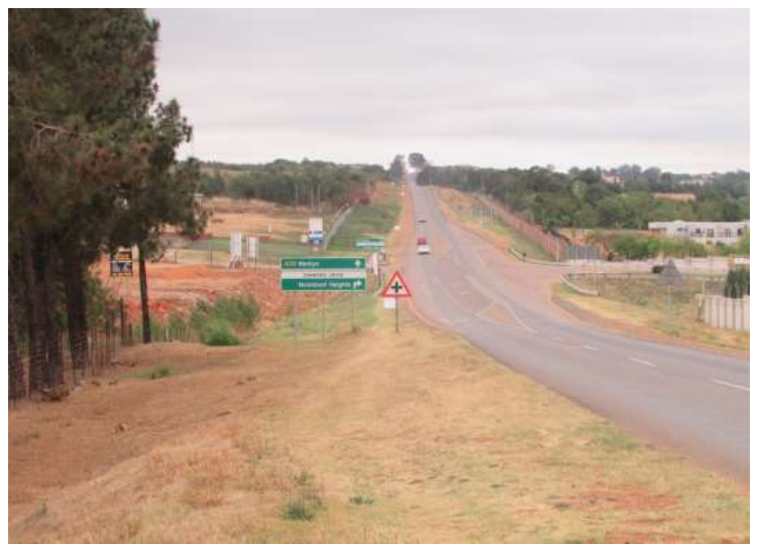
Figure 7: A section of the road close to Mooikloof Heights.