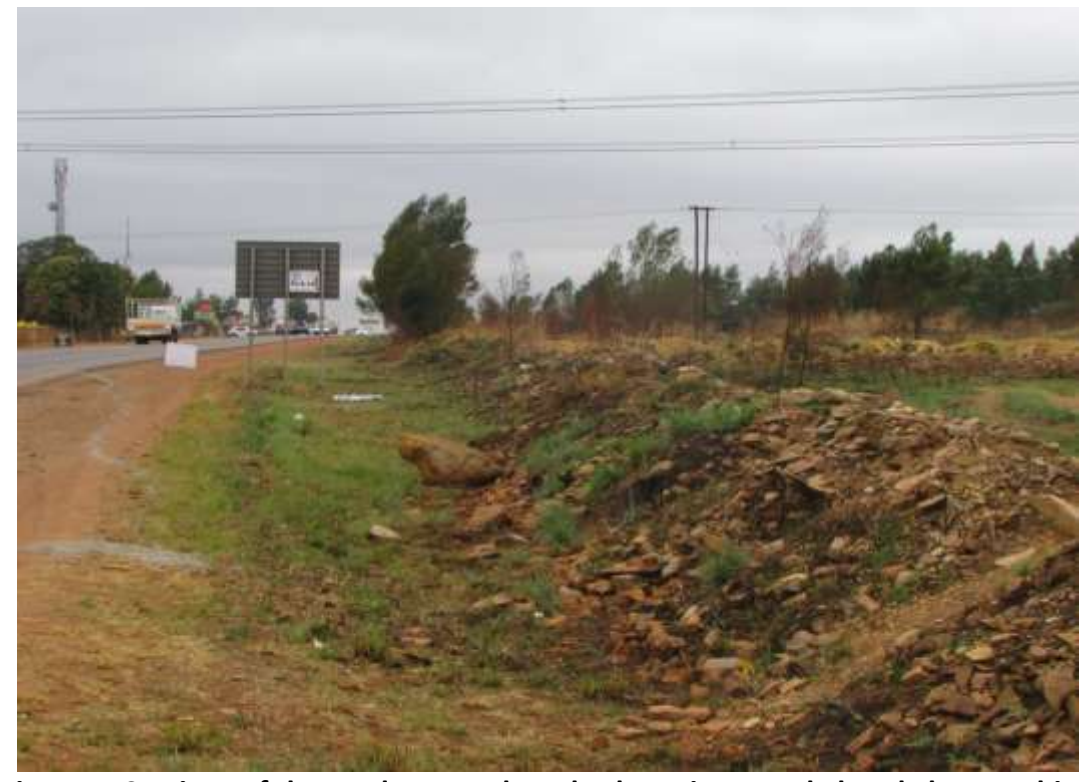
Figure 4: Sections of the road reserve has also been impacted already by trenching & earthworks.