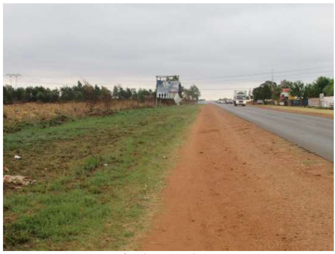
Figure 3: A view of the M30/K50 (Garsfontein) Road showing the road reserve.