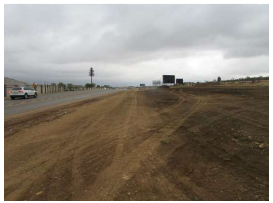
Figure 11: The road reserves on many sections of the road has been recently impacted by trenching, earthworks and other actions related to current developments.

It should be noted that although all efforts are made to cover a total area during any assessment and therefore to identify all possible sites or features of cultural (archaeological and/or historical) heritage origin and significance, that there is always the possibility of something being missed. This will include low stone-packed or unmarked graves. This aspect should be kept in mind when development work commences and if any sites (including graves) are identified then an expert should be called in to investigate and recommend on the best way forward.