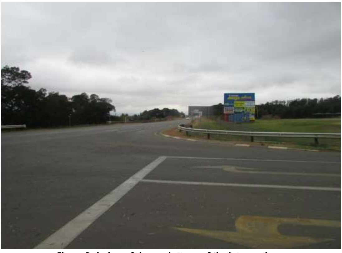
Figure 8: A view of the road at one of the intersections. This is close to Rafters Pub.