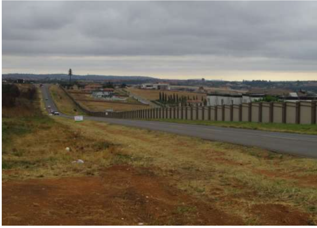
Figure 6: A general view of the road showing the developed nature of the study area.