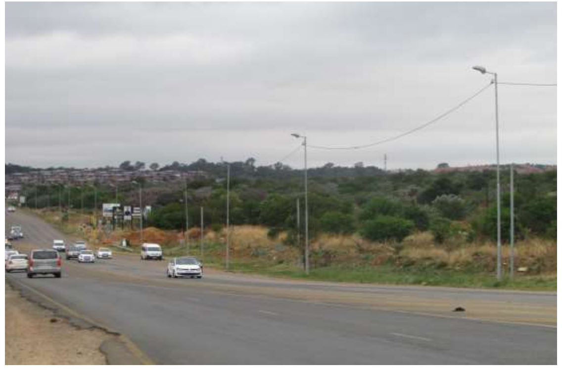
Figure 3: A view of the road from the De Villebois Mareuil Drive Intersection.

As indicated no sites, features or material of archaeological and/or historical nature or significance were identified in the study area during the assessment. The area has been completely developed and the original landscape altered as a result of urban and related developments. This includes the existing M30/K50 (Garsfontein) Road and the development will basically just entail widening the road, by two lanes per direction within the existing road reserve. Intersections along the abovementioned route will also be upgraded.