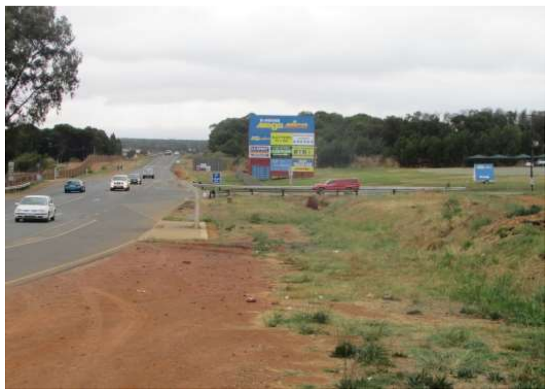
Figure 9: Another view of the M30/K50 (Garsfontein) Road. The volumes of traffic on the road is dense hence the necessity for the proposed upgrade.