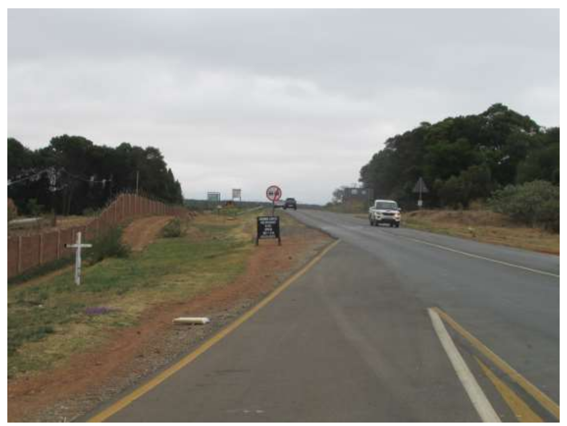
Figure 10: Another general view showing the road and reserves available for the upgrade.