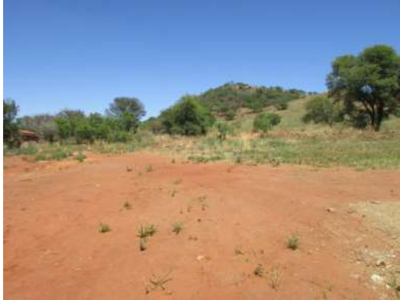
Figure 6: A view of another section of the feeder line route. The area has been extensively disturbed as well.