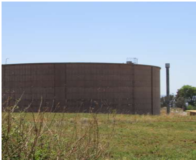
Figure 11: The current Water Reservoir in the area. This also impacted and disturbed the area in the past from a Cultural Heritage perspective.