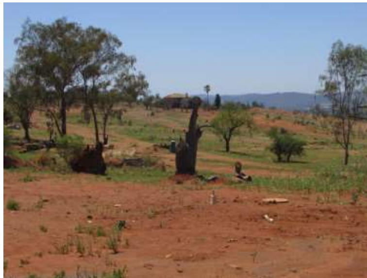
Figure 7: The feeder line route passes by some historical structures (visible in background) that form part of the West Fort Historical Village but has minimal if any impact.