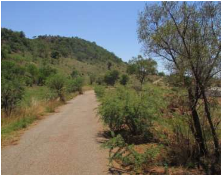
Figure 9: Sections of the feeder line route follows existing routes.