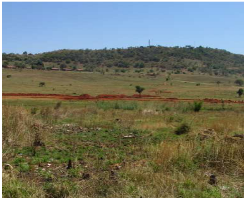
Figure 3: View from the start of the Bulk supply line. The flat open and disturbed nature of the area is visible.