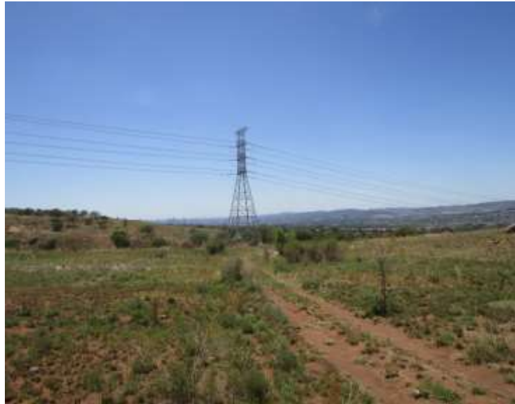
Figure 12: Other impacts on the area include Power lines.