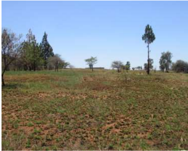
Figure 10: The feeder line route also crosses section of old fields.