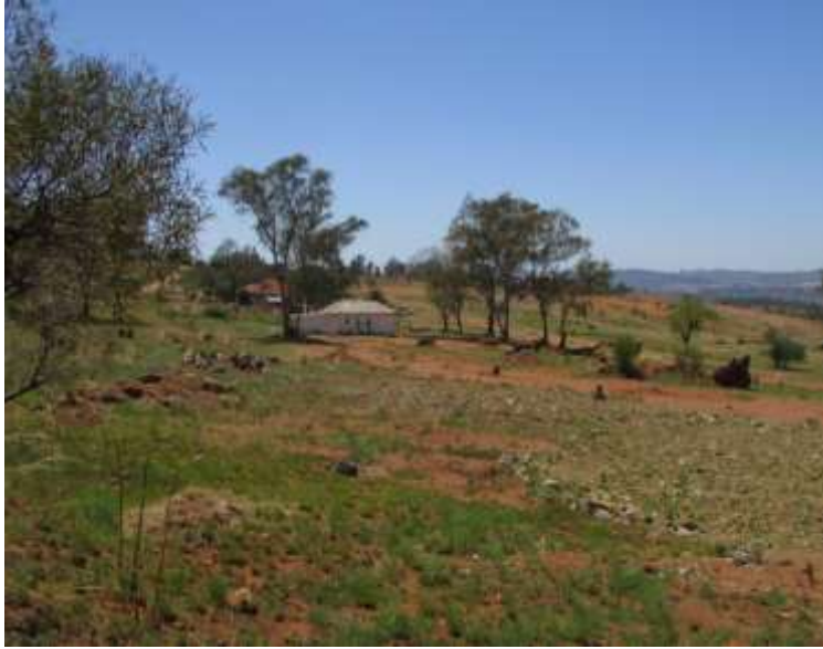
Figure 8: Another view of some historical structures on the feeder line route.