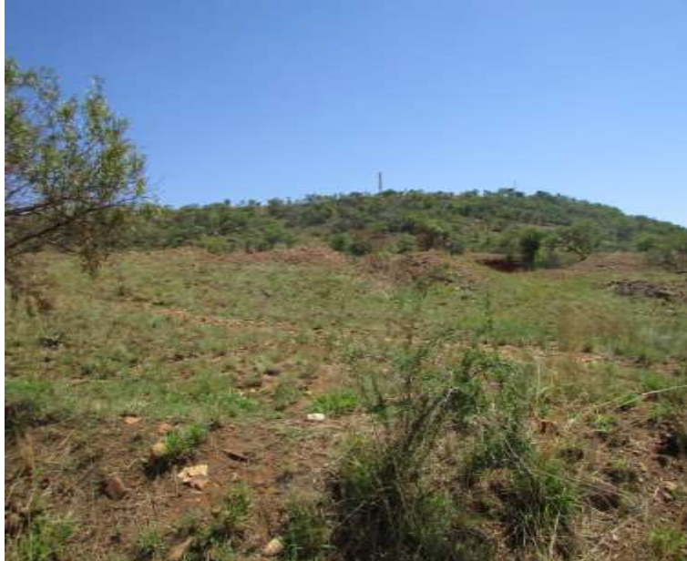
Figure 4: A view of the approximate location of the proposed new Reservoir. The area has been disturbed.