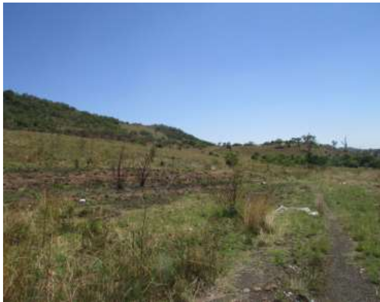
Figure 5: A view of a section of the feeder line route.