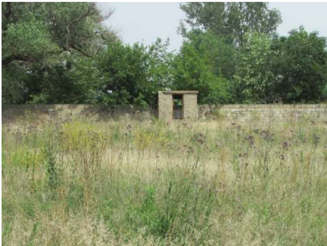
Figure 17: Another old mining structure in the general area.

The existing old Grootvlei Sewer Pump Station structure that will be demolished does not seem to be older than 60 years of age or have any historical significance. No mitigation measures from a heritage point of view are required. Furthermore, the need to develop the new pump station is based in the fact that the old pump station and machinery is dysfunctional and not working. Sewerage and acid water from here is also polluting the neighboring wetland area. The proposed new pump station and line will be moved away from the wetland area and will ensure that the wetland will not be polluted.