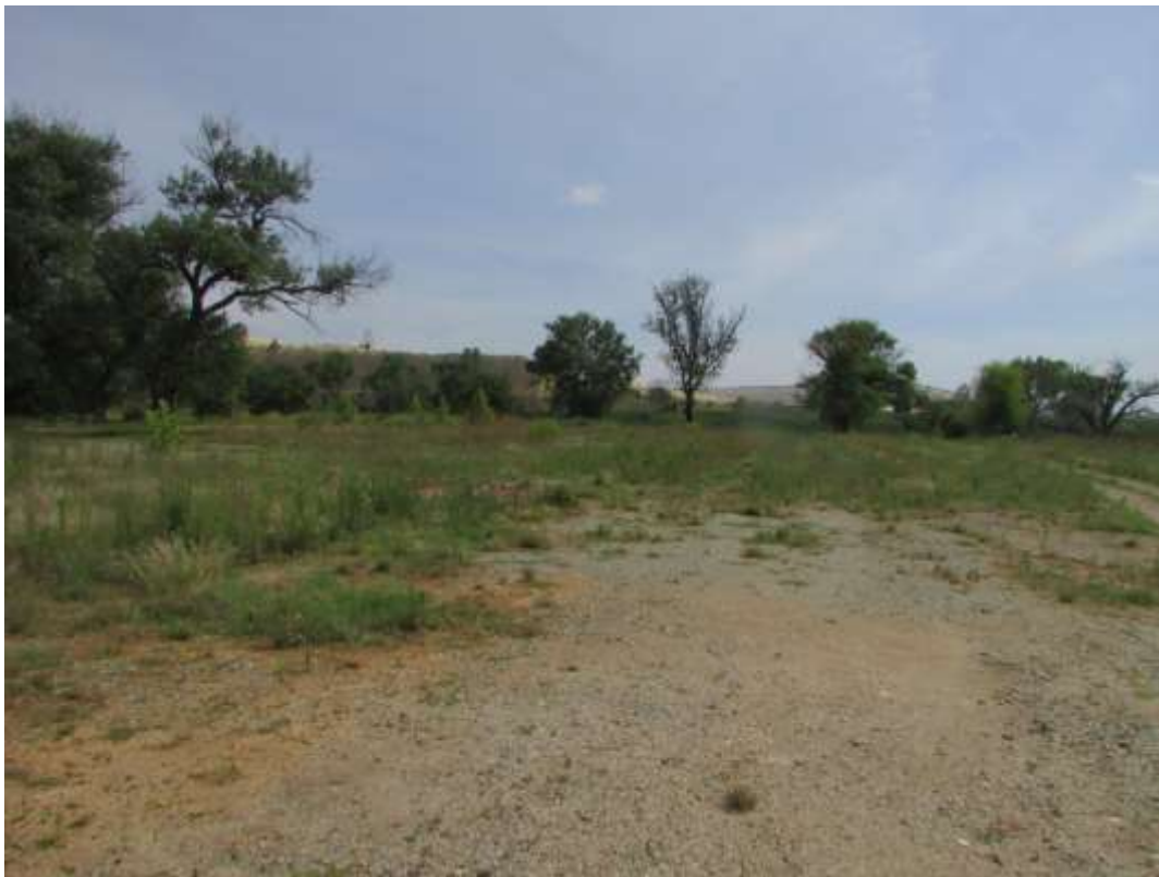
Figure 5: Another general view of the new pump location.