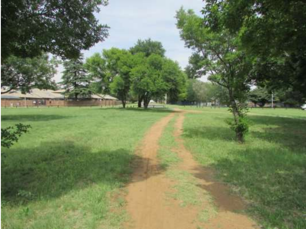
Figure 12: The line will cross Marks Park (underground) and continue further down Largo Road towards Ermelo Road (the R29).