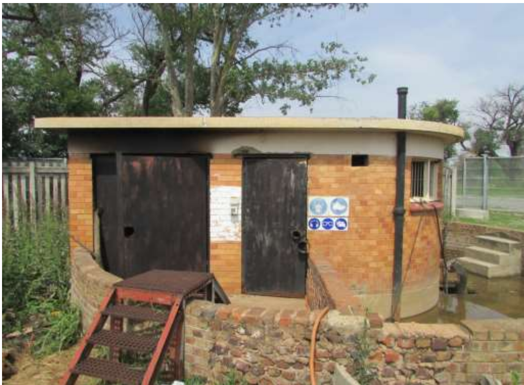
Figure 19: Another view.