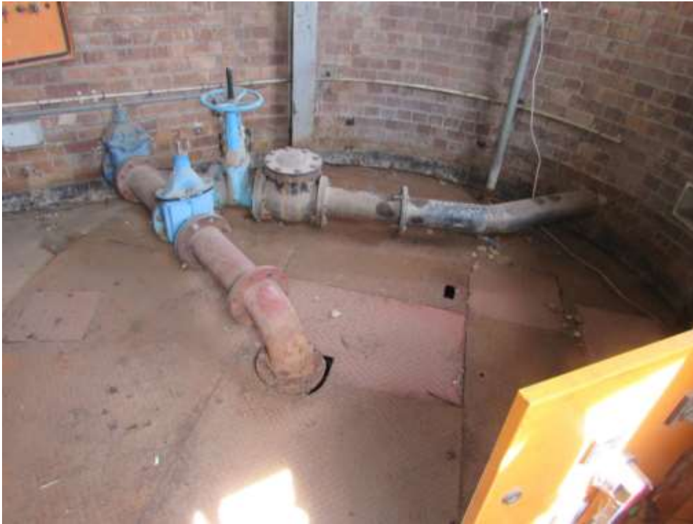
Figure 20: Inside of the old pump station. The machinery has been vandalized & is not working.

It should be noted that although all efforts are made to cover a total area during any assessment and therefore to identify all possible sites or features of cultural (archaeological and/or historical) heritage origin and significance, that there is always the possibility of something being missed. This will include low stone-packed or unmarked graves. This aspect should be kept in mind when development work commences and if any sites (including graves) are identified then an expert should be called in to investigate and recommend on the best way forward.