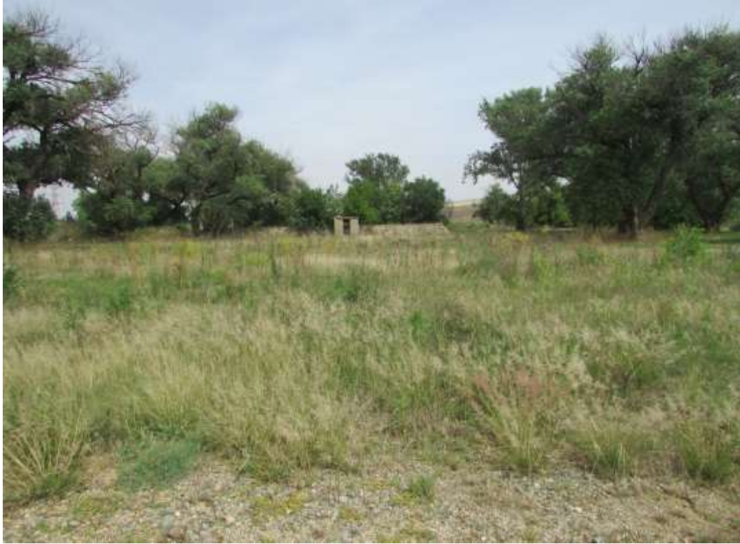
Figure 6: Some old mining structure remains in the general area. The proposed new pump station will not impact on these structural remains.