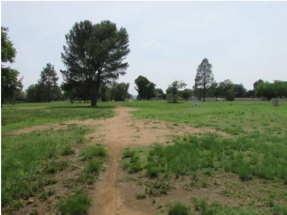
Figure 13: Another view of the route of the line across Marks Park.