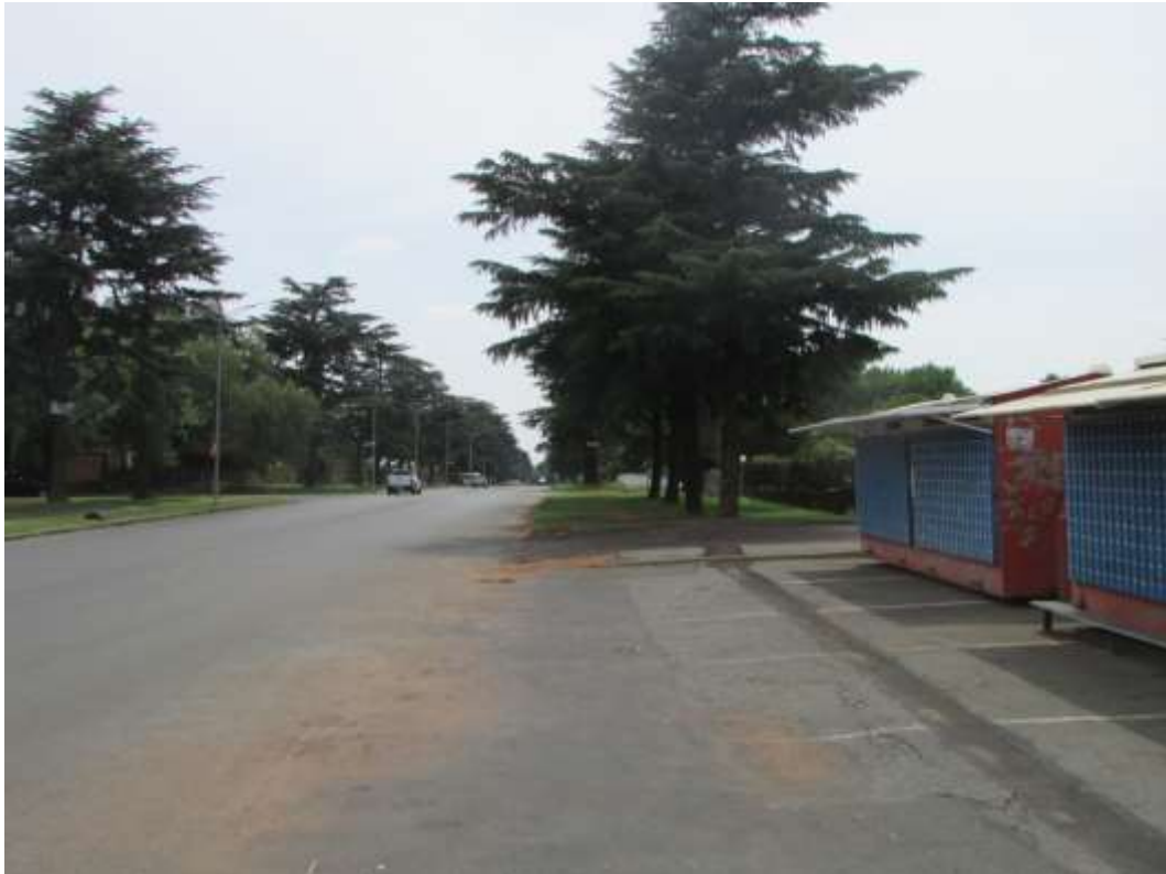
Figure 14: A view down Largo Road towards Marks Park. The new line will follow the existing road reserve.