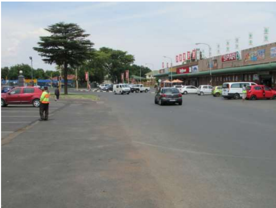
Figure 15: A view of the last section of the proposed new sewer line down Largo Road up to the Ermelo Road (R29) junction.