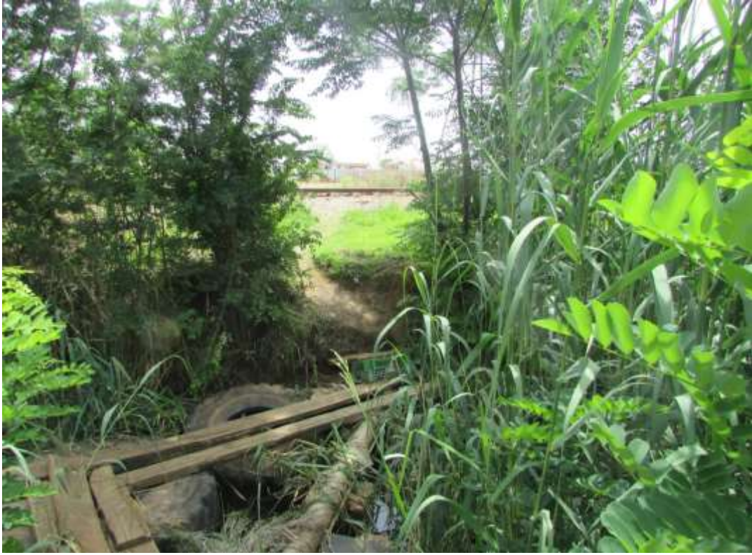
Figure 10: View of old line across a small stream created by sewer flow. The new line Will tie in here and follow Largo Road down to Ermelo Road.