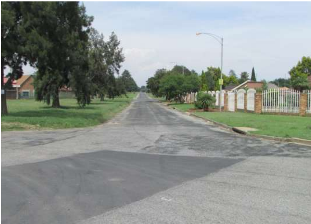
Figure 11: A view of the direction of the proposed new line from Smythe Road down Largo Road in Strubenvale.