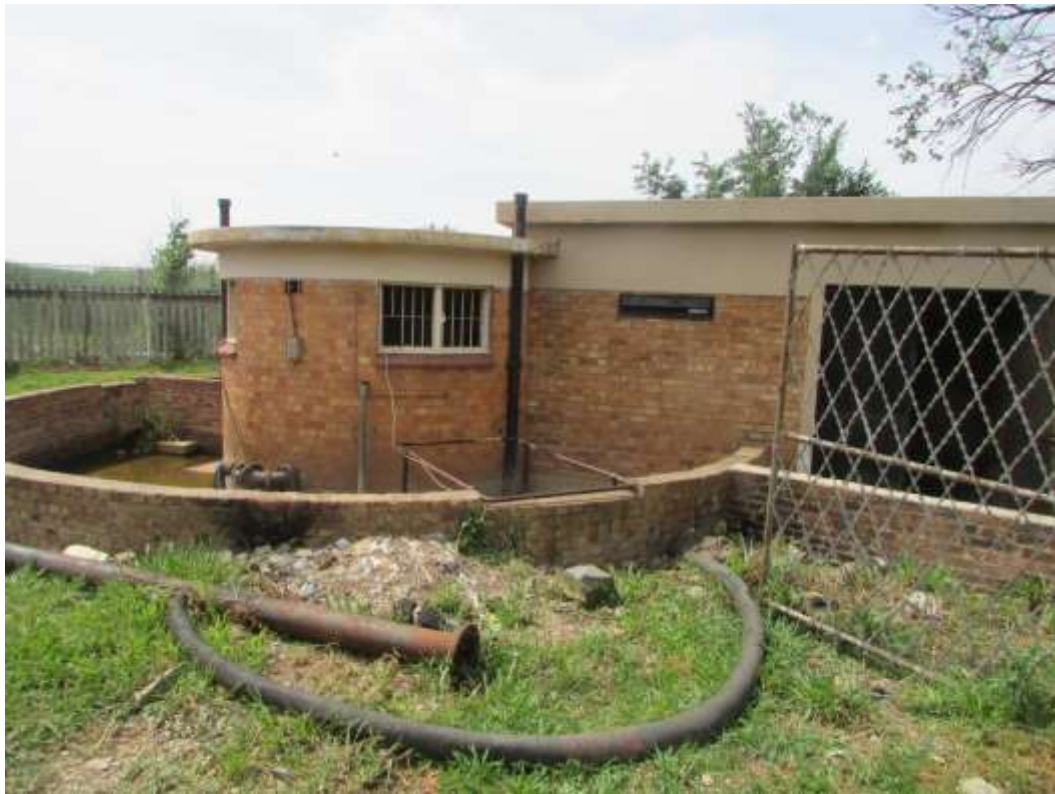
Figure 7: A view of the existing Grootvlei pump station.