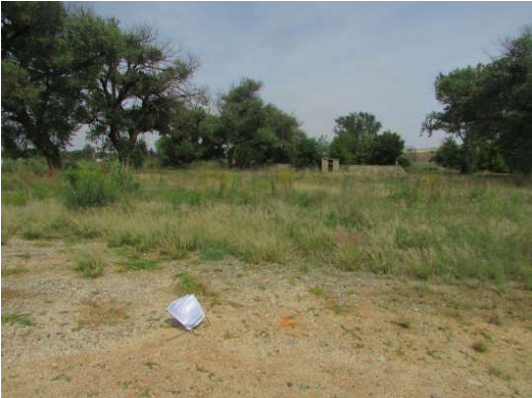
Figure 4: The location of the proposed new Grootvlei Sewer Pump Station.