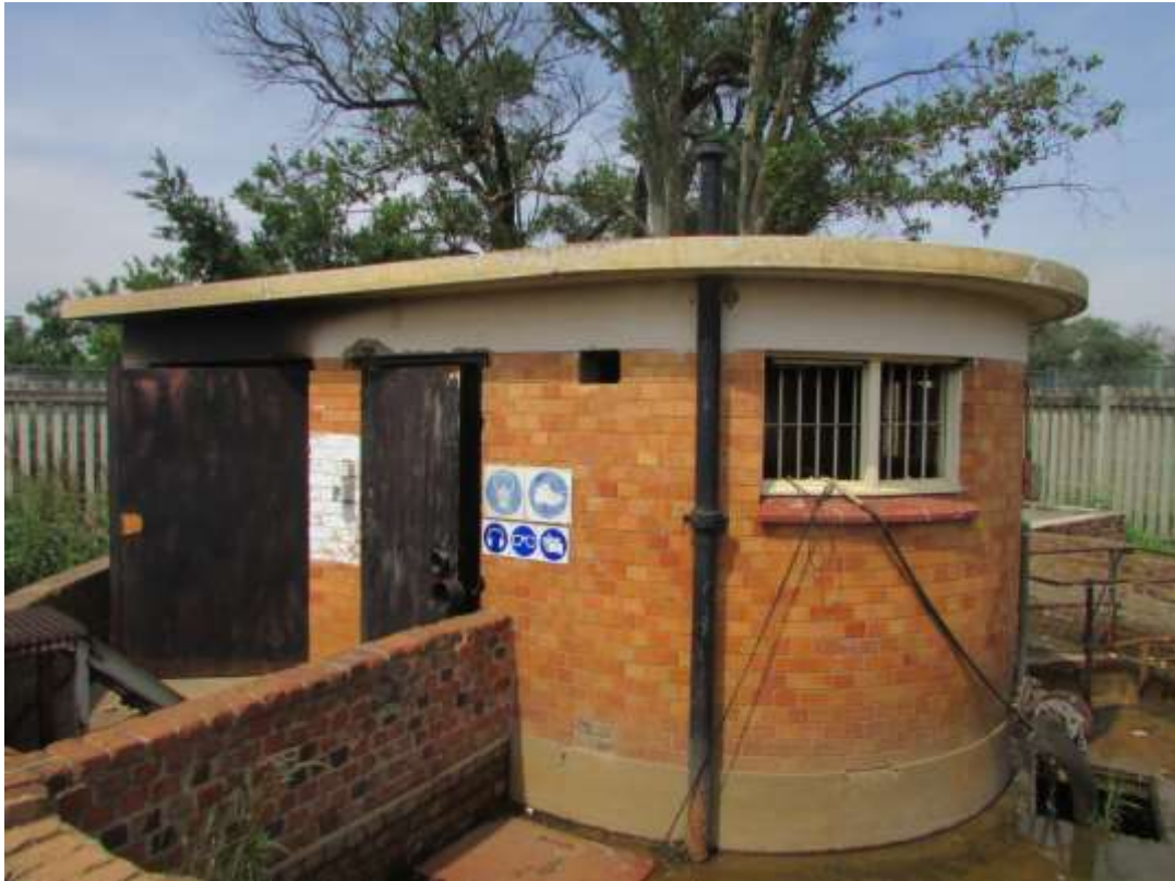
Figure 18: A view of the existing Grootvlei Sewer Pump Station.