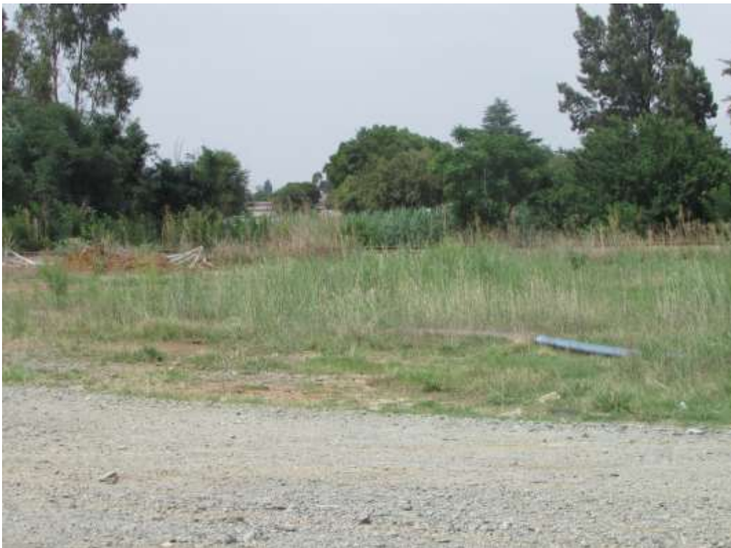
Figure 9: A view of the old railway line over which the new pipe line will cross.