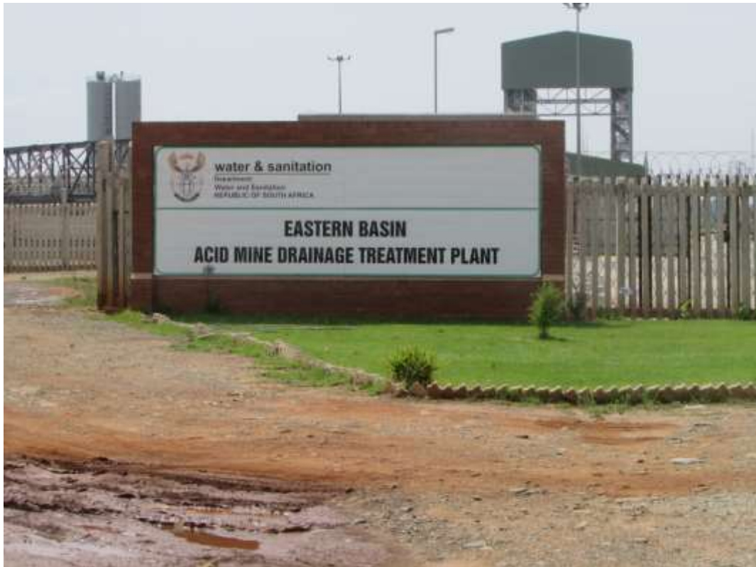
Figure 8: A view of the Eastern Basin Acid Mine Drainage Treatment Plant.