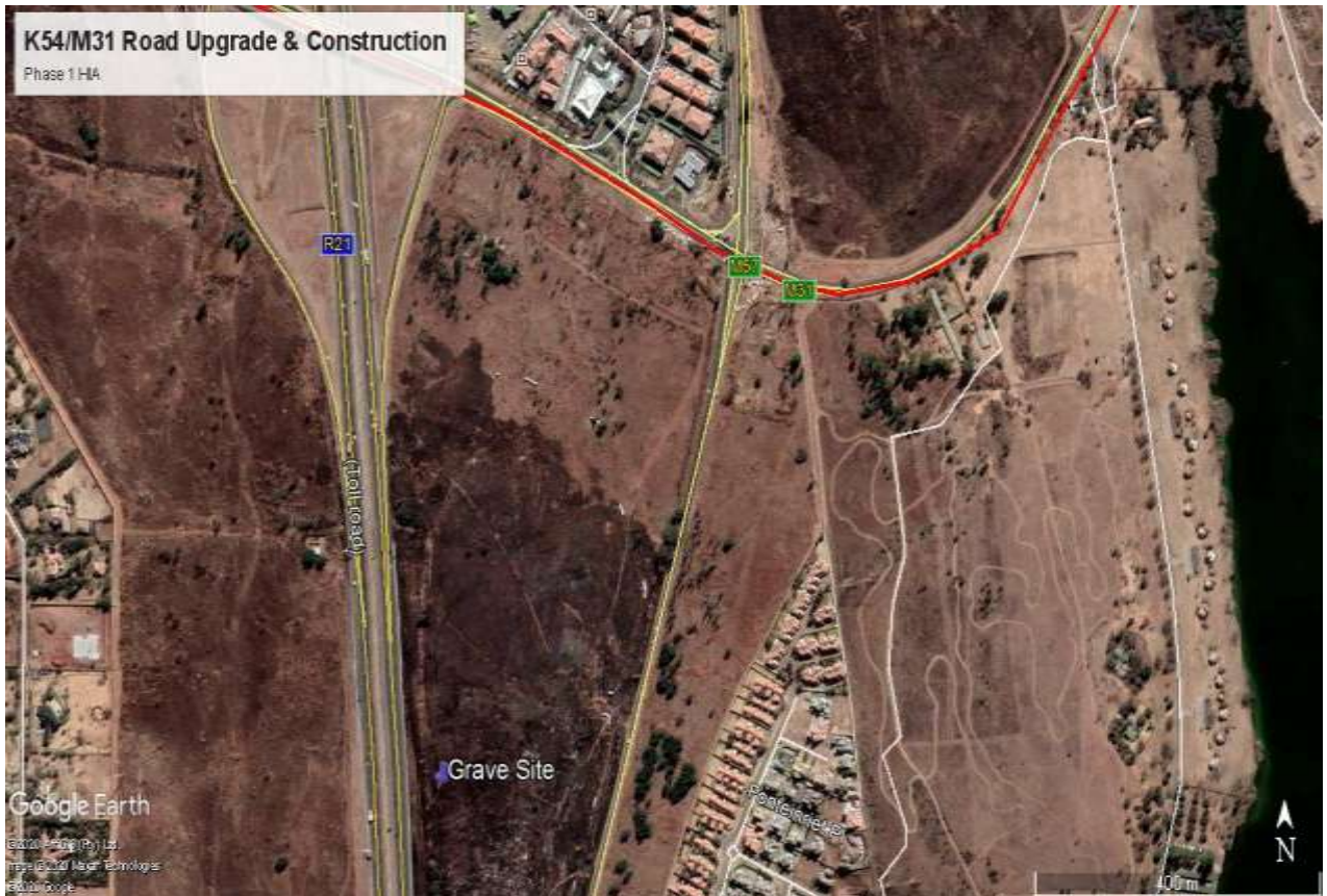
Figure 16: A closer view of the M31 section close to the R21. The location of the known Grave Site is indicated.

It should be noted that although all efforts are made to cover a total area during any assessment and therefore to identify all possible sites or features of cultural (archaeological and/or historical) heritage origin and significance, that there is always the possibility of something being missed. This will include low stone-packed or unmarked graves. This aspect should be kept in mind when development work commences and if any sites (including graves) are identified then an expert should be called in to investigate and recommend on the best way forward.