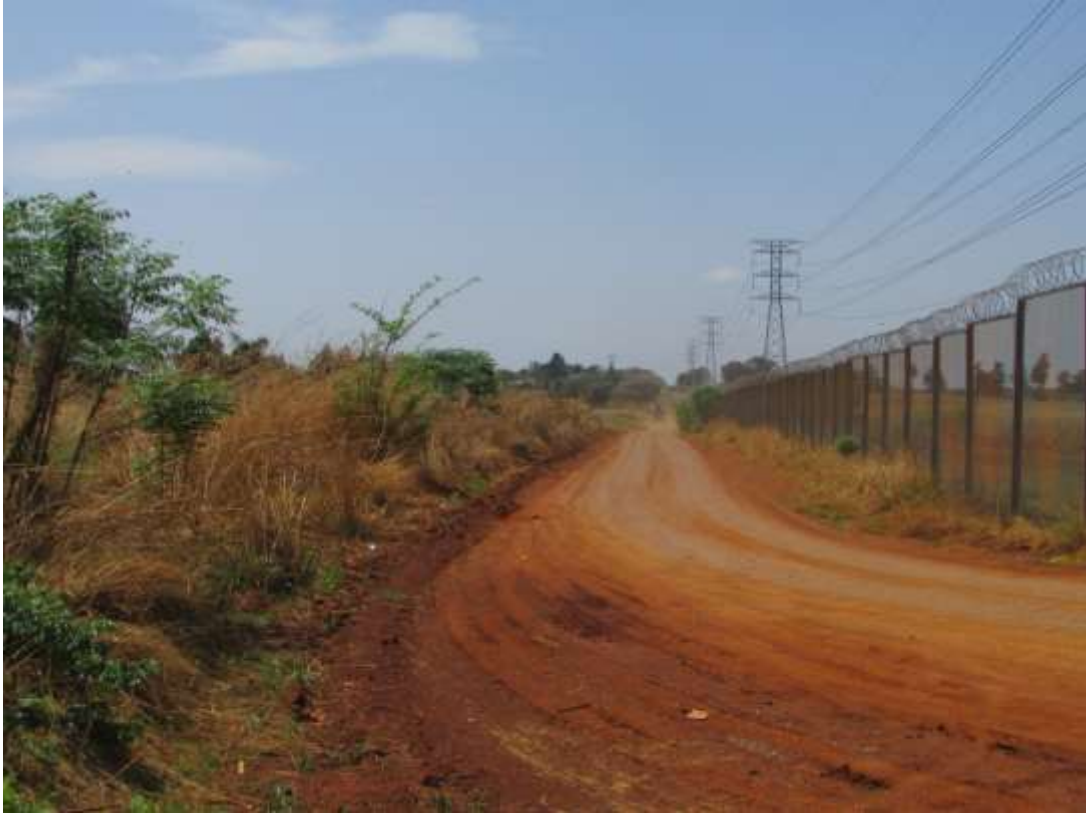
Figure 10: A view of the K54 Road close to the R50 looking east.