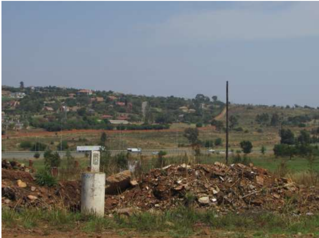
Figure 15: A view close to the Nellmapius Drive junction towards the R21.