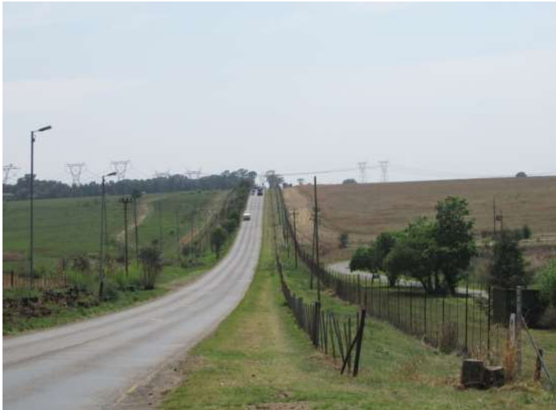
Figure 14: A view of a section of the existing M31 road that will be upgraded.