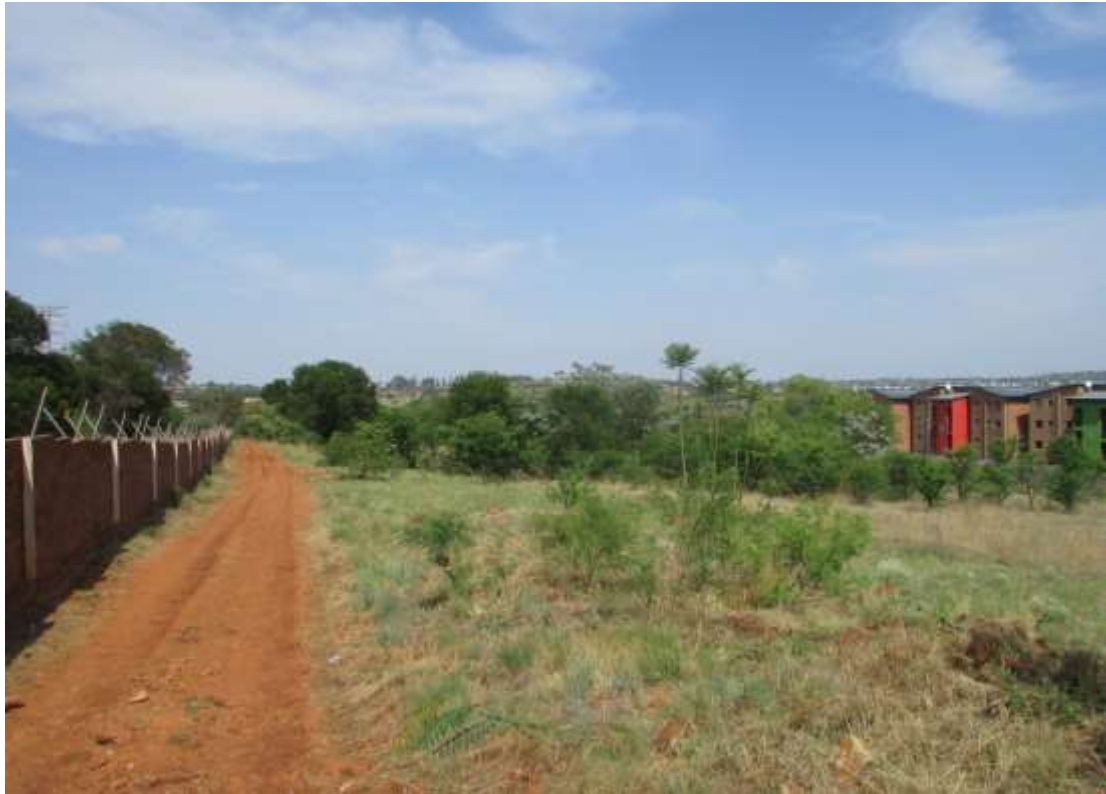
Figure 6: A view of the K54 Road section close to the Garsfontein Road.