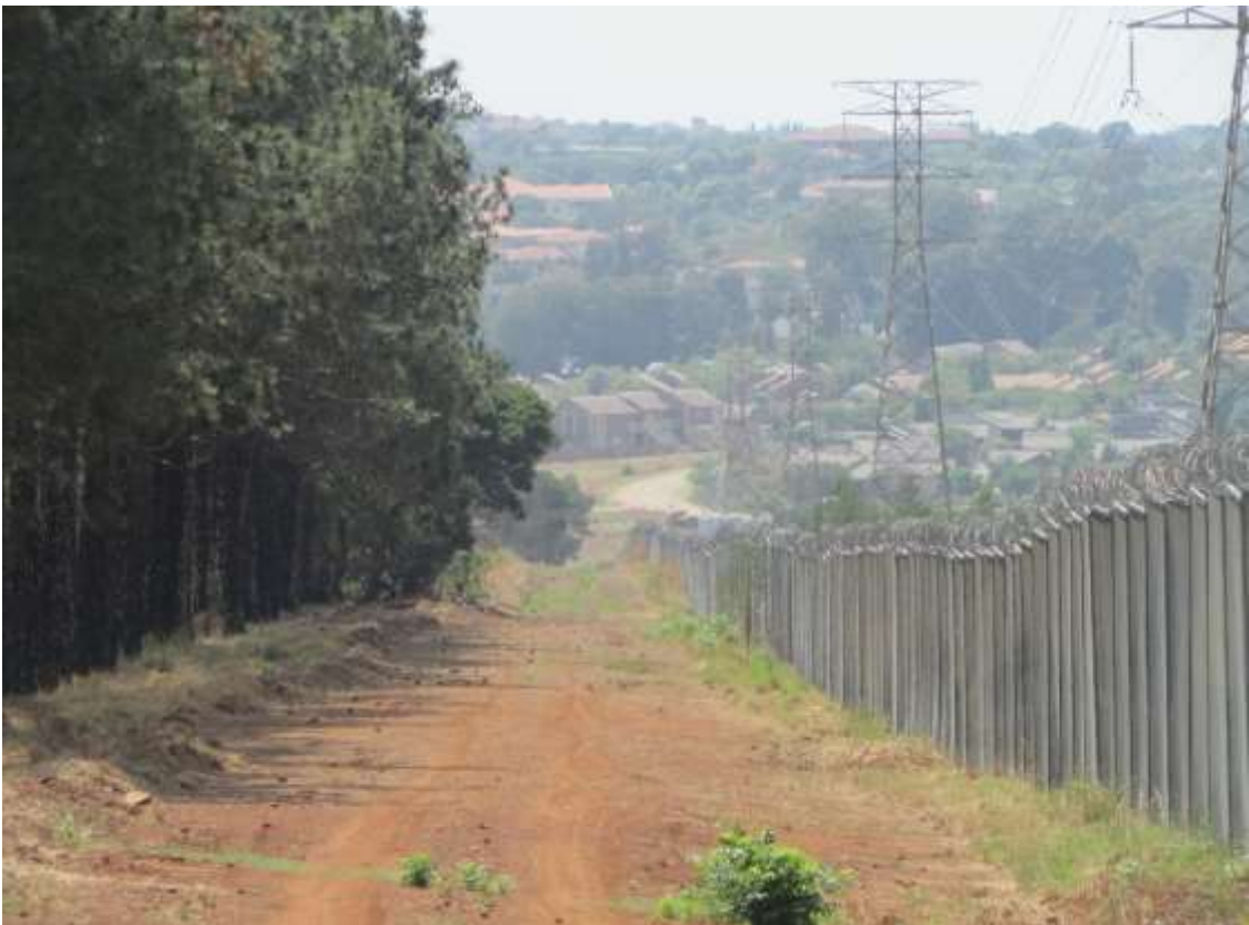
Figure 9: Another view of the K54 Road route between the R50 Delmas Road & Garsfontein.