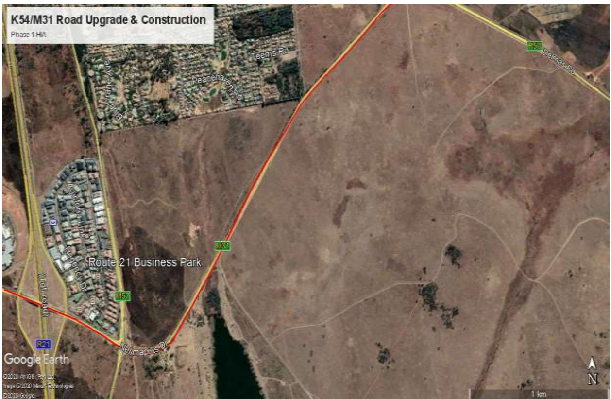
Figure 13: Closer view of the M31 to R21 Road Upgrade section (Google Earth 2020). The Rietvlei Nature Reserve is visible here as well.