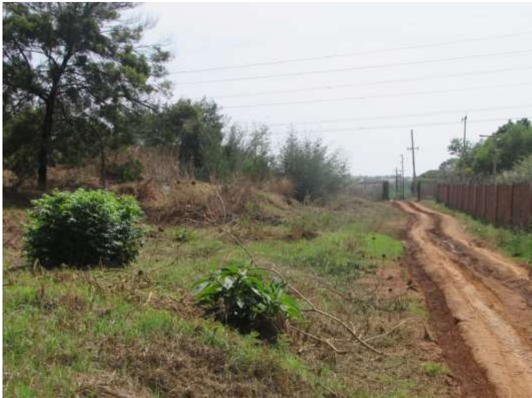
Figure 5: Another view down the road towards Garsfontein.