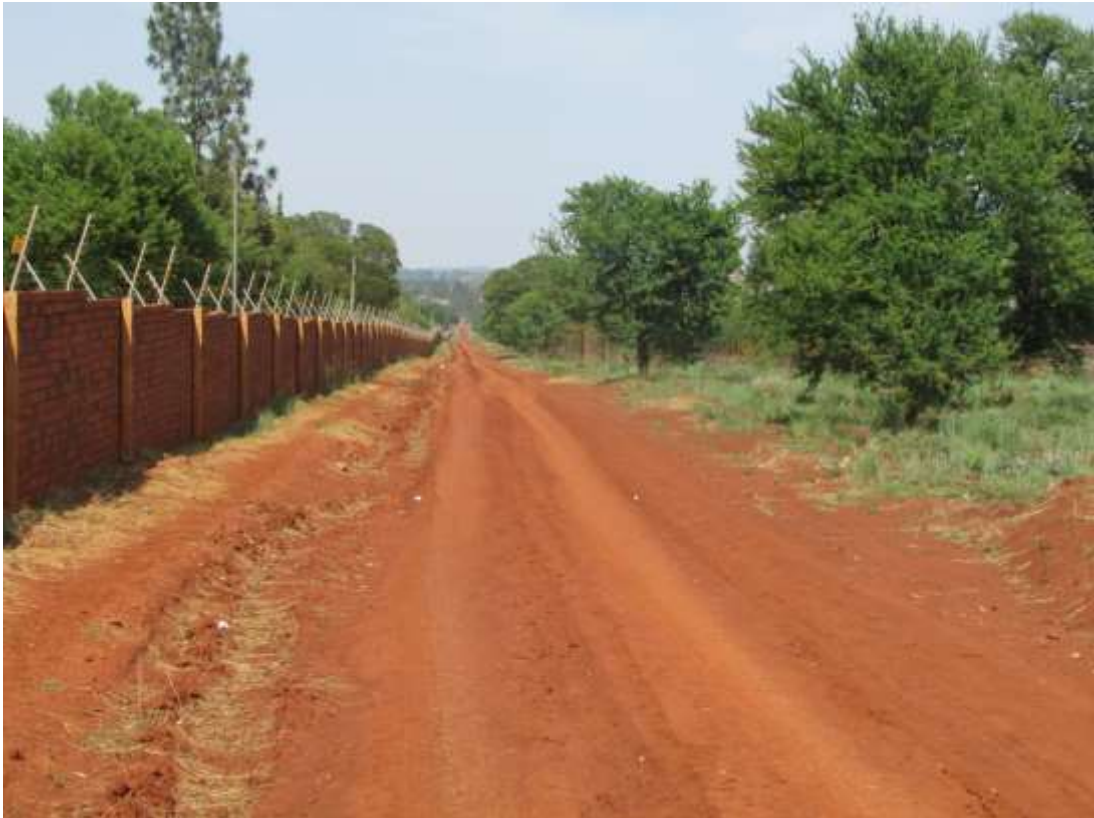
Figure 4: A view down the road from the Atterbury junction down to the Garsfontein Road junction.