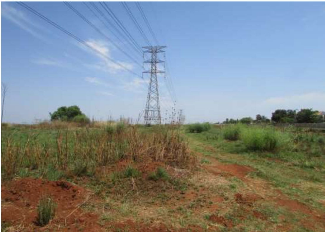
Figure 11: A view of the K54 Road route towards the Delmas Road.