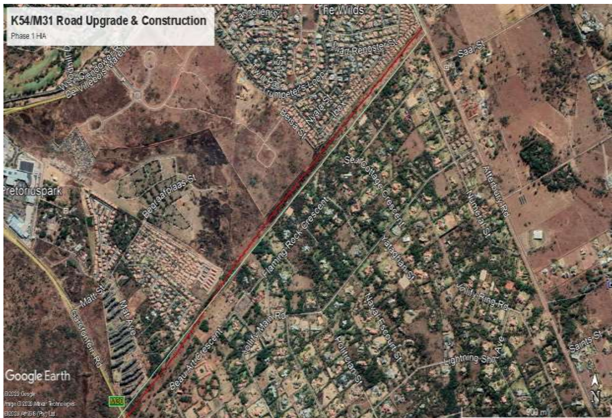
Figure 3: Closer view of the Atterbury to Garsfontein Road section of the K54 Road (Google Earth 2020).

As indicated earlier the proposed K54/M31 Road Upgrade and Construction Project area is located in areas that have already been developed and nearly completely altered from its original natural landscape. It traverses and skirts urban settlement areas (housing estates, as well as more informal townships), with sections of it following existing roads and road servitudes in between urban settlement areas. As a result of these recent urban developments and related infrastructure, if any sites were present here in the past it would have been extensively disturbed or completely destroyed.