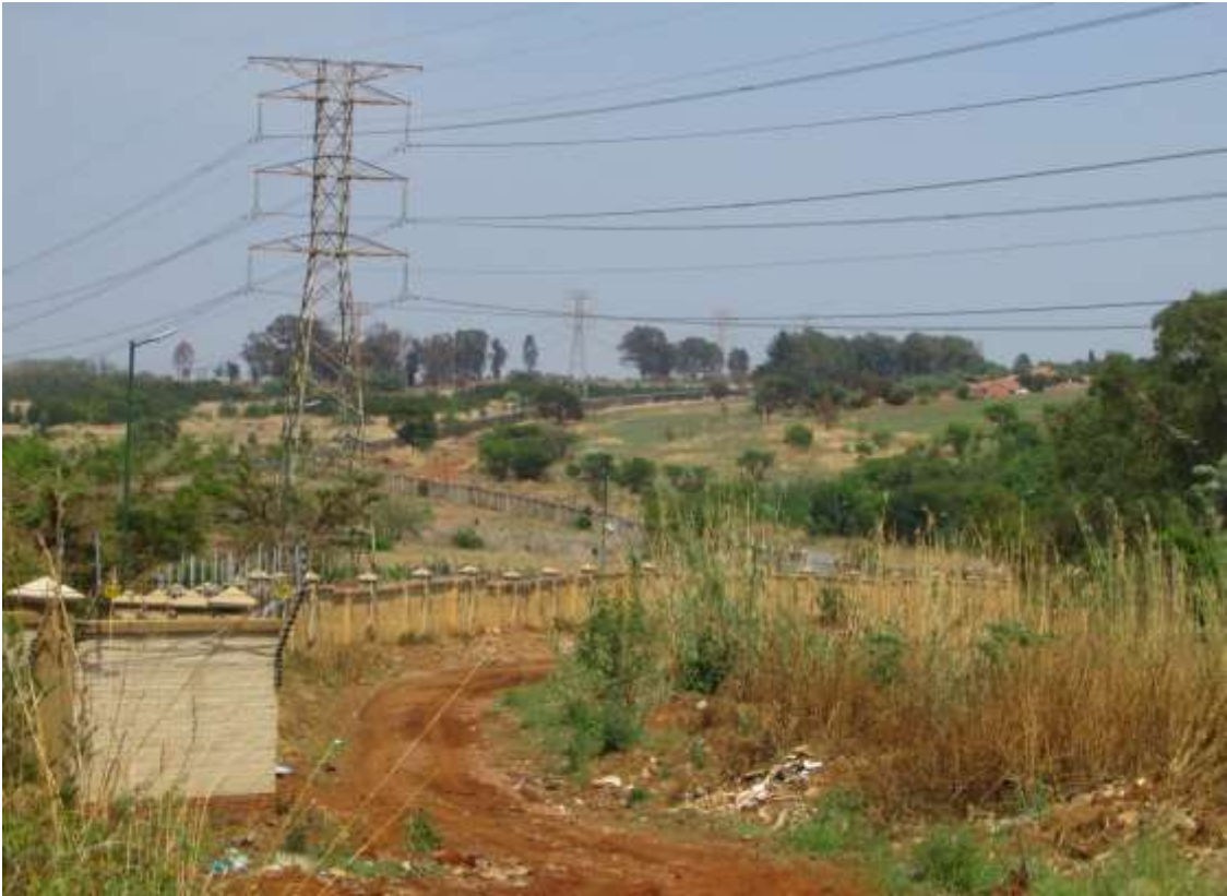
Figure 8: A view of the K54 Road route from Garsfontein Road towards the R50.