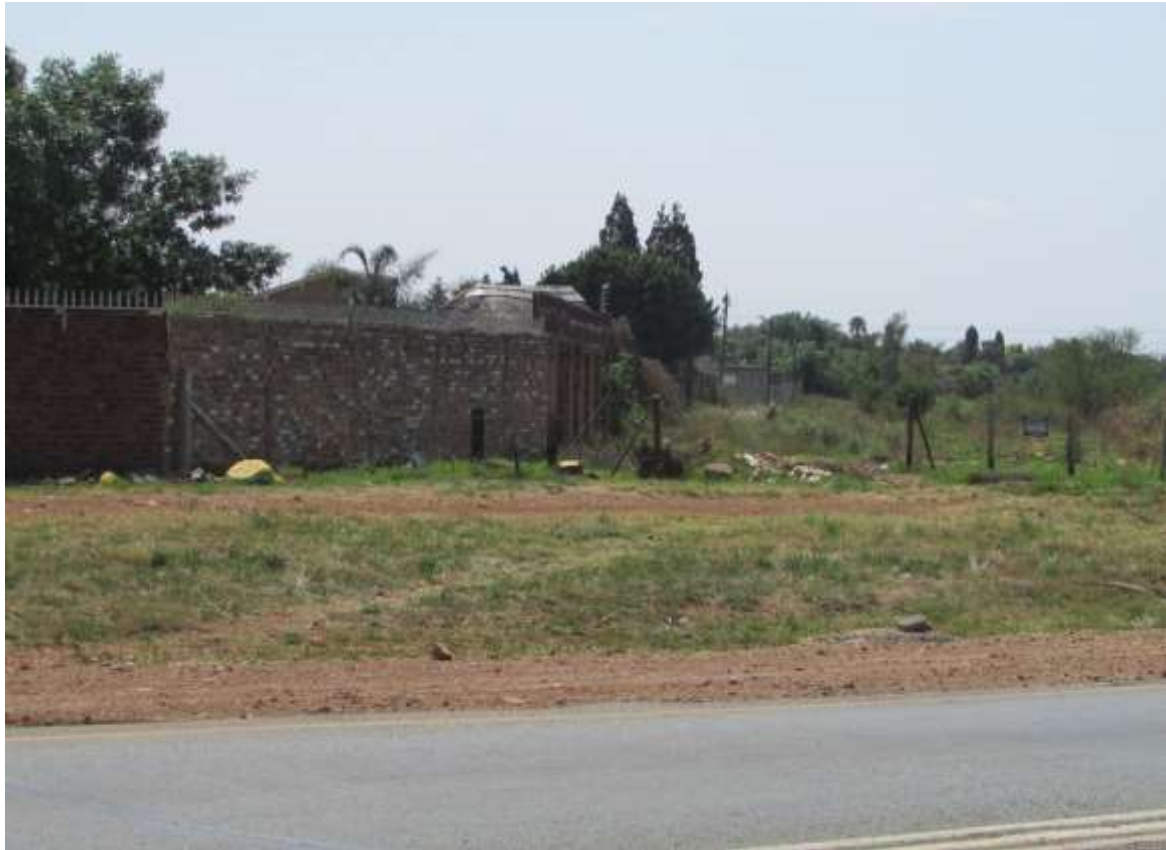
Figure 12: A view of the K54 route close to the Delmas Road junction.