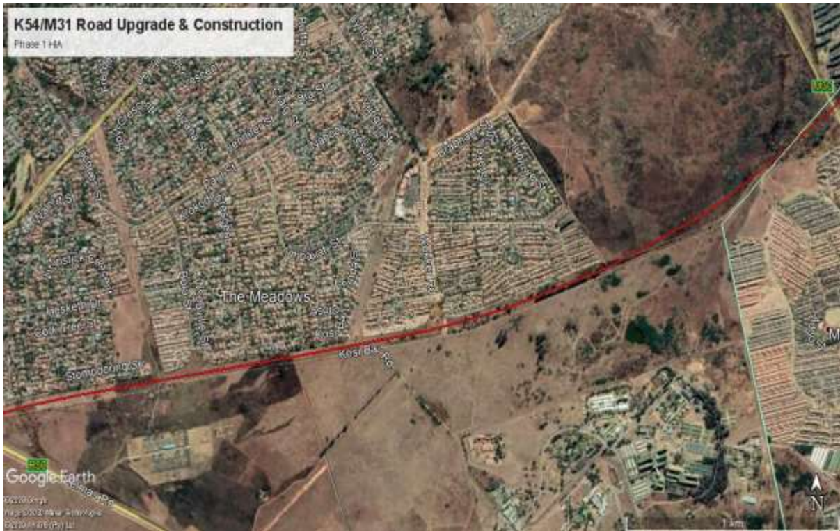
Figure 7: Closer view of the K54 Road section between Garsfontein Road and the Delmas Road (R50).