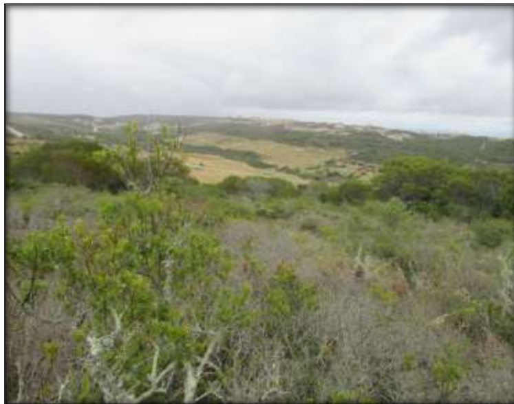
Fig.6: A view of a section of the study area.