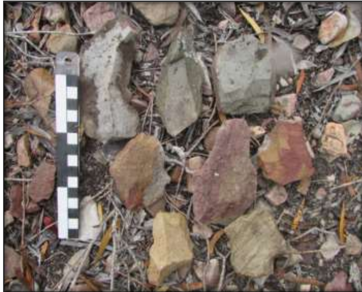
Fig.14: A range of flakes and tools found during the assessment in one area.