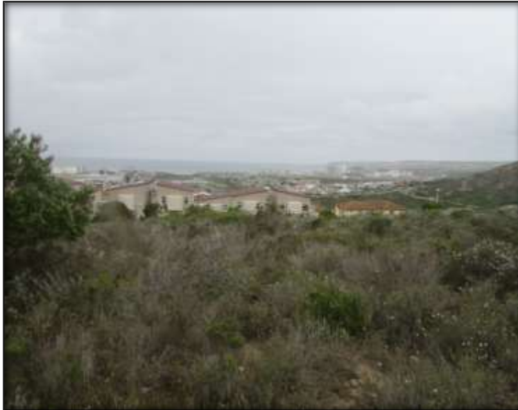
Fig.5: Another general view. Note the neighboring developments.