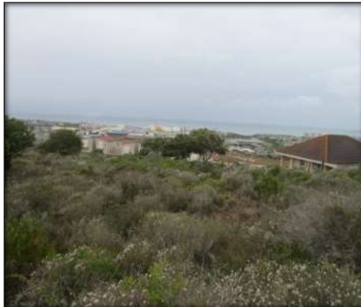
Fig.8: A view of a section of the area showing the Neighboring residential developments and a residence on a part of the study area.