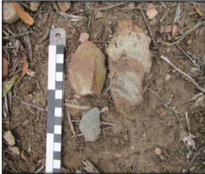
Fig.10: Stone tools found during the assessment.