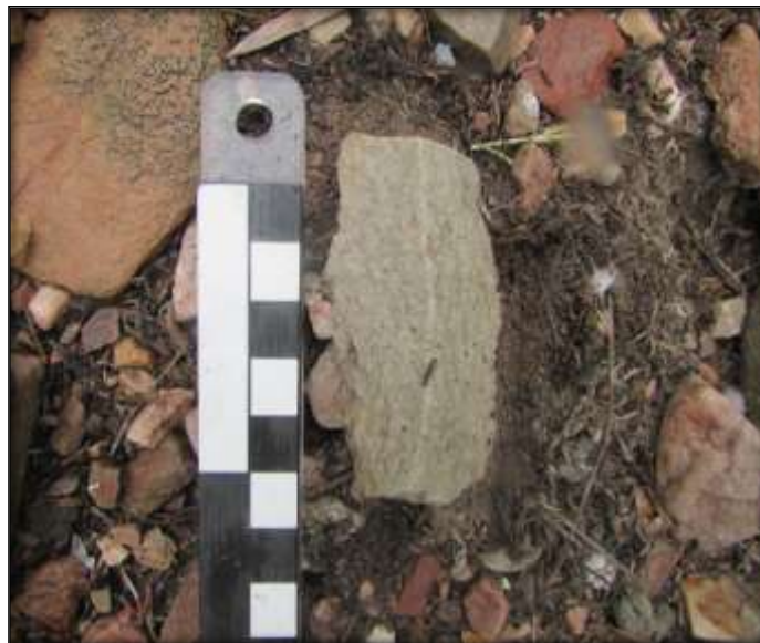
Fig.13: A broken MSA point.