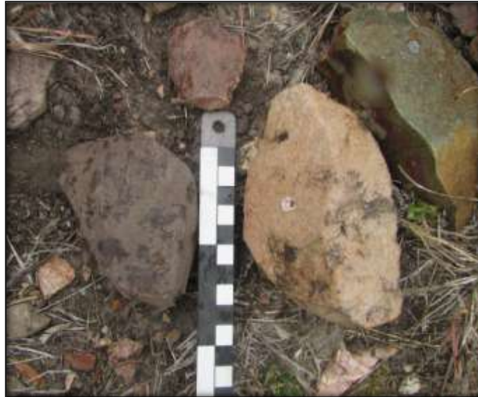
Fig.12: MSA & possible ESA stone tools found.