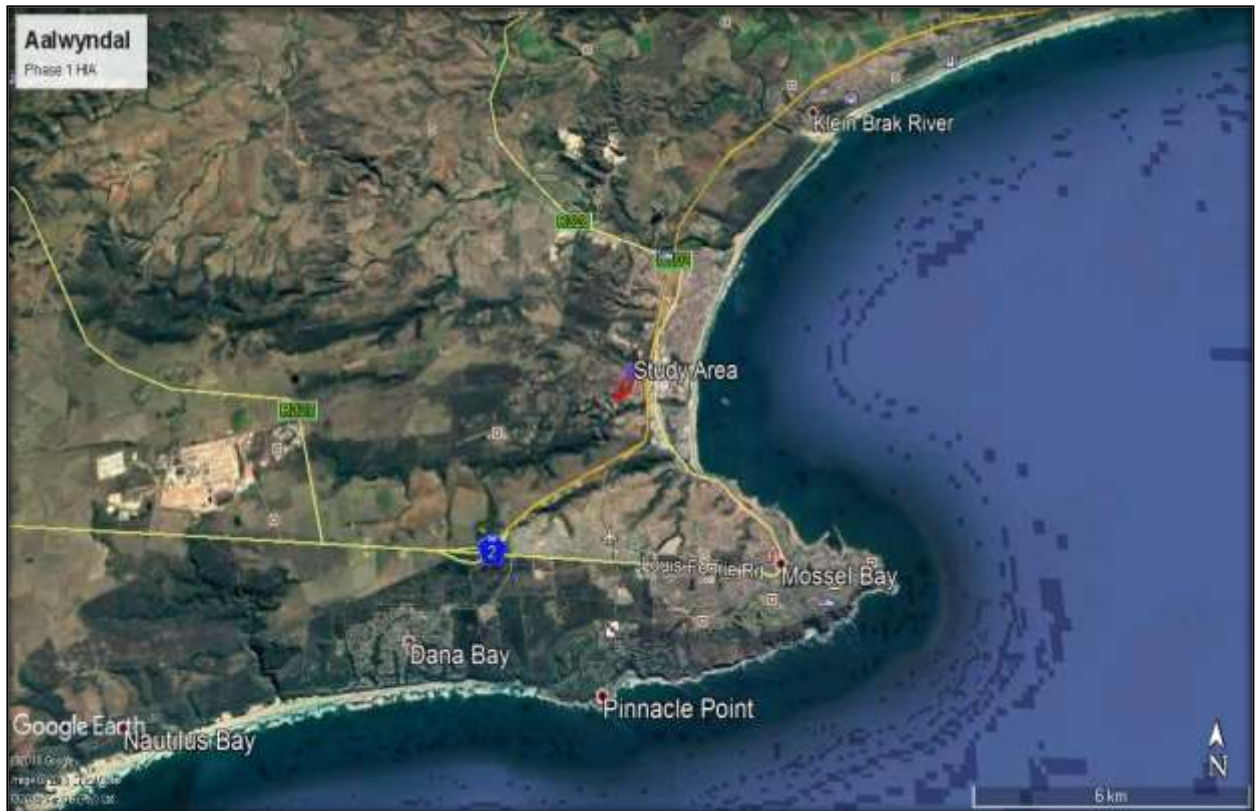
Fig.1: General location of the study area (Google Earth 2018).