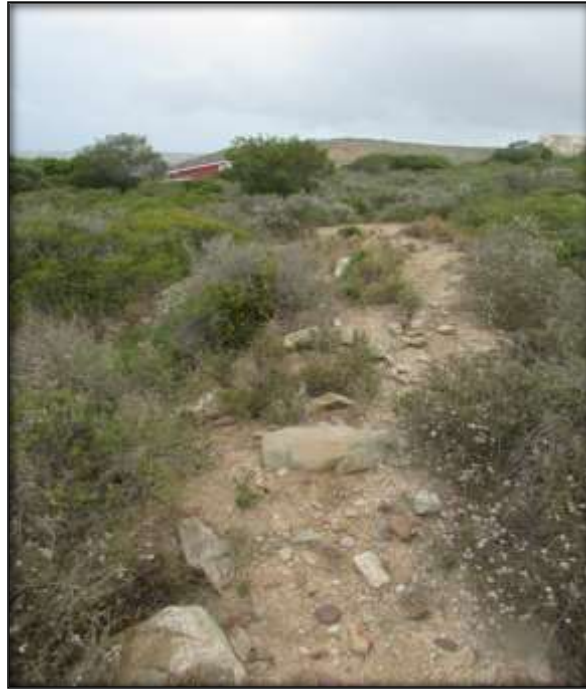
Fig.7: Recent impact on a section of the area. Trench for pipeline or fibre optics?