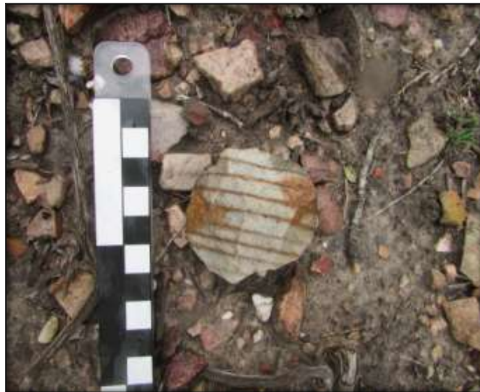
Fig.11: A Stone Age core found in the area.