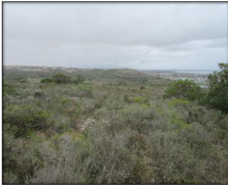
Fig.4: Another view of the study area. Note the dense vegetation cover.