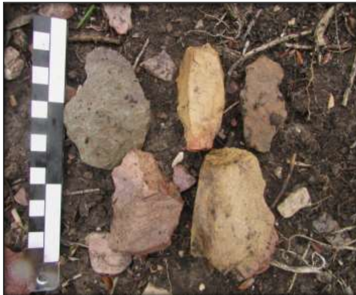
Fig.15: Cores and flake-tools from another area.