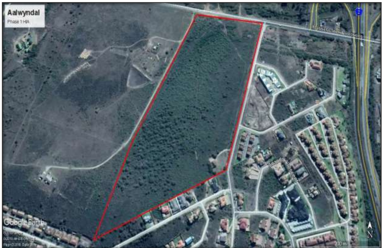
Fig.2: Closer view of the study area (Google Earth 2018).