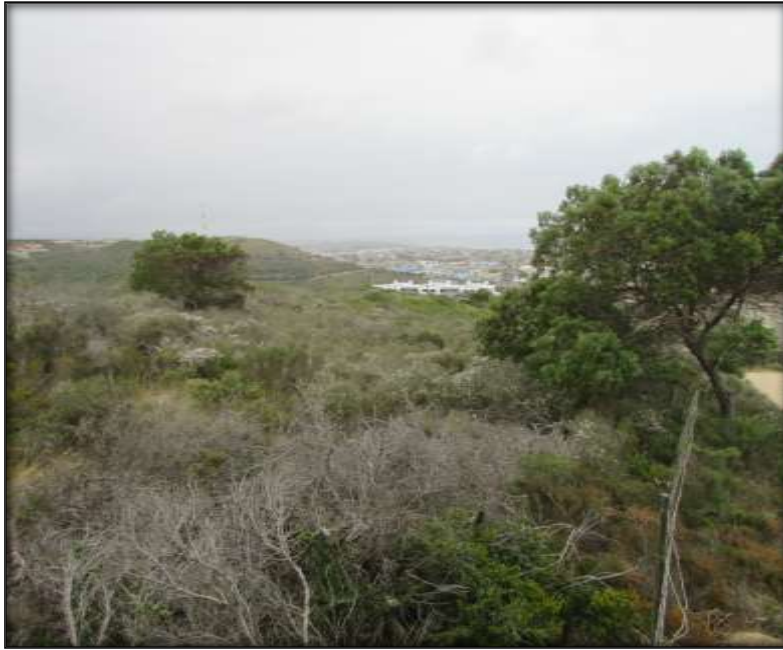
Fig.3: A view of a section of the study area.