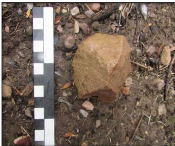
Fig.16: A large core found during the assessment.