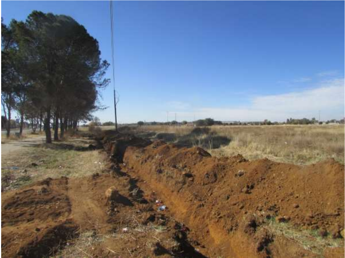
Figure 7: A trench (for a pipeline?) on the development area's northern boundary have impacted on the area as well.