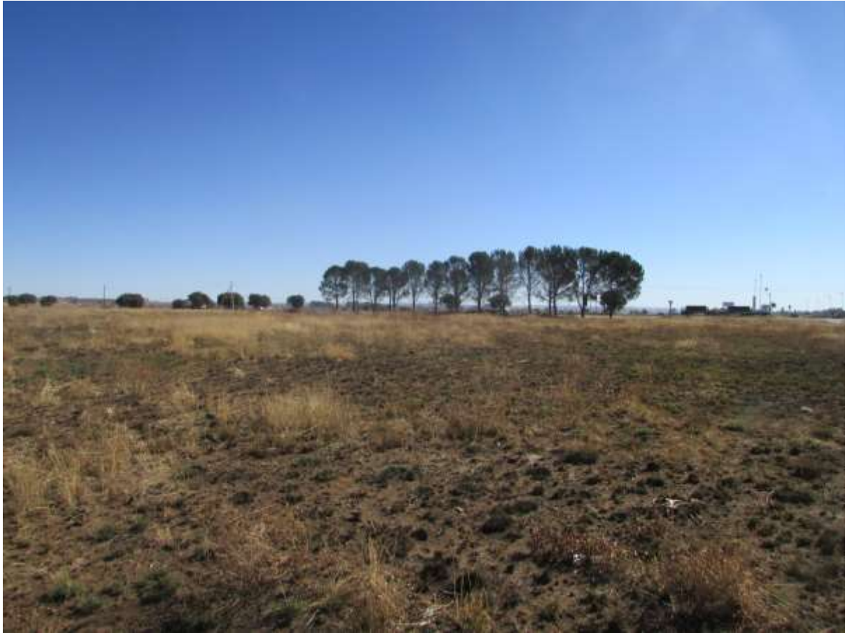
Figure 5: Another view.