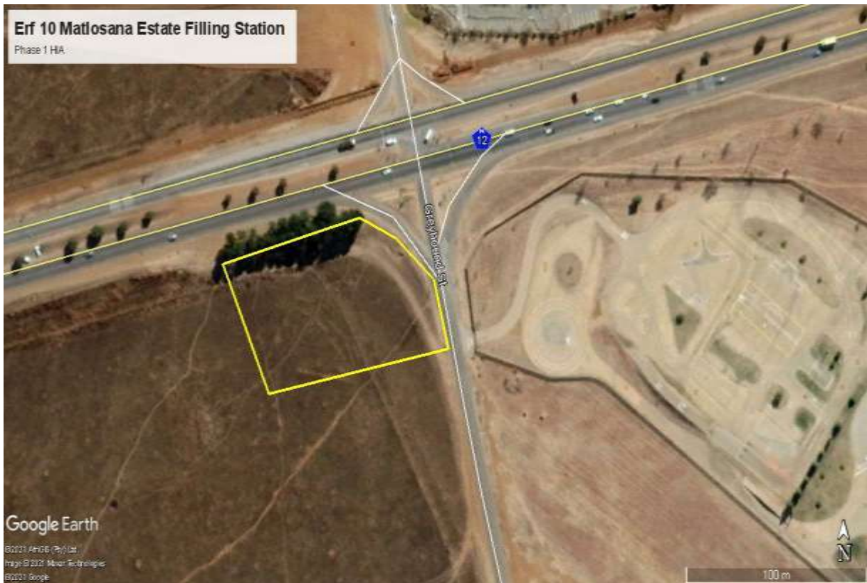
Figure 8: 2011 aerial image of the area. No structures or sites are visible on this image (Google Earth 2021).

Based on the desktop research, physical field assessment and aerial images of the area it is concluded that the proposed development can continue therefore.