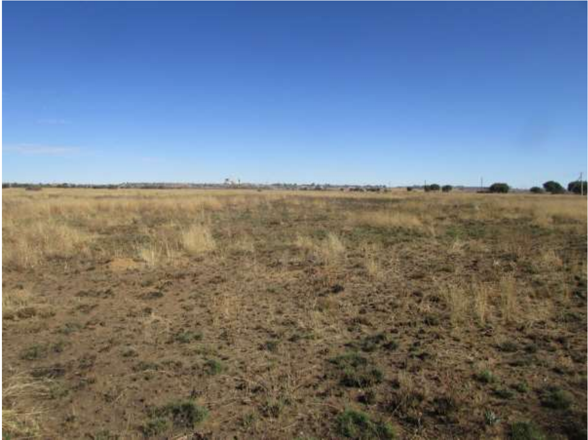
Figure 4: General view of the study area and location of the proposed development.