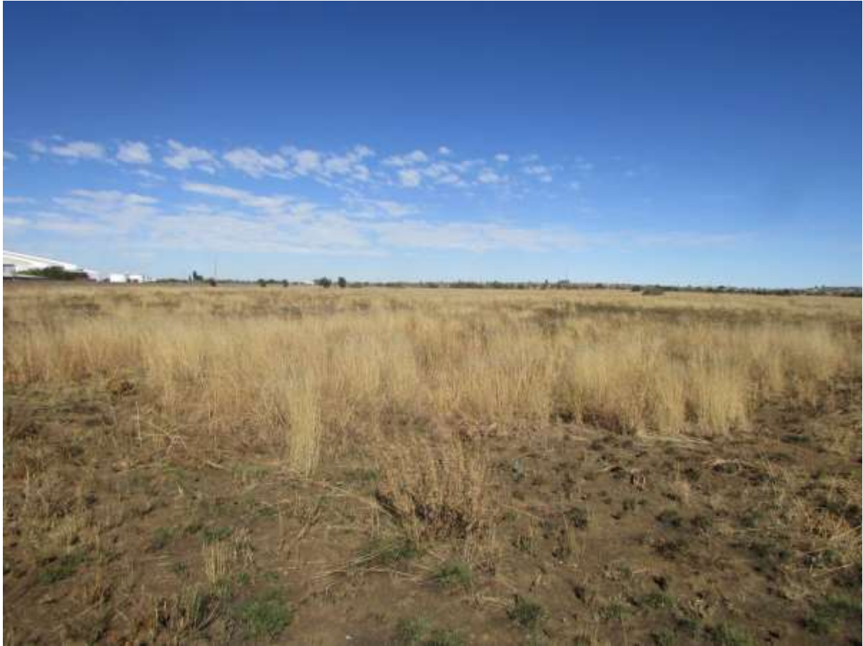
Figure 6: Although there are some grass cover visibility on the ground was good. Tree cover is virtually non-existent.