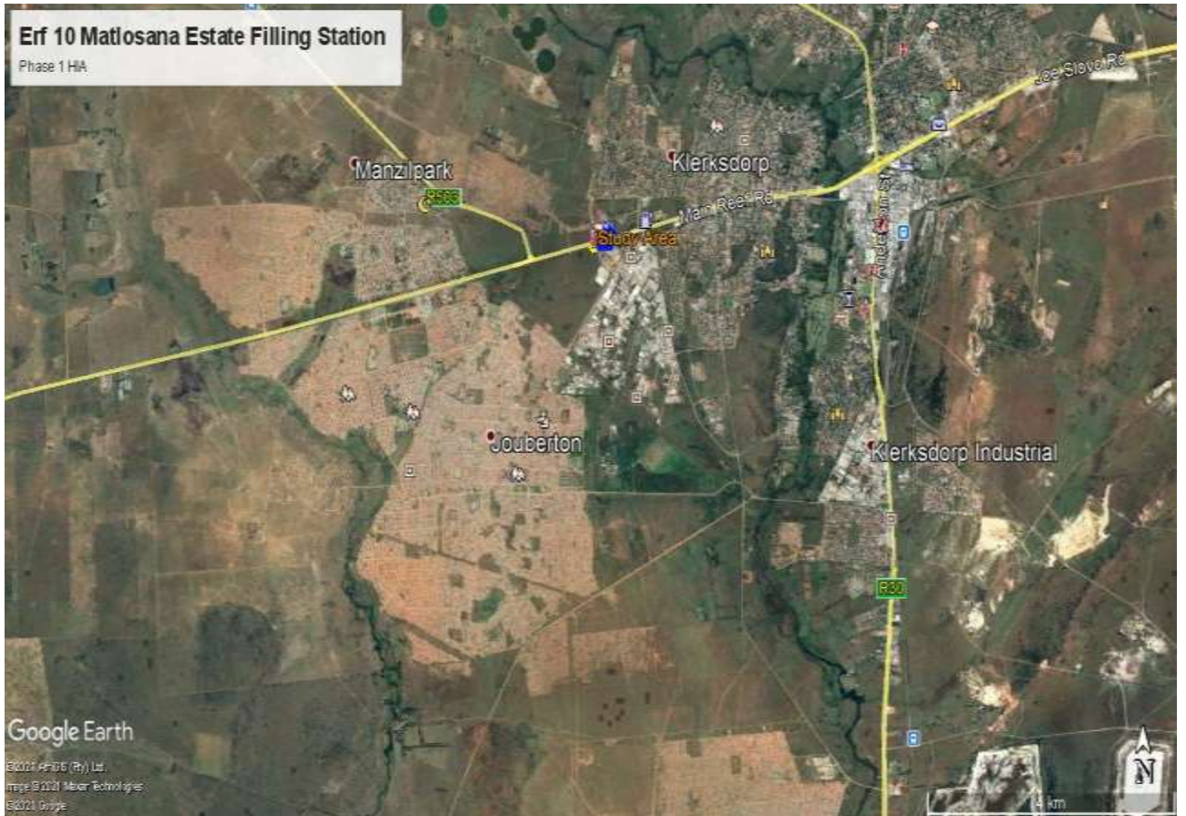
Figure 1: General location of the study & development area (Google Earth 2021).