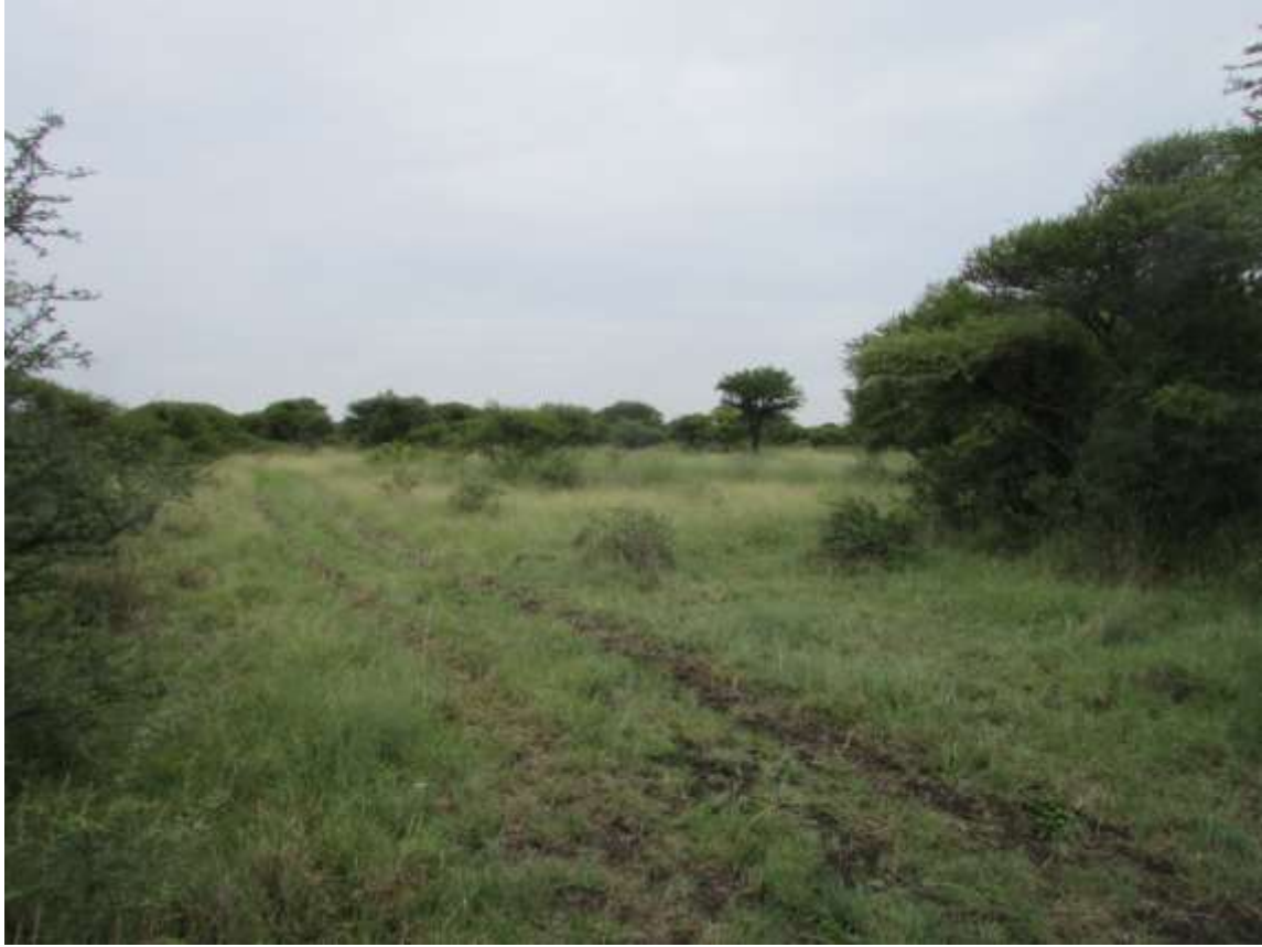
Figure 11: Another section of the study area.