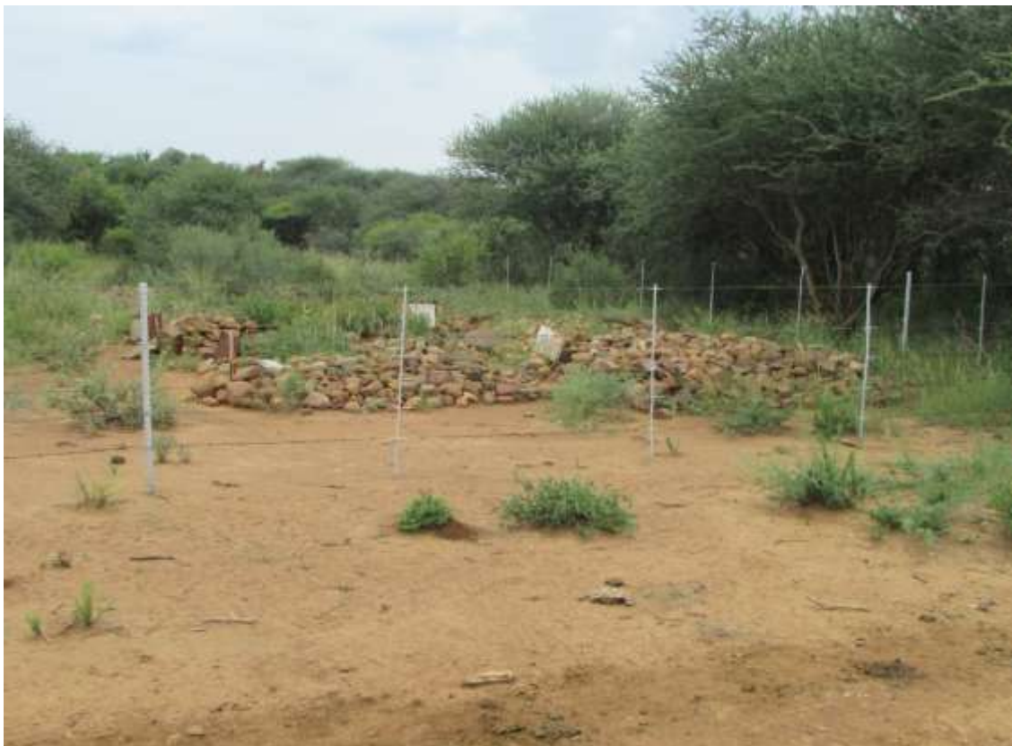
Figure 6: A view of the graveyard recorded.