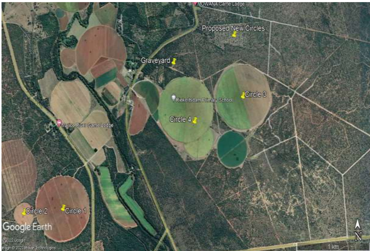
Figure 2: Closer view of study area location showing the existing pivot points/circles & the area where vegetation clearance for the new pivot points/circles are proposed (Google Earth 2022).