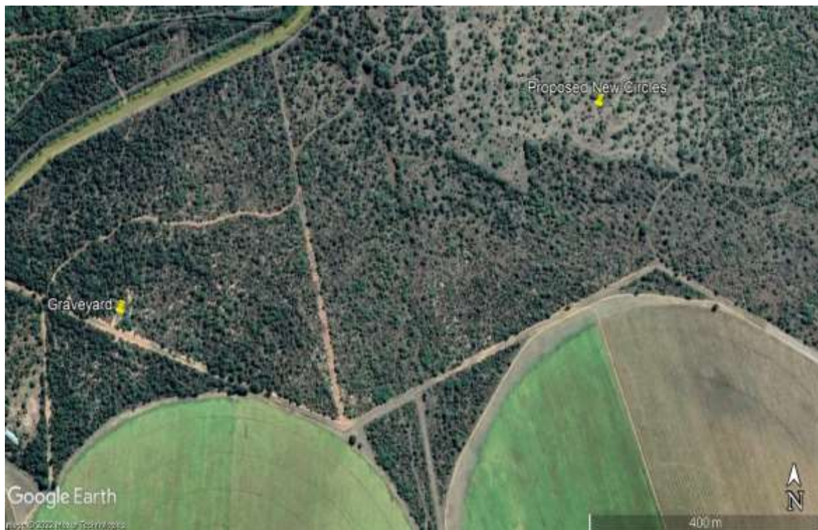
Figure 4: Closer view of area showing location of graveyard in relation to the study/development area (Google Earth 2022).

GPS Location of Site: S25 26 35.53 E26 23 37.84.