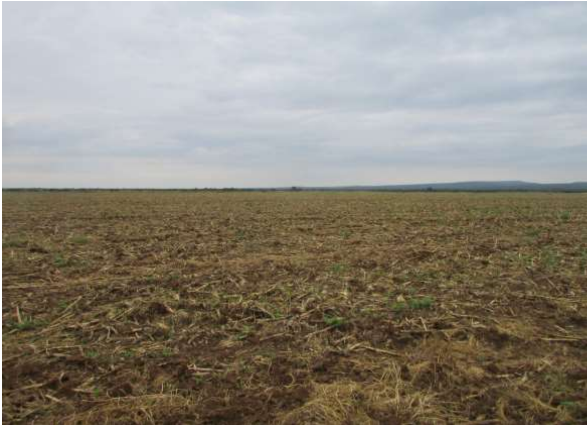
Figure 5: View of one of the existing old pivot points/crop circles.