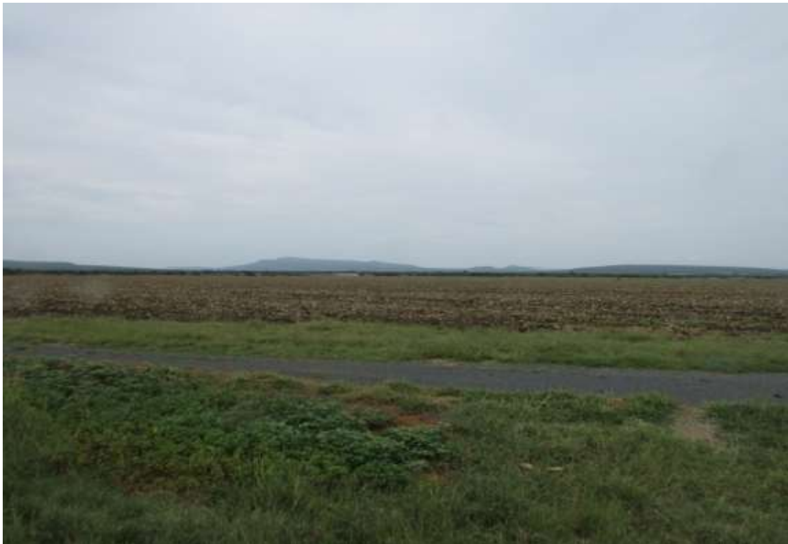
Figure 12: Another view of one of the existing pivot points/crop circles showing the extensive impact of agricultural activities on the general landscape.