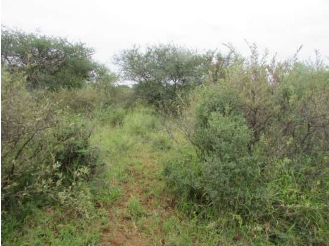
Figure 9: Another view. Note the dense vegetation.