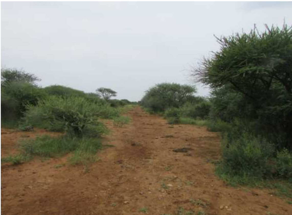
Figure 10: Some sections are more open.