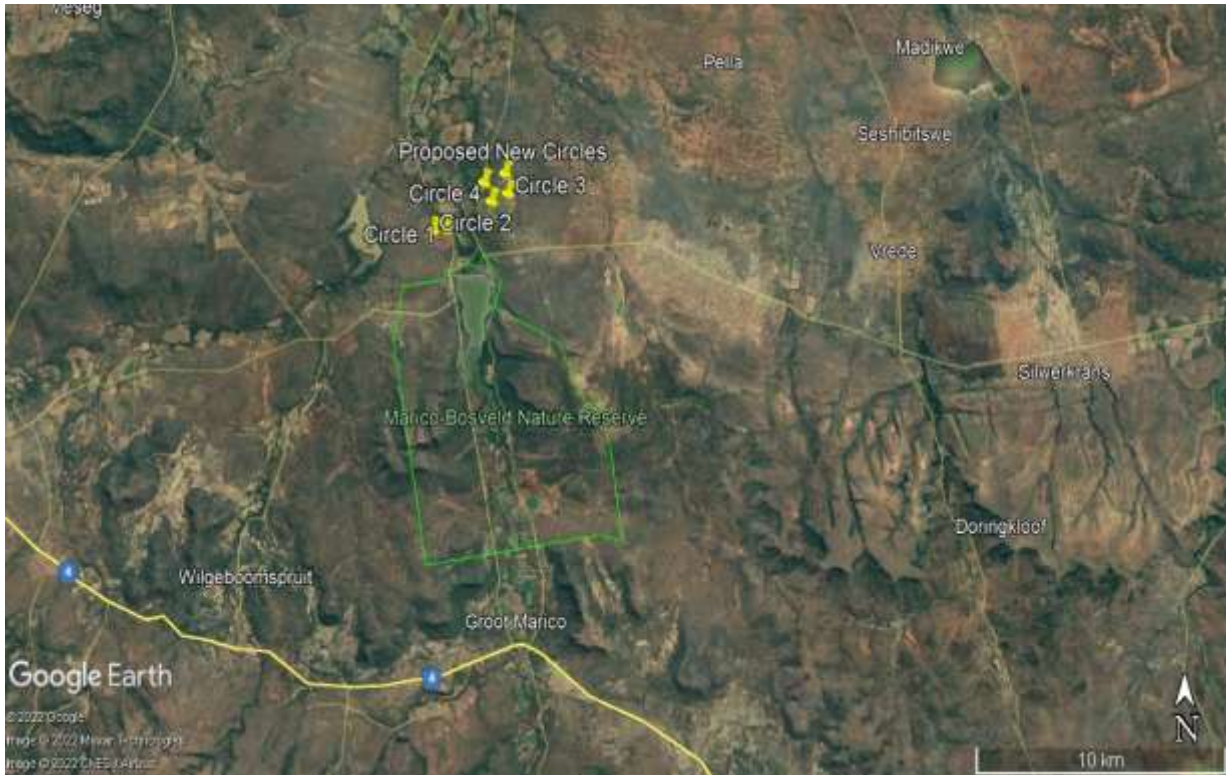
Figure 1: General location of study area (Google Earth 2022).