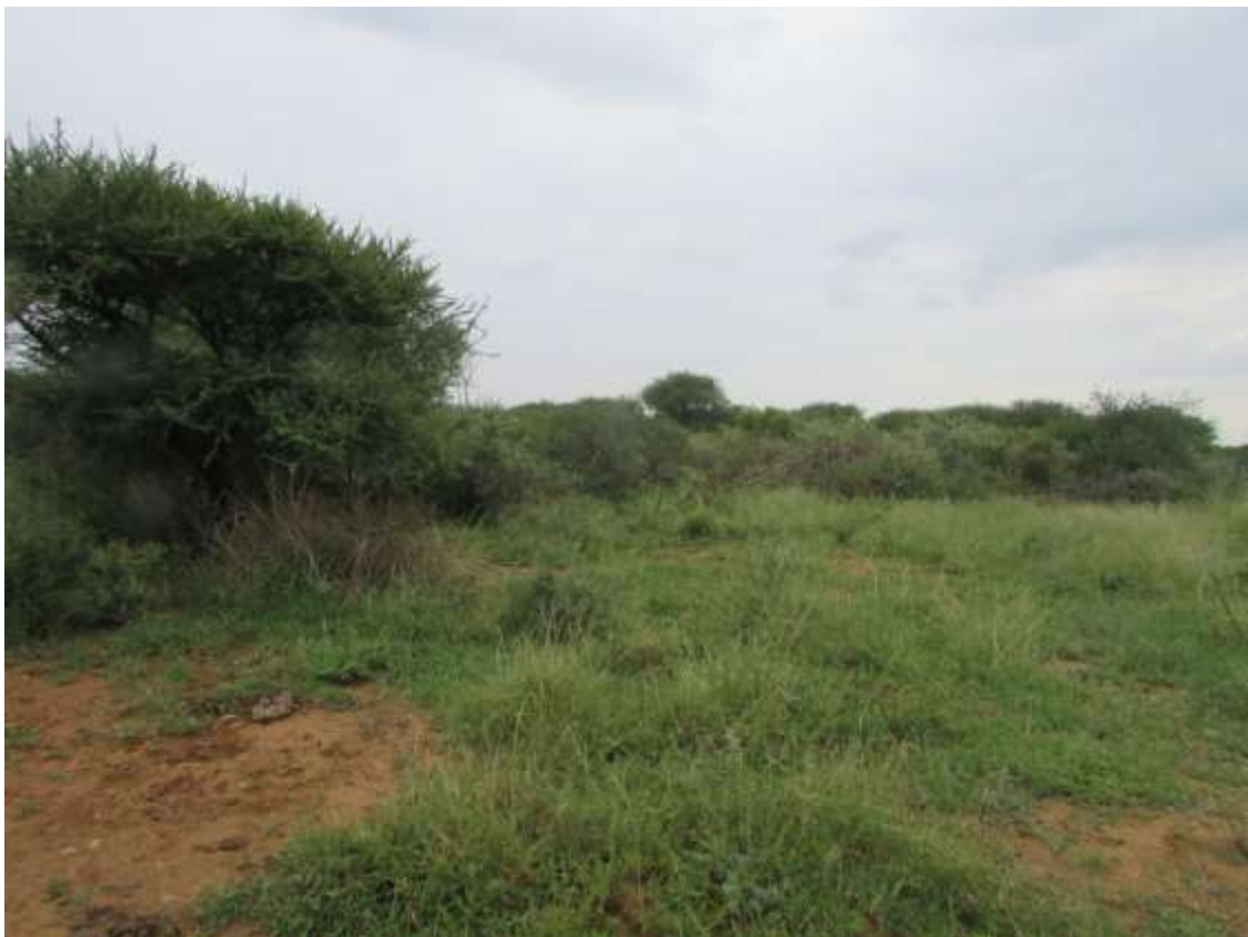
Figure 8: General view of the area where vegetation clearance will take place.