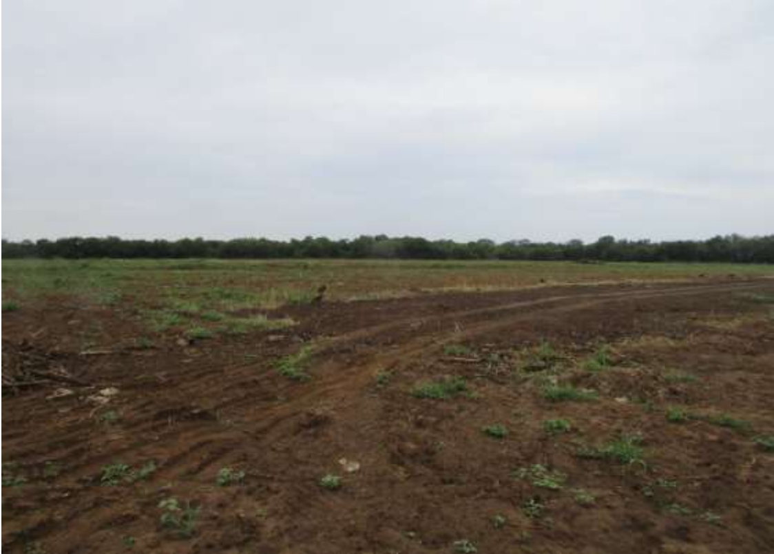
Figure 13: A view of a section of the area where proposed new poultry (chicken) houses are planned. The area has been impacted previously by agricultural activities.

Based on the background research and physical field assessment, from a Cultural Heritage perspective, the proposed clearance of indigenous vegetation for the development of the pivot point/s and poultry houses should therefore be allowed to continue.