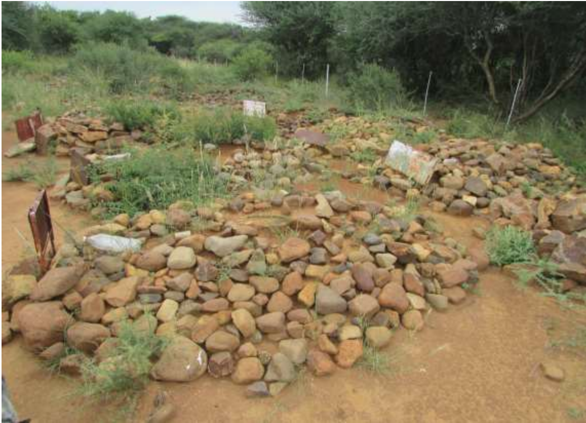
Figure 7: Closer view of the graveyard and graves.