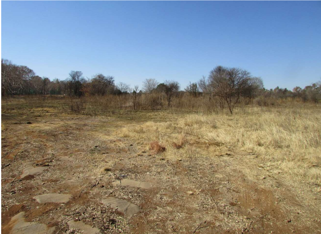
Figure 6: View of a section of the study area.