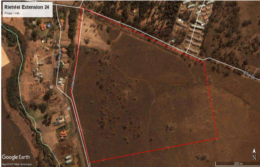
Figure 4: A 2004 aerial image showing some small-scale agricultural plots in the north-western section of the area.