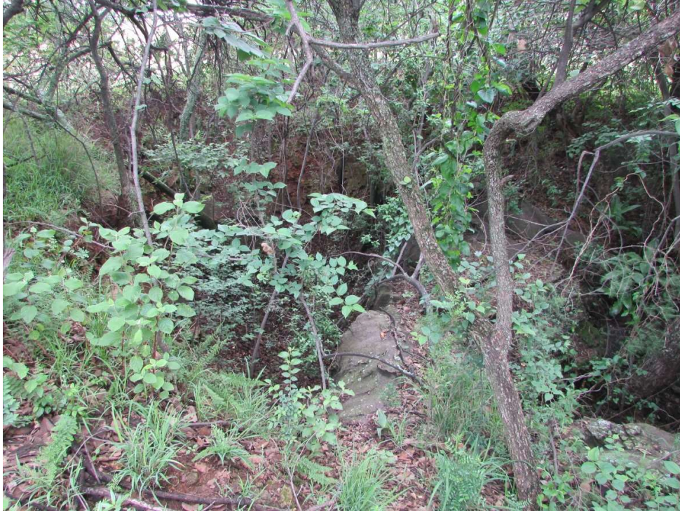
Figure 22: A view of the “cave” site.

detailed assessment of the site has been undertaken. The significance of the site on Portion 711 is also slightly diminished by the existence of the known Grootboom Cave west of the development, as this cave could be seen as a “control” research area for the other sites in the Irene area.