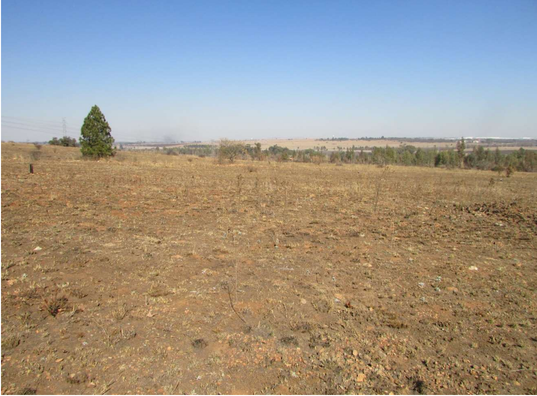
Figure 12: Another general view showing the generally open nature of the area.