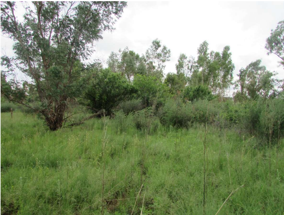
Figure 26: Another section of the area. The dense vegetation is again evident.