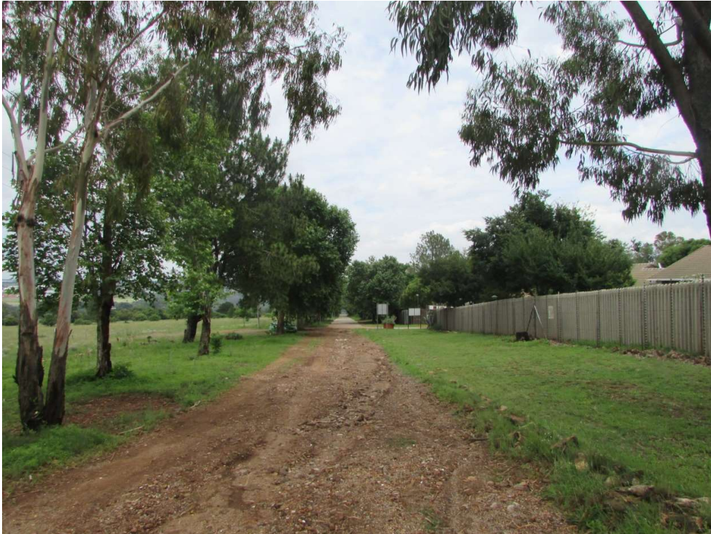
Figure 19: A view of the Lane of Trees running along Jan Smuts Avenue. Taken from the possible Voortrekker Grave Site location.