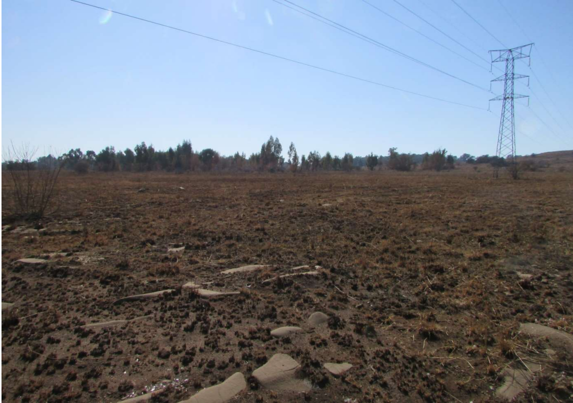
Figure 8: Another general view of part of the area taken from its southern boundary towards the north.