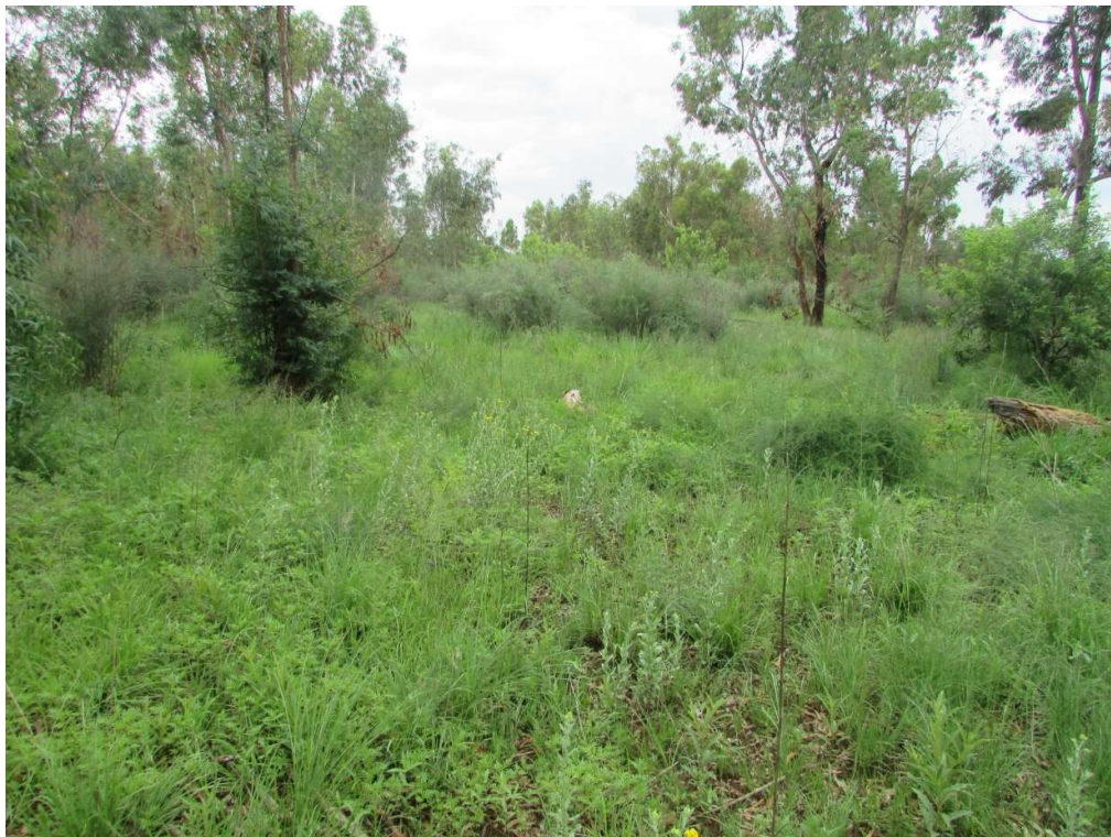
Figure 24: A view of the approximate location of the Grave Site. Note the dense vegetation cover.

In this case, if there are indeed Lime Works Laborer Graves located on the site, the significance of the site is obviously very High, and it is clear that the site will be impacted by the proposed development in some way. However, with a lack of clear evidence for the assumed graves being situated here, it is furthermore recommended that the Interested & Affected Parties from the Smuts House Museum assist the Heritage Specialist in locating the exact position of the graves and the site during a field visit so that a final decision on this matter can be made.