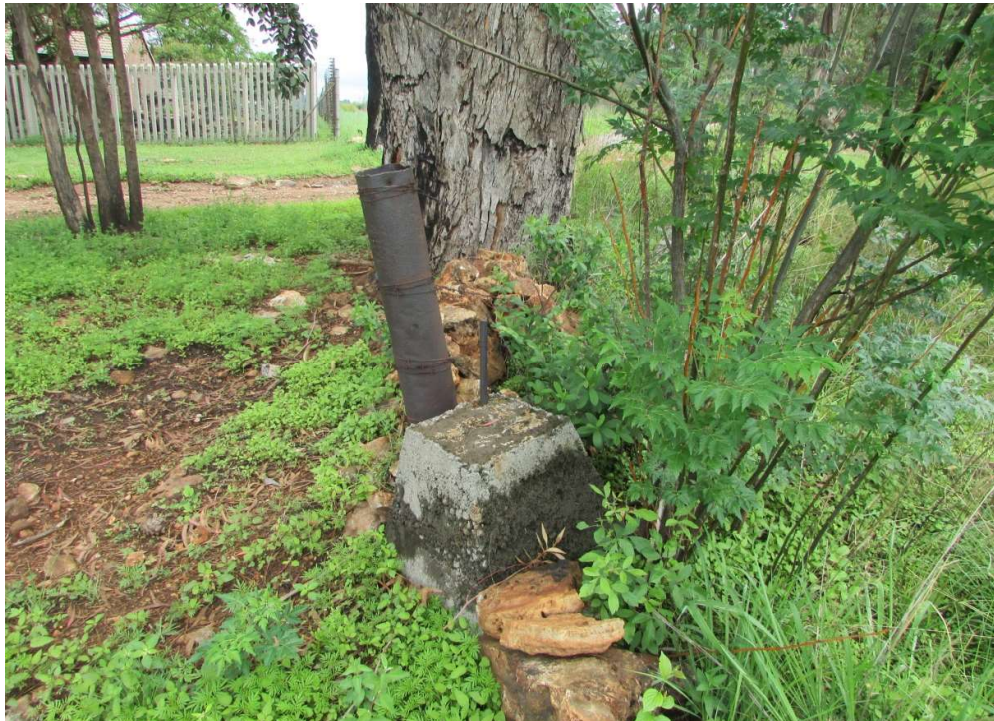
Figure 15: The location of the possible Voortrekker Grave Site. Note the remnants of the wire fence (post & stone boundary) and cement marker.

The December 2021 field assessment did not find any graves with formal or informal headstones at the site, except for a few stone heaps/cairns, remnants of a of wire fence and a cement marker. The dumping of building material and other refuse also occurred on the site, possibly obscuring the graves if they were located there. A wider area around the site was also inspected for the presence of these Voortrekker graves, but no evidence could be found.