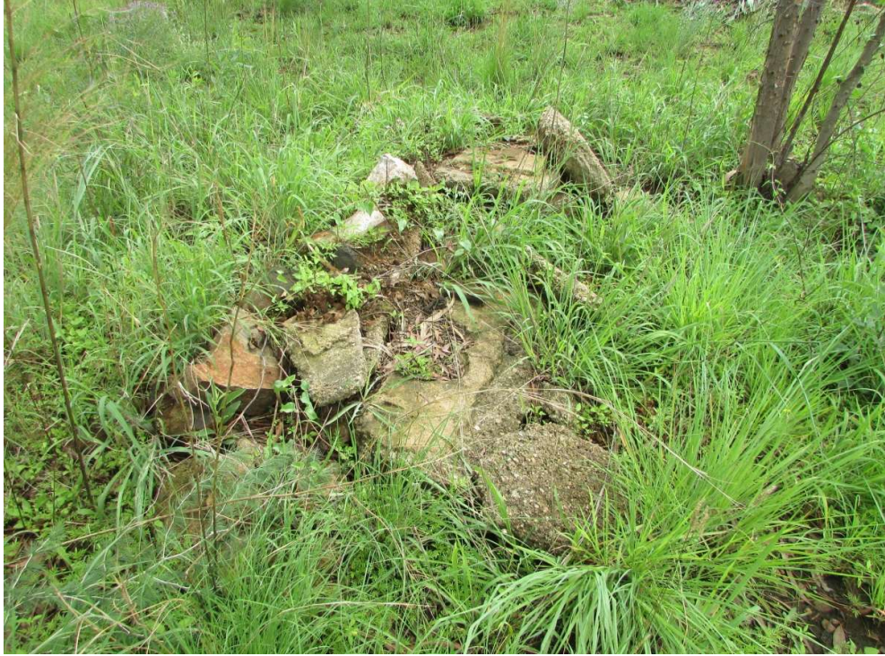
Figure 16: One of the stone heaps/cairns that could represent one of the Voortrekker graves. Some modern cement/concrete has been dumped here as well.