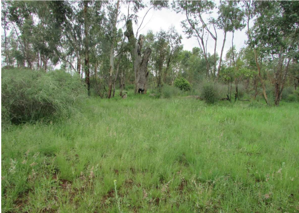
Figure 25: Another view of the general area where the graves could be located.