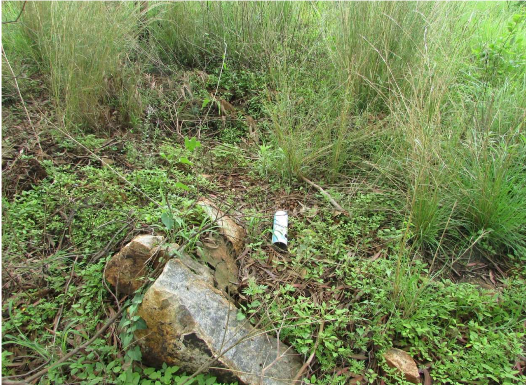
Figure 18: A third stone heap/cairn on the site.

As graves always carry a High Significance Rating from a Cultural Heritage perspective, care should be taken not to negatively impact on them as a result of any development activities. The following options are available to mitigate the possible negative impacts on the site: