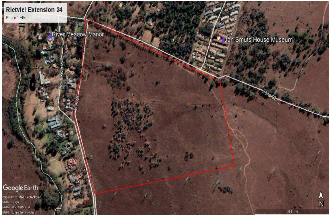
Figure 5: Aerial view showing the development footprint in relation to the Smuts House Museum & River Meadow Manor.

Historical Sense of Place of the Smuts House Museum terrain and River Meadow Manor. These sites and the Doornkloof farm have a direct historical and intrinsic link with Jan Smuts – one of South Africa’s, and arguably the world’s, greatest political figures and Statesmen during the late 19 th and 20 th centuries. As such the Public Participation Process should include detailed consultation with the Smuts House Museum and River Meadow Manor as Conservation Bodies and Interested & Affected Parties.