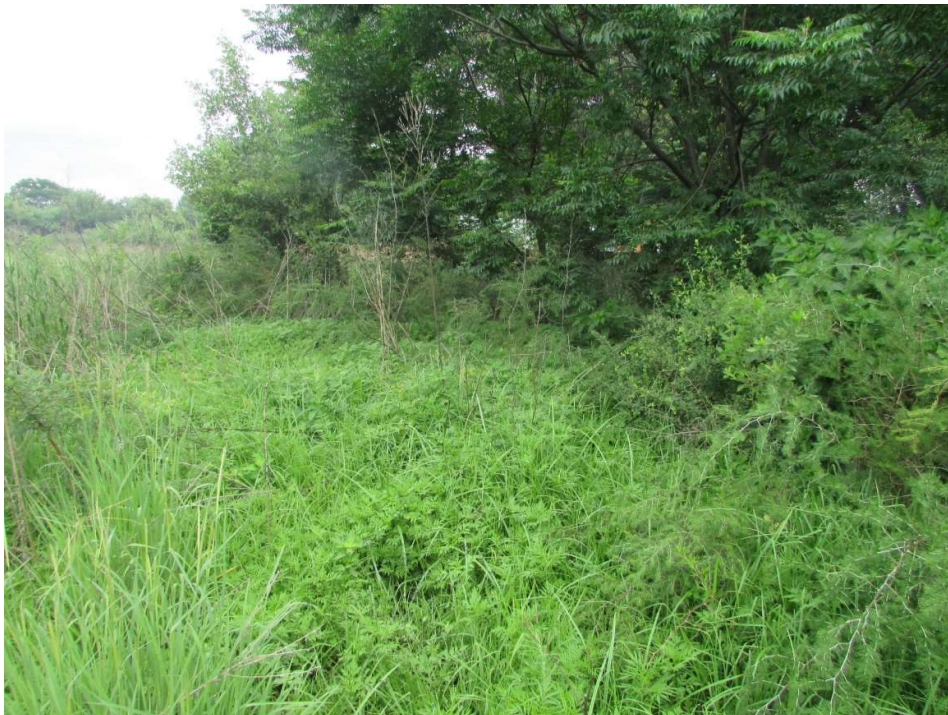
Figure 27: The approximate location of the site. Note the dense vegetation cover.