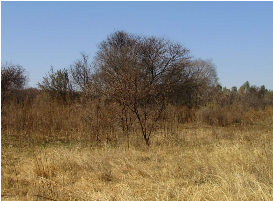
Figure 7: Vegetation cover in general was limited but some patches were more densely covered like seen here.