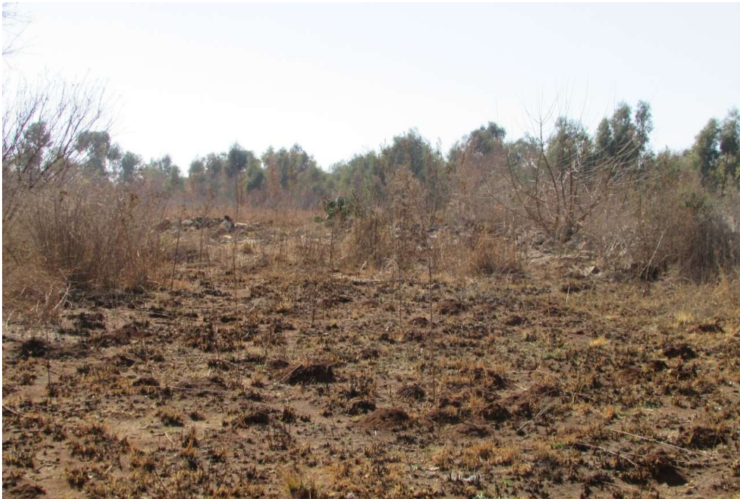
Figure 9: Another section. Note the dumped building rubble.