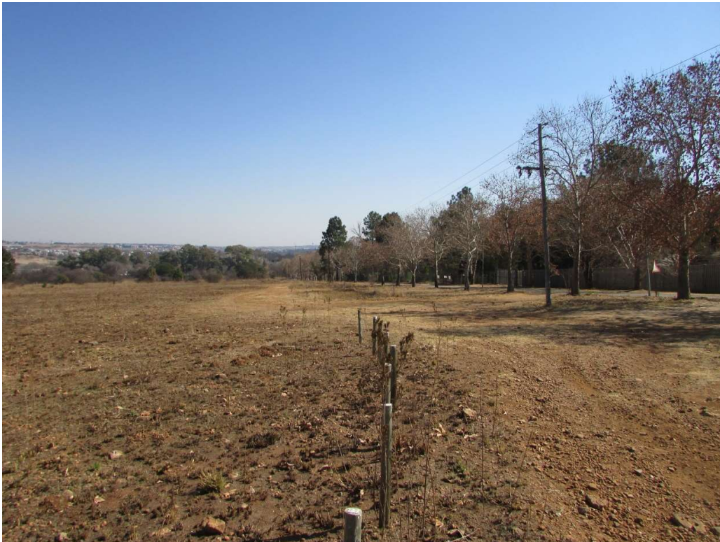
Figure 20: Another view of the Plane Tree Lane (taken in July 2021).