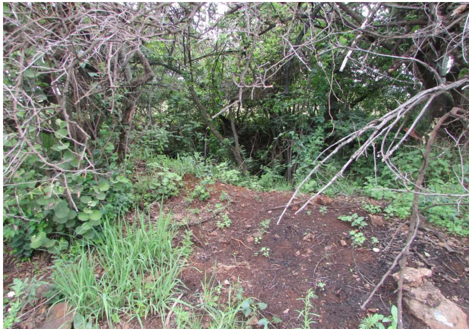
Figure 23: Another view of the site. The soil spoil heap in front seems to indicate the quarrying of the site in recent historical times.