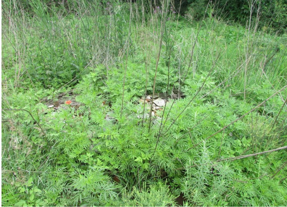
Figure 28: Some building rubble at the site.