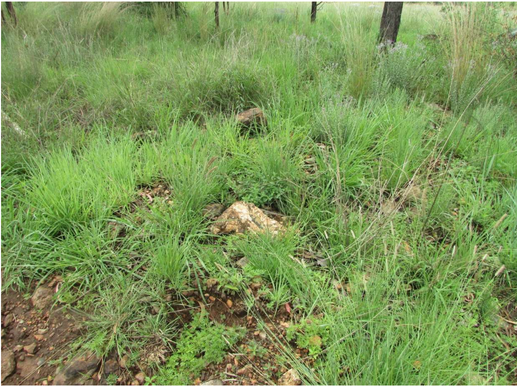
Figure 17: Another stone heap/cairn on the site that could represent a grave.