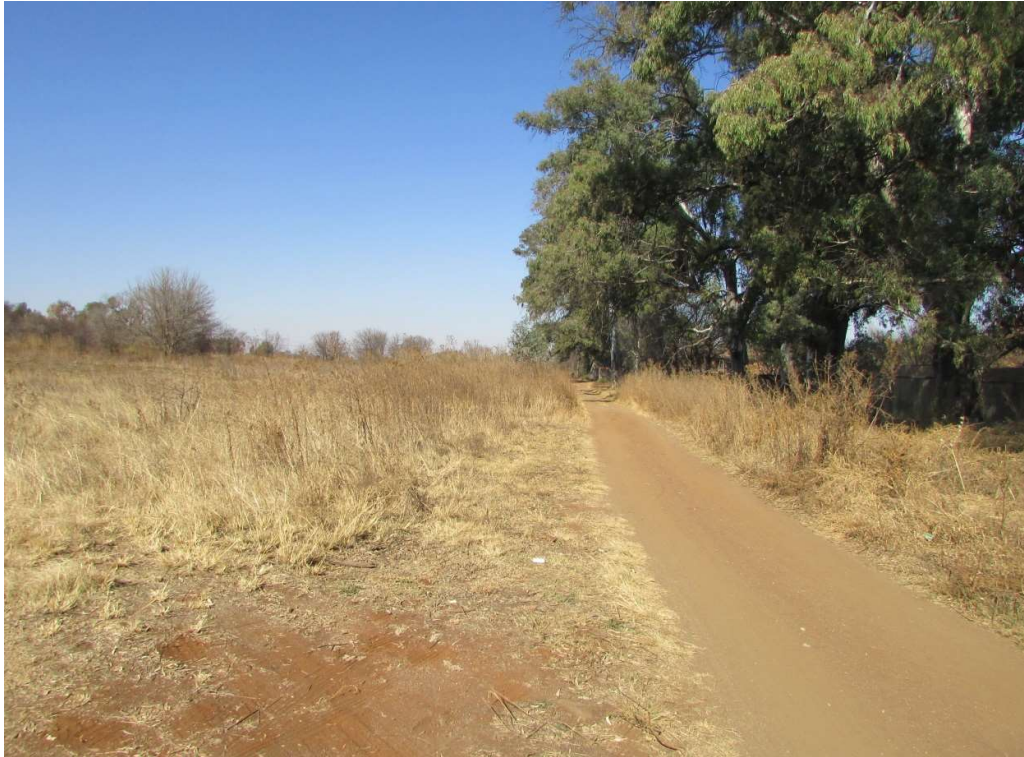
Figure 21: A view of the lane of Blue Gum trees next to Twin Rivers (taken in July 2021).

The next site assessed in December 2021 is a cave situated on Portion 711. According to the information provided this cave forms part of a system of dolomitic caves in the Irene area and that these are mentioned in a book by Genl. Jan Smuts' son J.C. Smuts. Apparently, the Grootboom Cave is across the railway line to the West of the development. It bears proof of the existence of dolomitic caves. According to the information provided in the report by Dr. van der Walt the cave on Portion 711 could contain the remains of BaKwena people, and that the site and caves might require paleontological investigations.