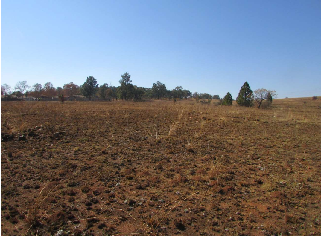
Figure 10: General view from the eastern boundary towards the west. Note the generally flat and open nature of the area.