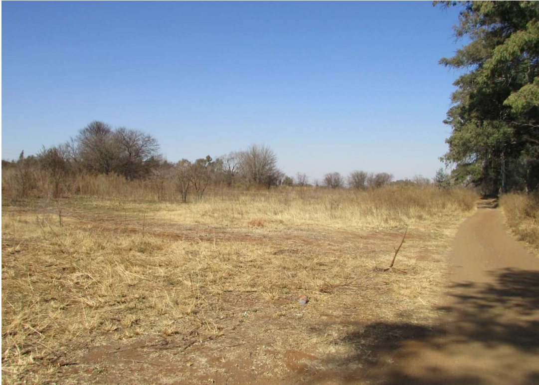
Figure 14: View of area from the northern boundary towards the south.

Based on the July 2021 assessment it was recommended that the proposed Rietvlei Extension 24 Township Development on Portion 712 of the farm Doornkloof 391JR be allowed to continue taking into consideration the recommendations made.