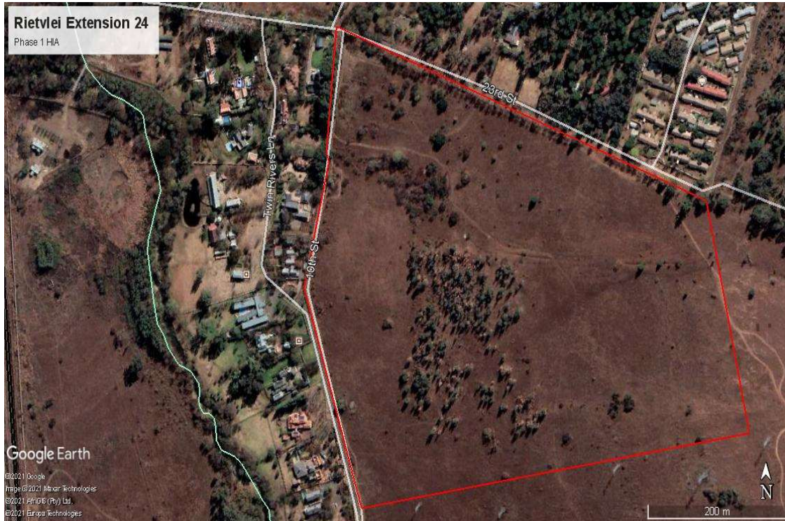
Figure 2: Closer view of study area & proposed development footprint (Google Earth 2021).