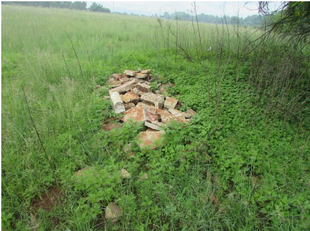
Figure 29: More building rubble at the site that could be associated with the laborer settlement in the area.