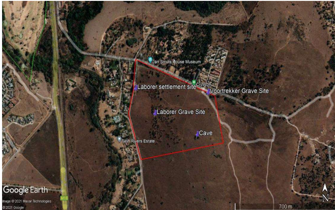
Figure 30: Location & distribution of sites in the study & development area (Google Earth 2021).

It should be noted that although all efforts are made to cover a total area during any assessment and therefore to identify all possible sites or features of cultural (archaeological and/or historical) heritage origin and significance, that there is always the possibility of something being missed. This will include low stone-packed or unmarked graves. This aspect should be kept in mind when development work commences and if any sites (including graves) are identified then an expert should be called in to investigate and recommend on the best way forward.