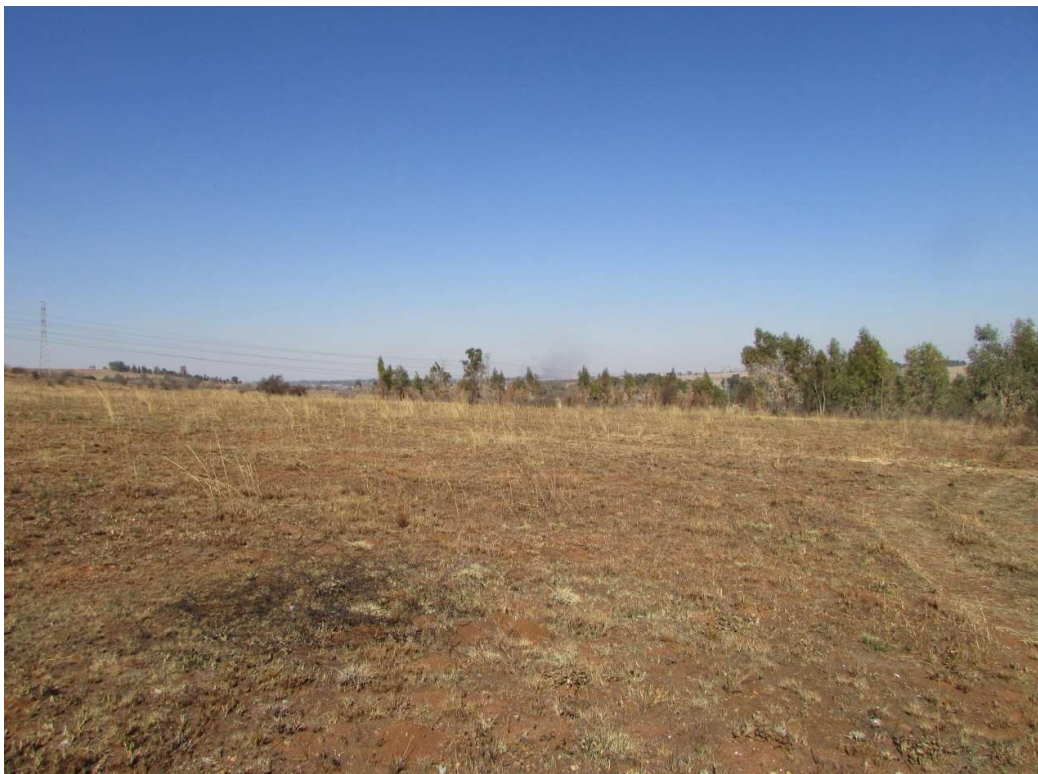
Figure 11: View of part of the area taken from the northern boundary towards the south.