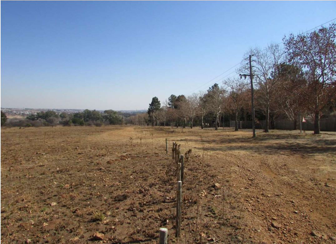
Figure 13: View down the northern boundary towards the west.