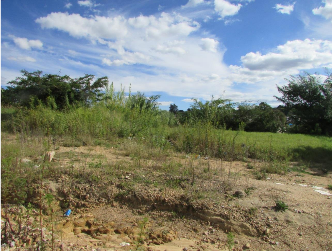
Figure 8: Another view of a section of the study & development area.