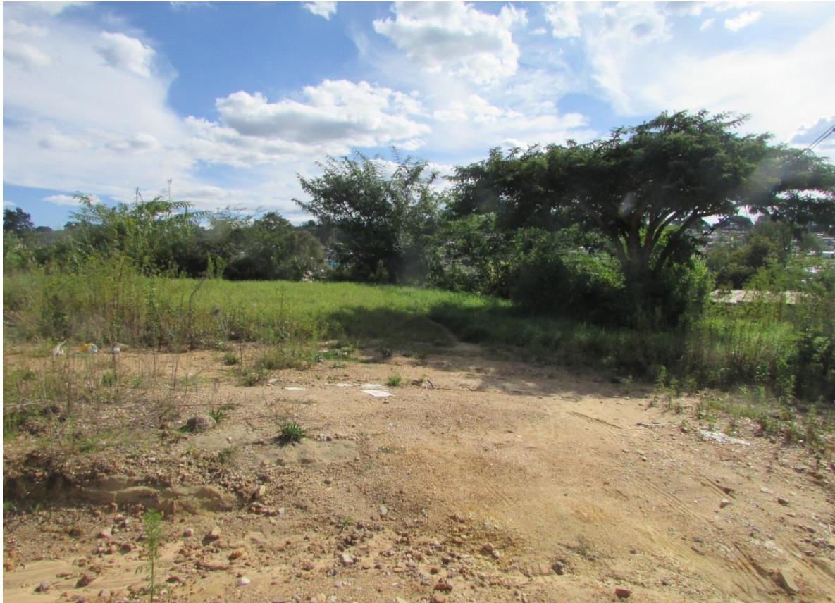
Figure 11: Another section of the study & development area.

Based on the desktop research, previous assessments in the area and the current physical assessment of the Zandspruit Bulk Sewerline there is should be no objection from a Cultural Heritage perspective to the proposed development and WULA.