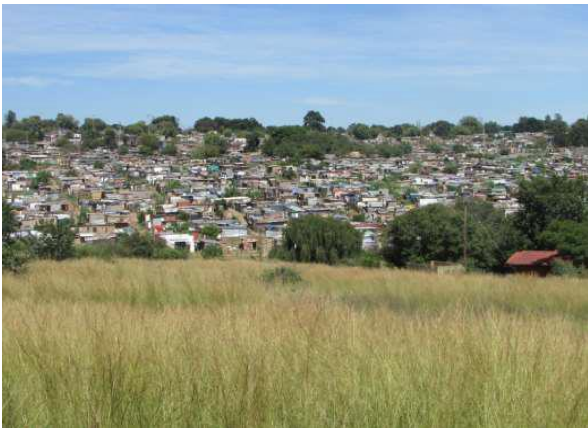
Figure 6: Another section of the area (also taken in 2020).