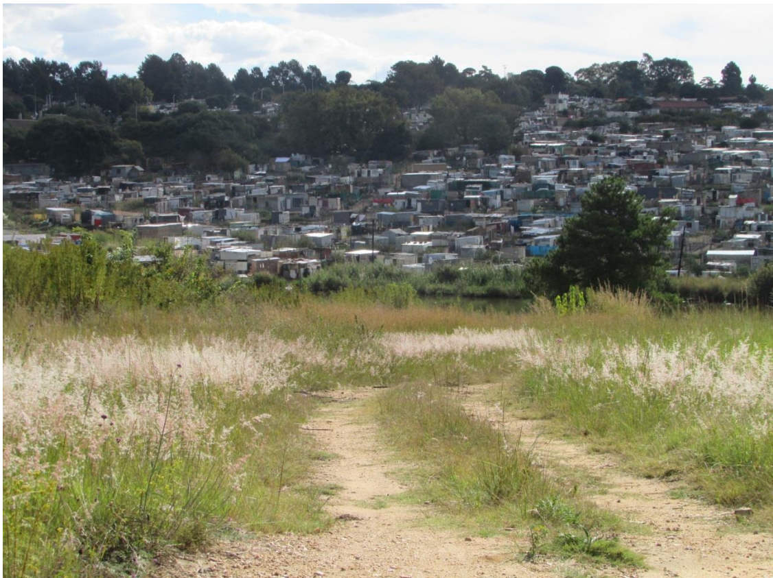
Figure 9: General view of the study area and the Zandspruit Informal settlement.