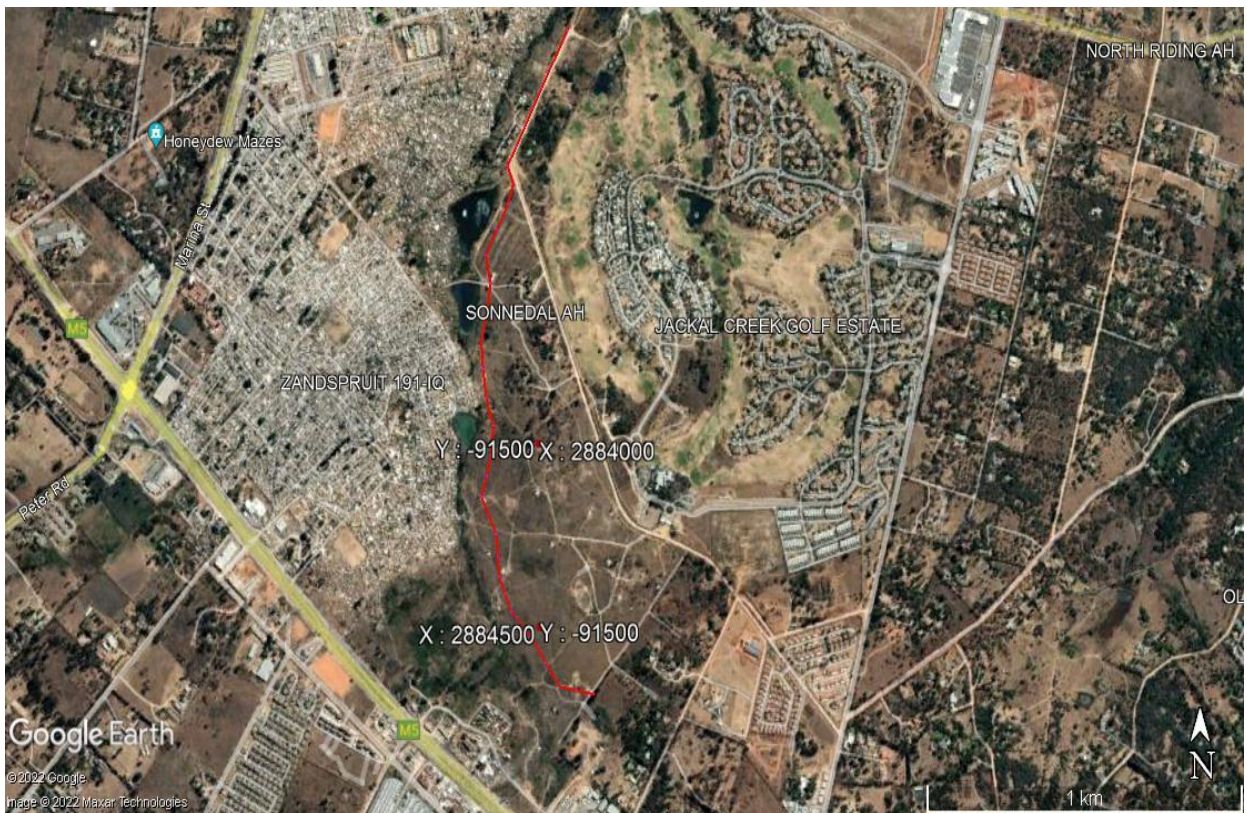
Figure 2: Closer view of the study area and proposed sewerline route (Google Earth 2022).