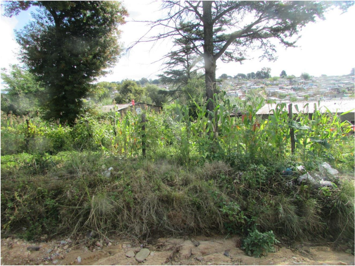
Figure 10: View of the area showing the close proximity of the informal settlement to the sewerline route.