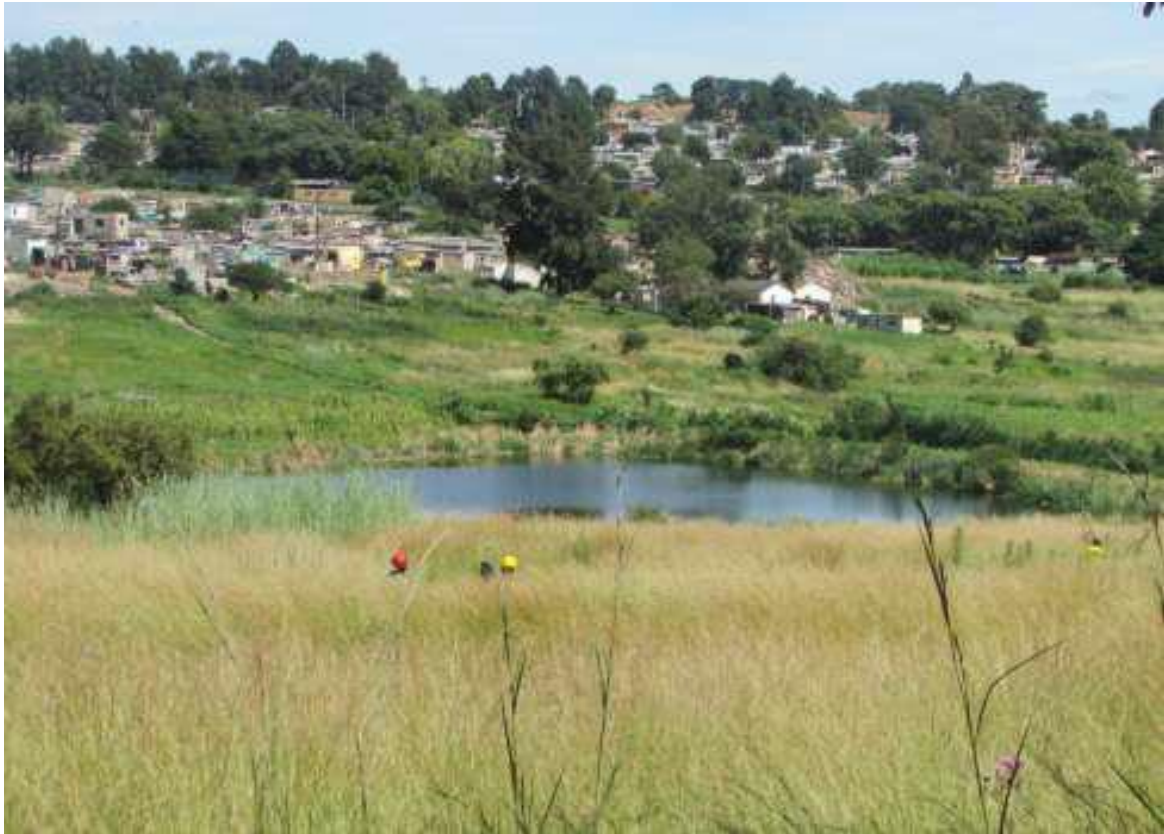
Figure 5: A view of a section of the area (taken in 2020).