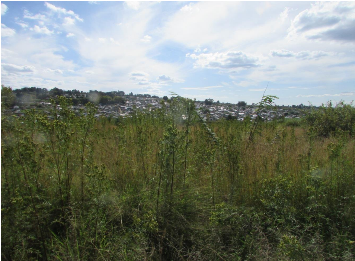
Figure 4: A view of a section of the area. Note the dense vegetation and the neighboring Informal Zandspruit residential settlement.

in the past it would have been largely disturbed or destroyed by recent historical agricultural and earlier development activities in the study and larger area around it.