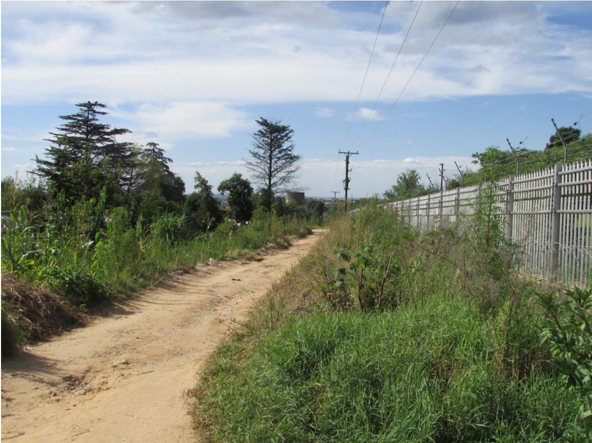
Figure 7: A section of the sewerline route follows existing roads and servitudes.