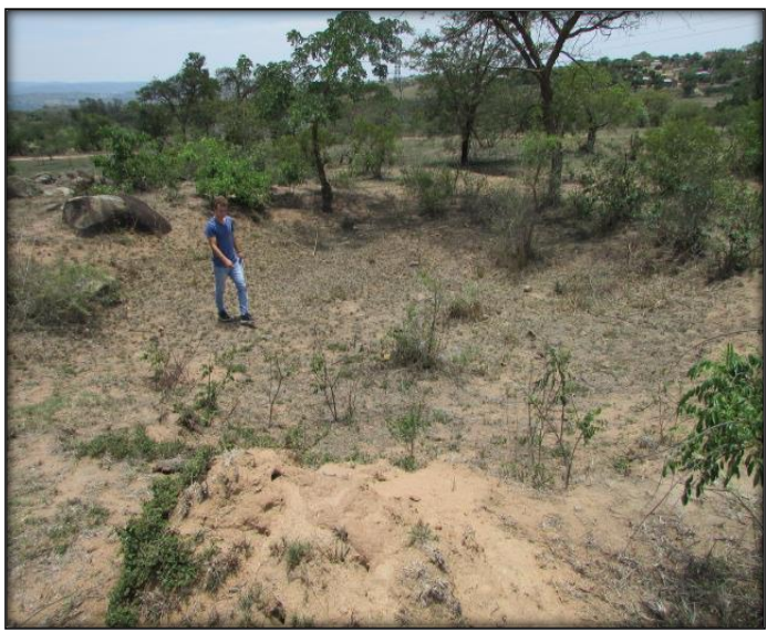
Figure 7: Some of the natural and man-made erosion in the area.