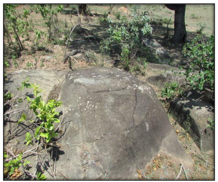
Figure18: More evidence of grinding on the rocky outcrop at Site 5.