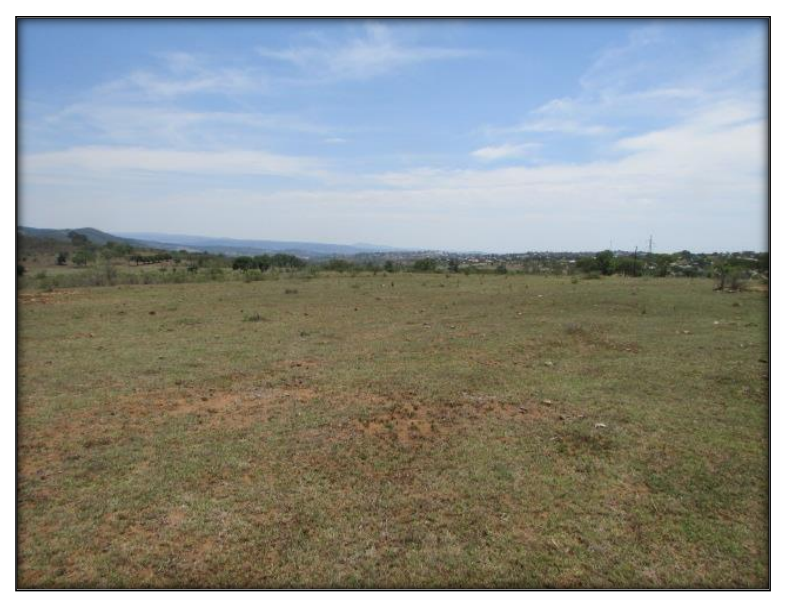
Figure 4: Another view of the area.