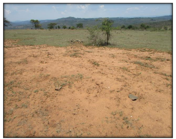
Figure 9: A view of the Site 2 midden/homestead area.