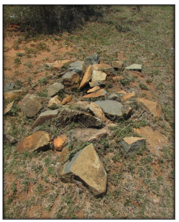
Figure 12: The stone cairn at Site 2.