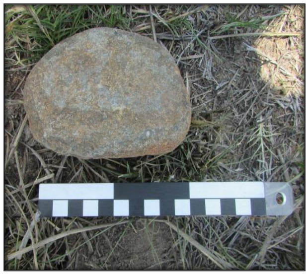
Figure 14: The upper grinder at Site 4.