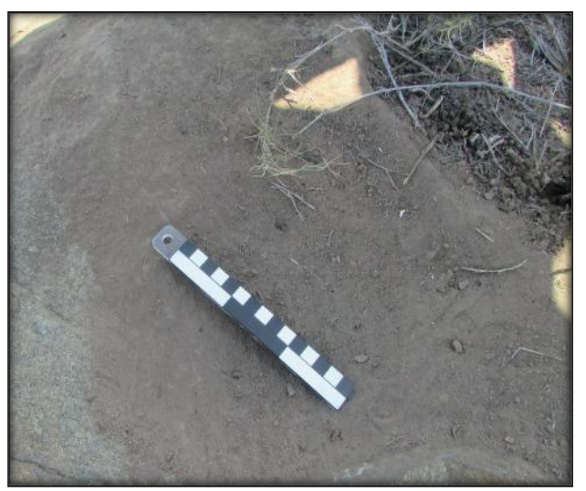
Figure 16: A large grinding hollow at Site 5.