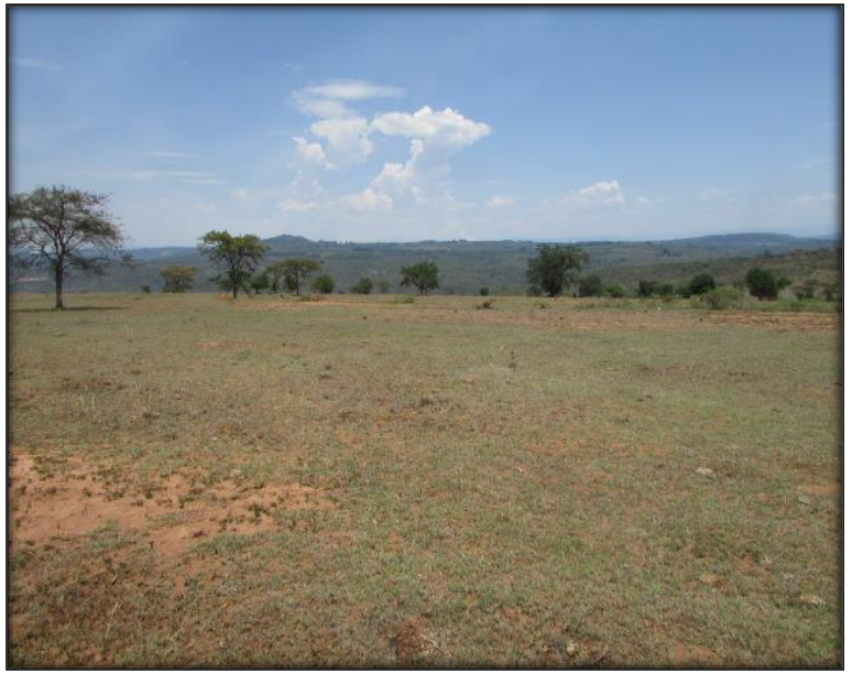
Figure 3: A general view of the area.