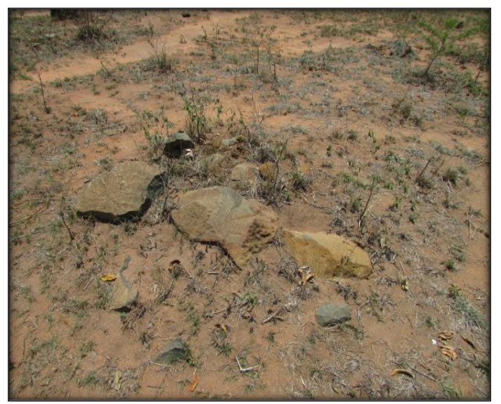
Figure 17: The stone cairn at Site 5. This is similar to the one at Site 2.