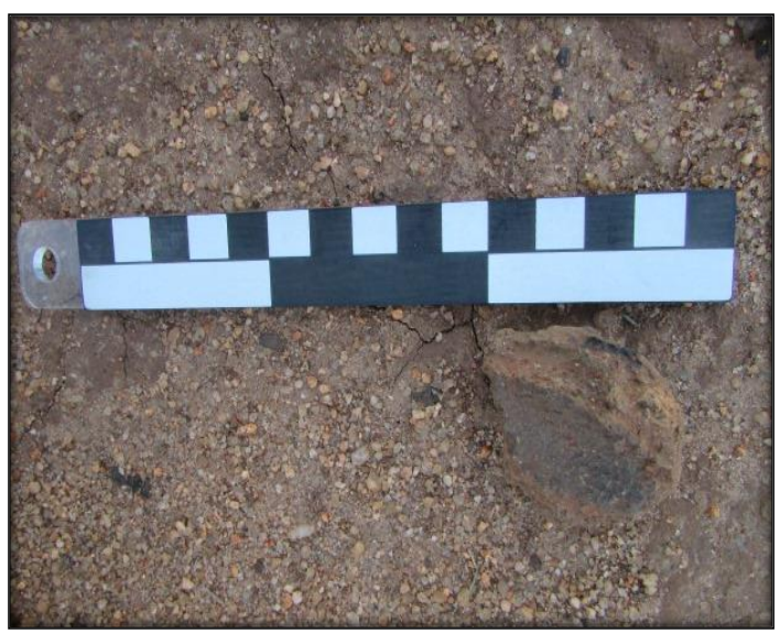
Figure 11: Piece of a clay blowpipe for a metal smelting furnace.