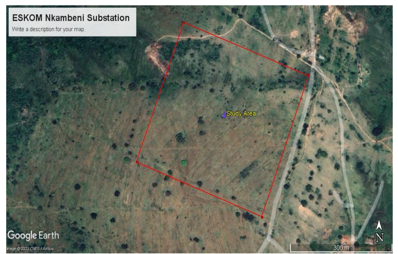
Figure 2: Closer view of study & development area footprint.