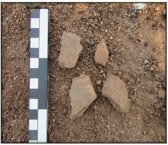
Figure 8: Undecorated pottery Site 1.

Mitigation : Archaeological investigations/excavations before destruction. SAHRA Permit. The implementation of a buffer zone of 20m around the site to keep it in situ and a Heritage Management Plan is recommended