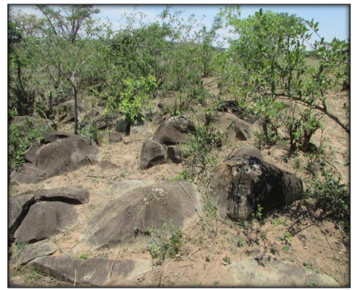
Figure 6: A low rocky ridge (granite) in the area.