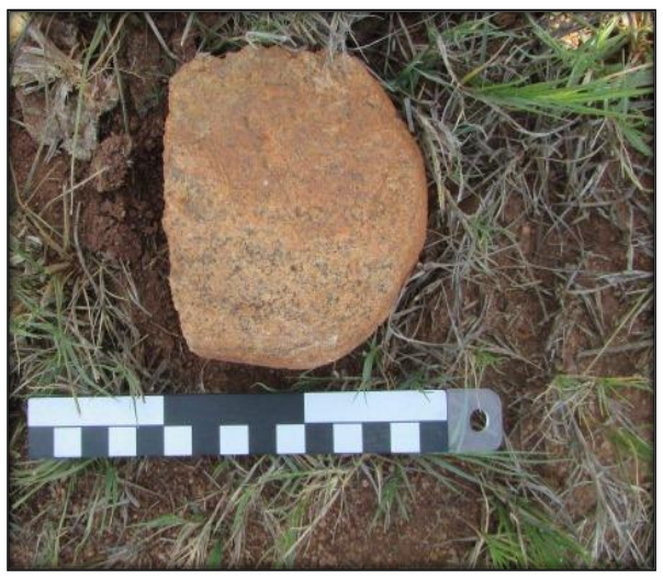
Figure 13: The upper grinder at Site 3.