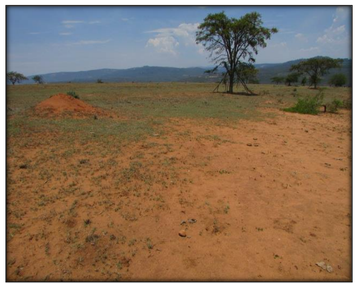
Figure 5: Another view showing the largely flat and open nature of the study area.