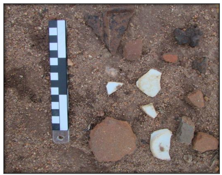
Figure 10: Pottery, metal, porcelain and glass at Site 2.