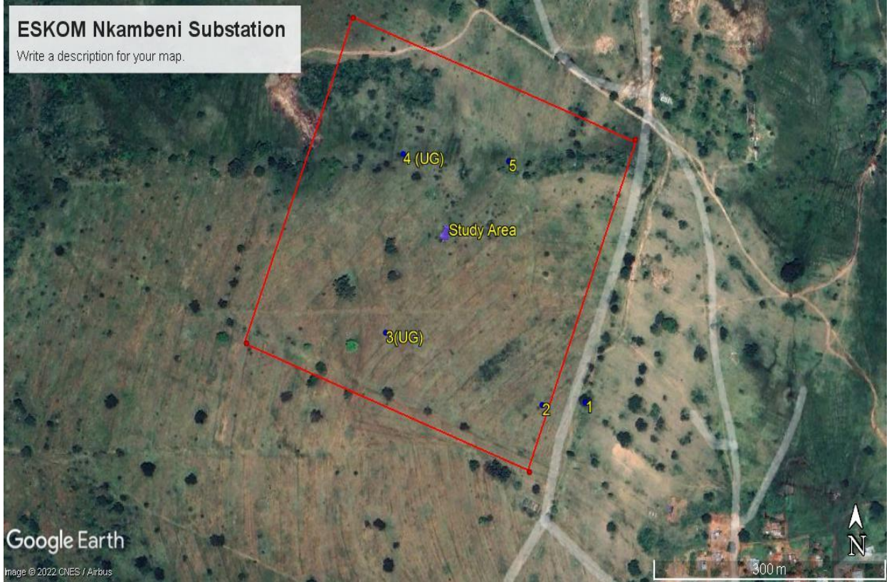
Fig.19: Aerial view showing the distribution & locations of the sites found in November 2018.

It should be noted that although all efforts are made to cover a total area during any assessment and therefore to identify all possible sites or features of cultural (archaeological and/or historical) heritage origin and significance, that there is always the possibility of something being missed. This will include low stone-packed or unmarked graves. This aspect should be kept in mind when development work commences and if any