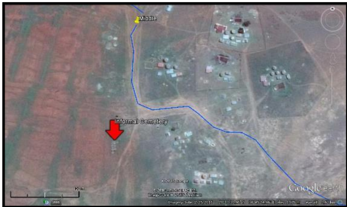
Figure 3. Google aerial photograph showing the location of a rural cemetery approximately 60m to the west of Igoqwana Road.