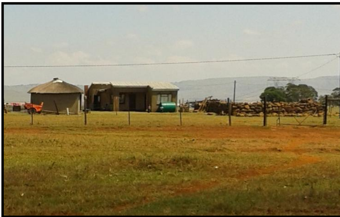
Figure 4. Although rural homesteads are situated adjacent to Igoqwana Road no associated graves occur less than 30m from the proposed road upgrade.