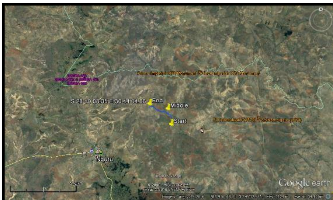
Figure 1: Google Earth Photograph showing the locality of Igoqwana Road and known heritage sites near Nqutu in northern KwaZulu-Natal.