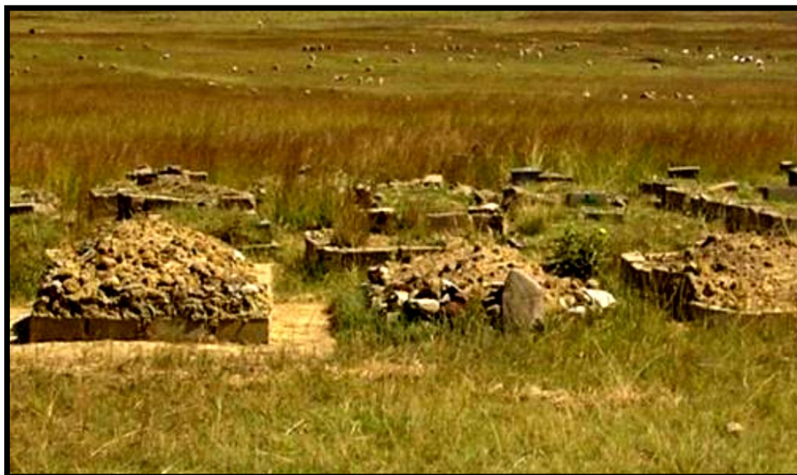
Figure 6. Photograph of rural cemetery that occurs approximately 60m to the west of Igoqwana Road.