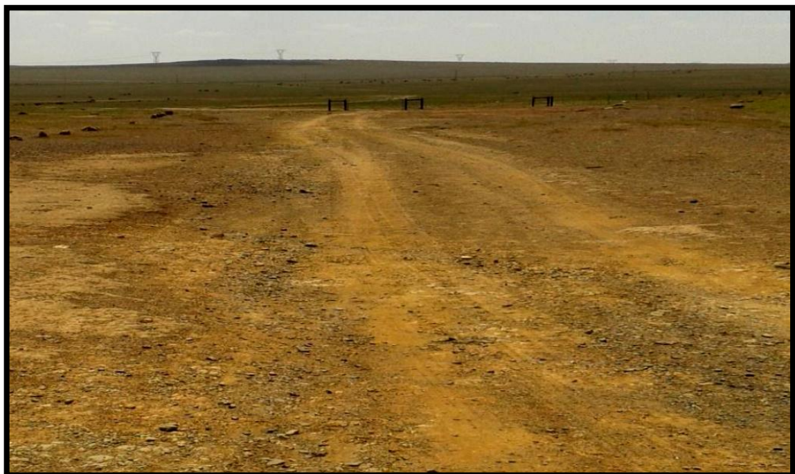
Figure 4. Photograph of the existing mud track also called Igoqwana Road.