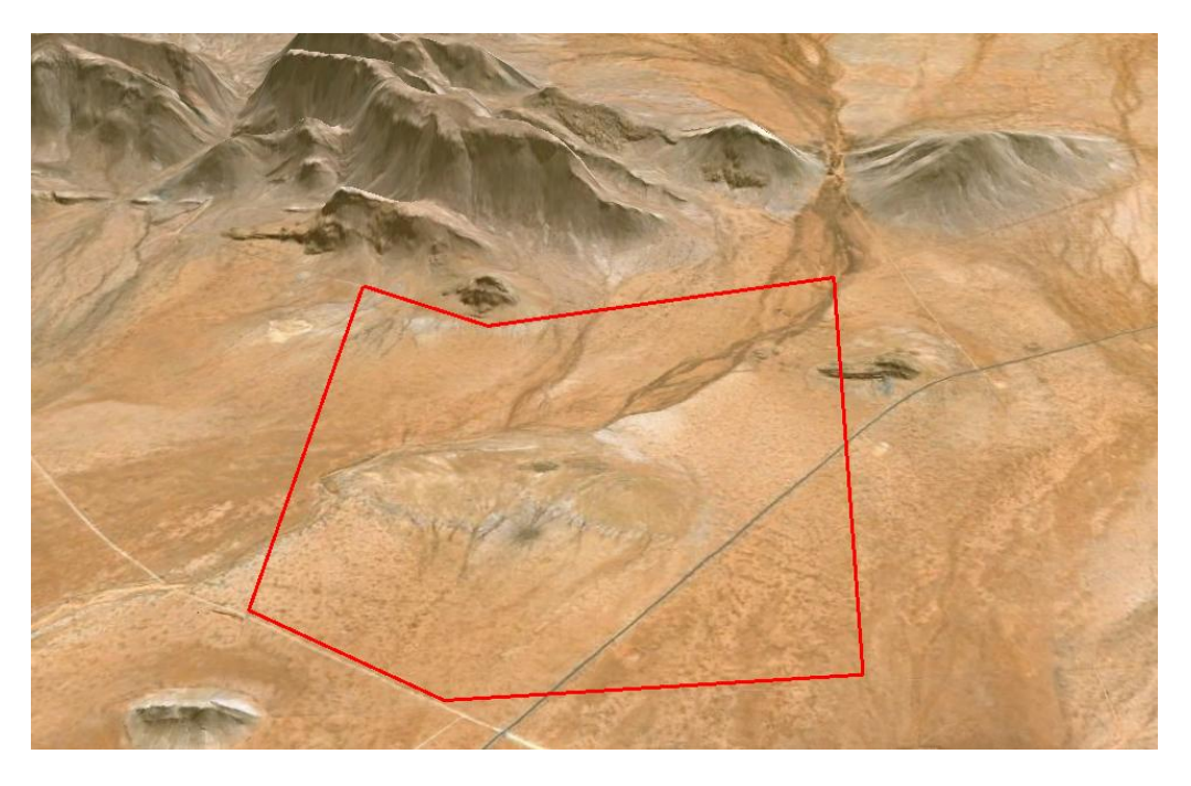
Figure 3. Simulated oblique view of the project area, looking north.