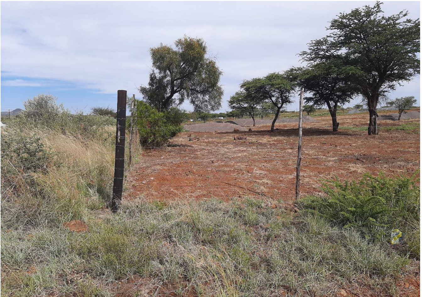
Figure 10: Facing northeast from 27°24'05.18"S 23°24'06.42"E.