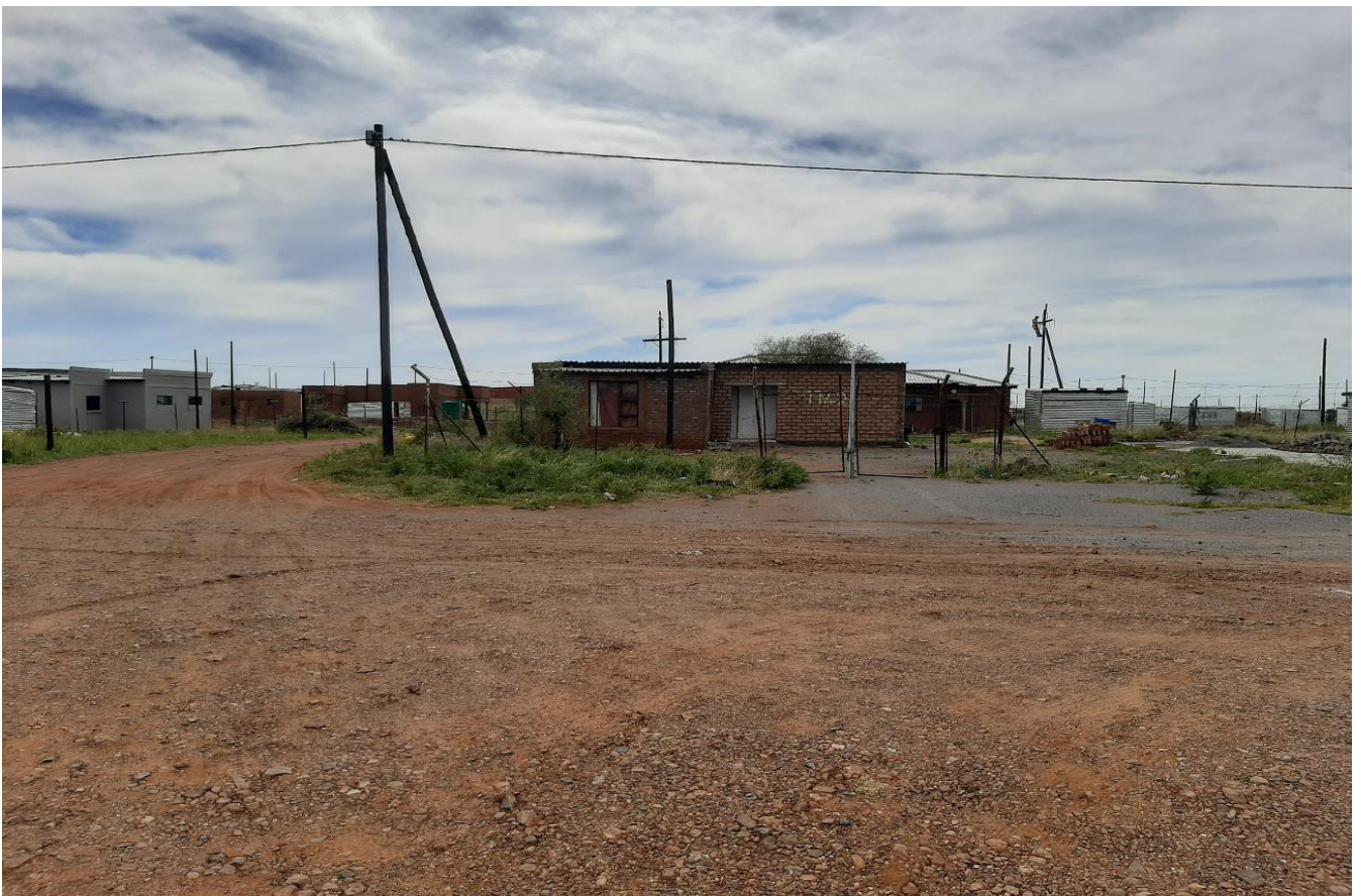
Figure 9: Facing east from 27^{\circ}22'12.62''\text{S} 23^{\circ}26'59.02''\text{E} .