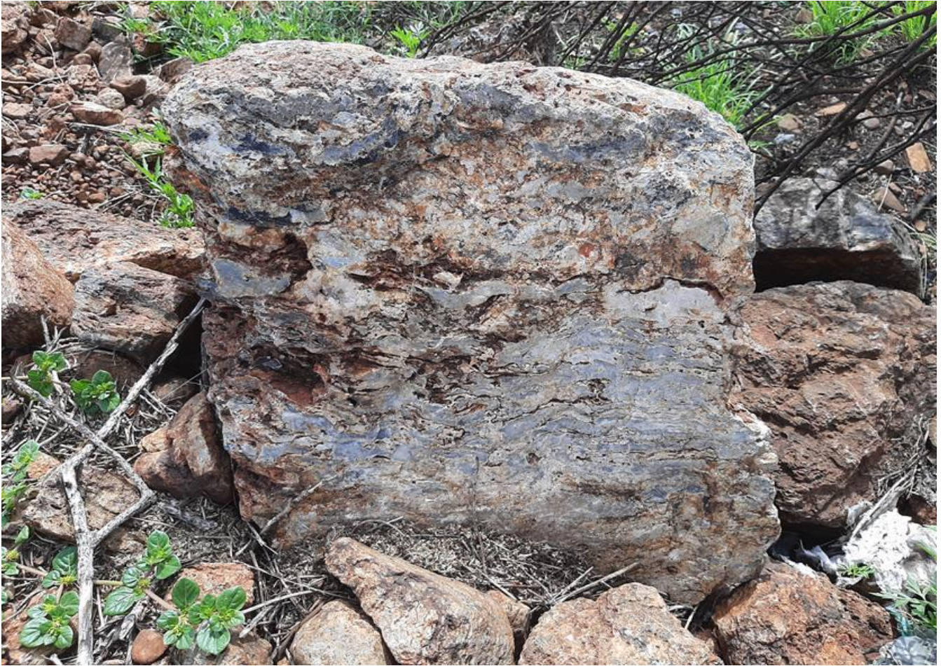
Figure 7: Figure 7: Ex situ block of dolomite and chert at 27°23'38.39"S 23°23'22.59"E.