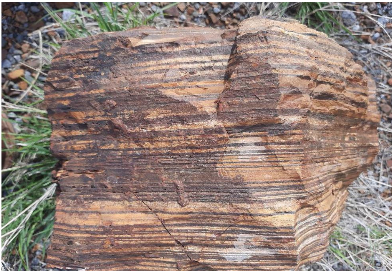
Figure 4: Ex situ banded ironstone rock 27°22'52.35"S 23°21'53.71"E.