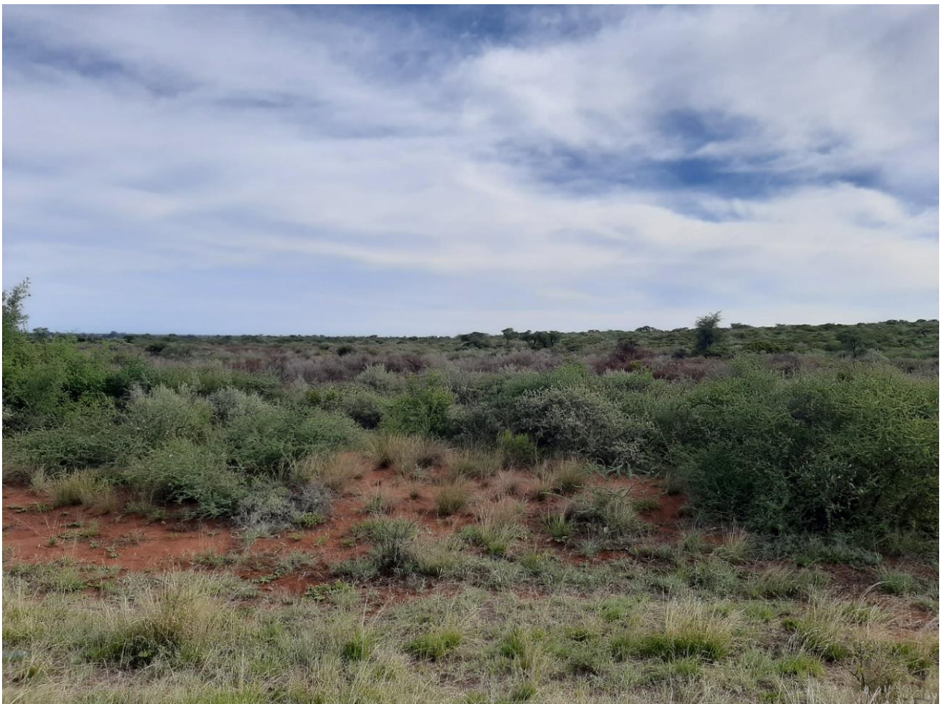
Figure 3: Facing north from 27°22'52.35"S 23°21'53.71"E.

The study site was visited on 12 December 2021. No paleontologically significant sites were discovered. None of the exposed rocks contained identifiable macroscopic palaeontological features.