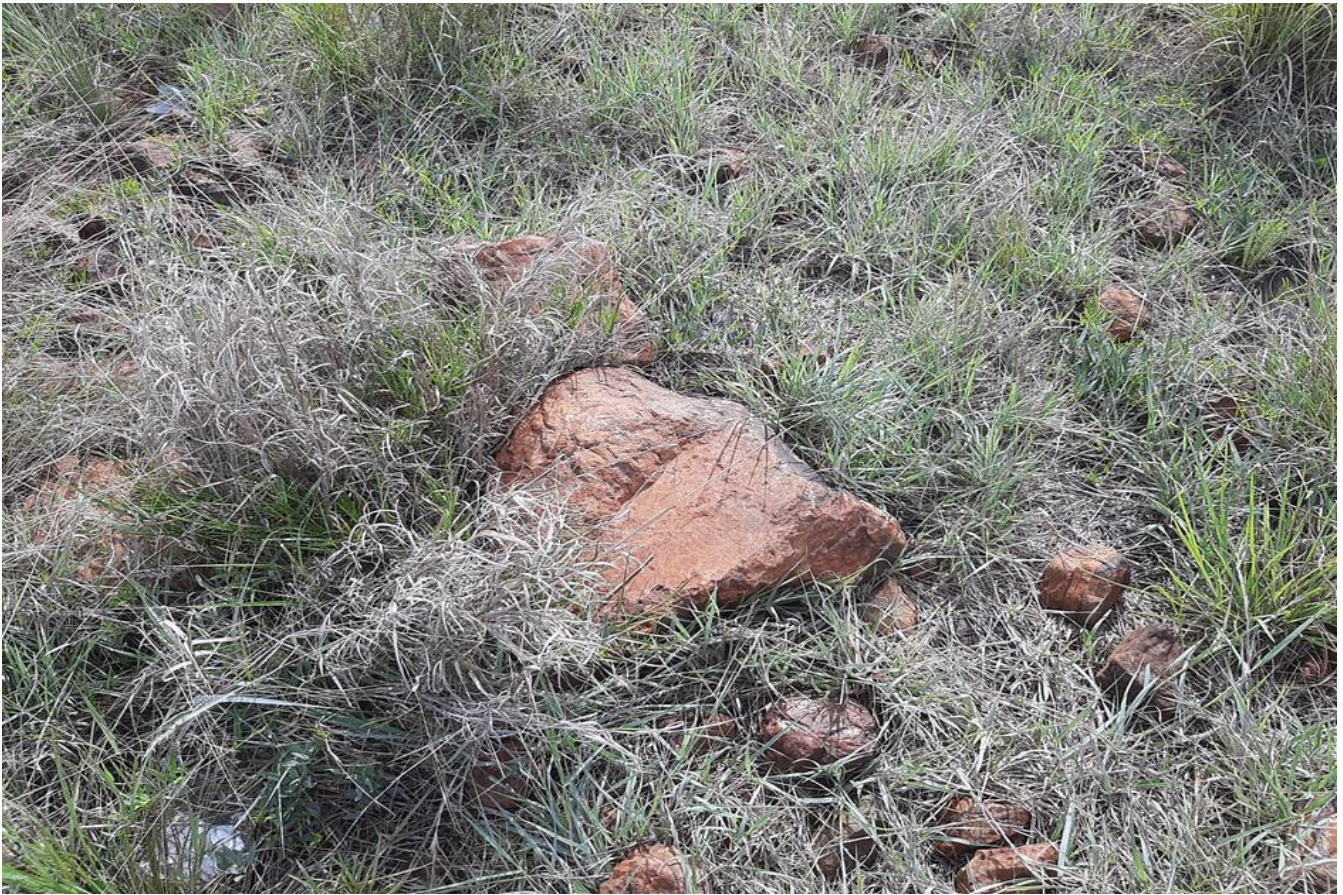
Figure 11: Ex situ block of banded ironstone at 27°24'05.18"S 23°24'06.42"E.