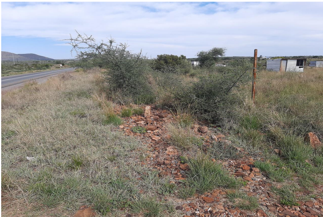
Figure 8: Facing northwest from 27^{\circ}23'46.07''\text{S} 23^{\circ}23'35.16''\text{E} .