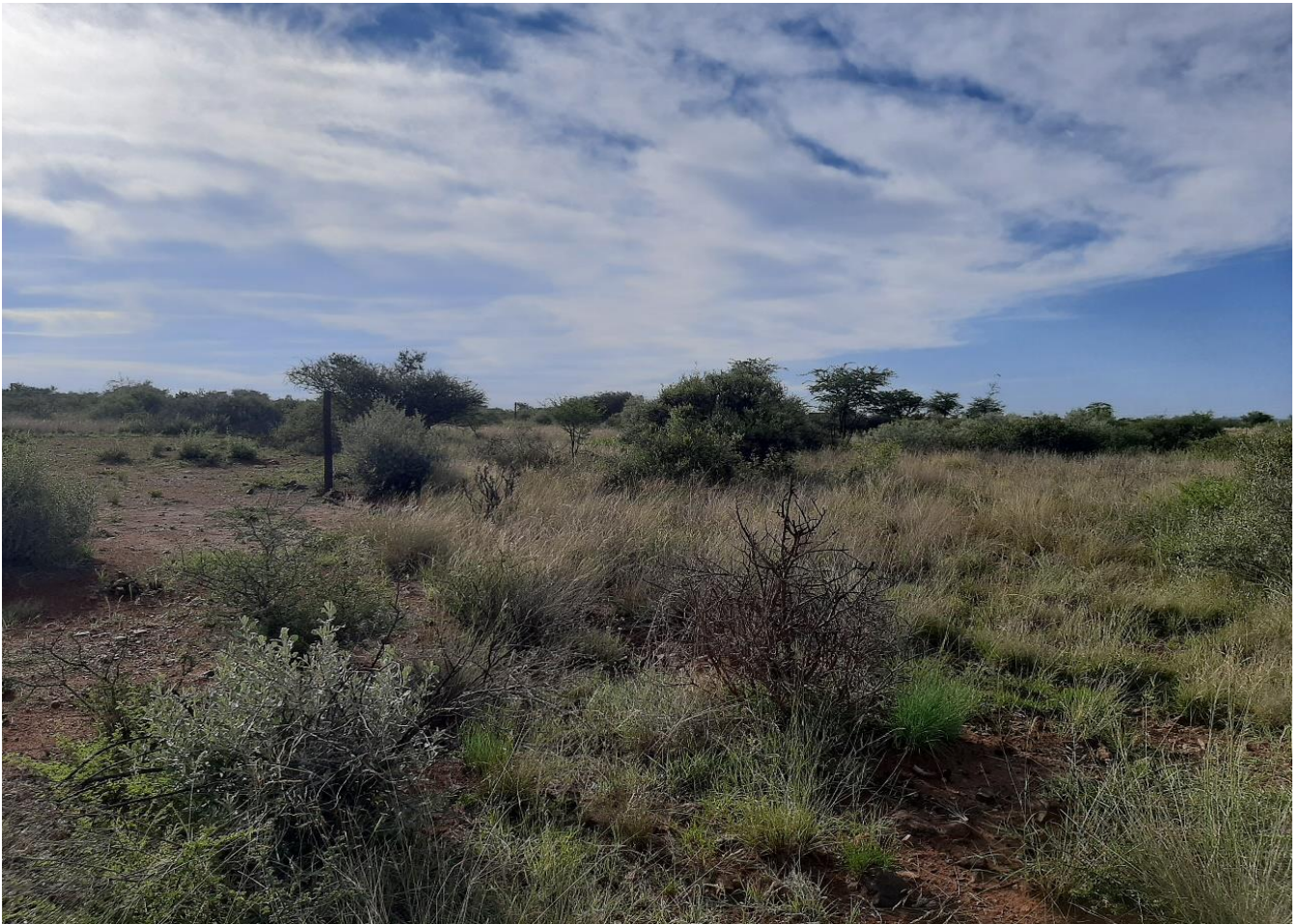
Figure 12: Facing northeast from 27^{\circ}23'48.26''\text{S} 23^{\circ}24'16.46''\text{E} .