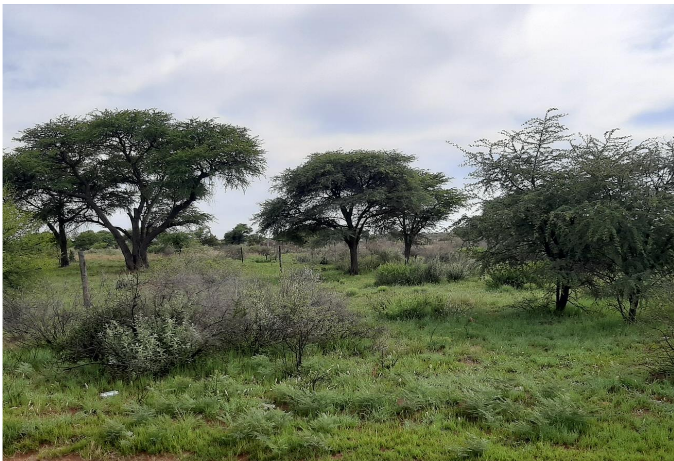
Figure 9: Facing northeast from 27^{\circ}23'52.86''\text{S} 23^{\circ}23'46.28''\text{E} .