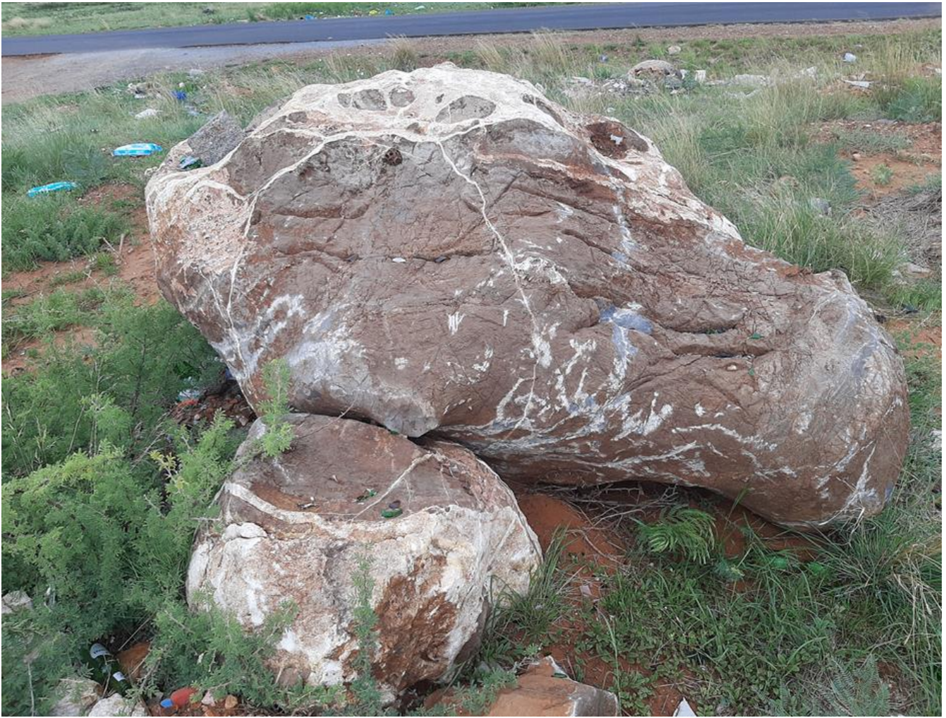
Figure 10: Ex situ block of dolomite at 27°24'05.18"S 23°26'59.02"E.