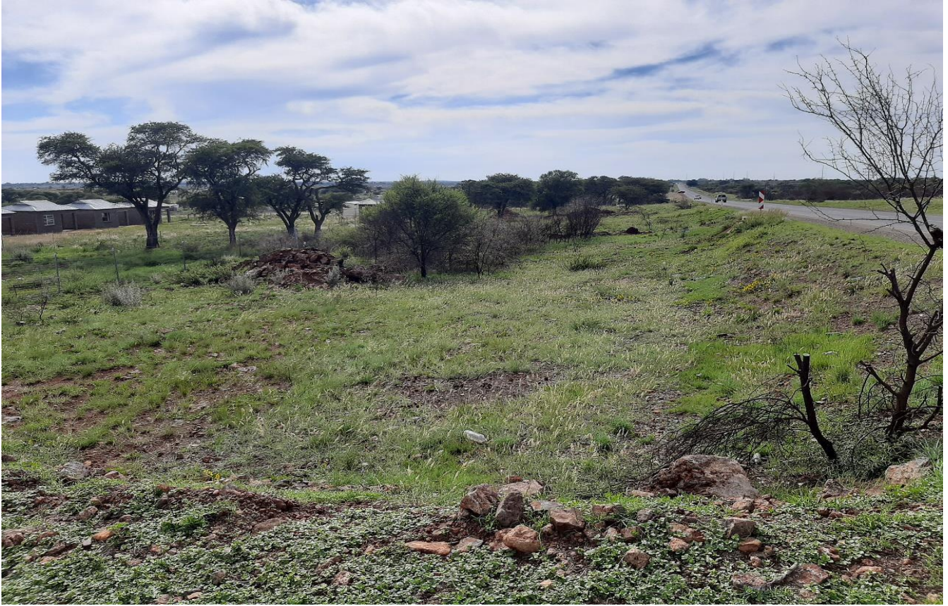
Figure 6: acing east from 27°23'38.39"S 23°23'22.59"E.