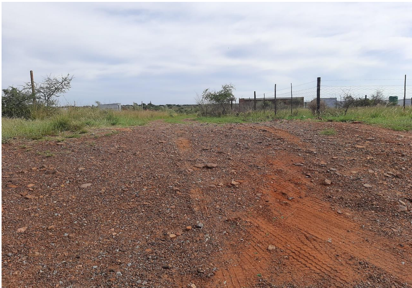
Figure 5: Facing northeast from 27°23'32.33"S 23°23'12.02"E.