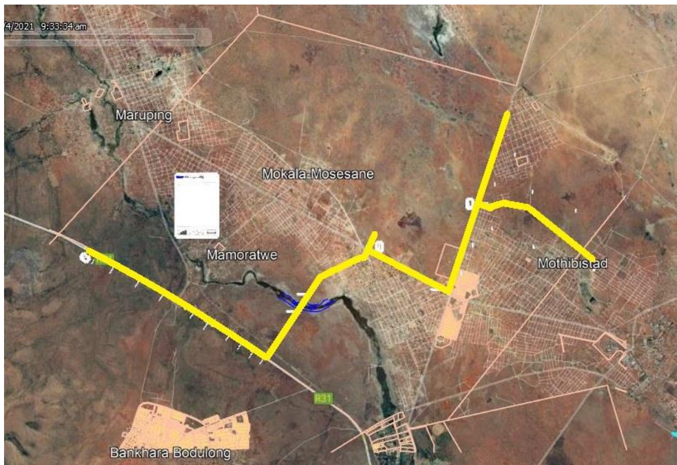
Figure 1: Figure 1: Google Earth photo indicating study site (yellow lines).

The study site is situated north of Kuruman in the Northern Cape. The study has been developed as a residential area with smallholdings and natural vegetation along the western and southern sections. The relevant literature and geological maps have been studied and the site was visited on 12 December 2021 for a Palaeontological Impact Assessment