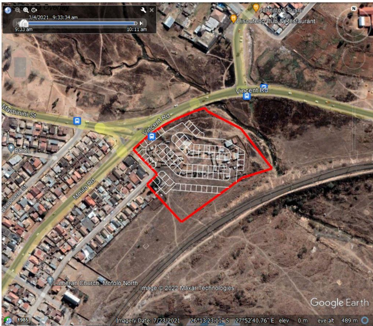
Figure 1: Google Earth photo indicating study site (red polygon).

The study site is situated in Mofolo, Soweto southwest of Johannesburg CBD, in a field adjacent to formal housing, between Vincent Road and railway tracks. Informal living structures have been erected at the study site.