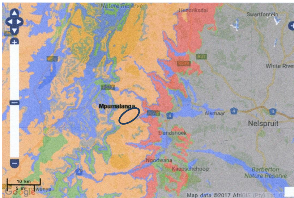
Figure 3: SAHRIS palaeosensitivity map. The proposed site for the dam wall is within the oval outline. Colours indicate the following degrees of sensitivity: red = very highly sensitive; orange/yellow = high; green = moderate; blue = low; grey = insignificant/zero.

There are also no records of fossils from the Quaternary alluvium in this region.