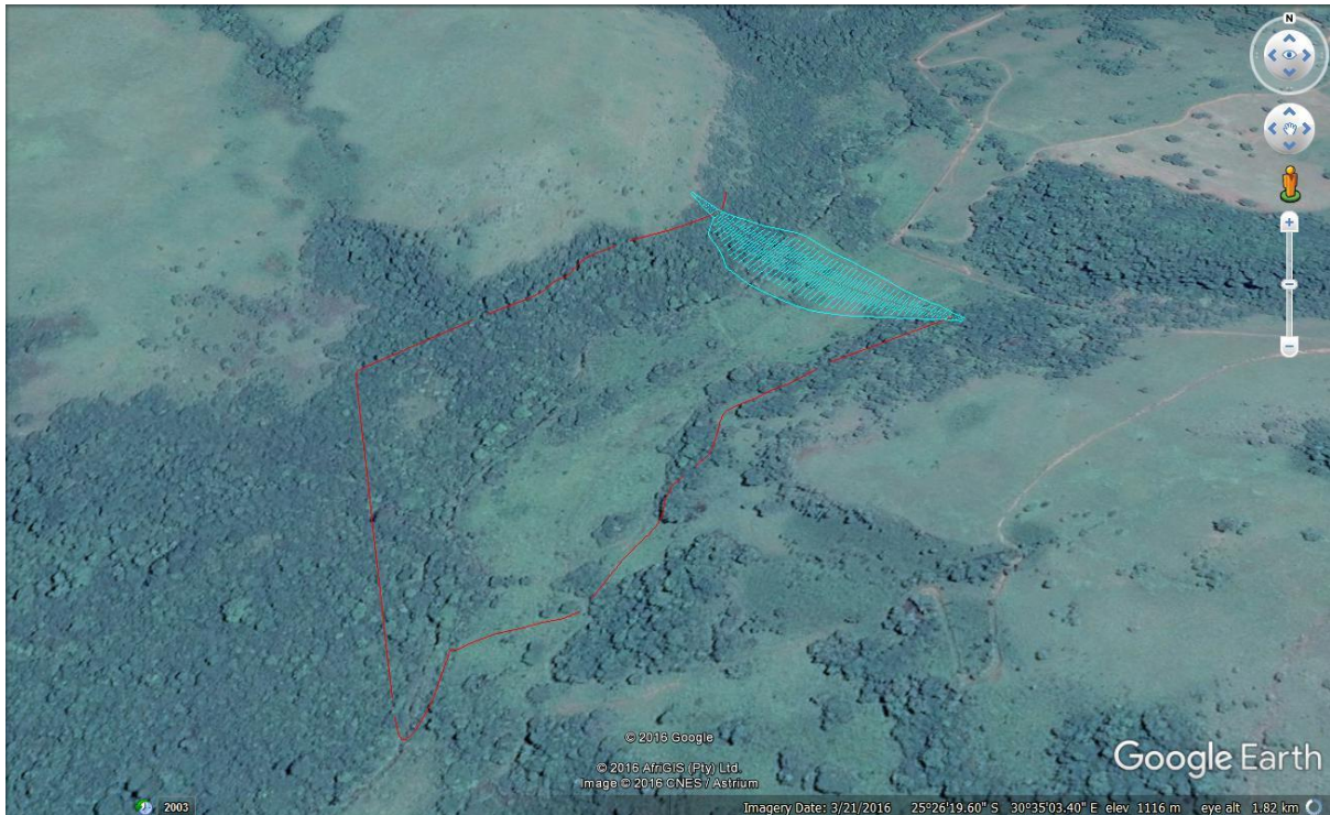
Figure 1: Locality of proposed dam wall (blue) and expected water level of the dam (red) on the farm Bruintjieslaagte 465JT, Schoemanskloof Valley, about 40km west of Nelspruit.