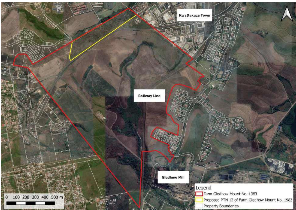
Figure 2: Annotated Aerial map to show the boundary of the proposed Gledhow Farm with retail site within the yellow outline.