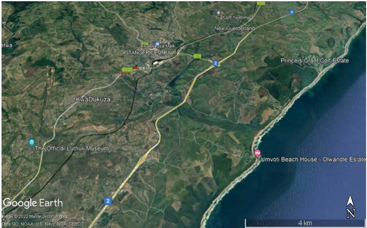
Figure 1: Google Earth map of the general area to show the relative land marks. The red polygon indicates the proposed Gledhow Farm retail site.