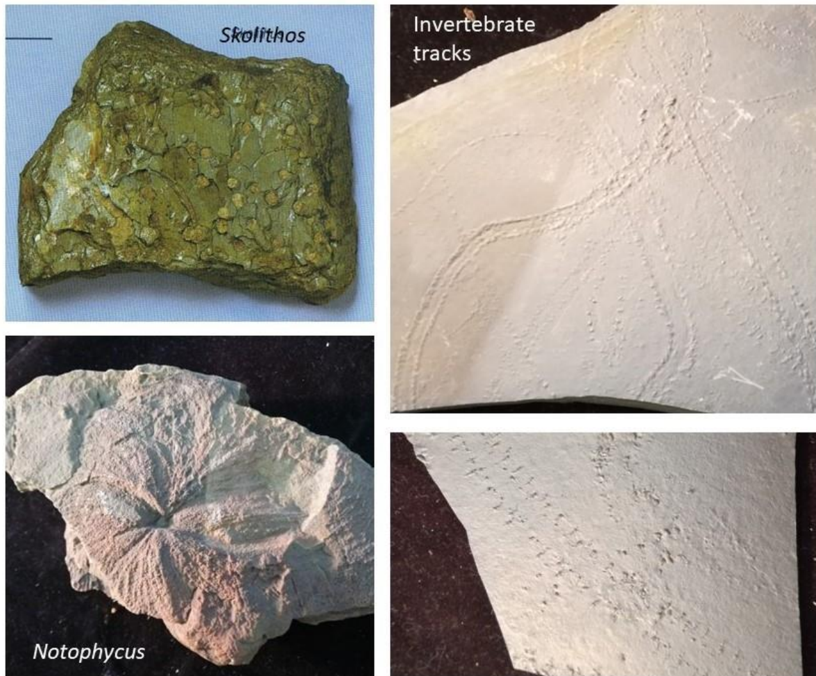
Figure 4: Photographs of trace fossils from the Pietermaritzburg Formation.