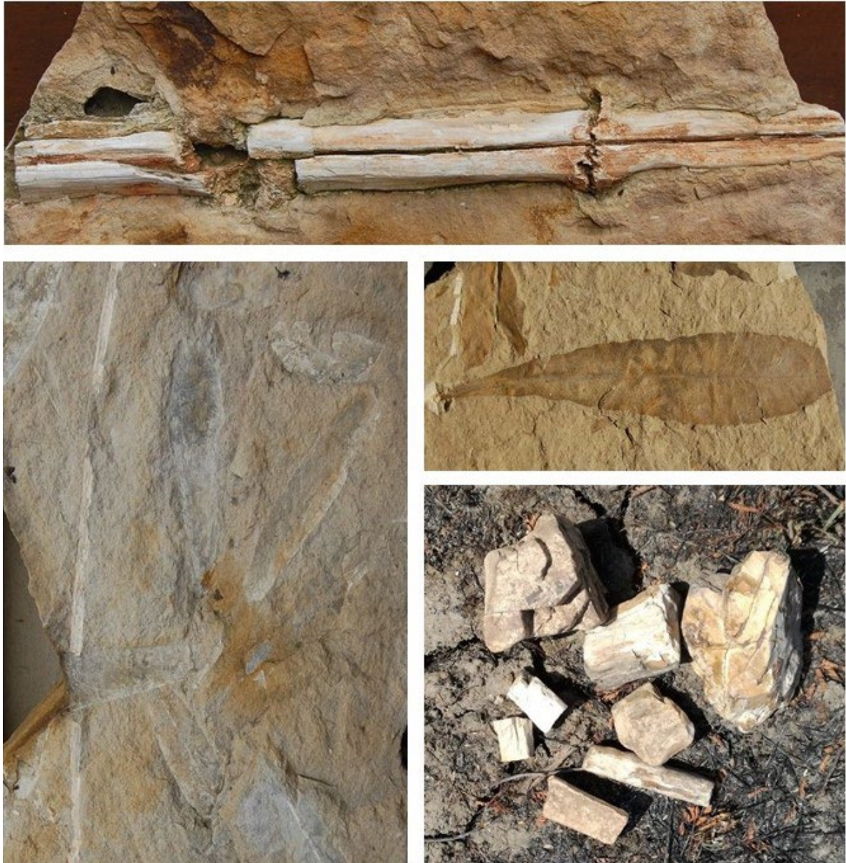
Figure 5: Photographs of fossil plants of the early Glossopteris flora that occur in the Dwyka Group sediments in north western South Africa.