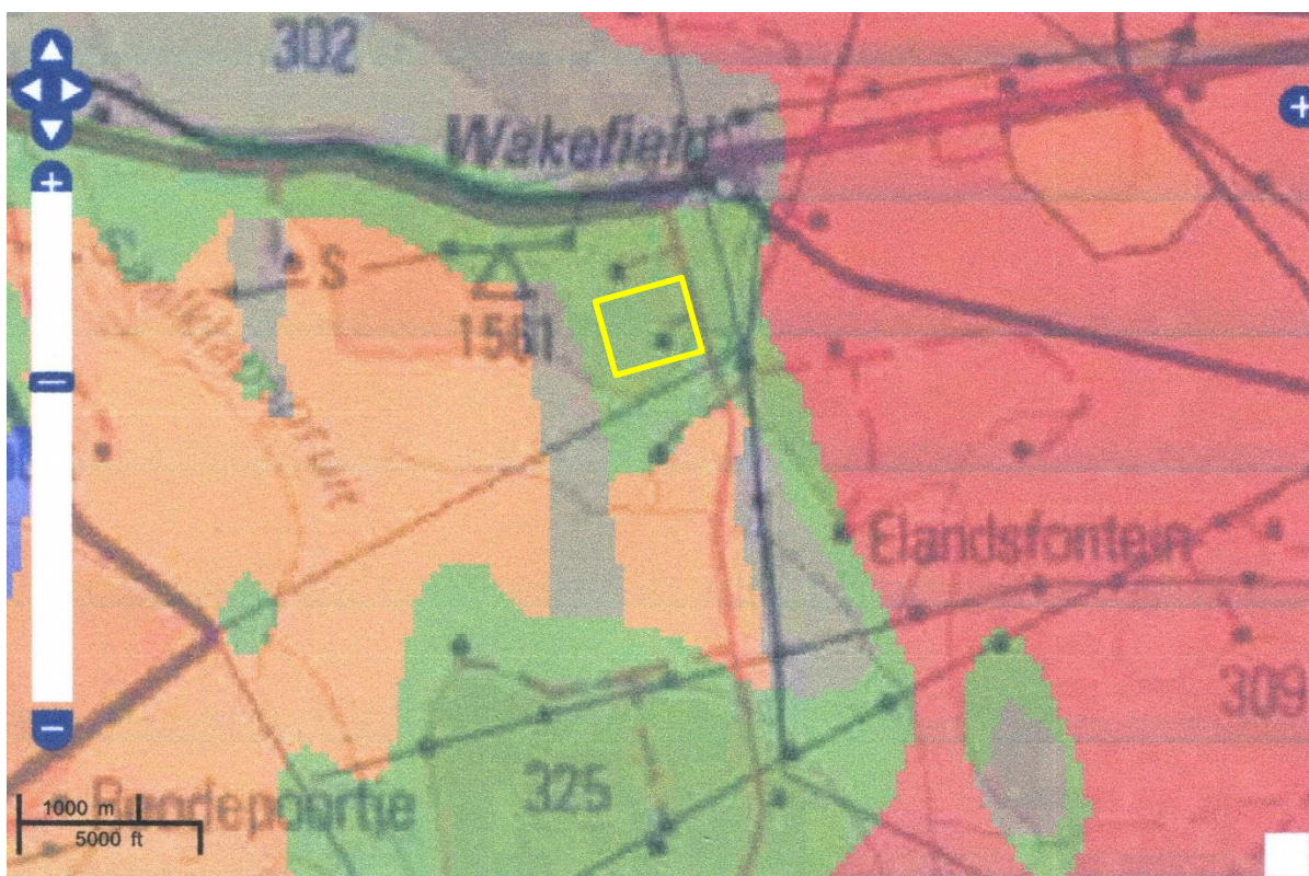
Figure 4: SAHRIS palaeosensitivity map for the site for the proposed cemetery shown within the yellow rectangle. Background colours indicate the following degrees of sensitivity: red = very highly sensitive; orange/yellow = high; green = moderate; blue = low; grey = insignificant/zero.