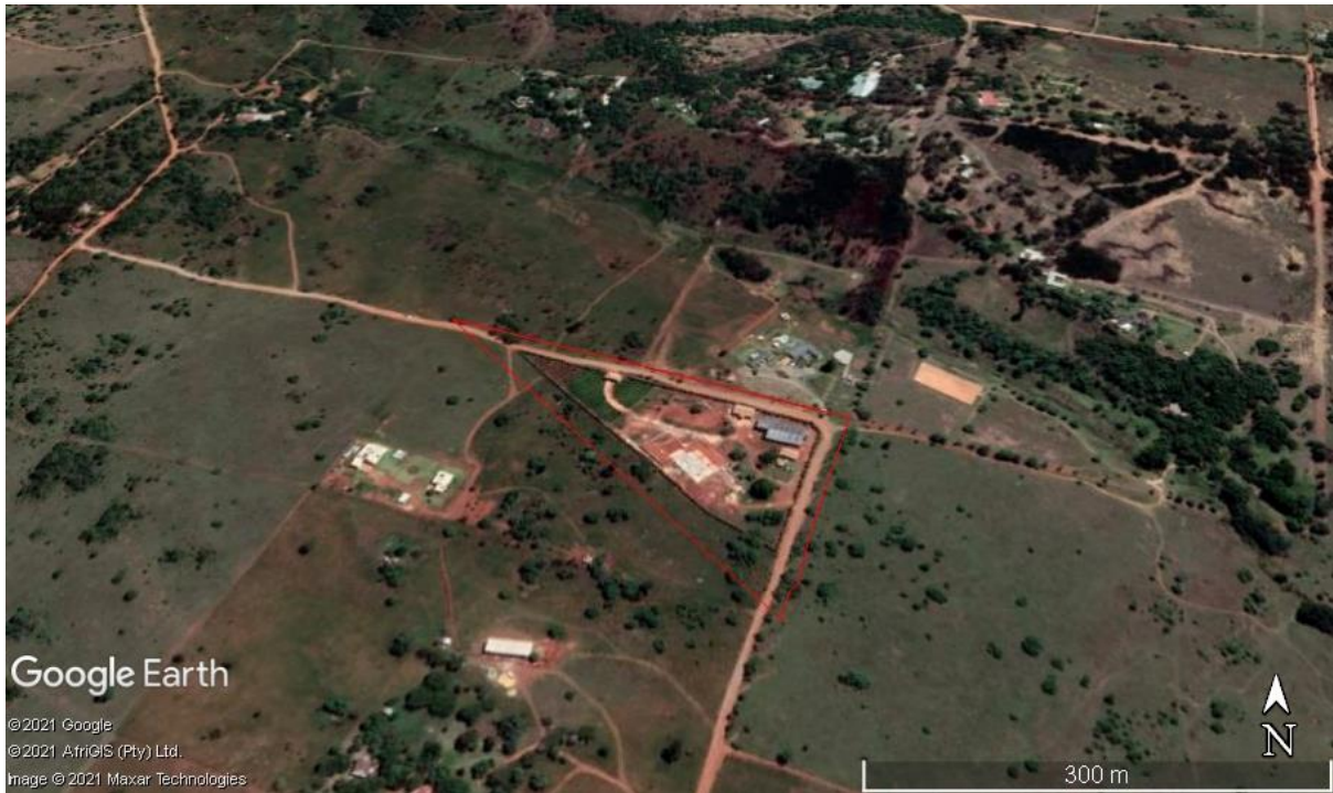
Figure 1: Google Earth map of the existing development on Portion 1071 (a portion of Portion 158) of Farm Zwavelpoort 373 JR, Tshwane Metropolitan Municipality. The site shown by the red outline.