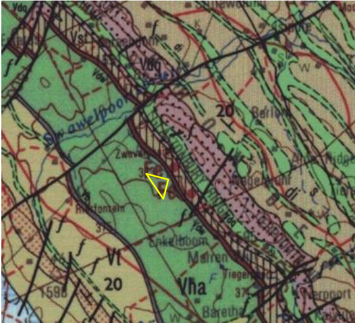
Figure 3: Geological map of the area around the Farm Zwavelpoort 373 JR. The location of the existing project is indicated within the yellow triangle. Abbreviations of the rock types are explained in Table 2. Map enlarged from the Geological Survey 1: 250 000 map 2528 Pretoria.