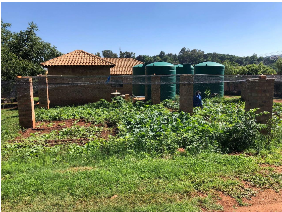
Figure 2: Part of the existing infrastructure for Branscombe on Farm Zwavelpoort.