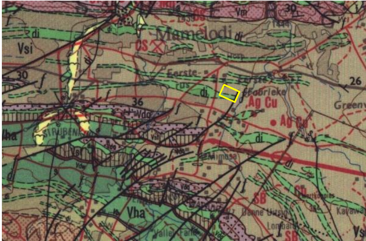
Figure 2: Geological map of the area around the Equestria, east of Pretoria, for the proposed Furrow Road residential development, shown in within the yellow outline. Abbreviations are explained in Table 2. Map enlarged from the Geological Survey 1: 250 000 map 2528 Pretoria.