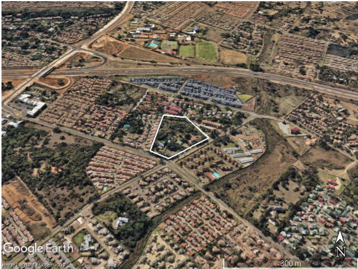
Figure 1: Google Earth map of the proposed Equestria Ext 284 residential development on Furrow Road with the site as indicated.