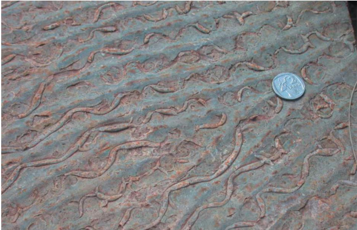
Figure 5: Vermiform trace fossil Manchuriophycus from a bedding plane in the Magaliesberg Formation east of Pretoria. Figure taken from Bosch and Eriksson (2017; Fig 7).