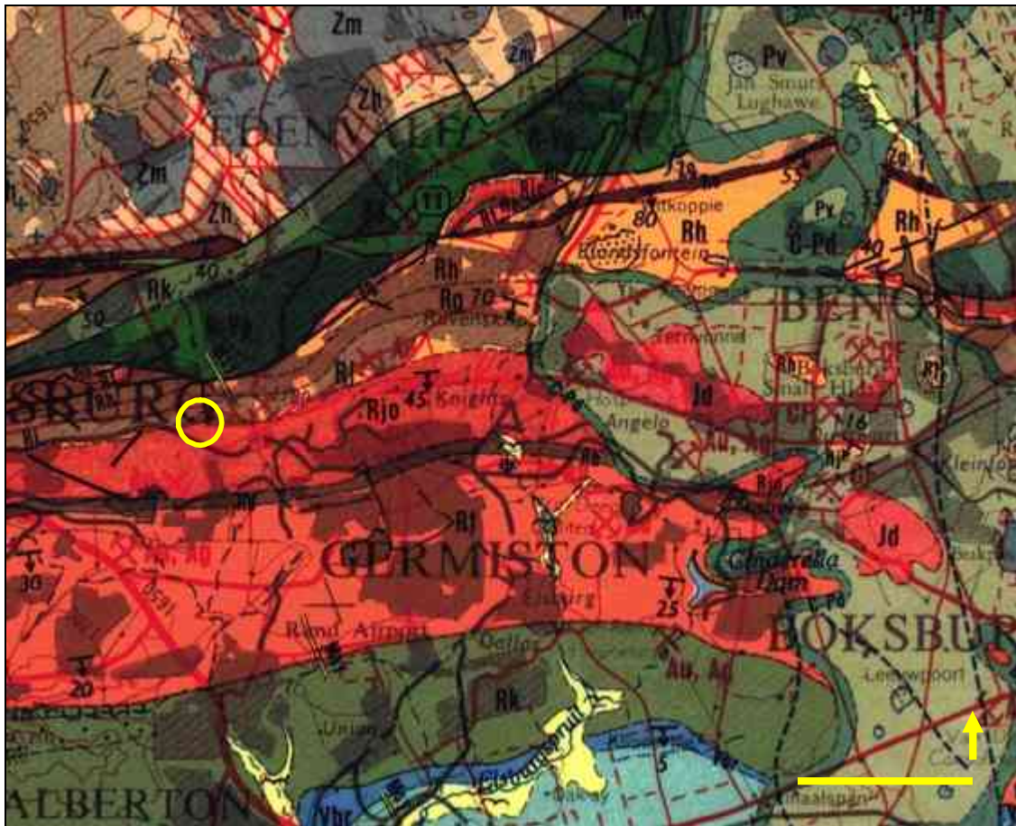
Figure 1. Extract from 1: 250 000 geology sheet 2628 East Rand (Council for Geoscience, Pretoria) showing the approximate location of the Jupiter Extension 8 study site (yellow circle). The site is largely underlain by south-dipping fluvial quartzites of the Johannesburg Subgroup (Central Rand Group, Witwatersrand Supergroup) of Archaean age (Rjo, red) as well as reworked mine tailings at surface. Scale bar = 4 km. Arrow points to North.