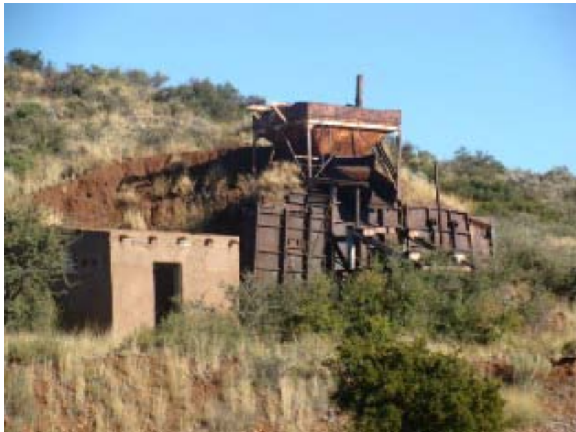
Site 1: Ore crushing facility