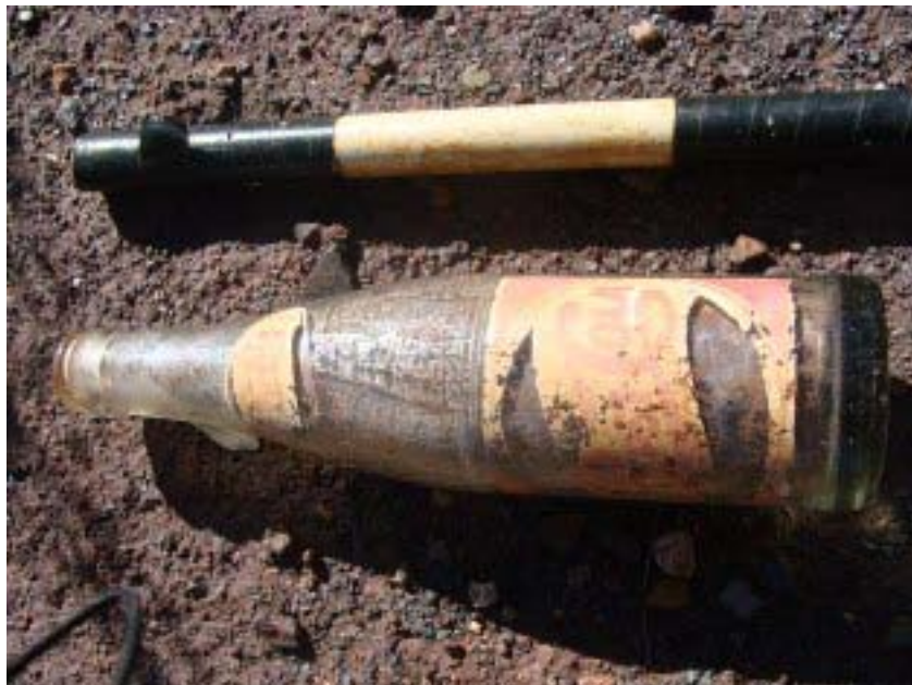
Site 4: Old Pepsi bottle