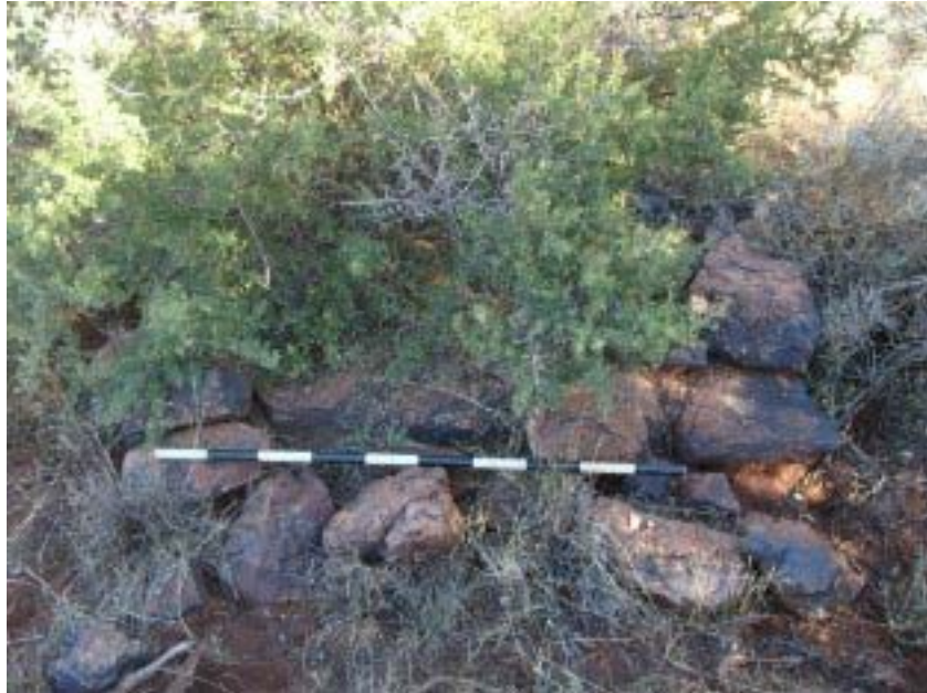
Site 3: Possible grave