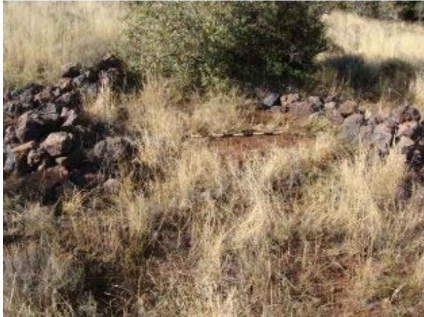
Site 2: One of the stone walled features on Site 2