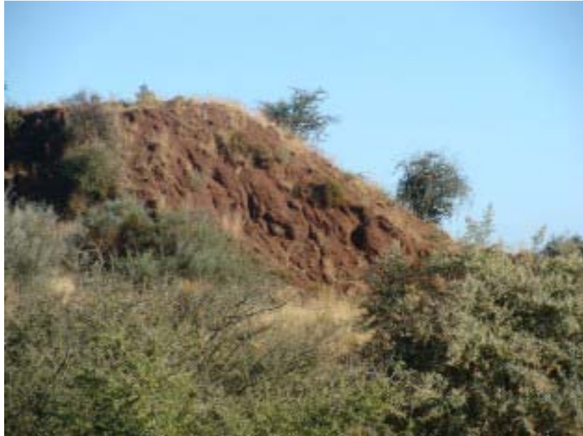
Site 1: Ore dump