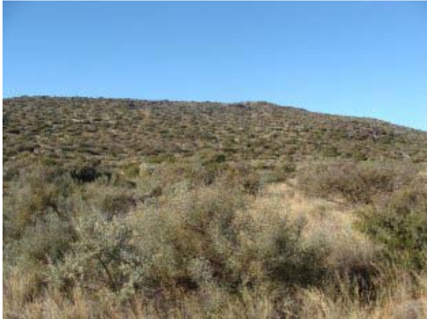
Figure 2: General view of undisturbed portions of the survey area