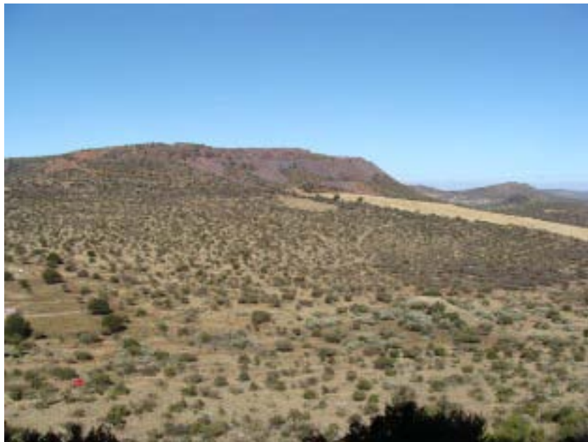
Figure 6: View of the area from one of the possible shelters. The old SAMANCOR mining operations on Kapstewel is visible in the distance