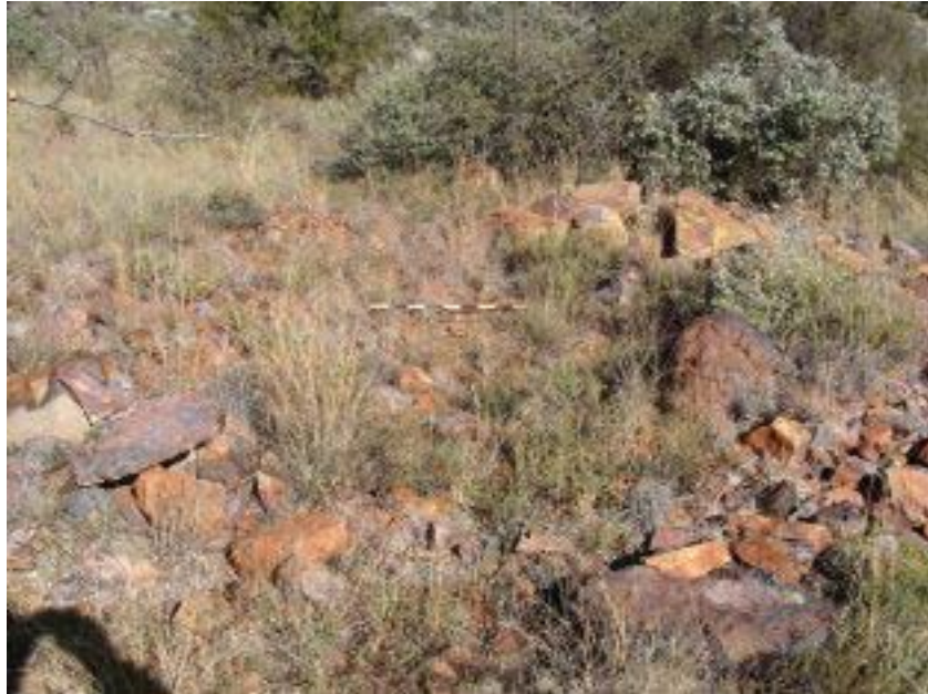
Site 4: One of the circular depressions on the site