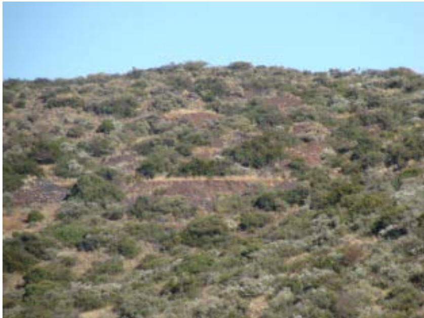
Figure 3: Another view of the survey area – note the various prospecting holes and opencast mining areas