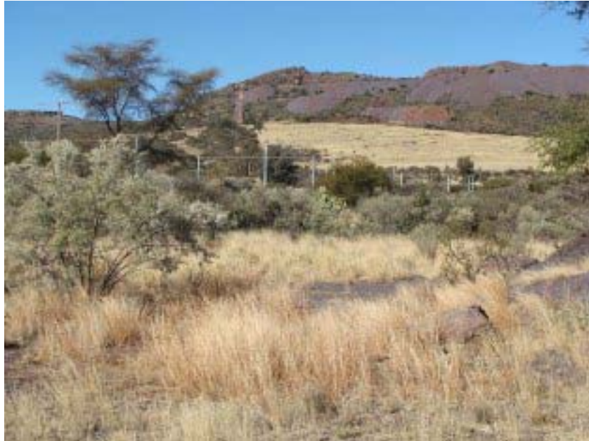
Figure 4: View of main opencast mining area – old SAMANCOR Manganore mine