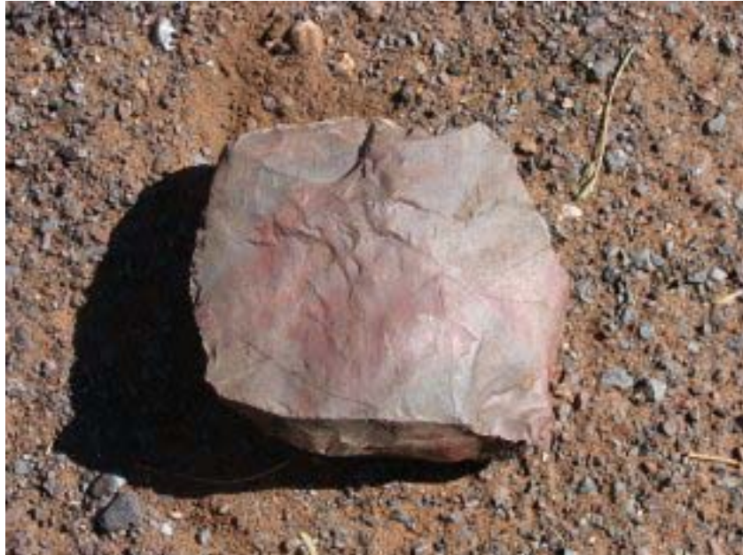
Figure 5: A Stone Age flake-tool from the area