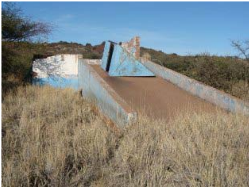
Site 1: Another view of the same structure