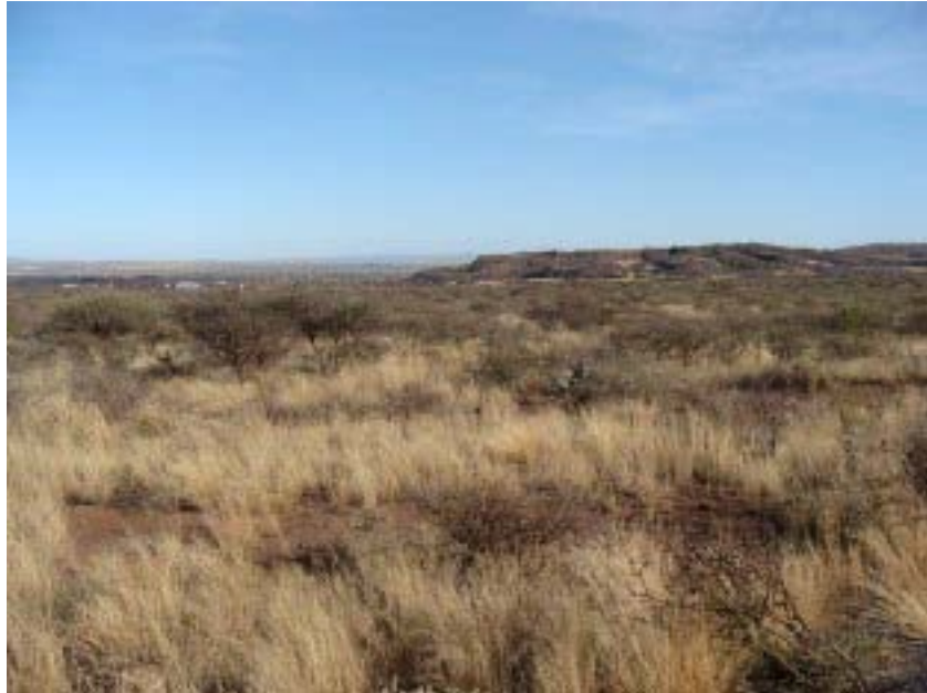
Figure 2: General view of the survey area, showing a relatively undisturbed portion of the area