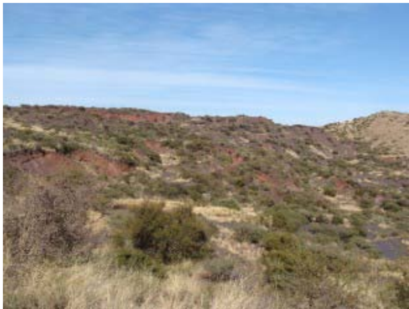
Figure 3: Another view, showing the large-scale destruction caused by earlier opencast mining