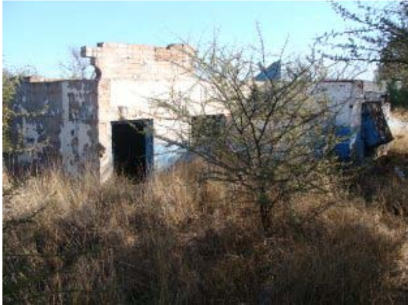
Site 1: Mining related structure in the area