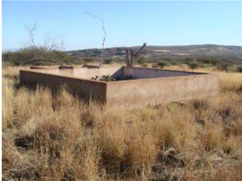
Site 1: Another mining structure on the site