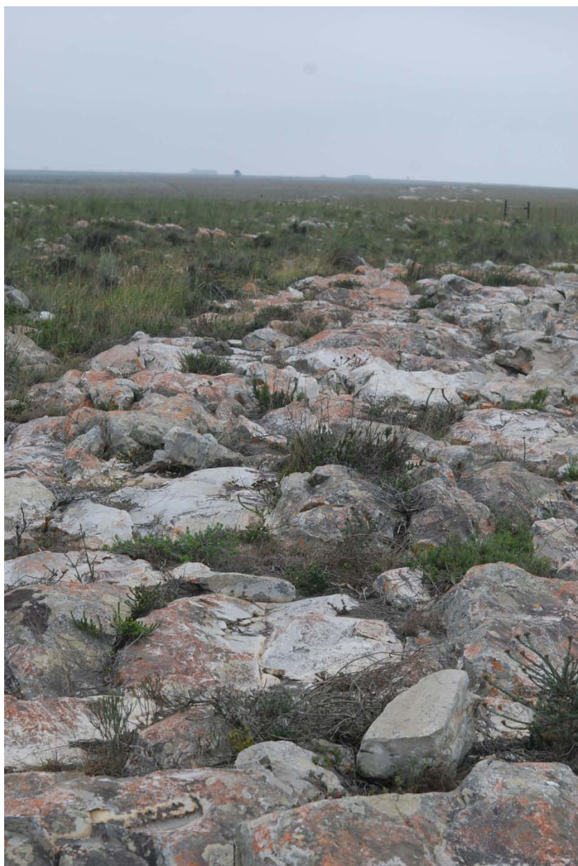
Fig.3. Peninsular Formation exposed in the south of the study area.

In the south of the area, both proposed routes are initially situated across strata of the peninsular formation. Good outcrops of Peninsular Formation top the ridge in the south of the study area, which has formed due to the resilient response of this unit to erosion. The Peninsular Formation has only ever been known to produce rare trace fossils. No fresh outcrop occurs on this ridge. And no palaeontological material was found.