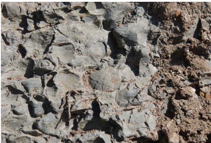
Fig. 7. Brachiopod fossils in the Baviaanskloof Formation