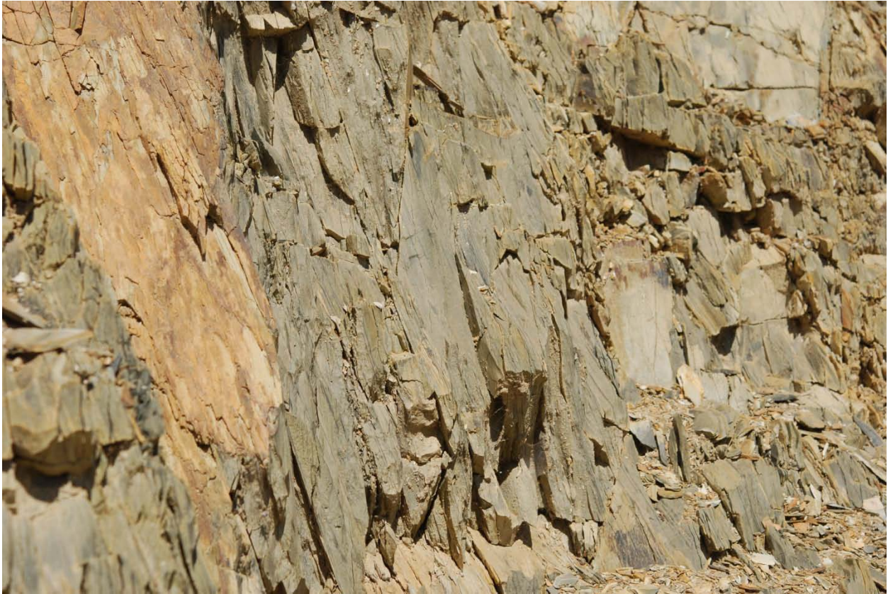
Fig. 10. Metamorphic cleavage overprinting bedding in Bokkeveld shales of the Ceres Subgroup

The middle portion of the study area consists of shales of the Bokkeveld group. These have been metamorphosed and often (though not invariably) cross jointed during the formation of the Cape Fold belt approximately 300 million years ago. Although in some areas, shale could be split along original bedding, and although bioturbation was observed, no fossils were located in the Bokkeveld Group during this survey.