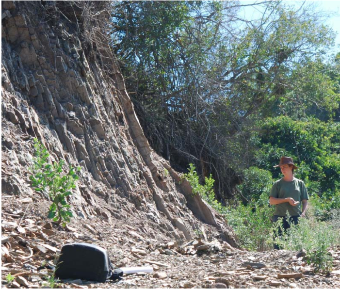
Fig.6. Outcrop of the Baviaanskloof Formation

This steeper topography, which was cut more recently than the formation of the coastal plain, facilitates outcrop of the Baviaanskloof Formation, which stratigraphically overlies the Skuurwehoek Formation. The Baviaanskloof Formation was found during this survey to be locally (unexpectedly) rich in palaeontological material, including fossil invertebrates and trace fossils. Invertebrate fossils noted included brachiopods, bivalves, tentaculitids and trilobite fragments. Important new fossil localities were discovered in close proximity to the more easterly route.