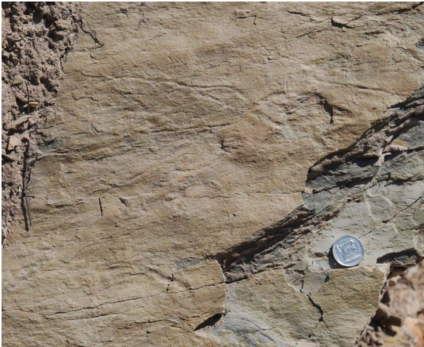
Fig. 9. Trace fossils on rippled surface in the Bavianskloof Formation.