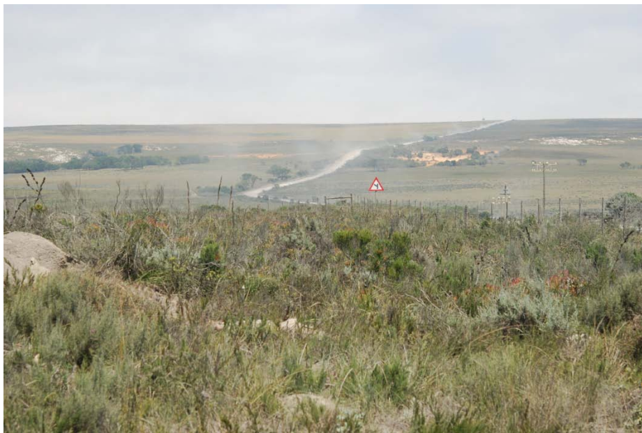
Fig. 4. Looking southwards over deeply weathered valley formed by erosion of Goudini Fm.

Moving northwards both transmission line routes pass over the Cedarberg and Goudini Formations. Due to their less resilient nature, these two units have been weathered into a valley, which is floored by deep alluvium. As a result no suitable outcrops were found for palaeontological sampling.