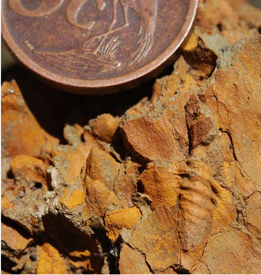
Fig. 8. Trilobite tail in the Bavianskloof Formation.