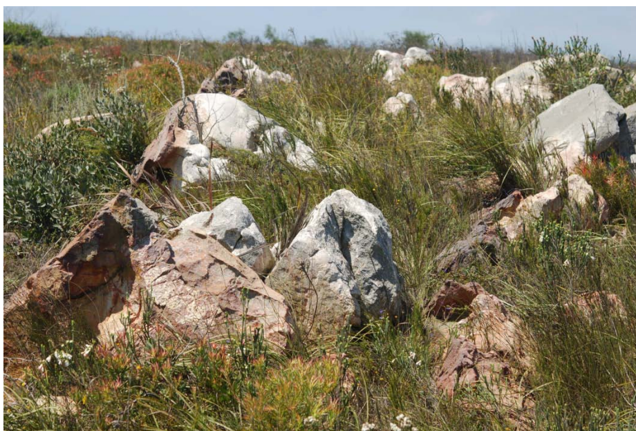
Fig. 5. Quartzites belonging to the Skuurweberg Formation

To the north of the Goudini Formation the land rises into a ridge formed from the resilient quartzitic strata of the Skuurweberg Formation. No palaeontological material was observed in the abundant outcrops of Skuurweberg quartzites.