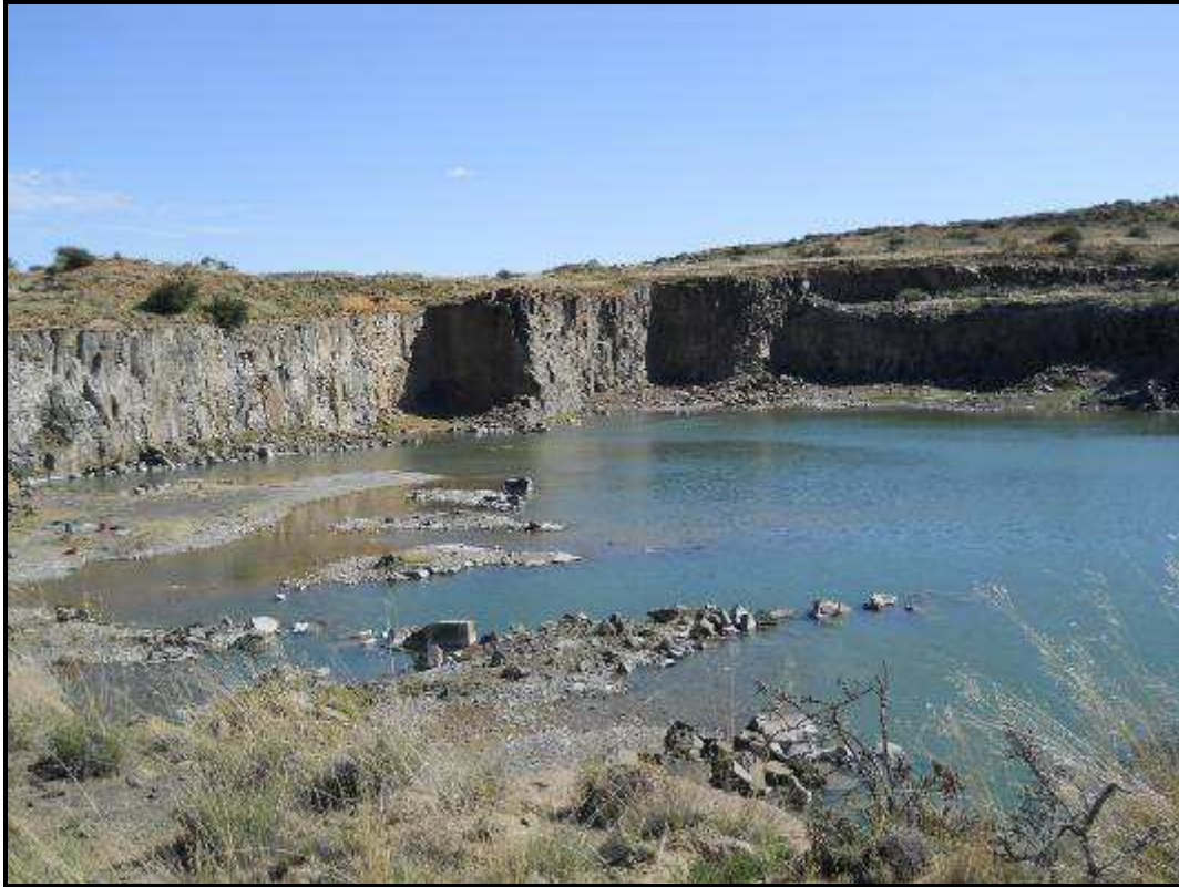
Figure 6.3 Dolerite sill at the Quarry Site (S31.37452 E25.01846)

The ridges and higher topography of the study area consist of dolerite sills and dykes with some prominent outcrops. The quarry site is also situated in one of these sills (Figure 6.3)