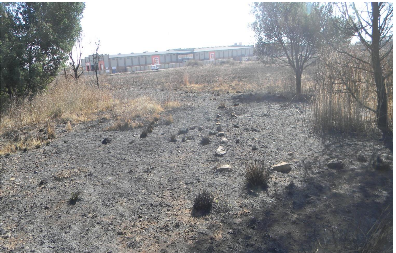
Plate 6: View of proposed development site