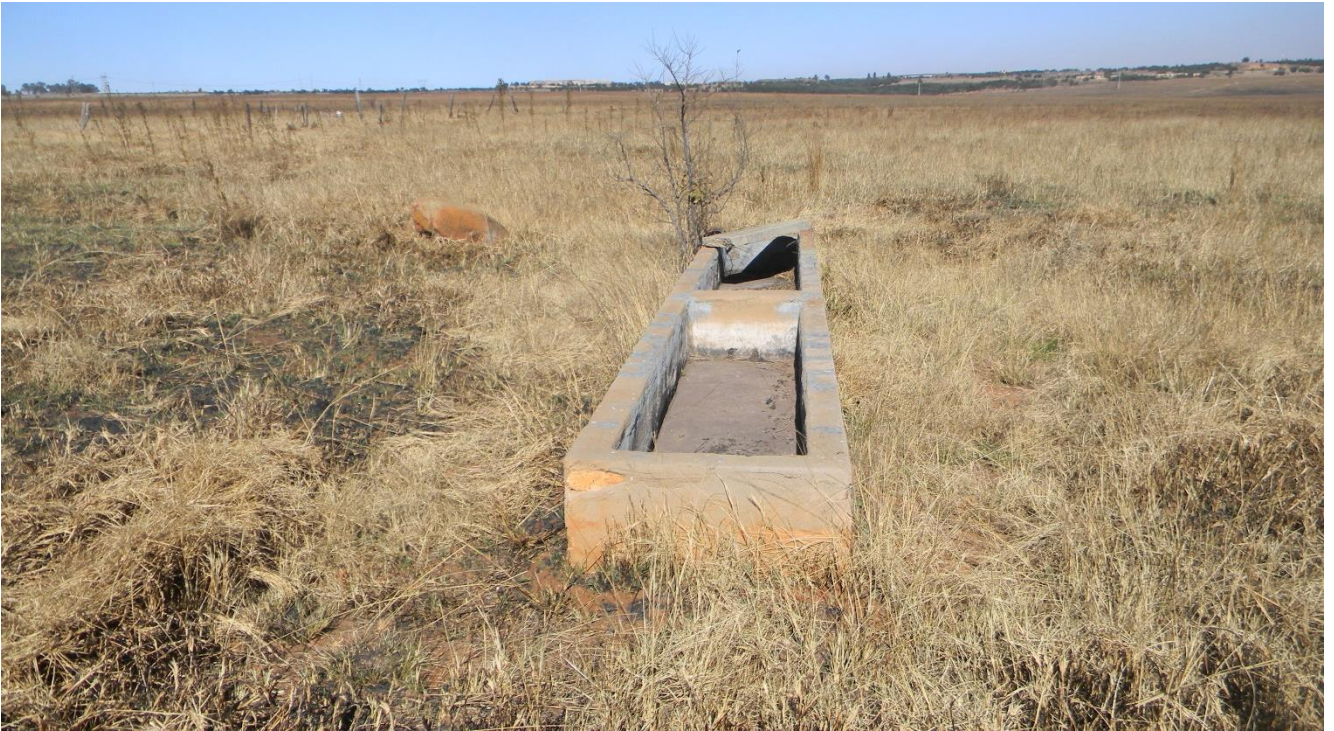
Plate 11: View of proposed development site