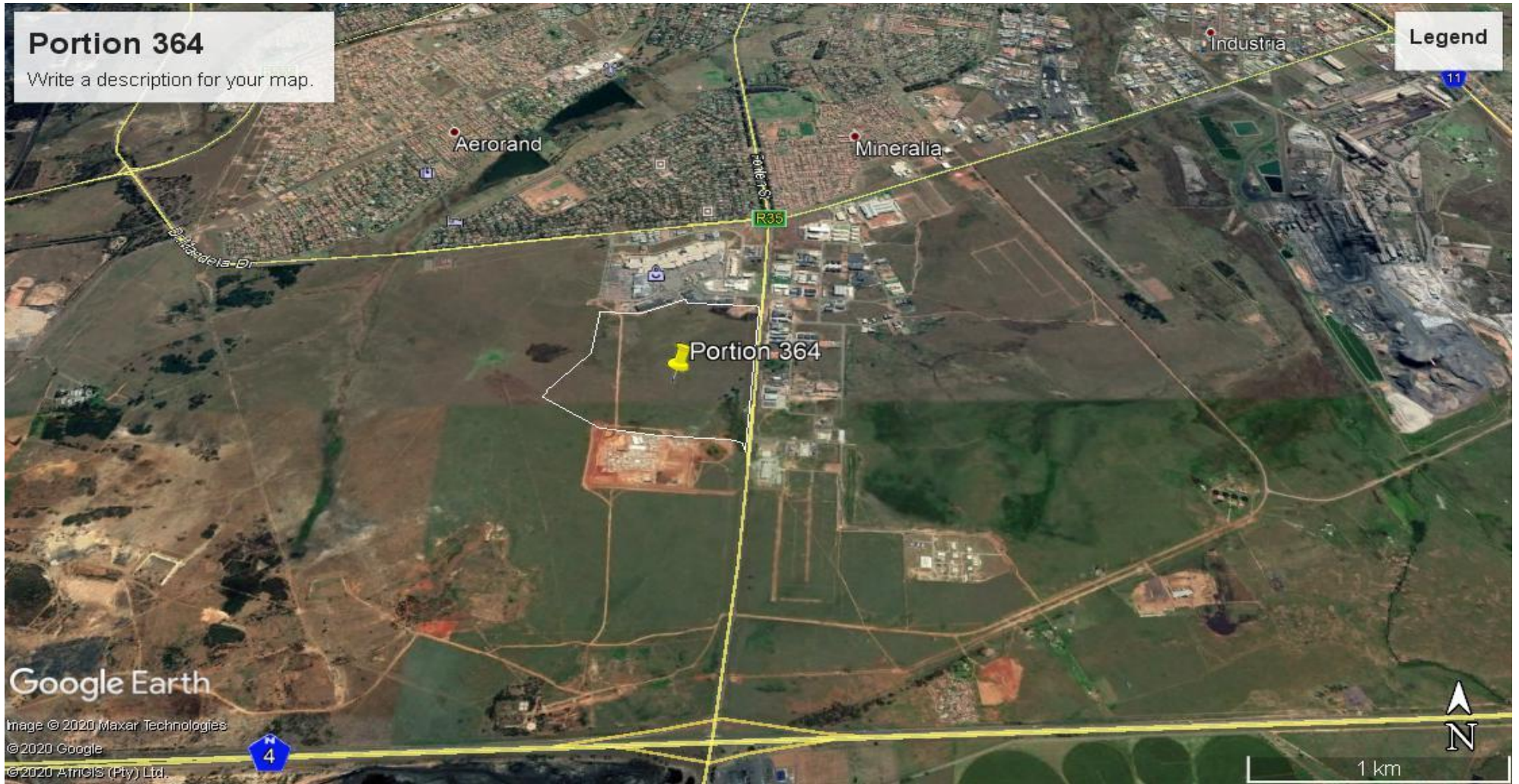
Figure 2: Location of the proposed project site (Singo Consulting 2020)