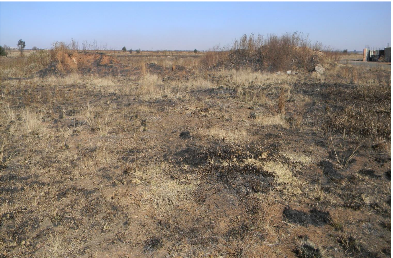
Plate 8: View of proposed development site