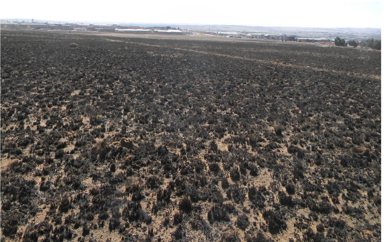
Plate 13: View of proposed development site