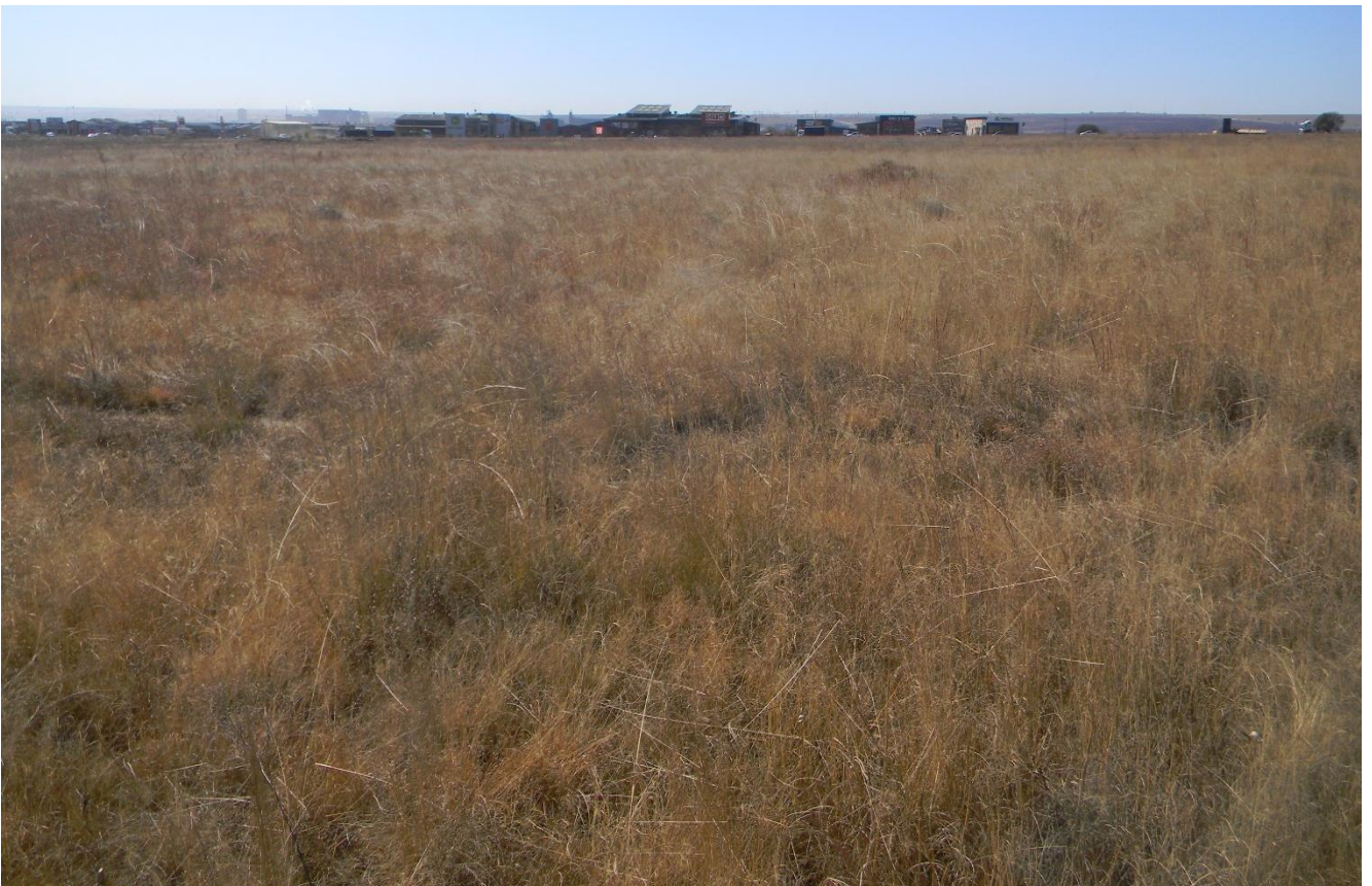
Plate 4: View of proposed development site