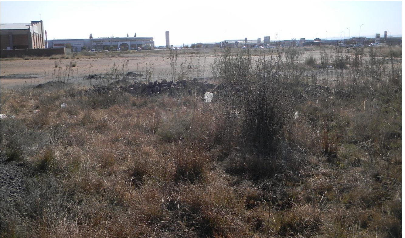
Plate 1. View of proposed development site adjacent to the mall (see Figure 2).

The following photographs illuminate the nature and character of the Project Area.