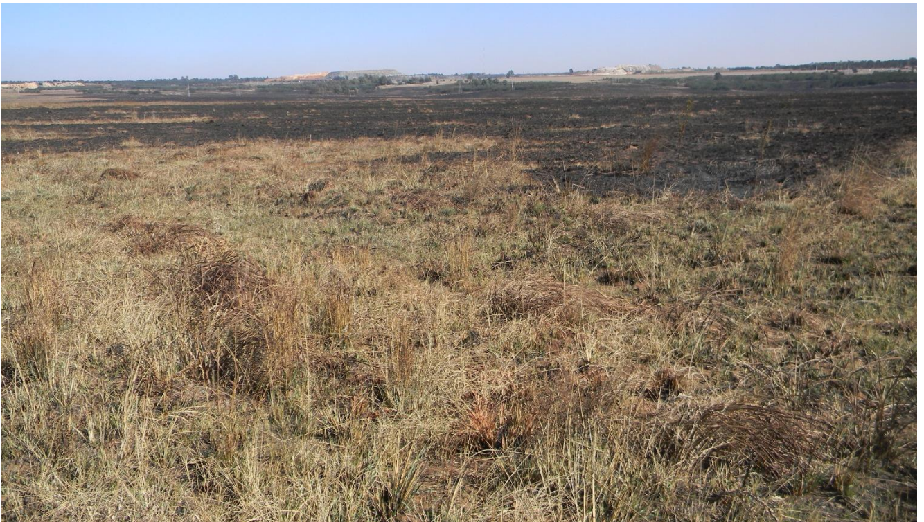
Plate 10: View of proposed development site