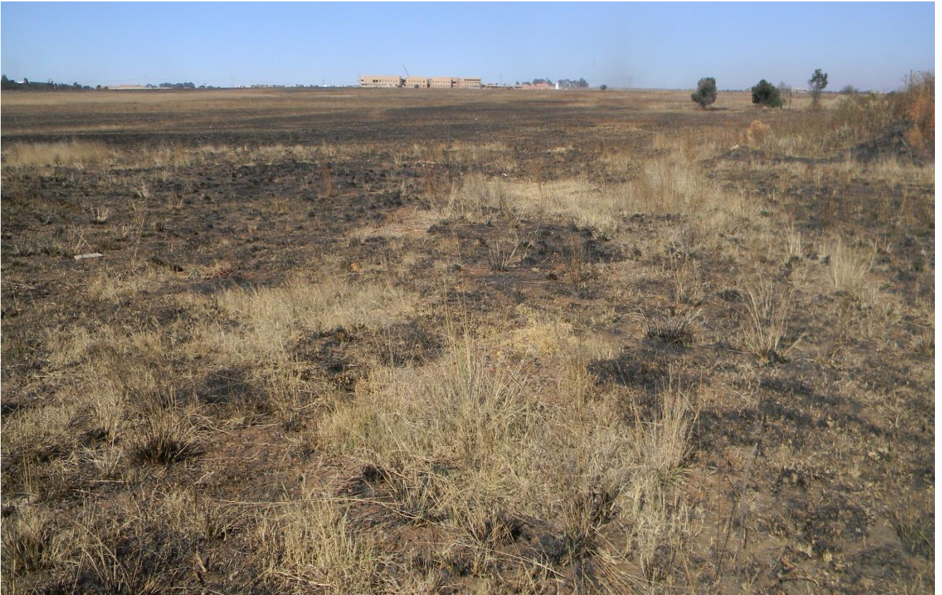
Plate 9: View of proposed development site