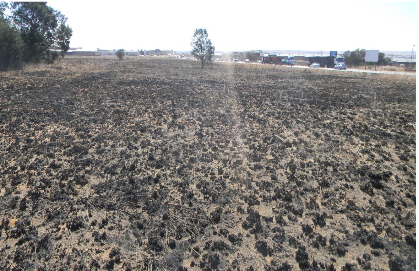
Plate 14: View of proposed development site