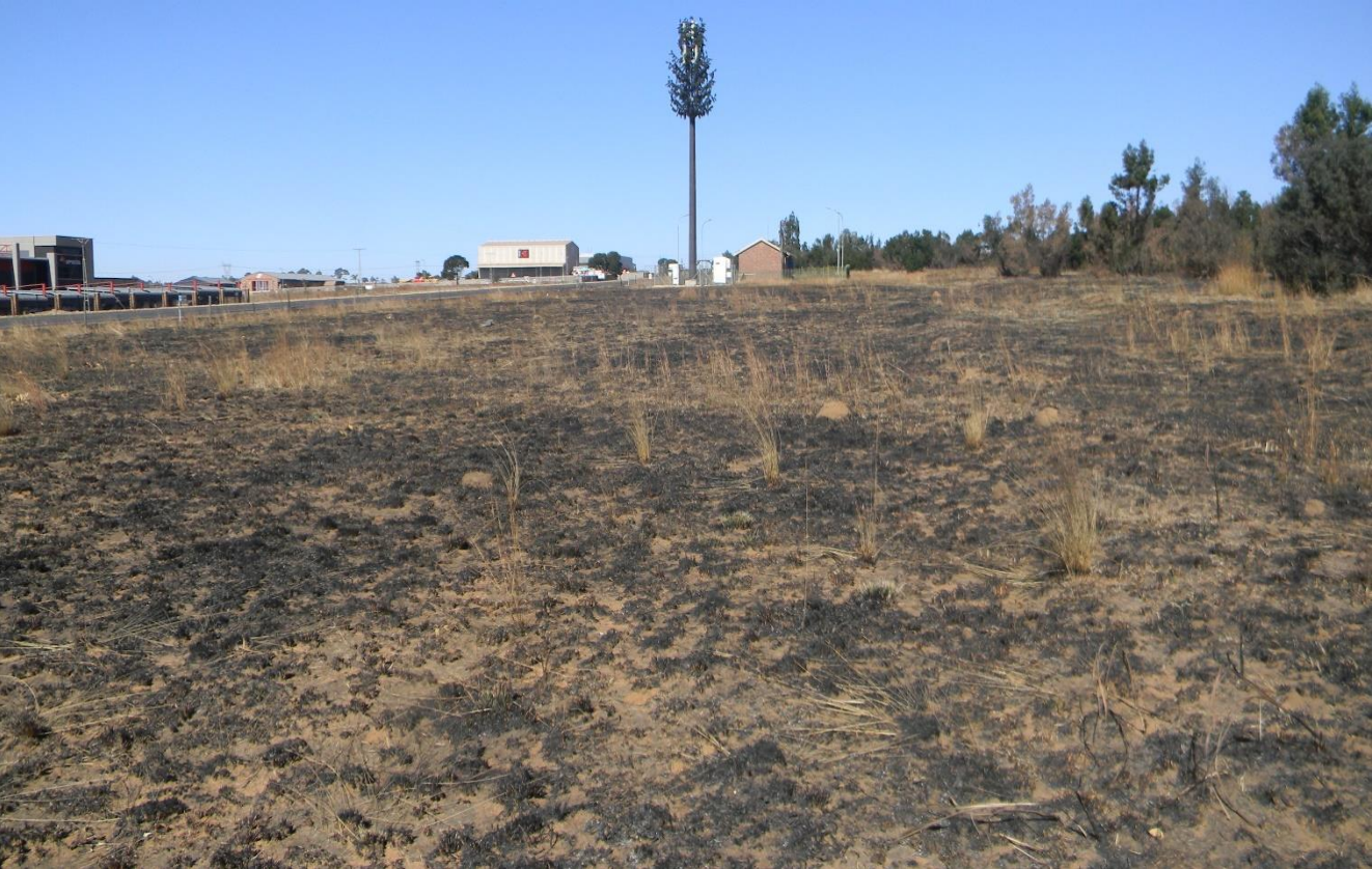
Plate 15: View of proposed development site