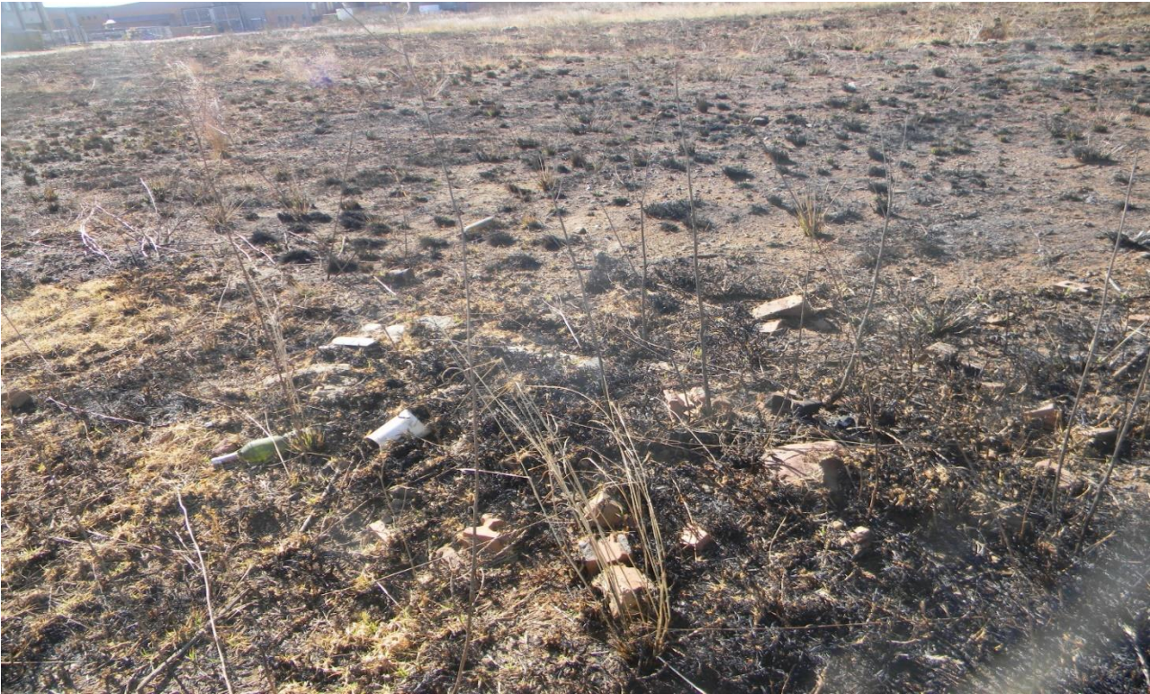
Plate 7:View of proposed development