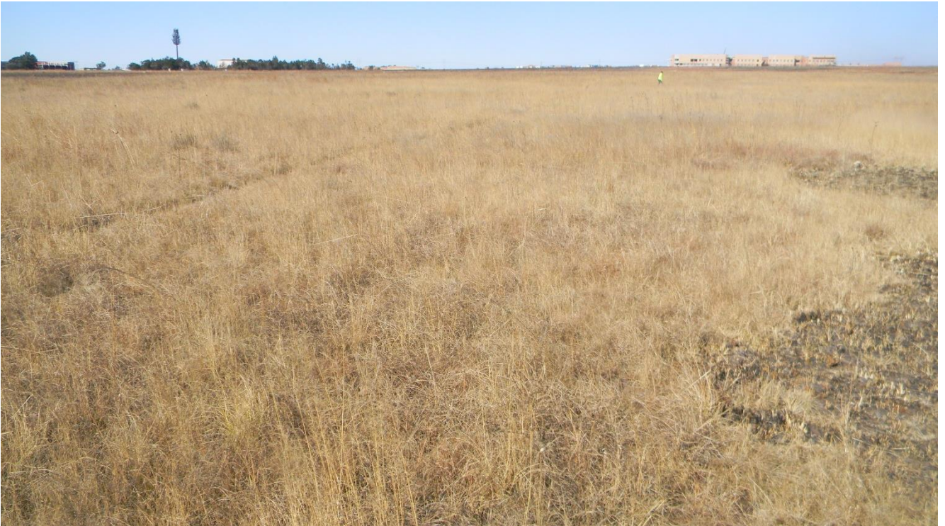
Plate 5: View of proposed development site