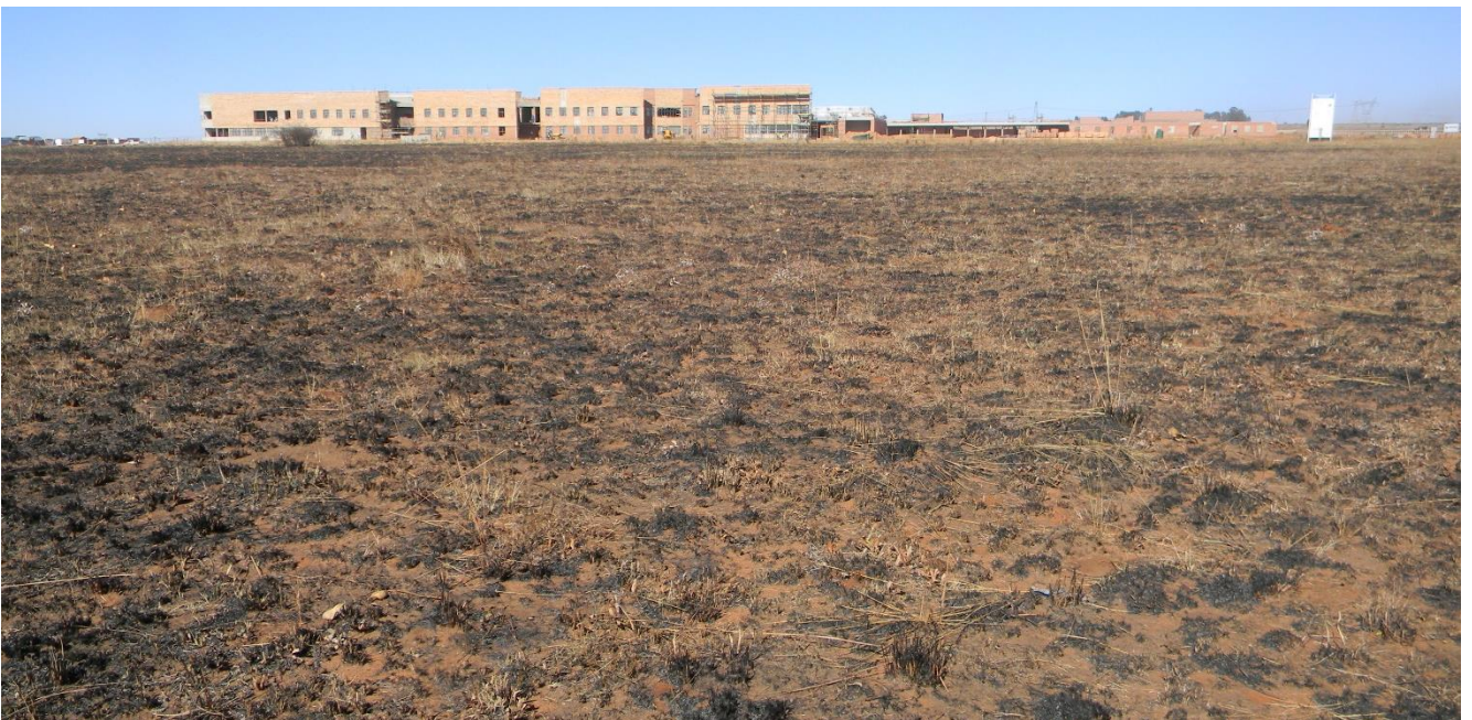
Plate 12: View of proposed development site