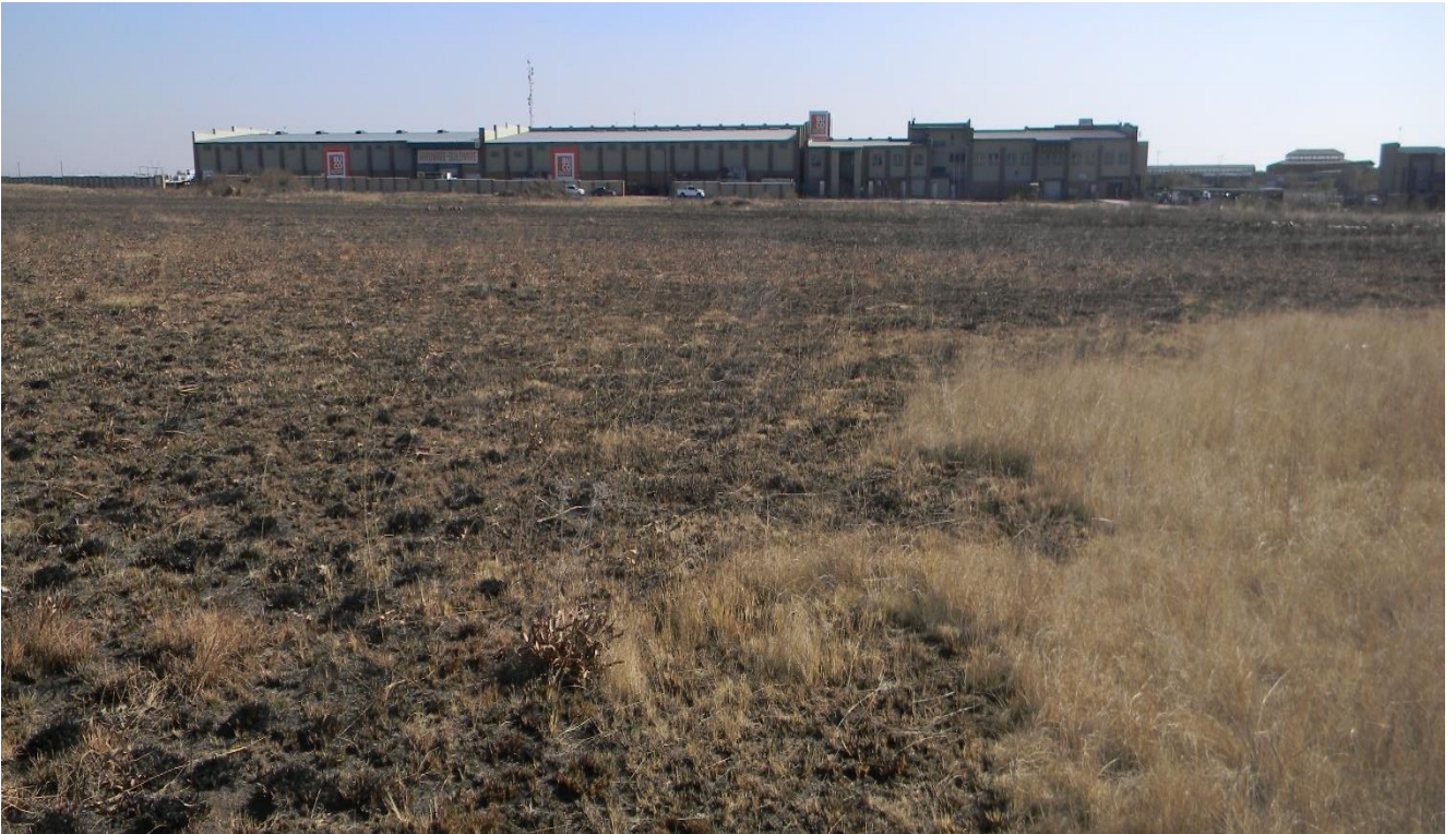
Plate 3 View of proposed development site