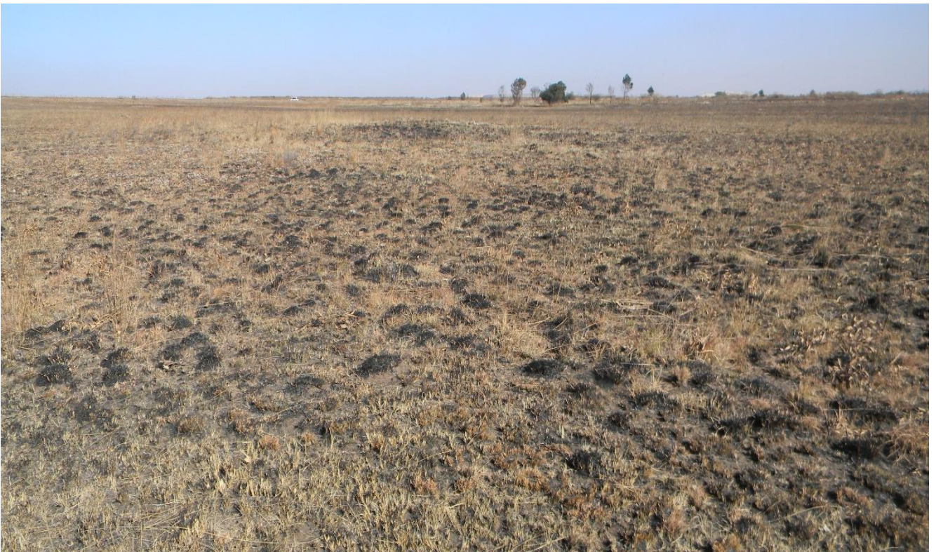
Plate 2: View of proposed development site (see Figure 2)