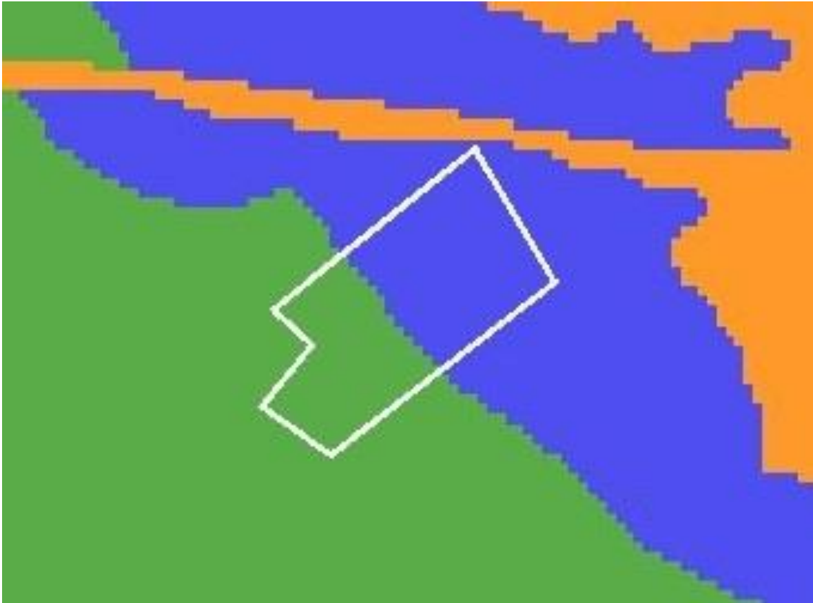
Figure 3: Palaeontological sensitivity map of the study site (white polygon) and surroundings (SAHRA, 2021)