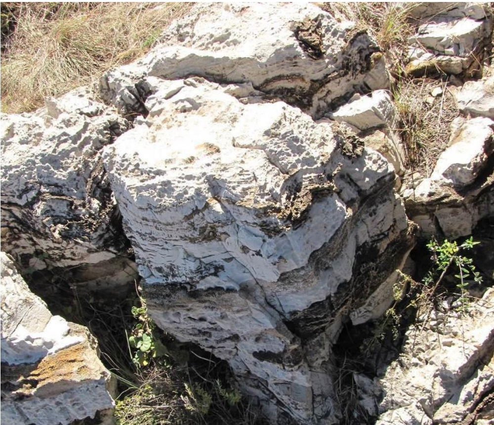
Figure 4: Example of stromatolites at Sterkfontein Caves

No fossils have been recorded from the sedimentological strata of the Dwaalheuwel and Strubenskop Formations yet (Groenewald & Groenewald (2014). There is a possibility that these formations may contain microfossils because of the microfossils and stromatolites (see Fig. 4) that occur in the Pretoria Group formations below (Timeball Hill Formation) and above (Daspoort Formation) the Dwaalheuwel and Strubenskop Formations and is the reason why it these are considered having a Moderate Palaeontological Sensitivity (Groenewald & Groenewald, 2014).