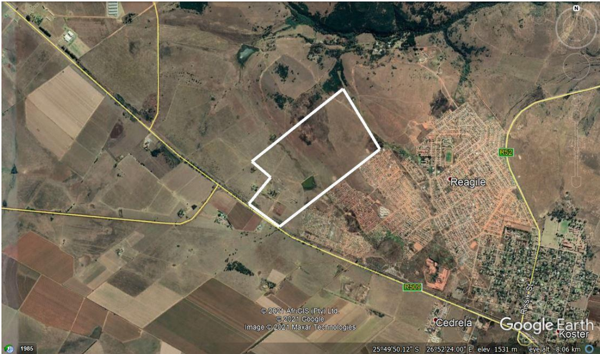
Figure 1: Google Earth photo indicating the study site (white polygon)

The study site is situated west of Koster in Northwest Province. The study site is used for farming. The area is topographically relatively flat with a gentle slope towards the river to the north.