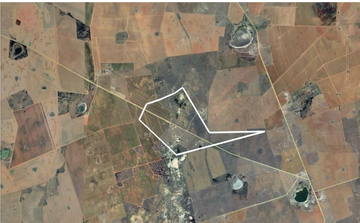
Figure 2: Google Earth photo indicating the study site