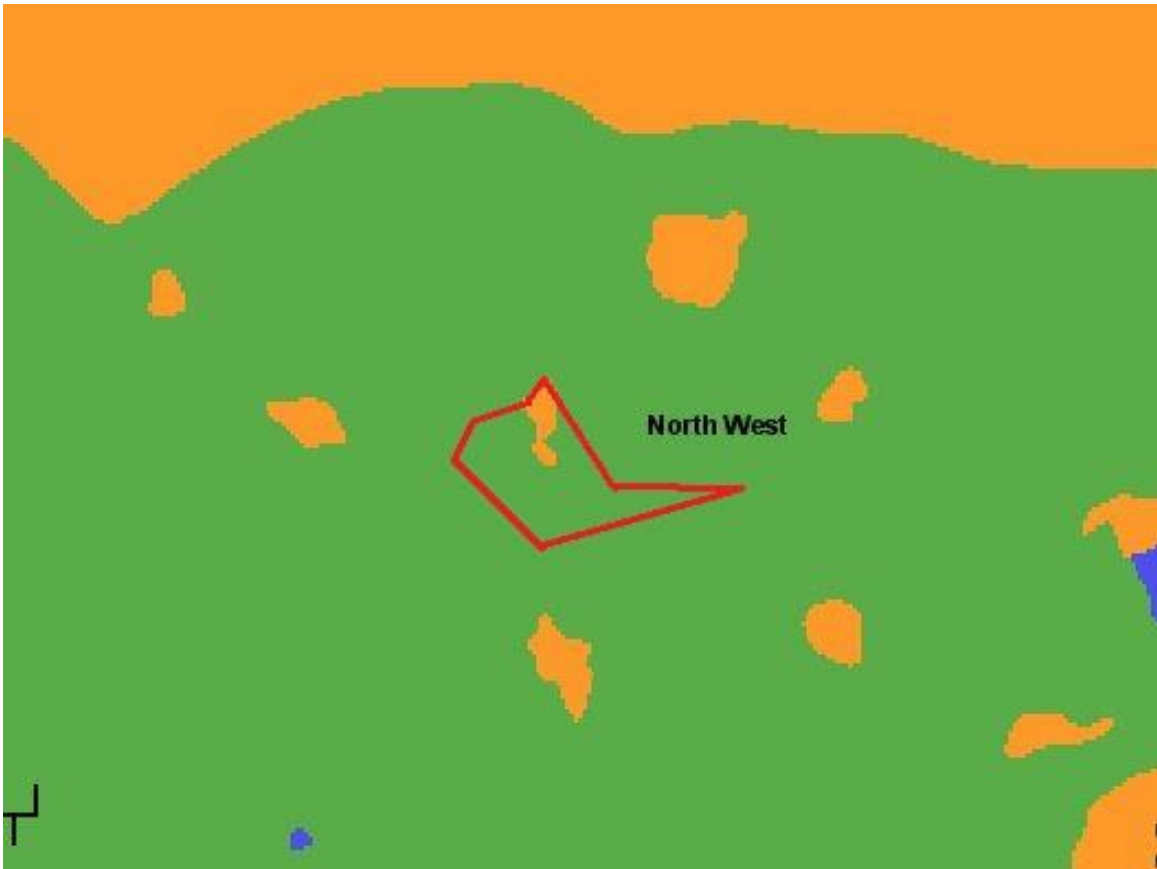
Figure 3: Palaeosensitivity map of the study site and surroundings (SAHRA, 2018)

The proposed development will take place in an area that is mostly used for farming (see Figs. 1, 2). The area, west of Delportshoop, is mostly flat and vegetation is sparse. The Vaal River forms the south-easterly border of the farm. There are diamond mines in the area east of the farm.