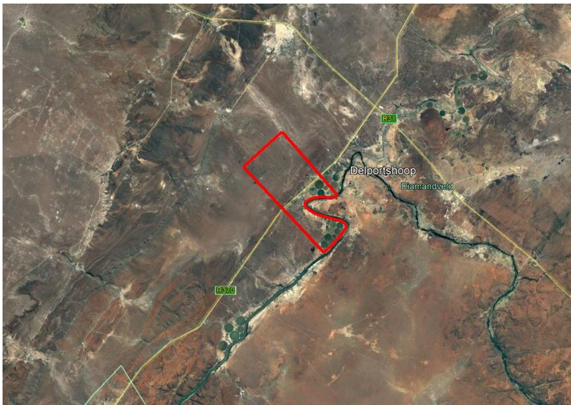
Figure 2: Google Earth photo indicating the study area