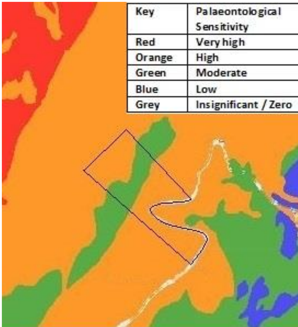
Figure 3: Palaeosensitivity map of the study area and surroundings (SAHRA, 2018)

The proposed development will take place in an area that is mostly used for farming (see Figs. 1, 2). The area, west of Delportshoop, is mostly flat and vegetation is sparse. The Vaal River forms the south-easterly border of the farm. There are diamond mines in the area east of the farm.