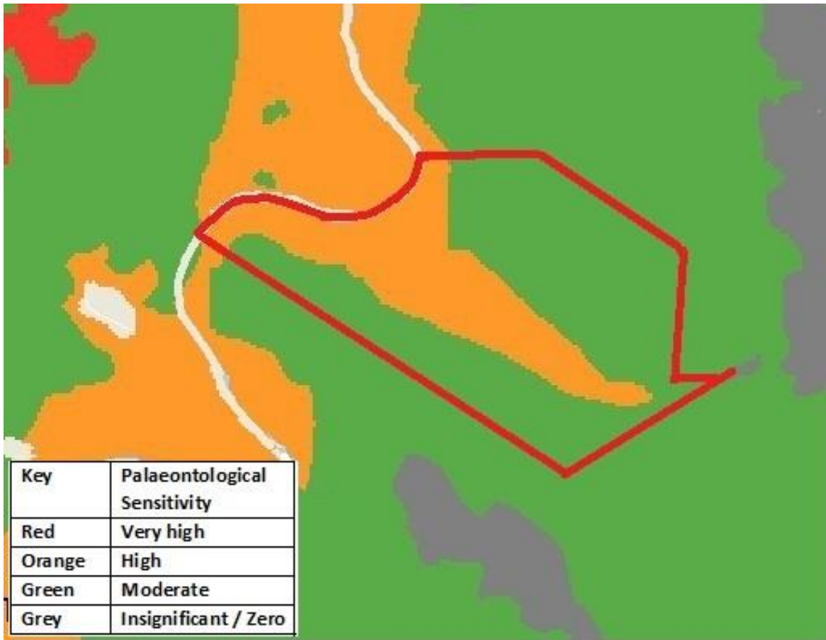
Figure 3: Palaeosensitivity map of the study area and surroundings (SAHRA, 2018)

The proposed development will take place in an area that is mostly used for farming and mining (see Figs. 1, 2). This area south of Schmidtsdrift, west of Kimberley, is mostly flat and vegetation is sparse. There is diamondiferous gravel on the western side of the study area adjacent to the Vaal River (see Figs. 2, 4).