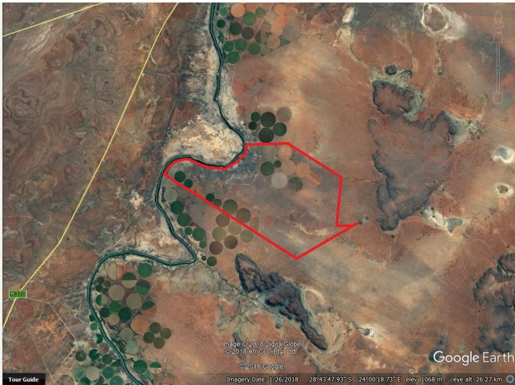
Figure 2: Google Earth photo indicating the study area