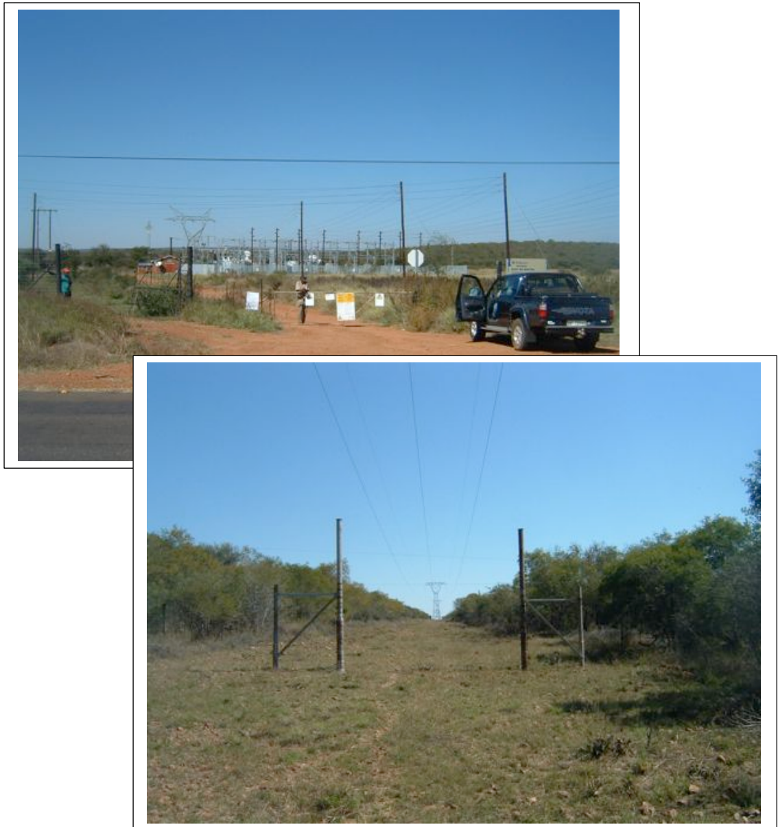
Figures 3 & 4- Stretches AB and BC for Alternative 01 runs from the Rust de Winter Substation and enters the Rust de Winter Nature Reserve (above and below).

The Phase I HIA survey is now briefly discussed and illuminated with photographs.