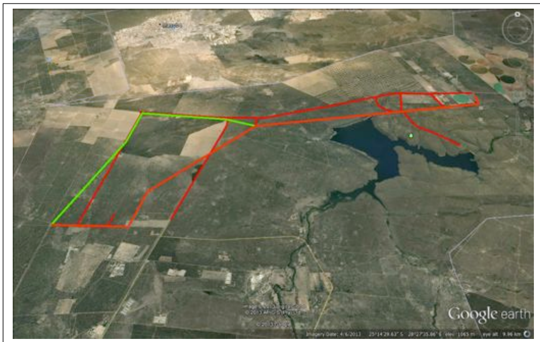
Figure 1– Main routes that were registered with a mounted GPS instrument during the field survey for Eskom’s 132kV Pelly-Warmbad power line routes (above).

A fixed (or mounted) GPS was used to record main routes from where the pedestrian surveys were conducted.