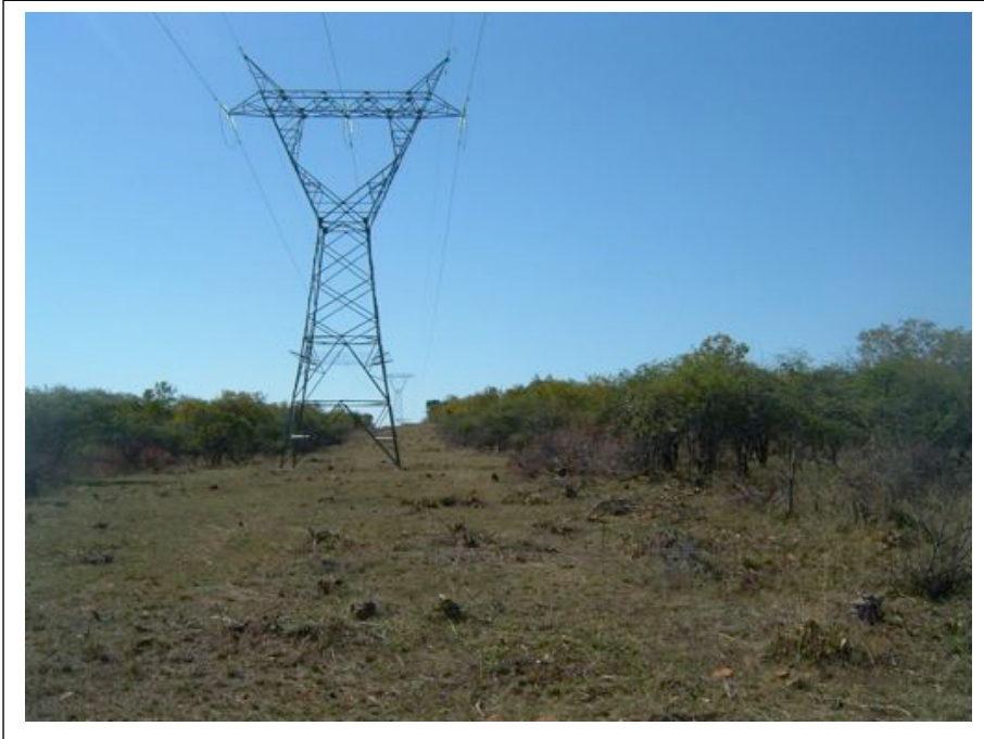
Figures 4 & 5- Stretch BC for Alternative 01 runs in a straight line following one of Eskom's existing 400kV power lines across the farms Kameelrivier 77JR and Kliprand where no heritage resources of significance were observed (below).