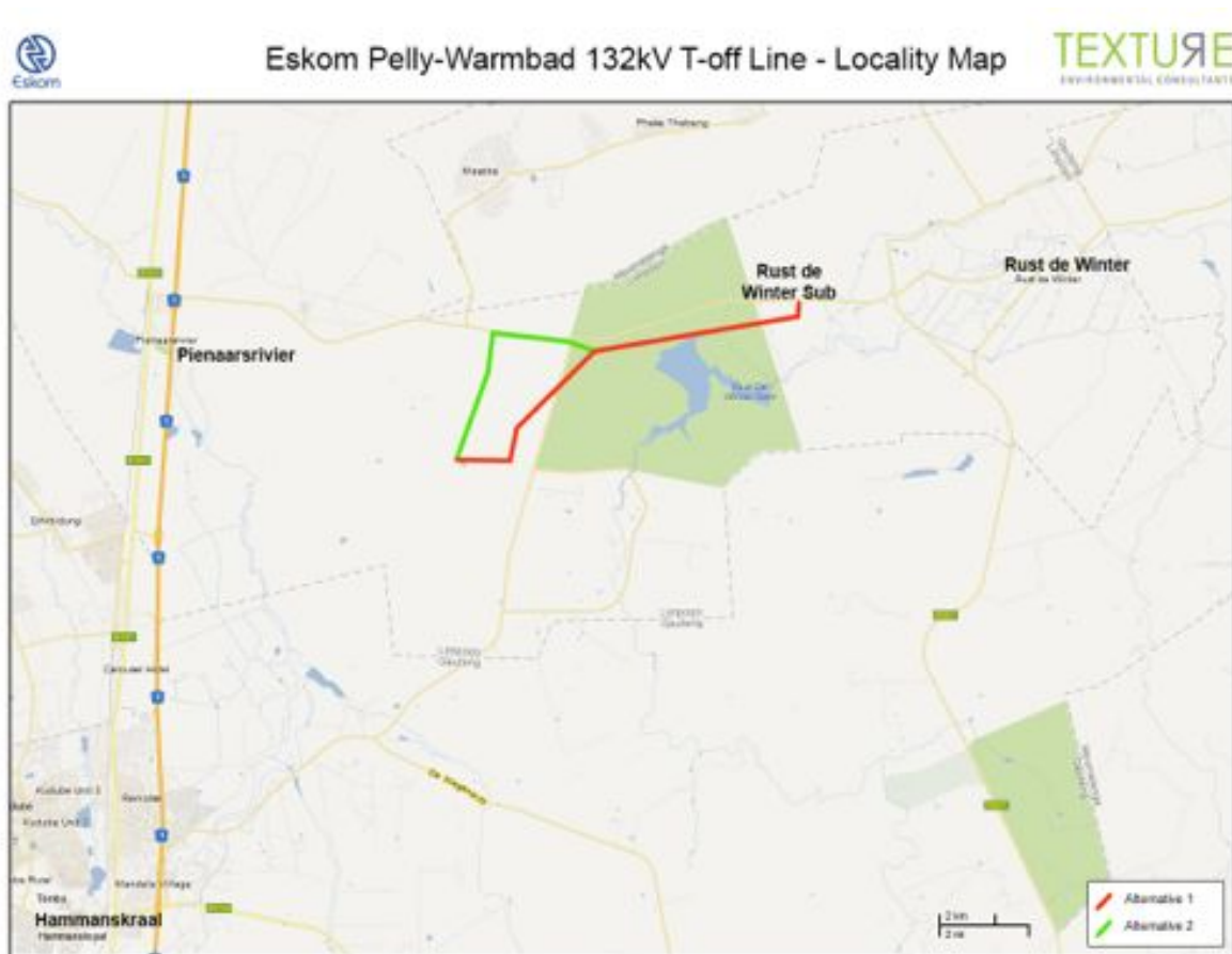
Figure 1- Regional setting for the Eskom Project Area near Pienaarsrivier and the Rust de Winter Dam in the Limpopo Province (above).

The Eskom Project is located approximately thirty km to the east of the village Pienaarsrivier and the N1 Highway which runs from Pretoria in the south to Polokwane in the north. The Eskom Project Area is located on the southern border of the Springbok Flats and stretches across the flat grasslands of this ecozone in an area which is bordered by Pienaarsrivier in the west and Rust de Winter in the east (Pretoria 1:250 000 map & 2528AB Pienaarsrivier 1:50 000 topographical map).