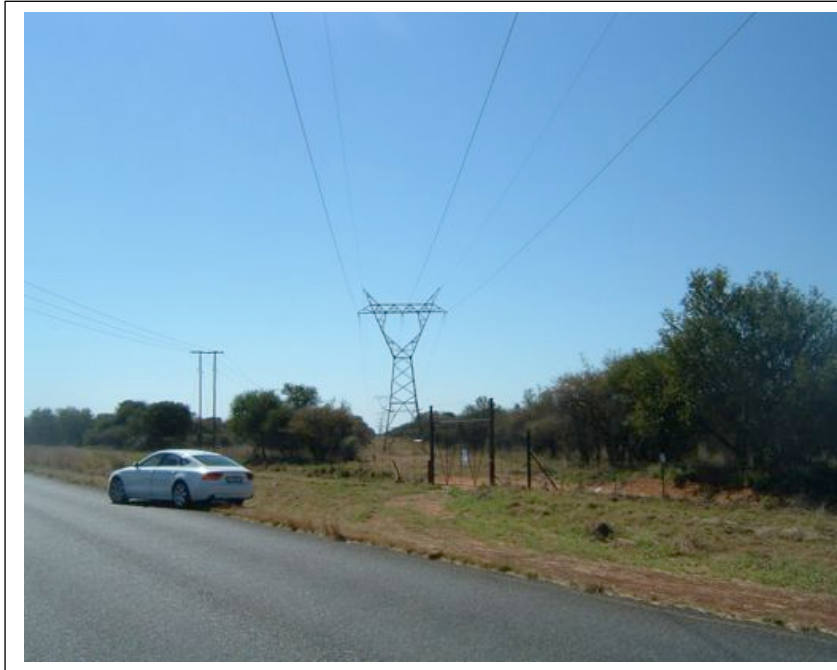
Figures 5 & 6- Stretches CD and EF initially crosses the national road running to Hammanskraal (above) and thereafter runs along the border fence between Kliprand 76JR and Haakdongfontein 35JR to the existing Pelly-Warmbad backbone (below).