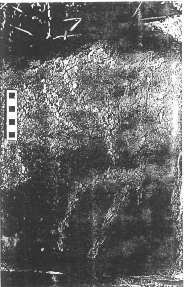
Figure 6. MMK RAC 3502 Indeterminate mammal.

discerned beyond the fact that the giraffe, ostrich, elephant, lion and human figures were grouped in one part of the site; and the two eland (with one human figure) were near each other further away.