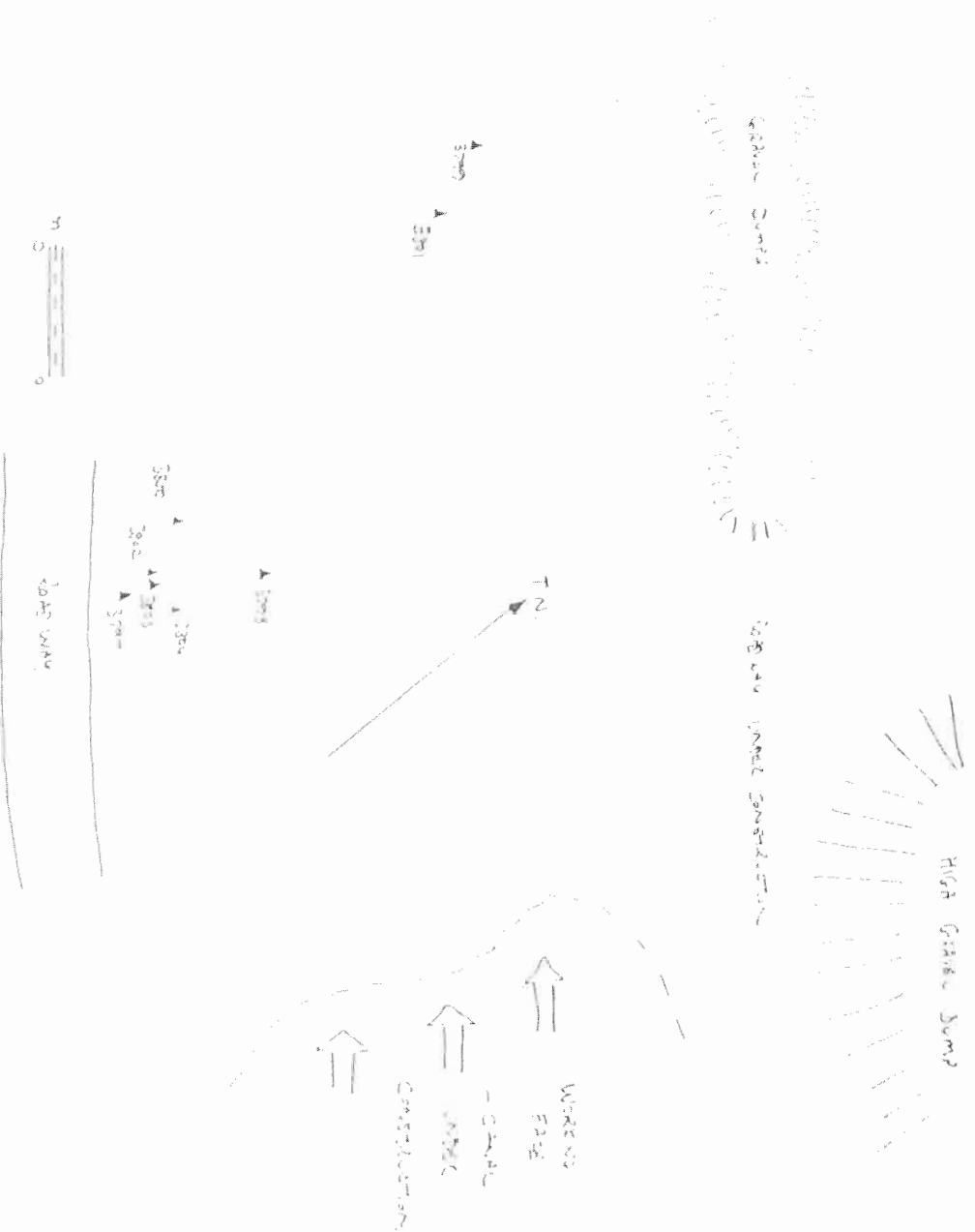
Figure 7. Site plan.