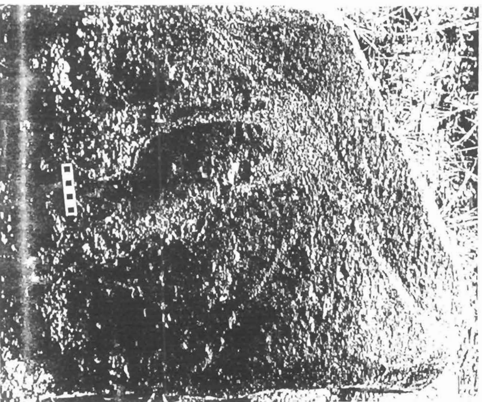
FIGURE 1. NYK PAC 3797. Large giraffe. FIGURE 2. NYK PAC 3799. Eland. FIGURE 3. NYK PAC 3803. Human-like figure. FIGURE 4. NYK PAC 3801. Probable aiant. FIGURE 5. NYK PAC 3798. Ostrich. FIGURE 6. NYK PAC 3802. Man.