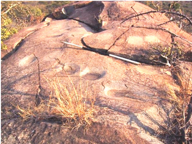
Fig. 5 Communal grinding stone, site 1