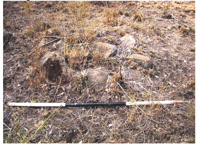
Fig 6. Unknown stone feature, site 1