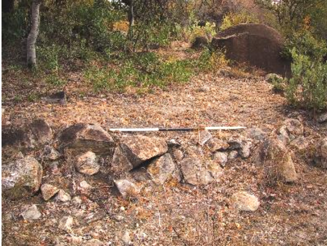
Fig. 3 Stone wall, site 1