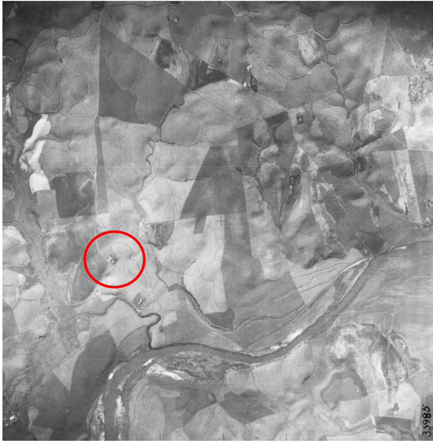
Figure 1 – 1937 aerial photograph