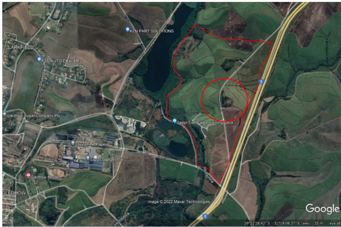
Figure 4 : Google Earth Image 2021