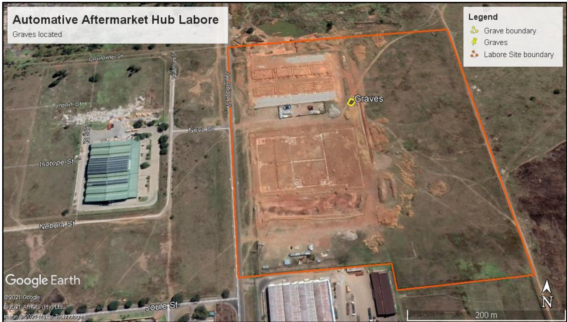
Figure 2: Aerial view of the study area