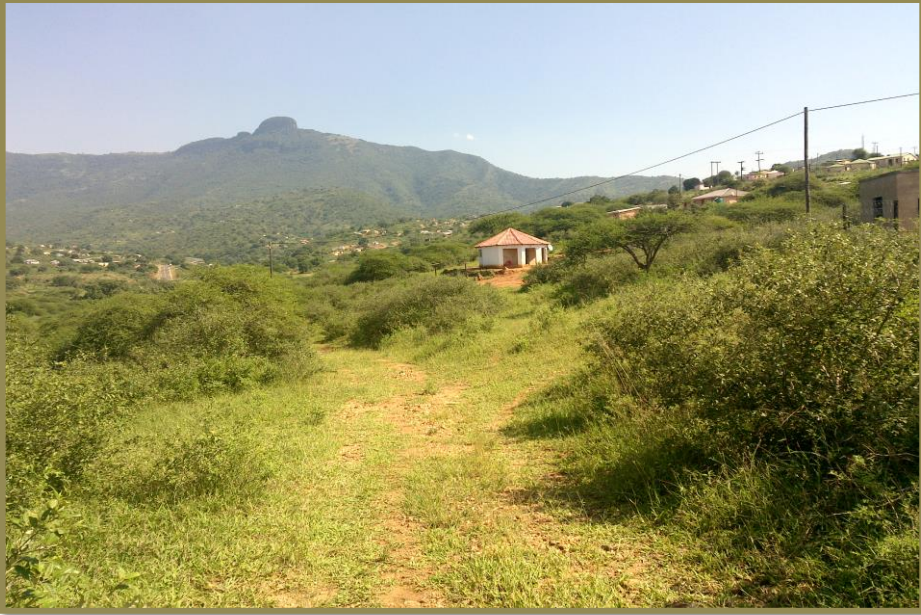
Existing pipe line servitudes