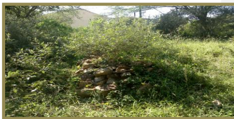
Marked graves in the vicinity of existing pipeine servitude .