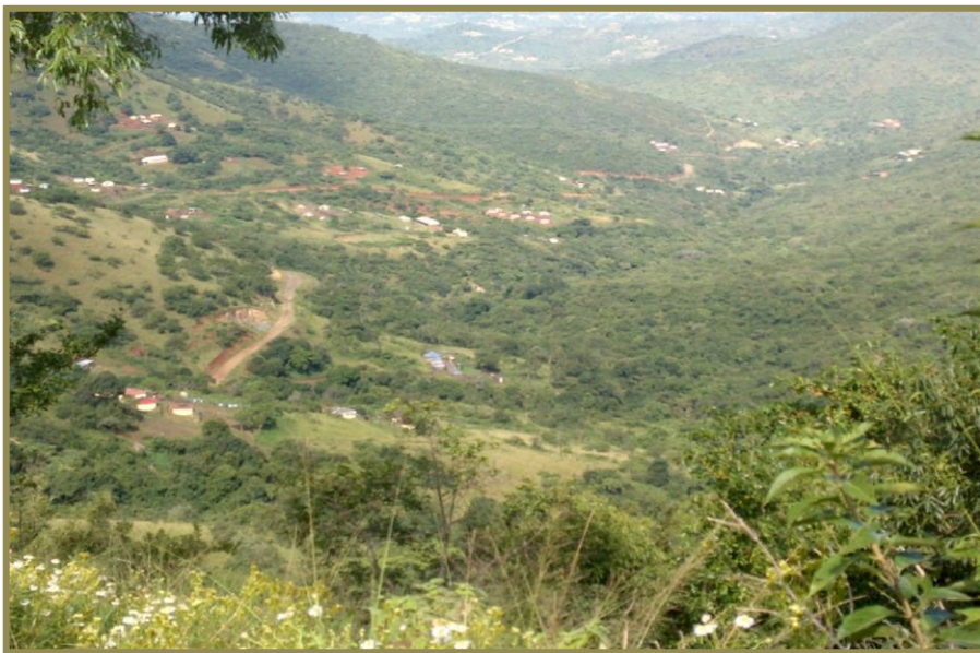
Figures 3 Proposed pipeline reticulation and servitude along existing roads and tracks in the valley bottom.