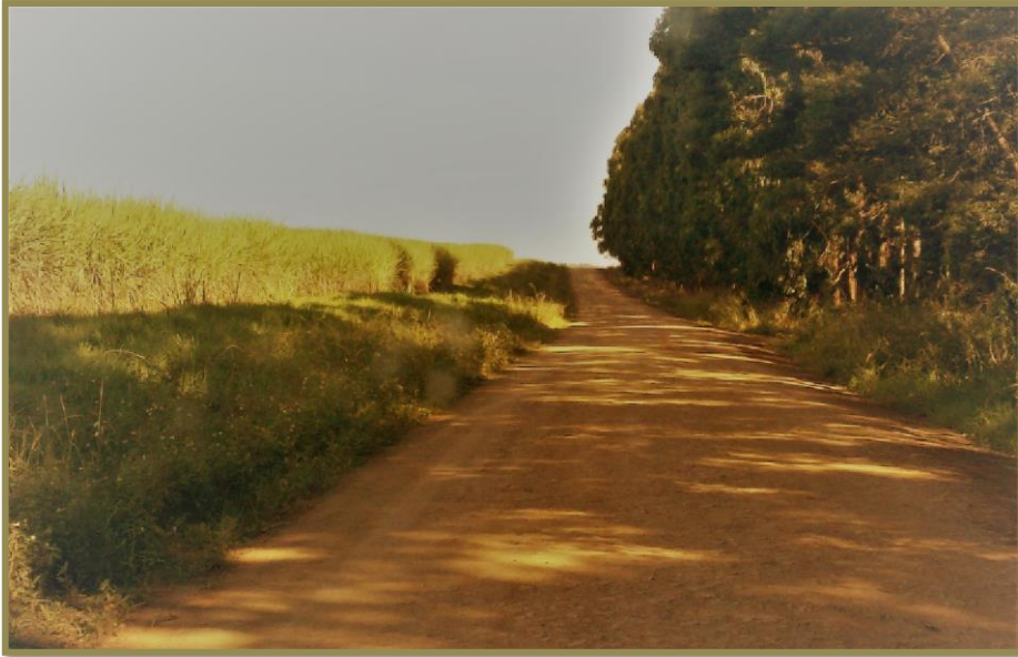
Figure 2 Proposed pipeline servitude within road reserve along the escarpment. Note transformed mistbelt grasslands due to commercial silviculture and sugar cane production.