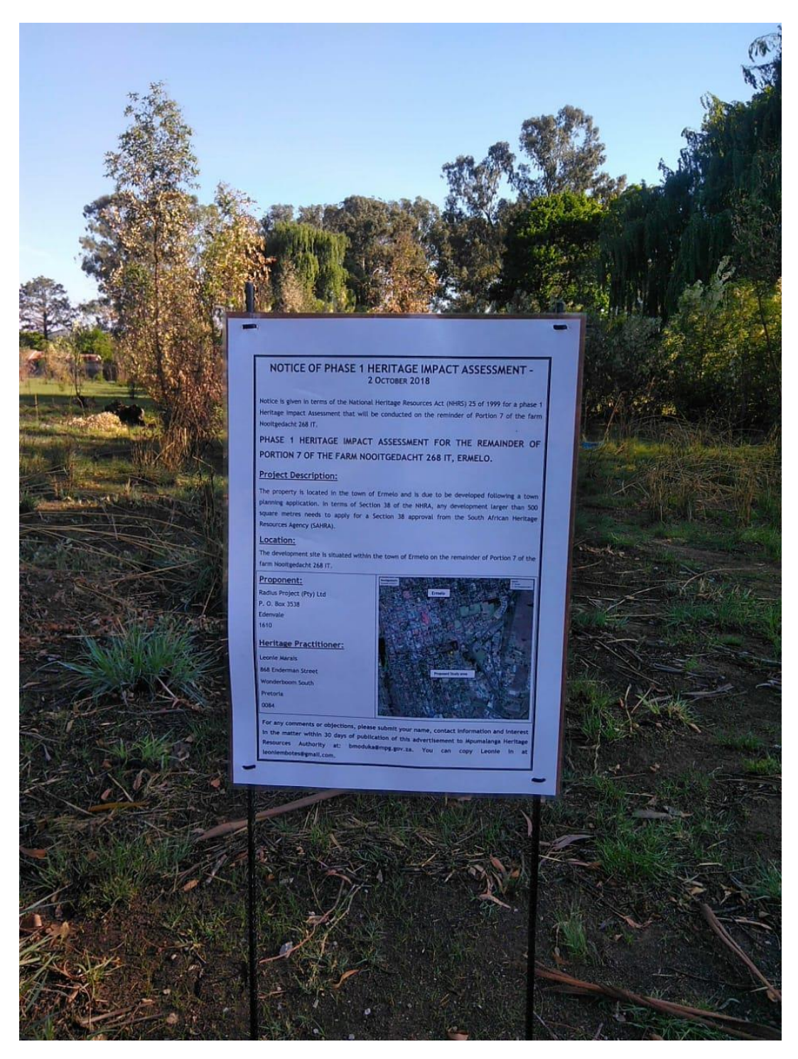
Figure 2: Photo illustrating the site notice placed on site.

A site notice was erected on site to give opportunity for registrations and comments. The site notice was placed on 2 October 2018. Any interested parties were given until 2 November 2018 to submit comments: