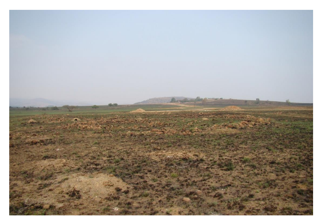
Photo 45: The entire area surrounding RDR 1 C is level with the ground surface. Road networks have previously impacted on the remains of the stone walls.