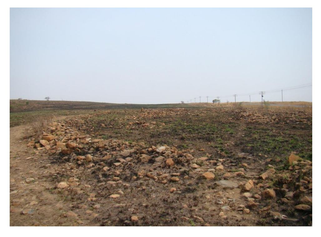
Photo 58: RDR1 G has been impacted upon by the tarred road (R36) which cuts through this unit. The walls are not generally in good condition.