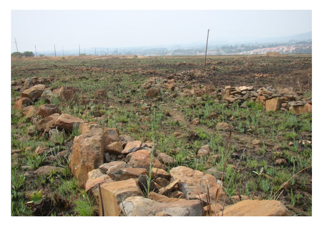
Photo 50: The stone walls from D, E and F are interlinked. Some sections of the walls are on the ground surface, whereas the foundation stones of others are clearly visible (see layout plan Fig. 5).