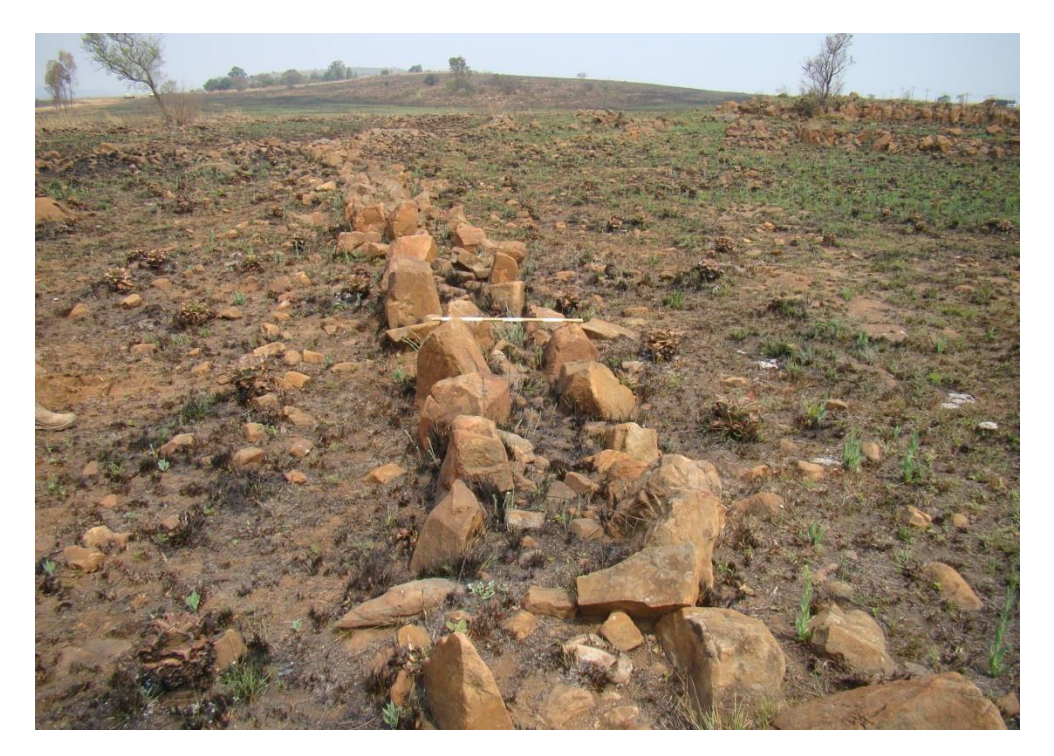
Photo 56: The stone foundations are distinctly larger stones in this section.

Photo 55: Some of the walls are in the region of 1000mm wide.