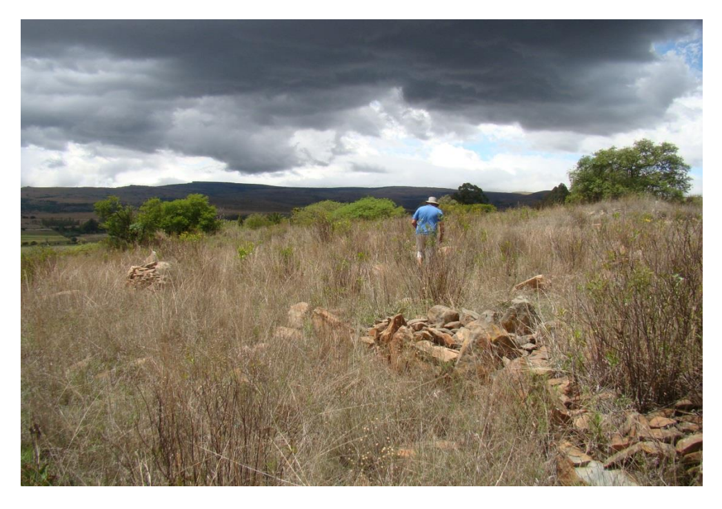
Photo 85: Some of the walls of RDR 1 K, on top of the hill, are still visible. The entire section at the bottom is already destroyed.