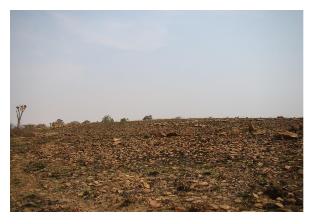
Photo 83: The larger foundation stones are mainly visible with most of the smaller stones scattered throughout the area.

The section on the hill above RDR 1 I, J & K is associated with sections I & J and K.