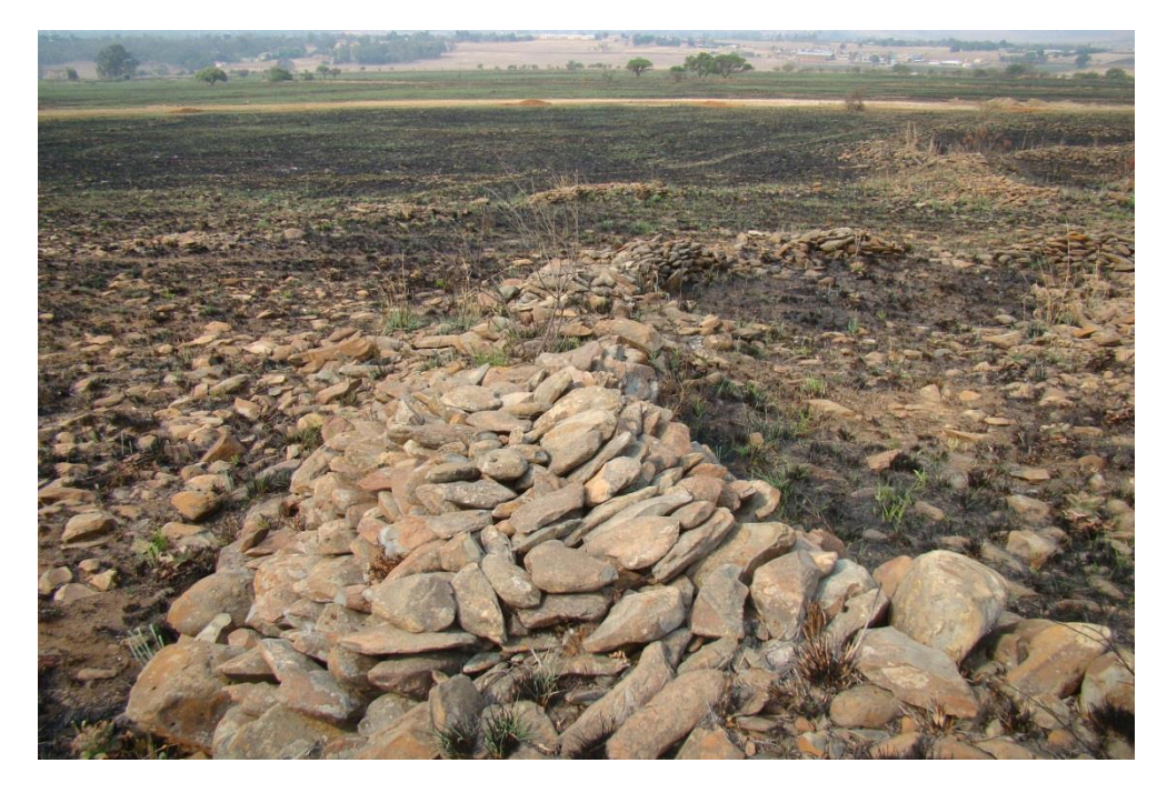
Photo 79: The extent of the walls in RDR 1 J is visible in this picture.