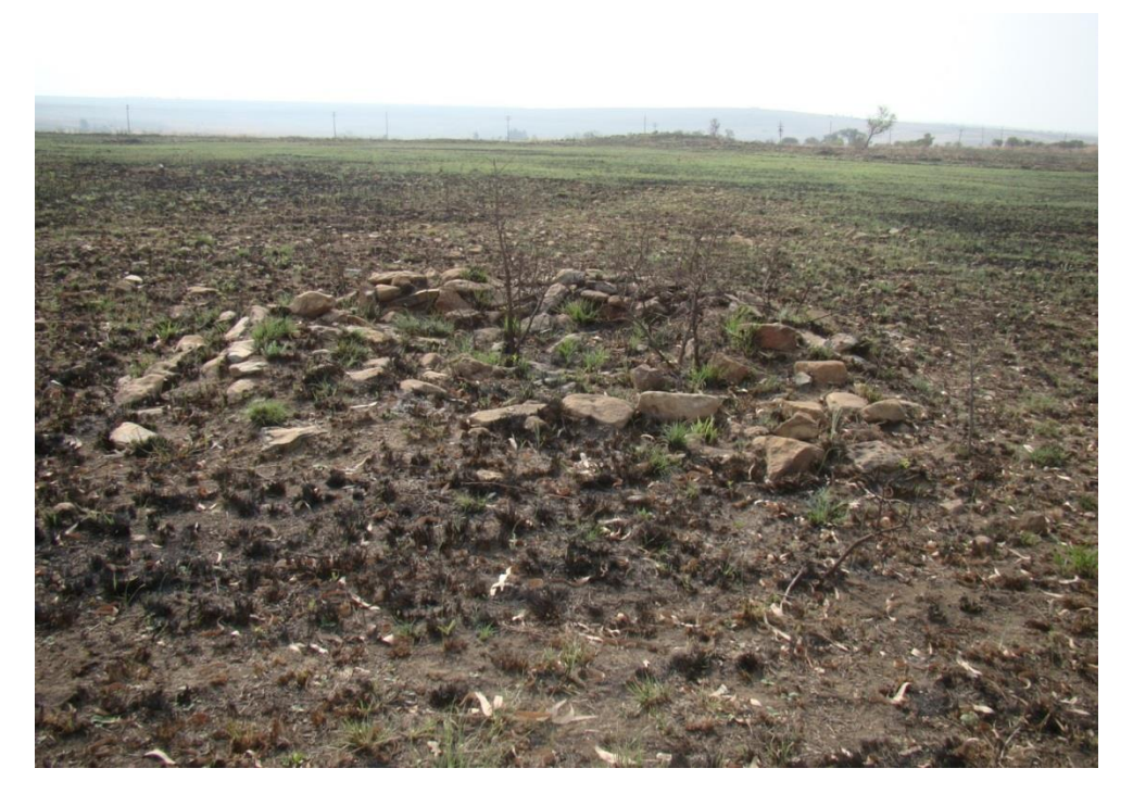
Photo 82: A small circular unit below the slope is also associated with RDR 1 I & J.

Photo 81: RDR 1 J as viewed from below. The road networks have already impacted upon the stone walls.