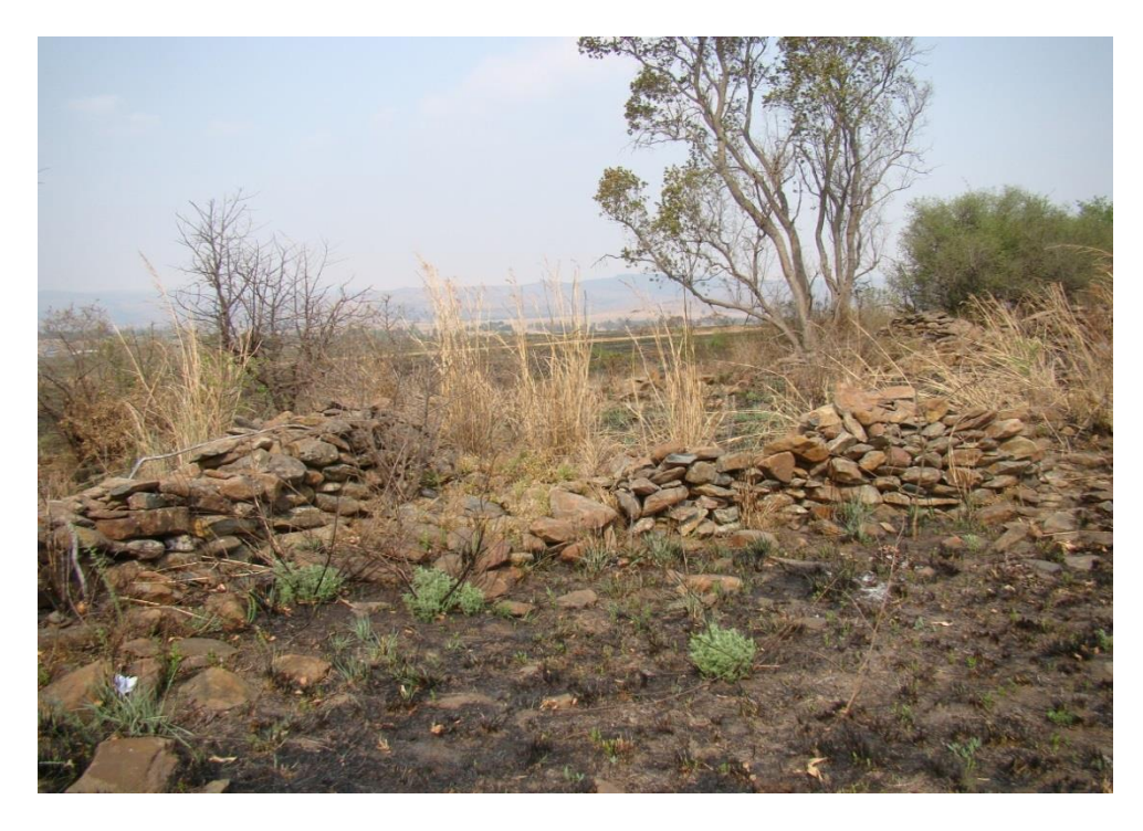
Photo 67: The entrance section of RDR 1 I as it is reach from the bottom of the hill.