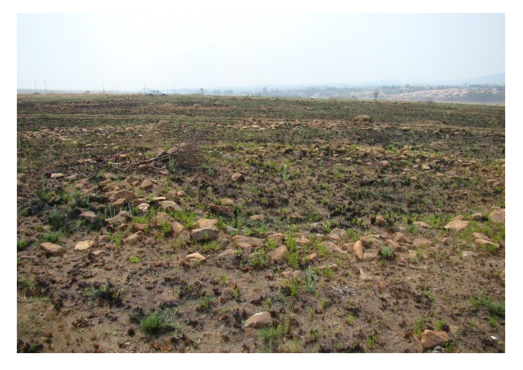
Photo 58: Some of the units can be identified when the velt was burnt.