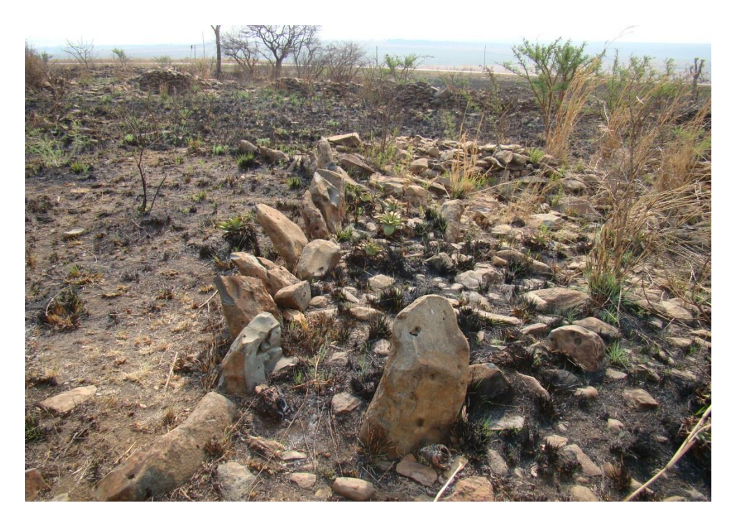
Photo 69: Large foundation stones are also distinct in this section.