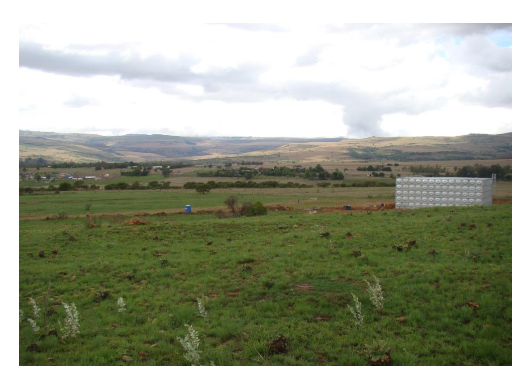
Photo 88: A water reservoir was built on the bottom section of RDR 1 K.