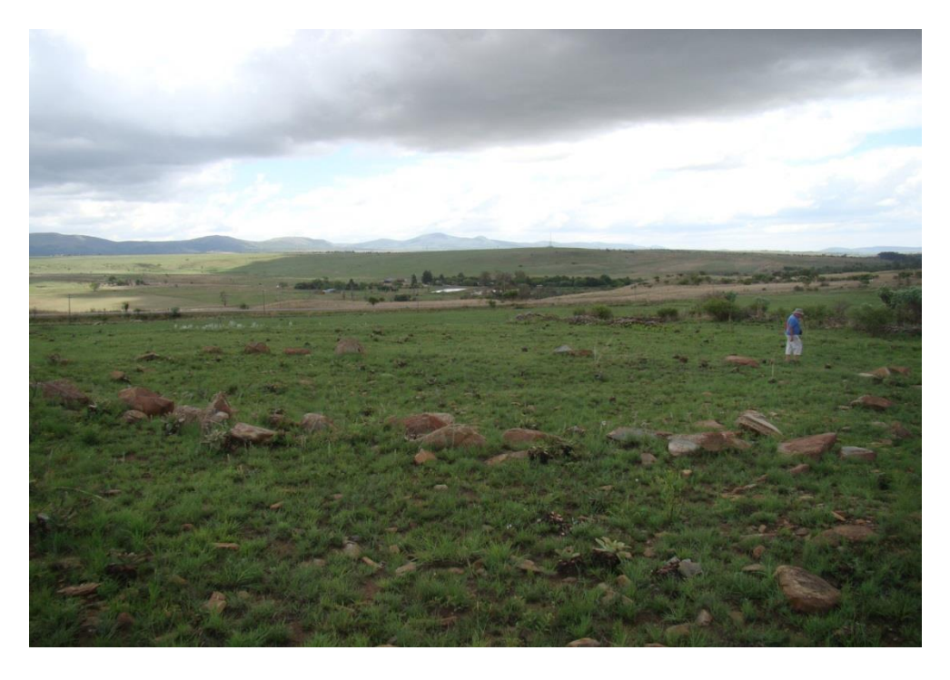
Photo 84: The large foundation stones are clearly visible against the background of new growth, which obscure the smaller stones as seen in Photo 83.

Photo 83: The larger foundation stones are mainly visible with most of the smaller stones scattered throughout the area.