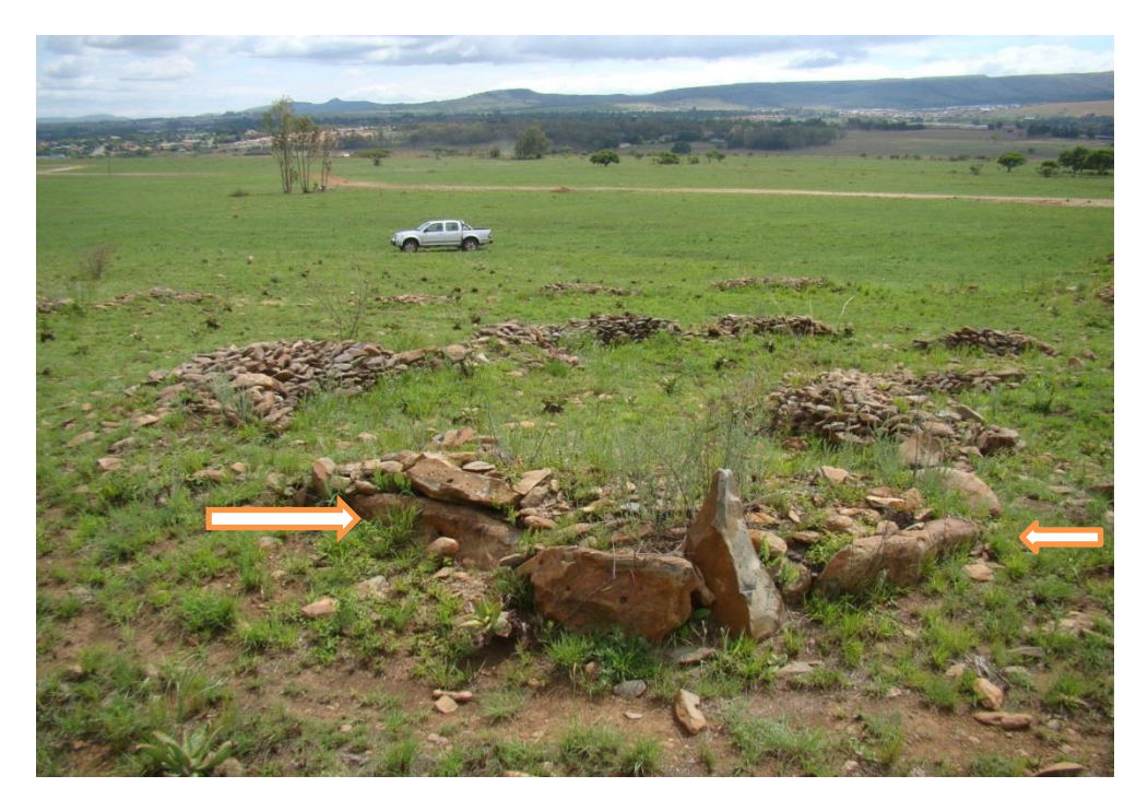
Photo 74: RDR 1 J is situated on the slope of the hill. It is characterised by large stones which were incorporated into the units.