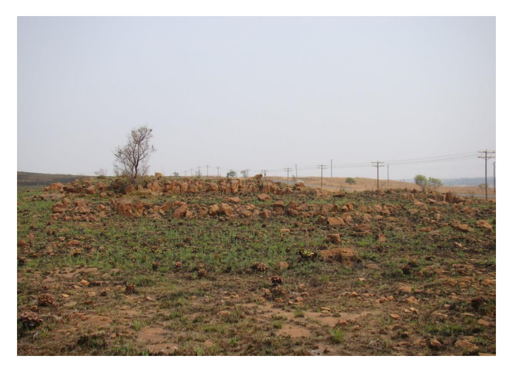
Photo 52: A small natural outcrop forms part of the stone walled complex at section RDR 1 F.