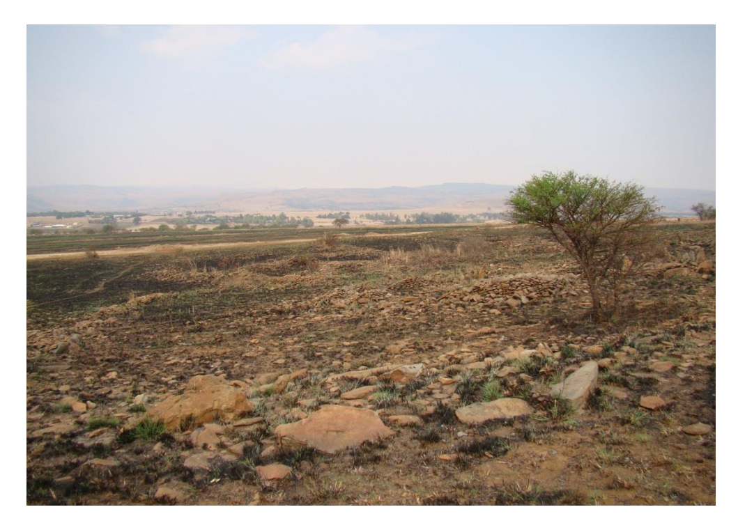
Photo 77: A view of RDR1 J. The walls are distinct but not in a good condition.