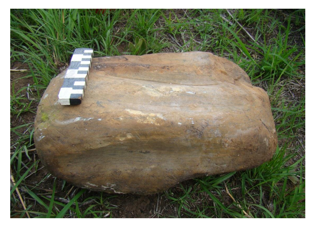
Photo 71: A stone for sharpening implements was observed in one of the units.