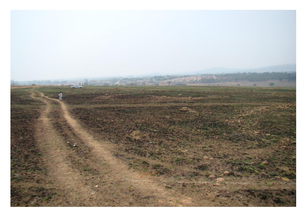
Photo 49: Impacts from previous road networks are visible in the area of RDR 1 C.