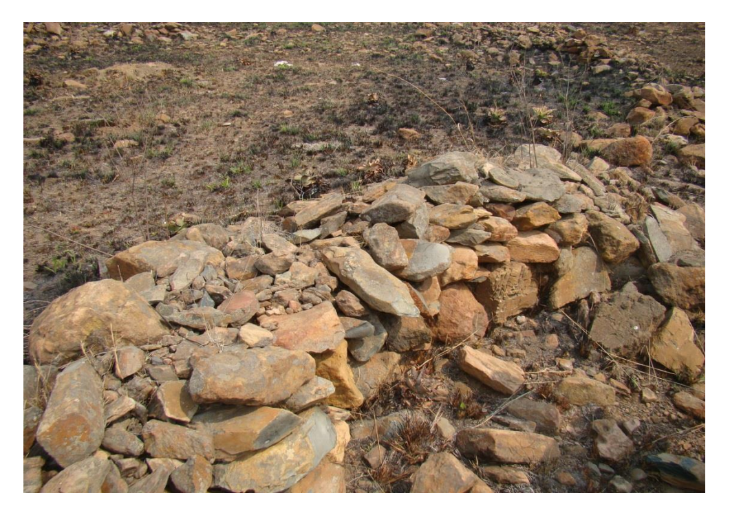
Photo 60: A section of the wall in RDR 1 G that is still in a good condition.