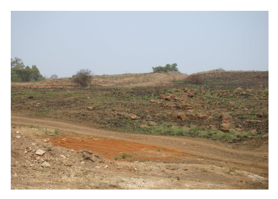
Photo 81: RDR 1 J as viewed from below. The road networks have already impacted upon the stone walls.