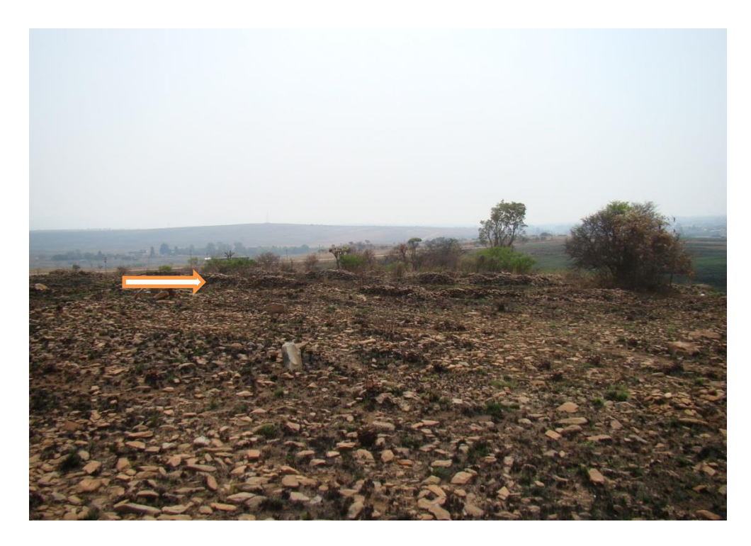
Photo 63: RDR 1 I in the background (arrow). The stones in the foreground are scattered throughout the hill area and used to be part of the larger stone walled complex.