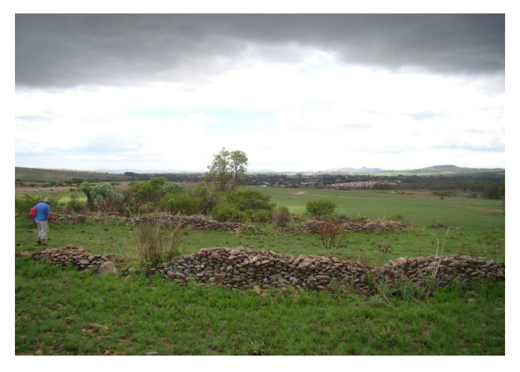
Photo 62: RDR 1 I is the best preserved of all the stone walls in the RDR 1 group. It is situated on a small hill and distinct (see layout plan in Fig. 5).