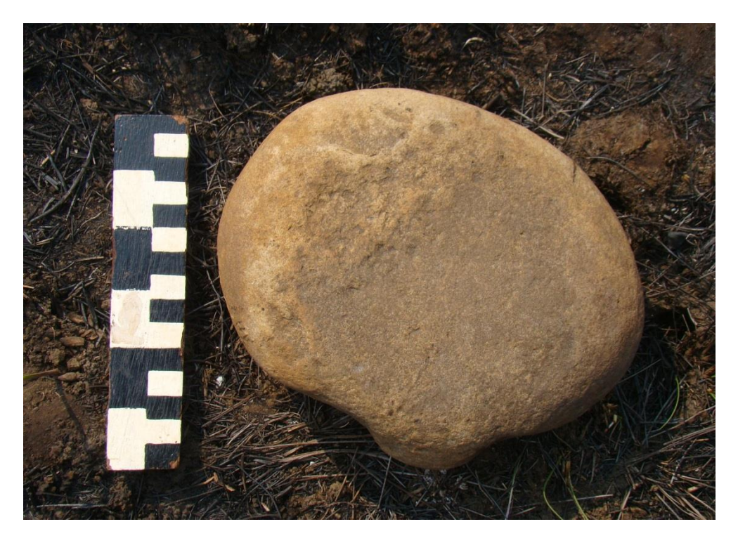
Photo 72: An upper grinder was observed near the entrance of the complex.