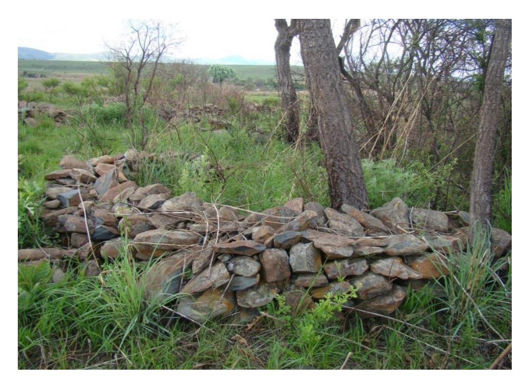
Photo 65: This specific circular wall is still in a very good condition.