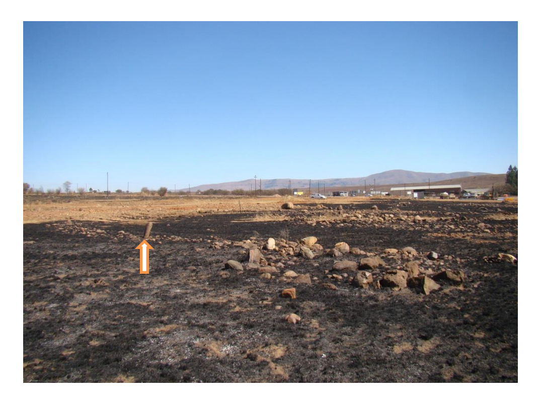
Photo 21: The inner circle of Unit 4. A stone wall extended to the left (south) with a prominent upright stone visible (indicated by the arrow). A few upper grinders were observed in this unit.