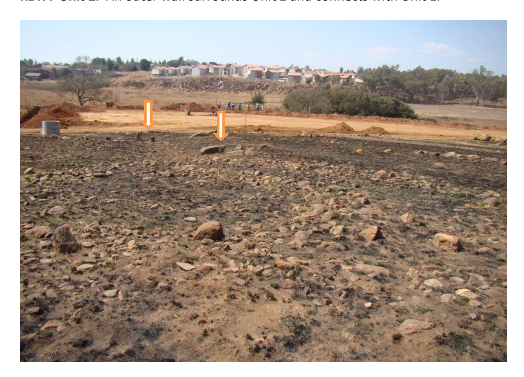
Photo 8: The circular walls of RDR 7 (2) are visible. The arrows indicate the upright stones (left) which indicate the entrance at the outer wall. Two prominent large stones also form part of the outer wall (arrow to right).