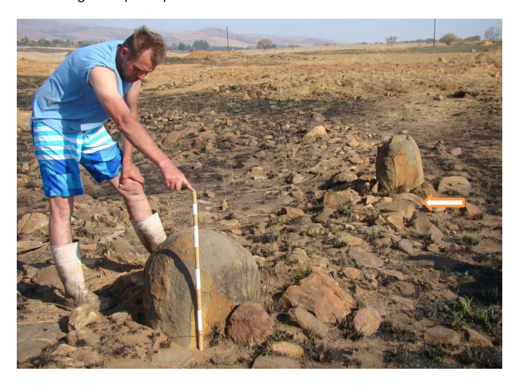
Photo 16: Two prominent stones form an entrance to unit 3. There are two distinct flat stones indicated by the arrow in the entrance (see detail in Fig. 17).