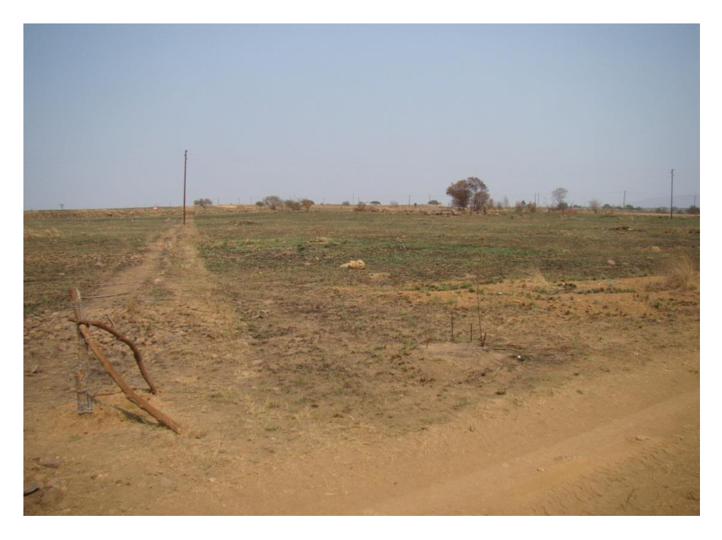
Photo 3: The rock engraving site is situated at the rocky outcrop in front of the big tree.