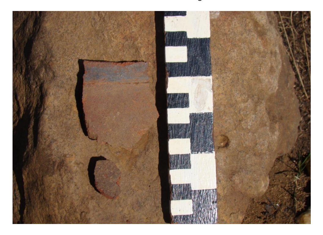
Photo 7: Potsherds associated with unit 1, which were discovered in the disturbed road section. The potsherd has a single line and graphite decoration.