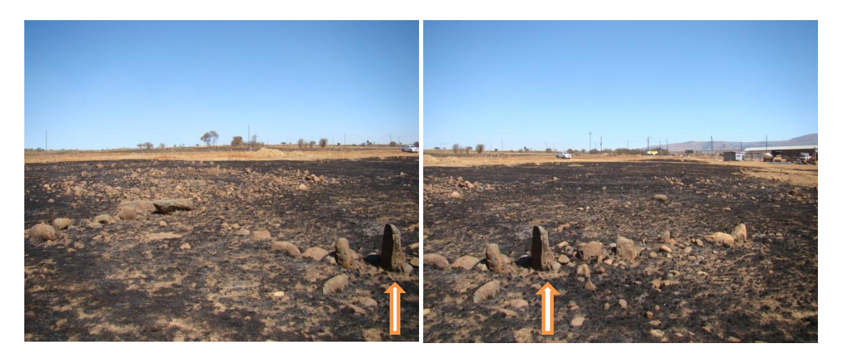
Photo 19 & 20: Unit 4 is to the extreme east of RDR 7. The two photos overlap at the prominent upright stone entrance (indicated with arrows). The extent of the unit is visible.