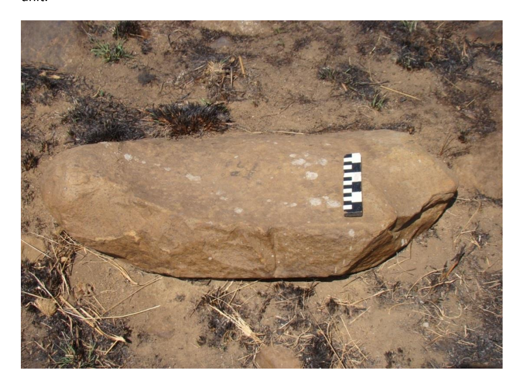
Photo 5: A large stone which might have been used in the entrance of the unit (see Fig. 4).