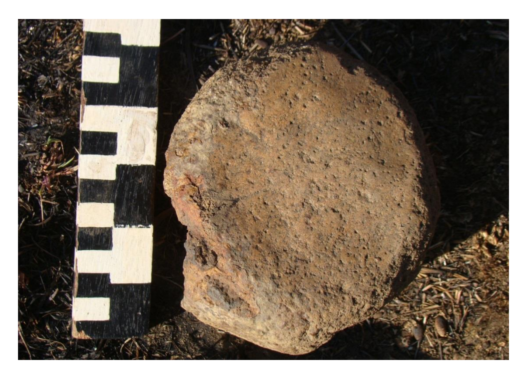
Photo 13: An upper grinder which was found on the deteriorated stone wall of Unit 2.