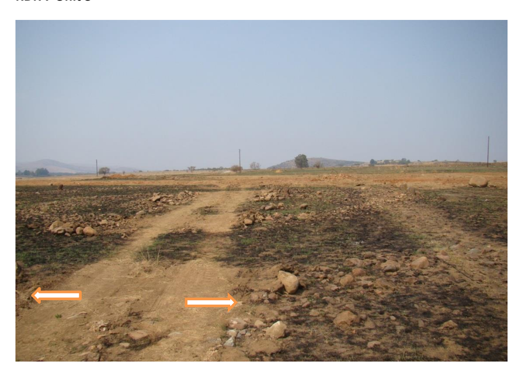
Photo 15: Unit 3 has already been impacted upon by a dirt road. The outer wall of the unit is visible in the foreground (arrow) and the inner walls are visible in the middle section.