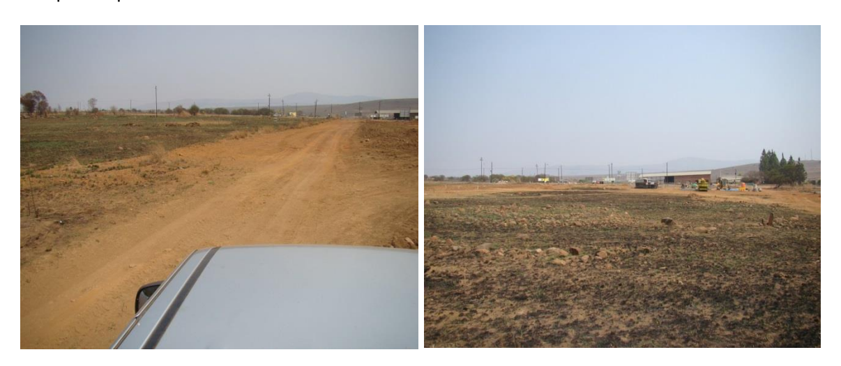
Photo 1 & 2: Photos facing west. The site has already been impacted upon by a dirt road. The rock engraving, RDR 8 is to the south of the dirt road. The deteriorated stone walls of RDR 7 (2, in foreground) and RDR 7 (1) in background are visible after the area was burnt.