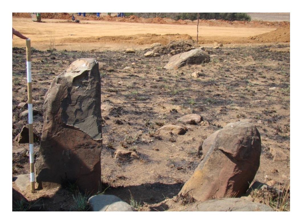
Photo 11: Close-up of the 2 upright stones which indicate the entrance of Unit 2. The stone on the left is rubbed smoothly at the top.