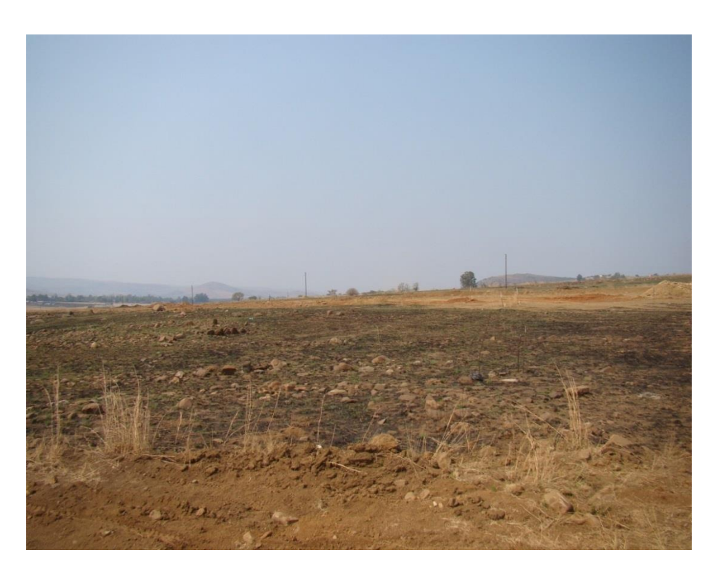
Photo 6: Unit 1 with the disturbed road in the foreground. Unit 2 is visible towards the middle left.