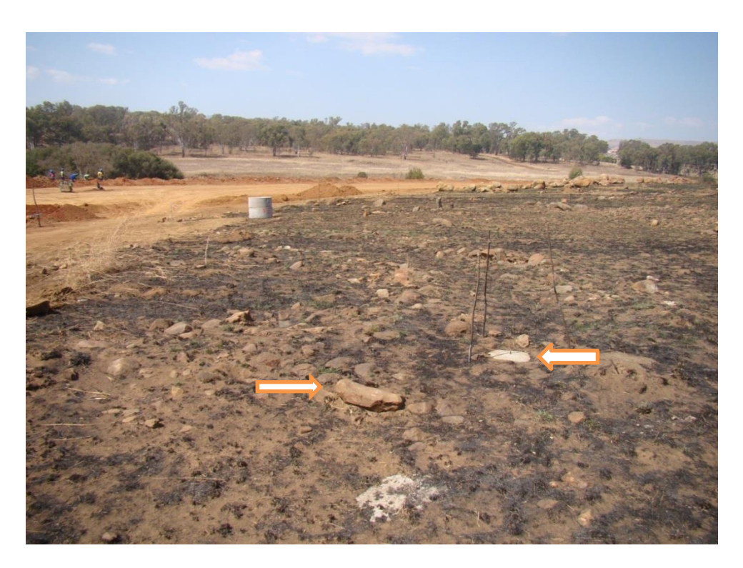
Photo 4: RDR 7 (1) Facing east: This site has already been impacted upon by a dirt road. A recent beacon is visible in the stone walls, which was used as a marker. The potsherds (Fig. 7) were found in the disturbed section towards the left. Indistinct walls are visible which form part of a circular unit.