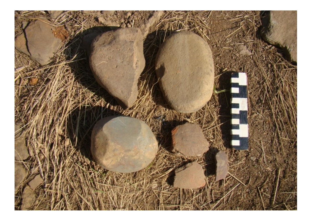
Photo 18: A few upper grinders and clay potsherds without decoration which were found in the disturbed section of the road in Unit 3.