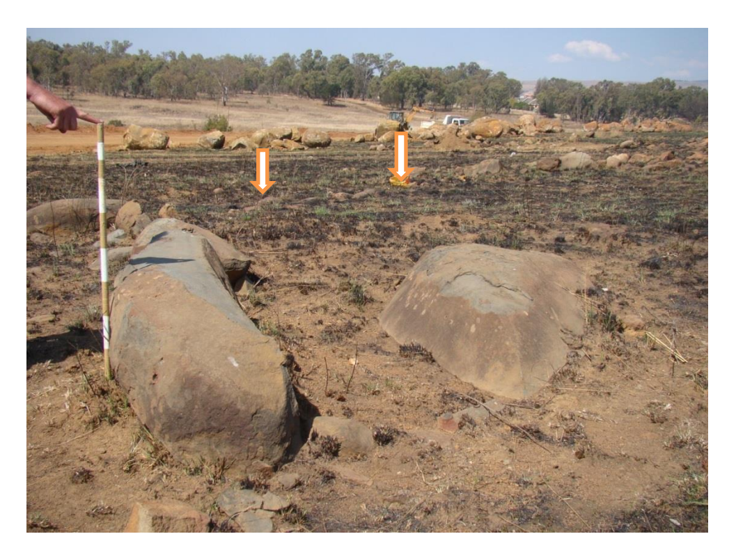
Photo 12: The two large stones which are incorporated as part of the outer wall which is visible at the arrows.