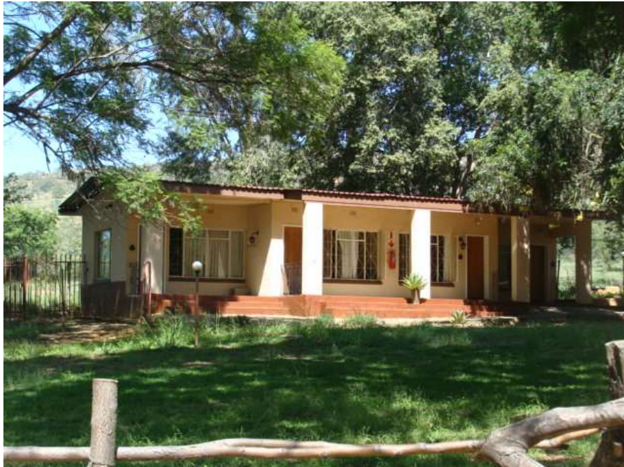
Figure 13: Residential building.