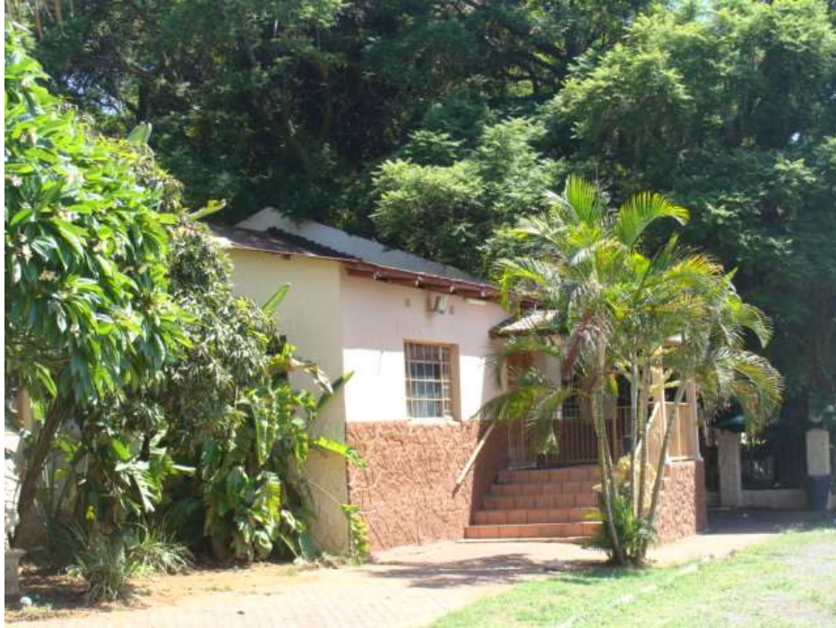
Figure 10: Another example of a formal building with little heritage value in the study area.