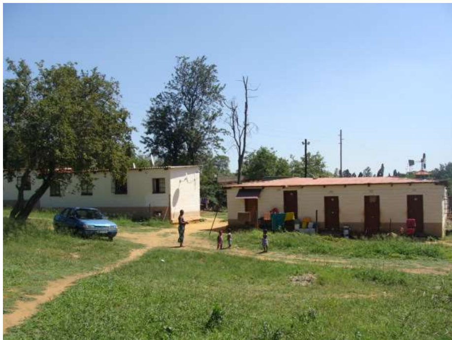
Figure 9: Examples of buildings with no heritage value.