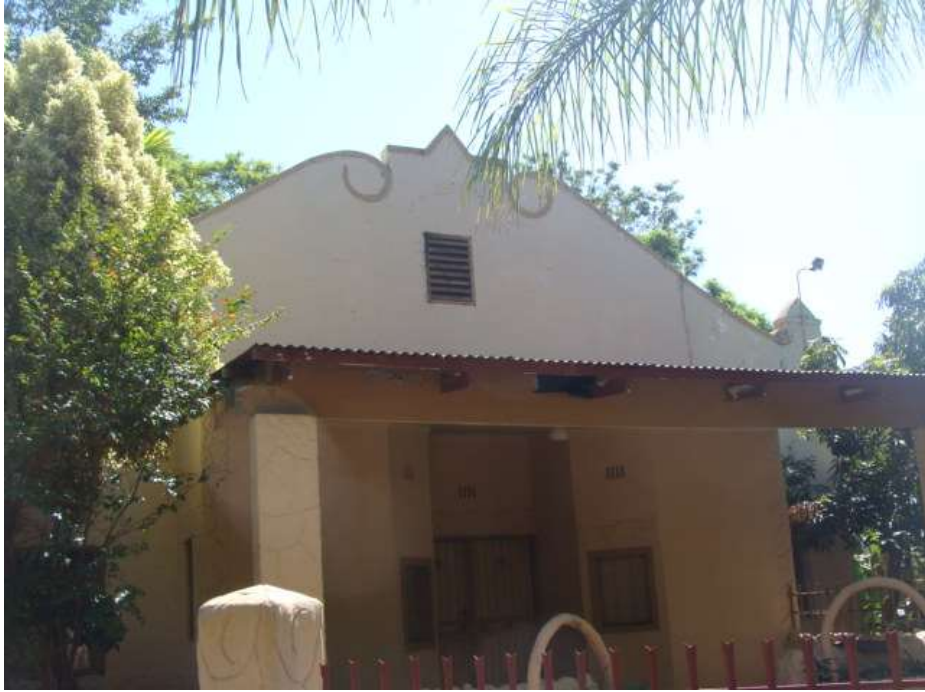
Figure 12: The hotel building.

Building 2 is used for residential purposes (Figure 13).