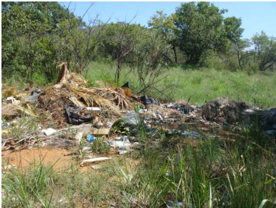
Figure 7: illegal dumping towards the west of the surveyed area.