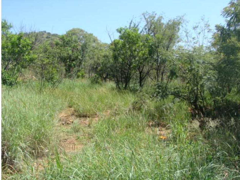
Figure 6: View of dense vegetation towards the west of the surveyed area.