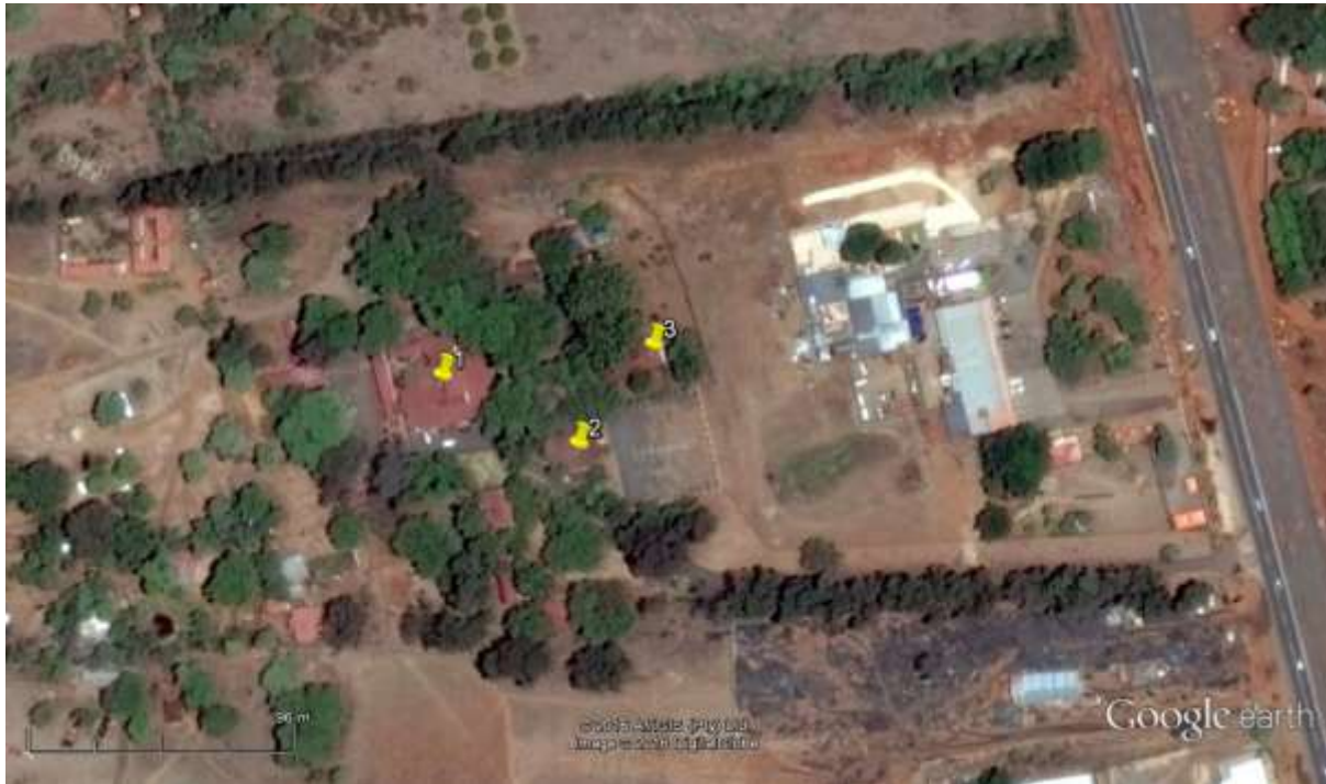
Figure 11: Google image indicating the location of the three buildings identified.

Mitigation would comprise a Phase II heritage report consisting of photographic documentation of the structures and making detailed drawings identifying heritage features and making line drawings of the buildings. After mitigation, it may either be demolished or altered. In both cases a permit would have to be obtained from the Provincial Heritage Authority of the North West Province.