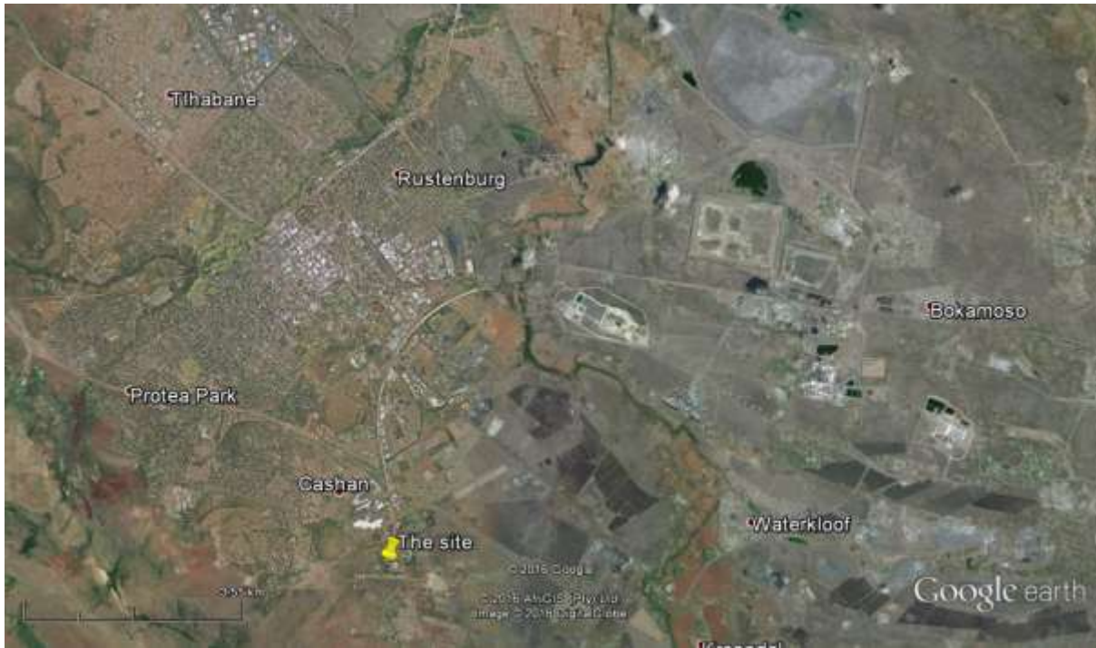
Figure 2: Location of the project in relation to Rustenburg. North reference is to the top.