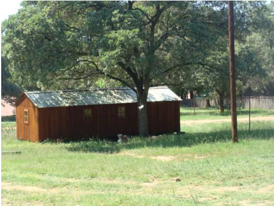
Figure 8: Temporary structure in the surveyed area.