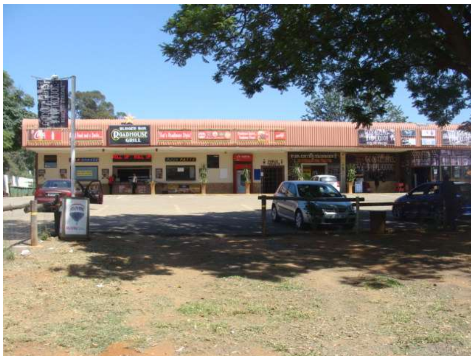
Figure 5: View of a commercial infrastructure.

Three buildings, however, do have heritage value. These will be discussed below.