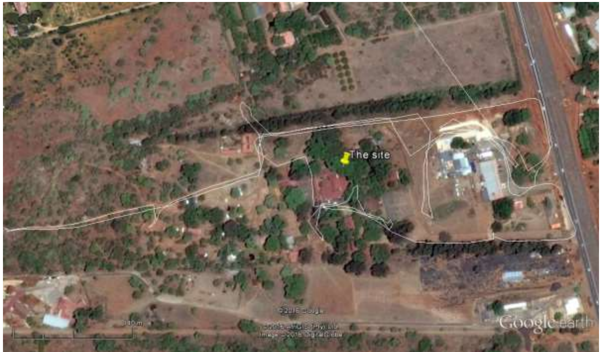
Figure 4: GPS track of the surveyed area. North reference is to the top.