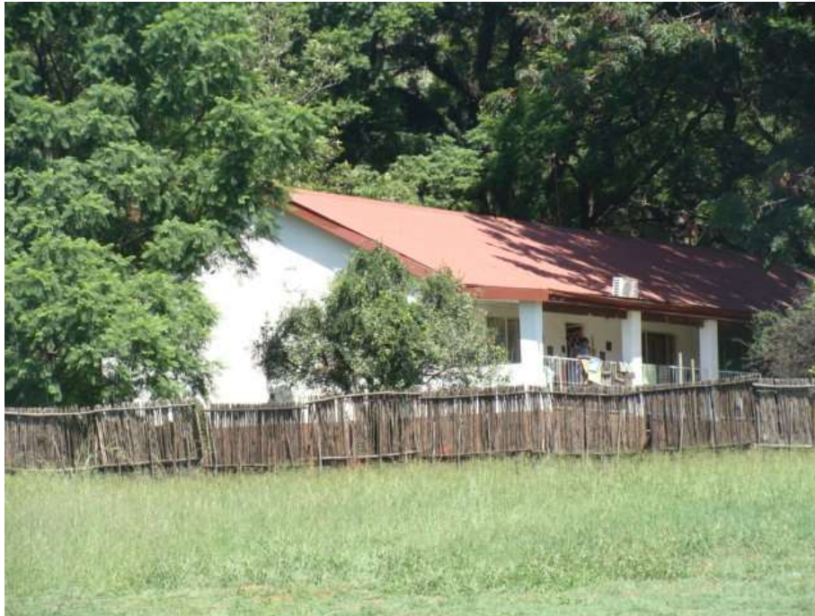
Figure 14: Another residential building older than 60 years.