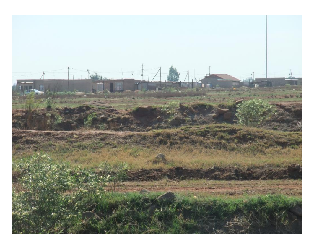
FIGURE 8: EARTHWORK ACTIVITIES AT THE SURVEYED AREA.