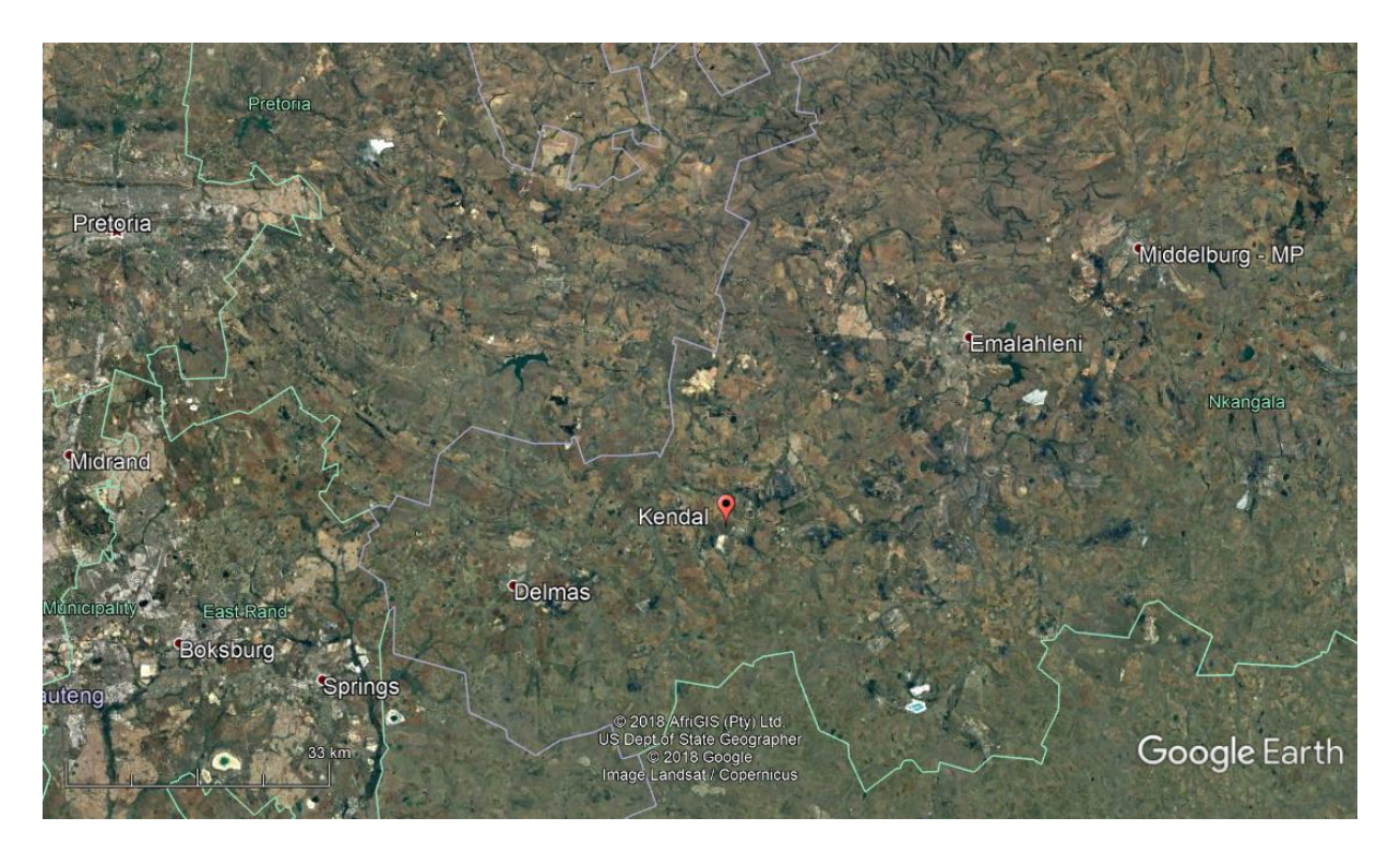
FIGURE 1: LOCATION OF DELMAS IN THE MPUMALANGA PROVINCE.

The project entails the formalization of an existing settlement, known as Arbor Village (Figure 3-4). As part of this project, additional residential stands and a cemetery will be provided. The heritage study forms part of an Environmental Impact Assessment. The Client indicated the area to be surveyed. This was done on foot and via off-road vehicle in October 2018.