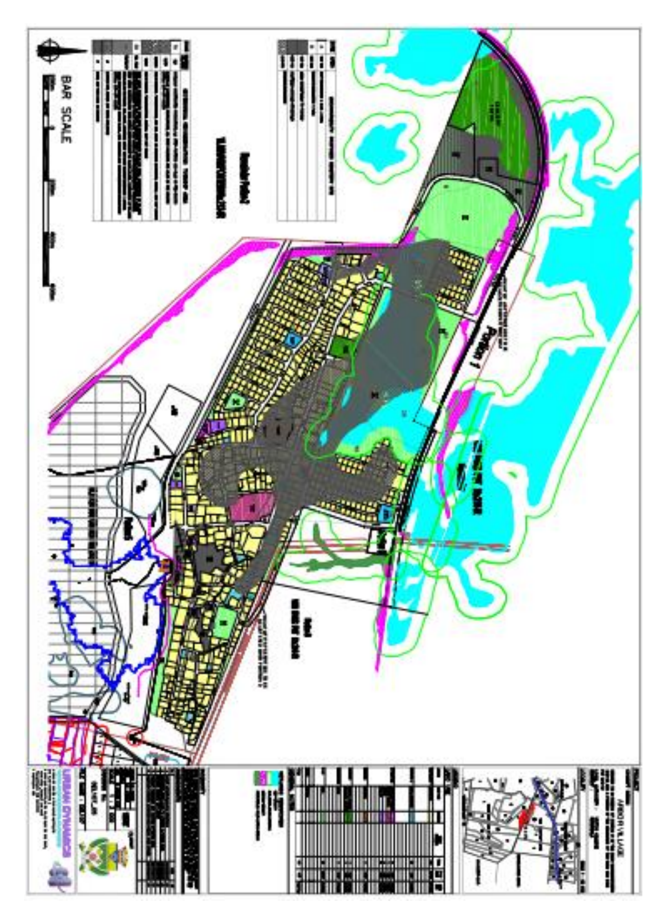
FIGURE 4: DEVELOPMENT LAYOUT (ADIENVIRONMENTAL).