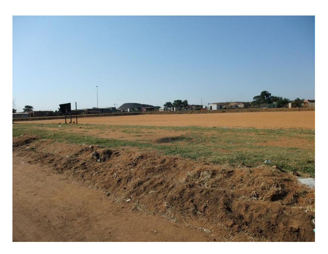
FIGURE 7: OPEN SECTION OF LAND IN THE SURVEYED AREA.