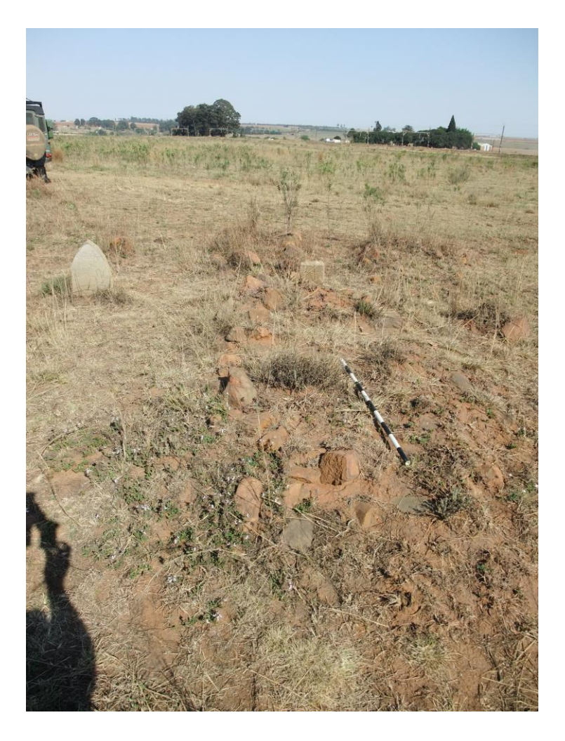
FIGURE 14: SOME OF THE GRAVES AT SITE NO. 2.