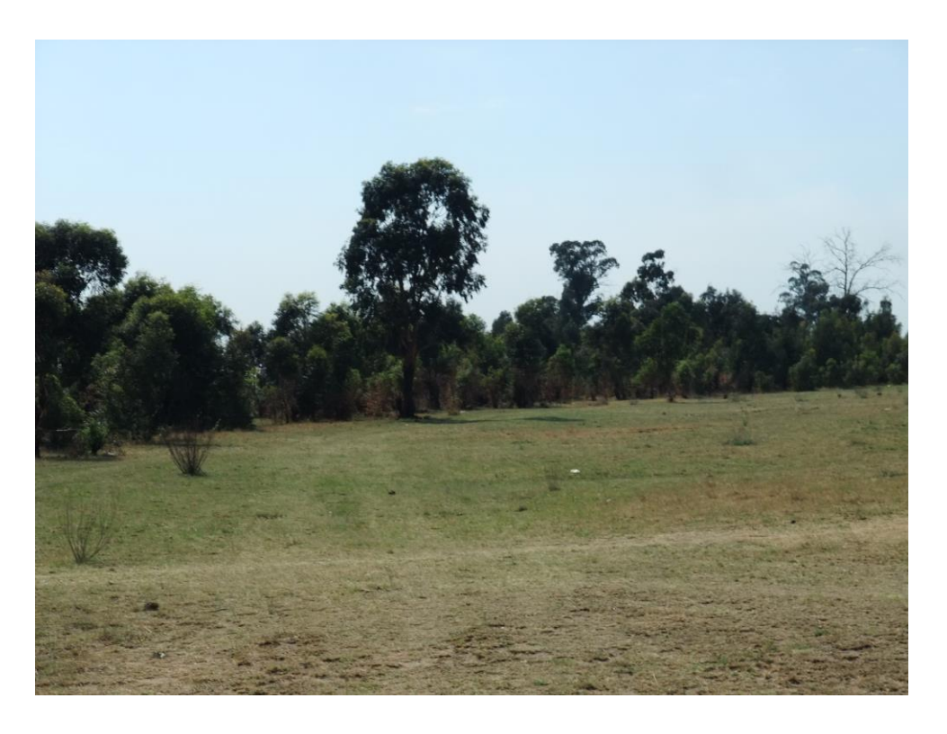
FIGURE 12: VIEW OF VEGETATION AND ALIEN TREES IN THE SURVEYED AREA.