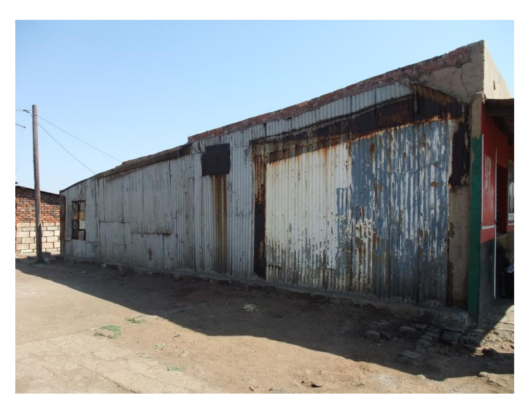
FIGURE 16: STONE AND CORRUGATED IRON HISTORICAL BUILDING.