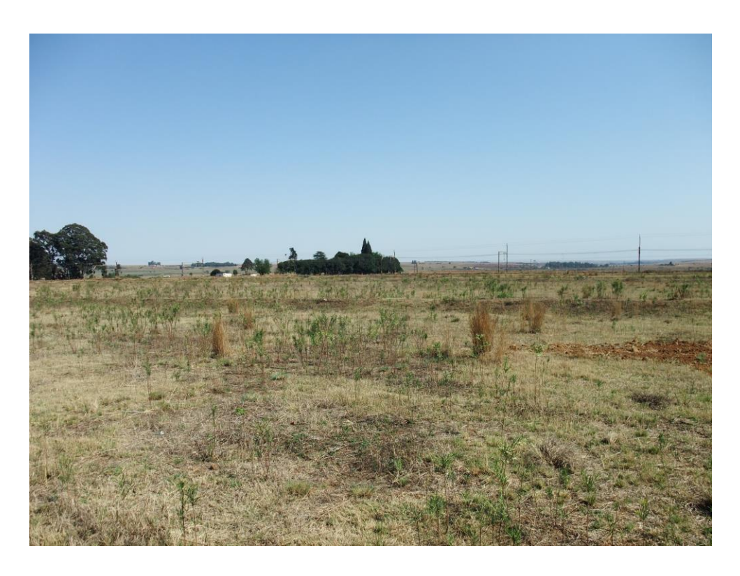
FIGURE 10: OLD FIELDS IN THE SURVEYED AREA.