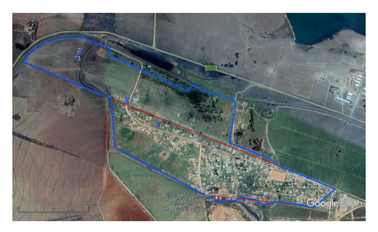
FIGURE 17: LOCATION OF SITES IDENTIFIED DURING THE SURVEY.