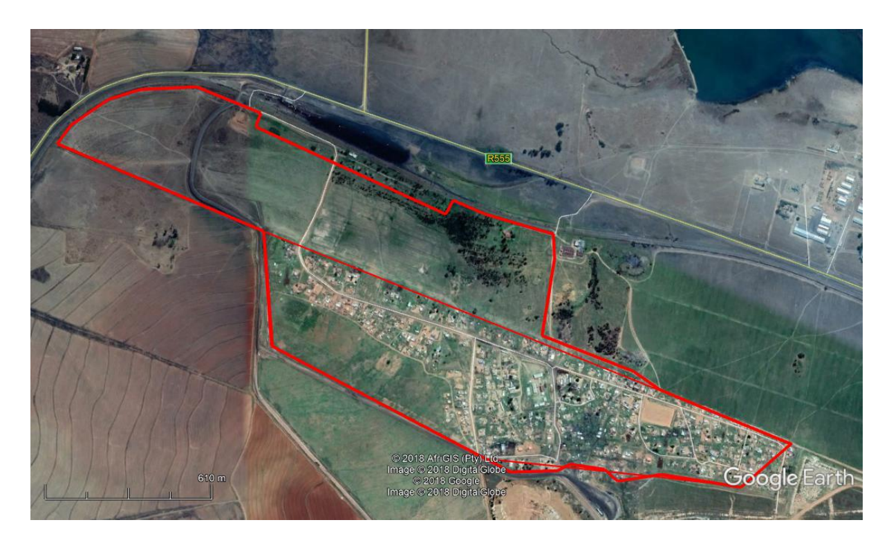
FIGURE 3: ZOOMED IN VIEW OF SURVEYED SITE.