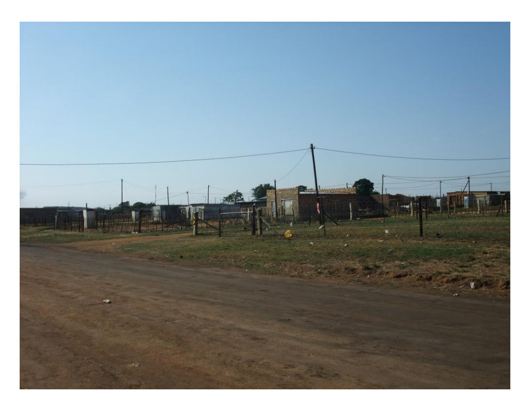
FIGURE 6: HOUSES IN THE SURVEYED AREA.