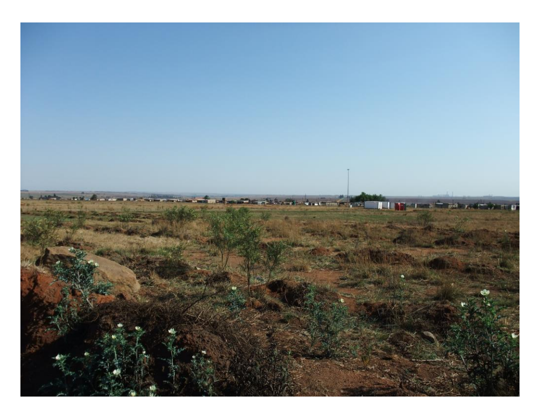
FIGURE 11: VIEW OF VEGETATION IN THE SURVEYED AREA.