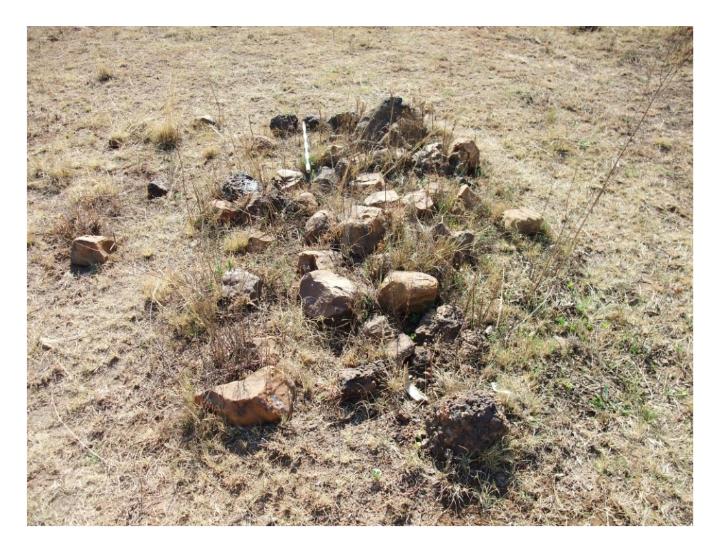
FIGURE 15: SINGLE GRAVES - SITE NO. 3.