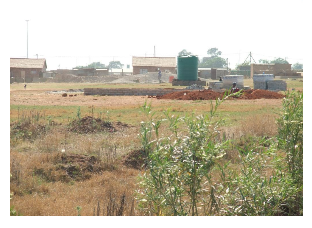
FIGURE 9: BUILDING ACTIVITIESIN THE SURVEYED AREA.