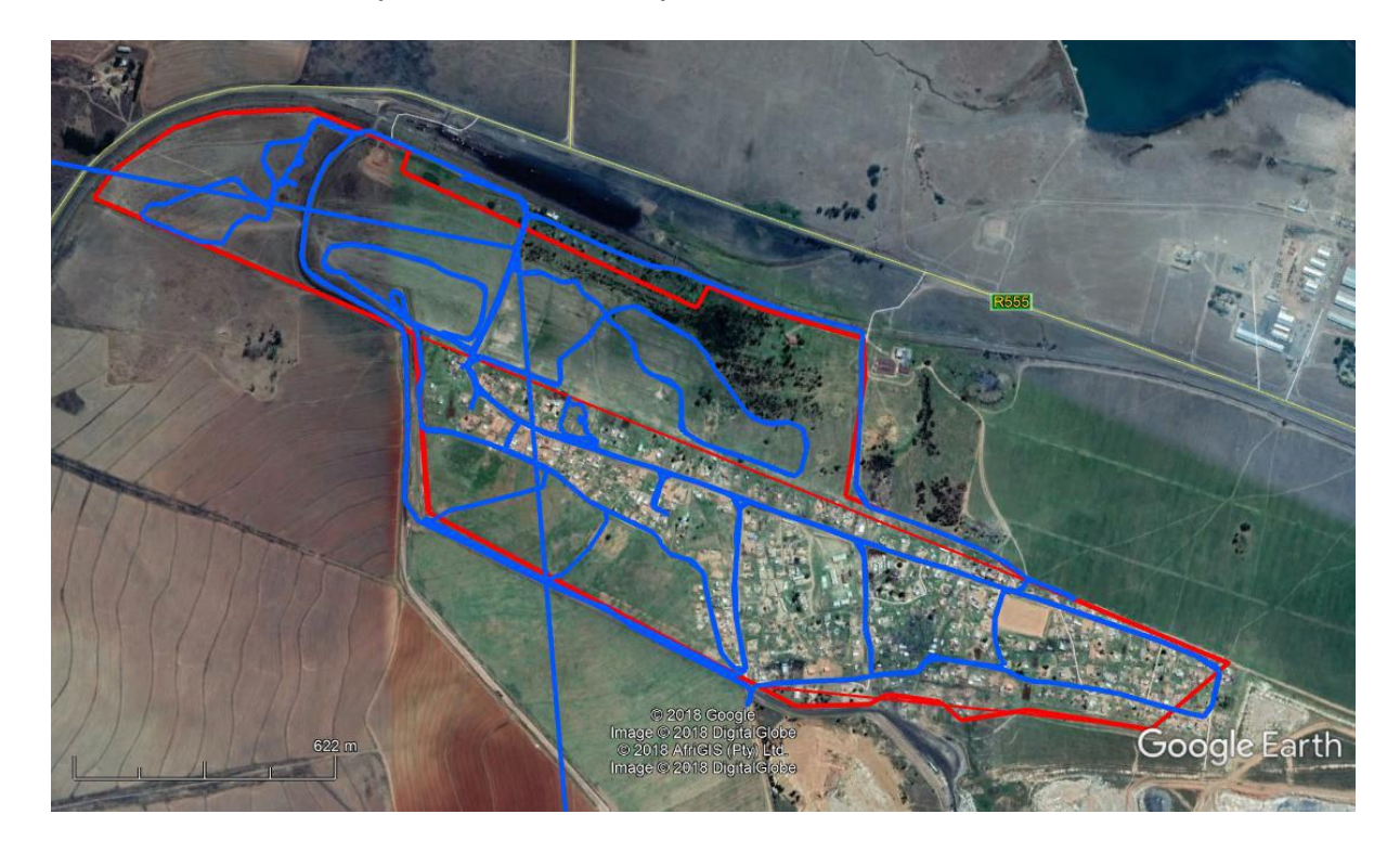
FIGURE 5: GPS TRACK OF THE SURVEY.