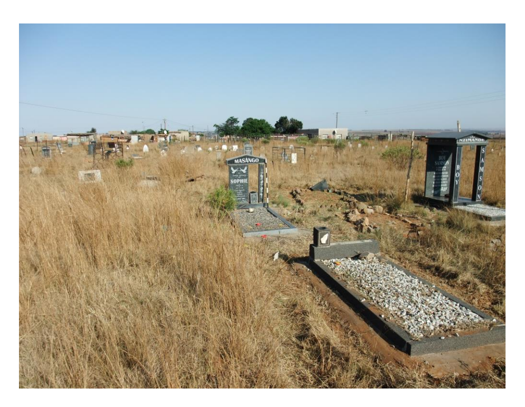
FIGURE 13: SOME OF THE GRAVES AT SITE NO. 1.