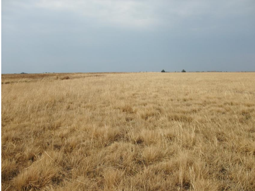
Figure 8: View of vegetation in the surveyed area.