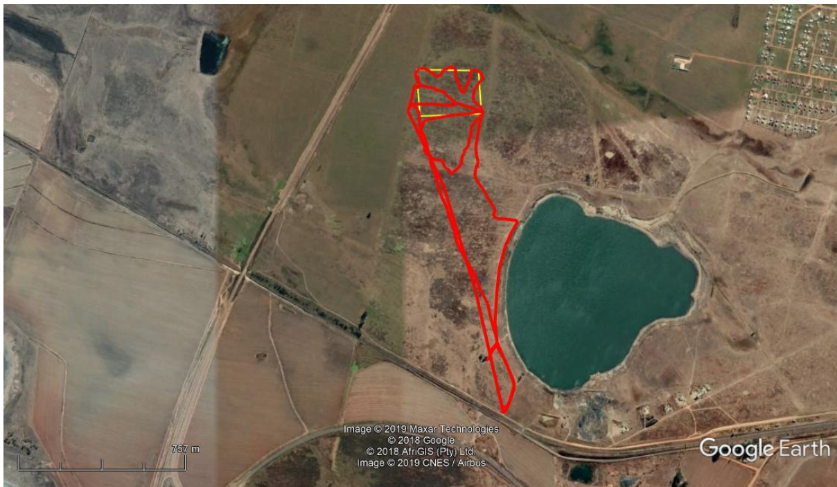
Figure 5: GPS track of the surveyed area. North reference is to the top.

Certain factors, such as accessibility, density of vegetation, etc. may however influence the coverage. The size of the area that was surveyed is approximately 5 Ha and the length of access road is approximately 1 km. The survey took two hours to complete.