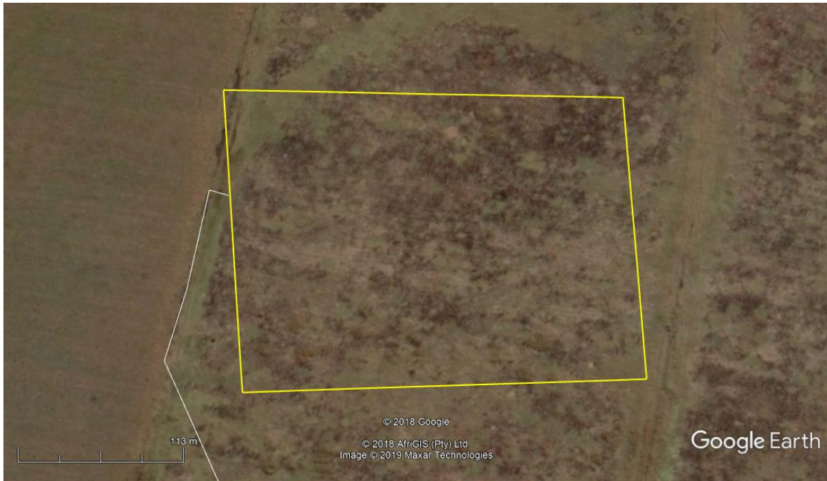
Figure 4: Detailed view of proposed cemetery site.