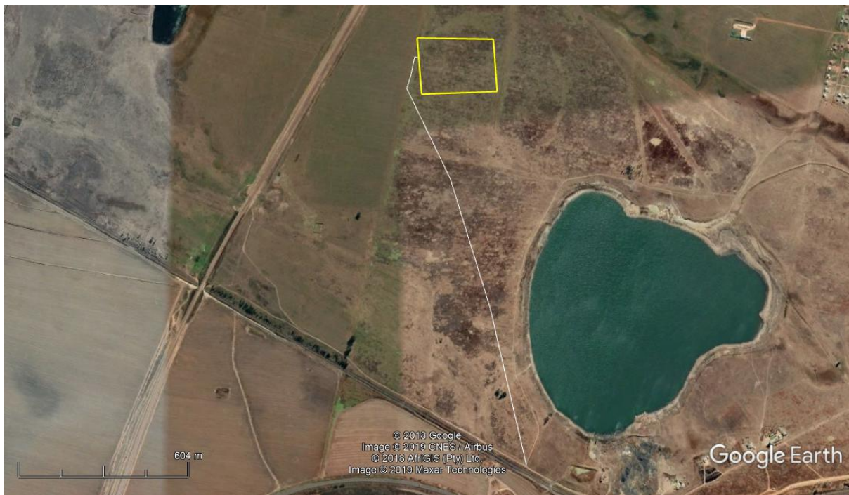
Figure 3: Google Earth image indicating the proposed cemetery (yellow) and access road (white).