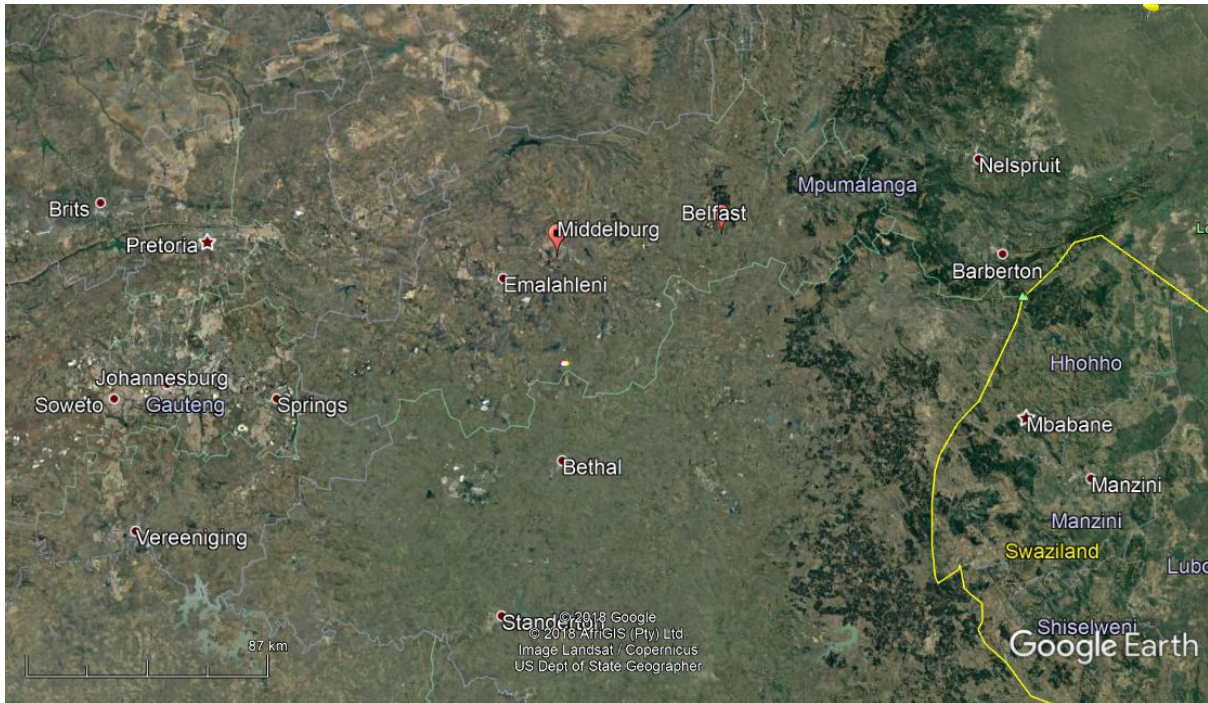
Figure 1: Location of Middelburg and Belfast in the Mpumalanga Province. North reference is to the top.

The client indicated the area to be surveyed. The field survey was confined to this area.