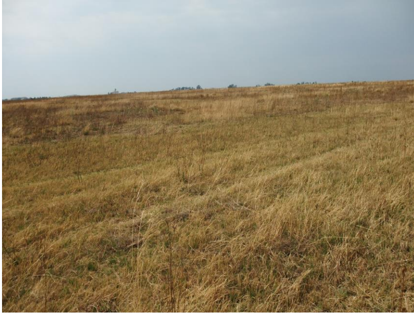
Figure 6: Old agricultural fields in the surveyed area.