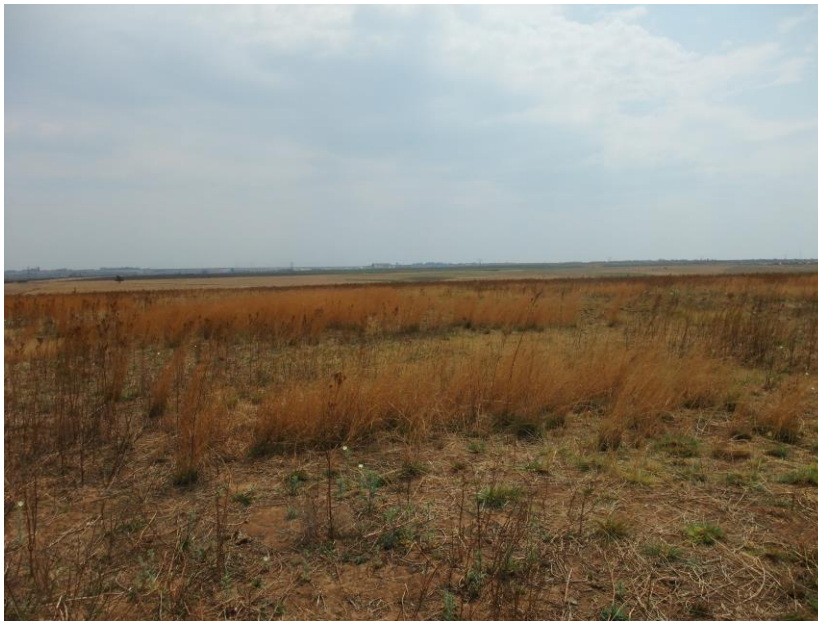
Figure 7: General view of the surveyed area.