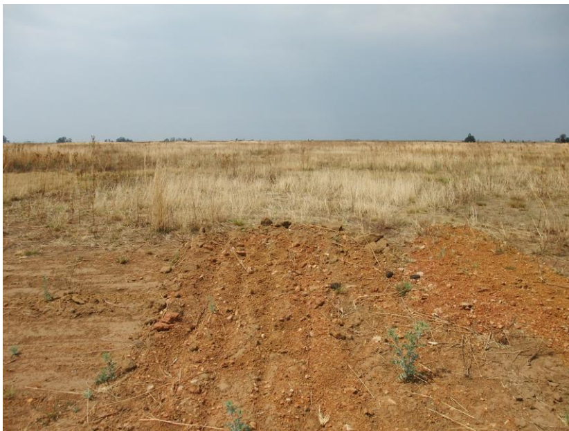
Figure 9: One of several open patches in the surveyed area.