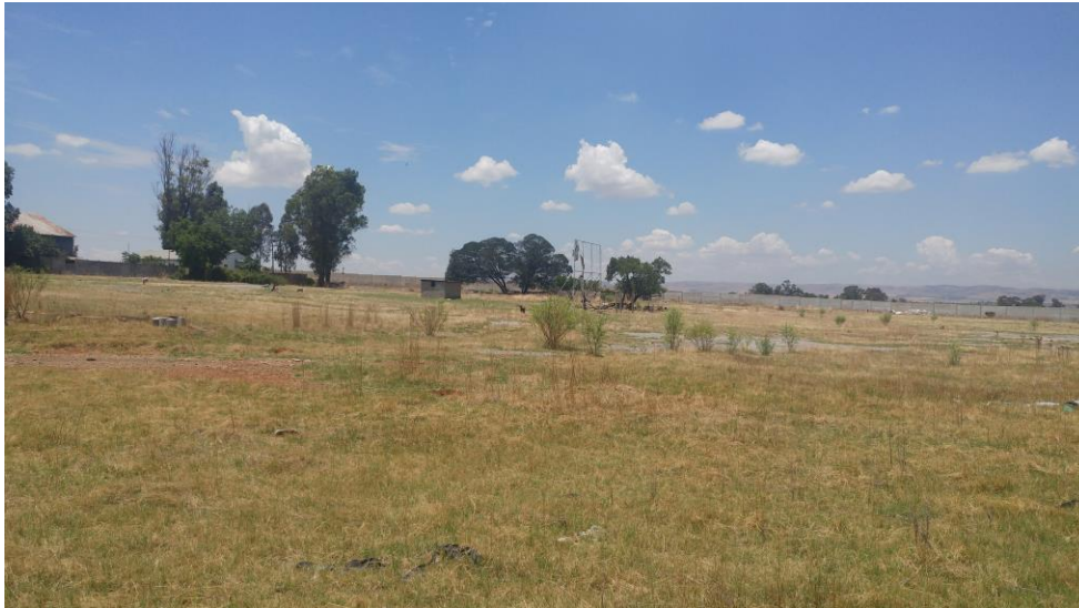
Figure 11: View of the general environment.