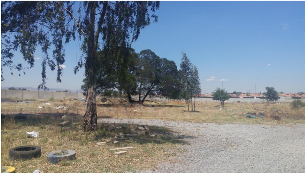
Figure 9: General view of the surveyed area.