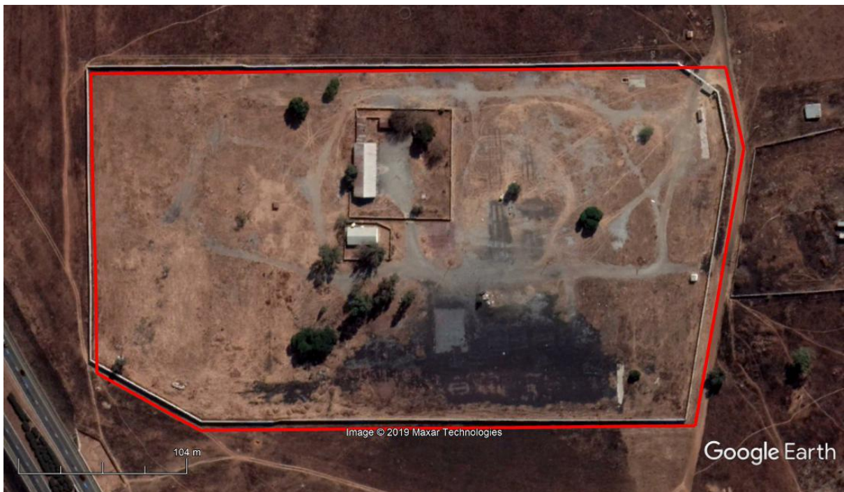
Figure 3: Google Earth image indicating a detailed view of the site.