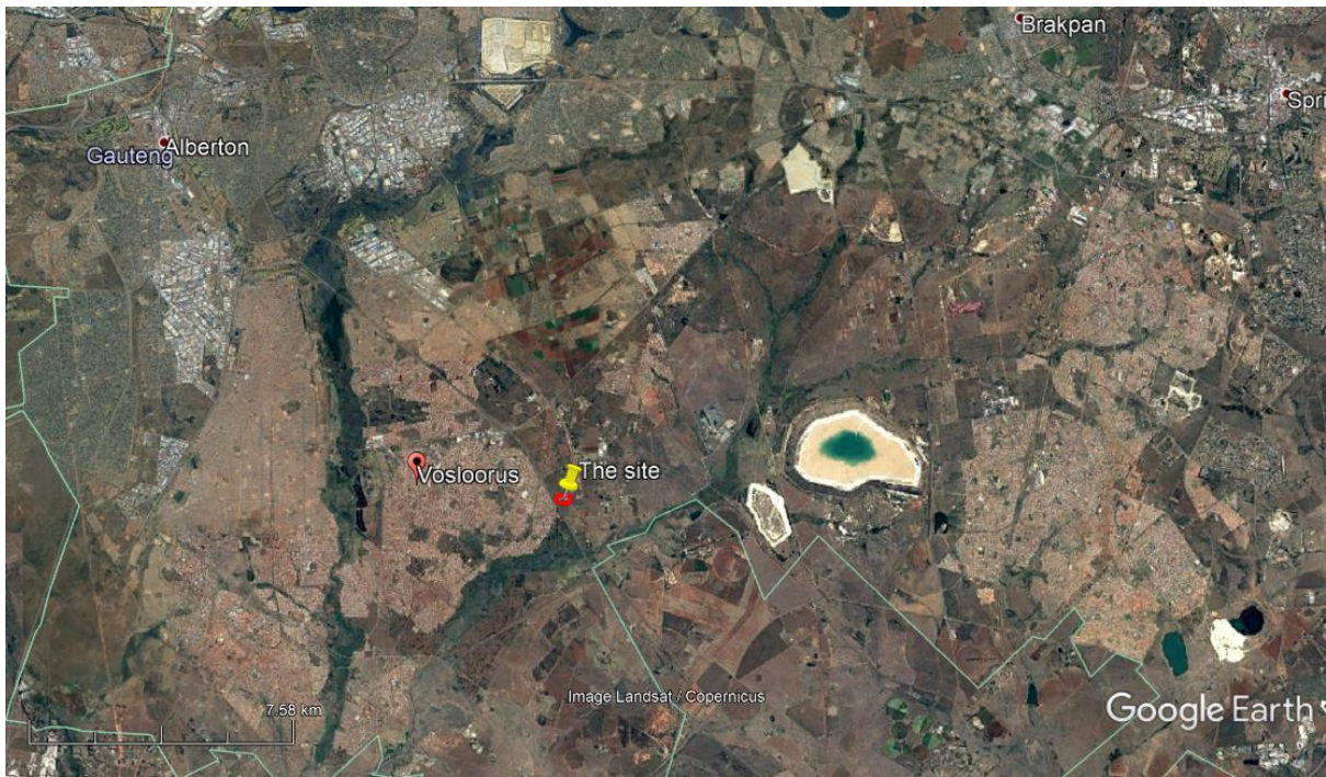
Figure 2: Location of the site in relation to Vosloorus. North reference is to the top.