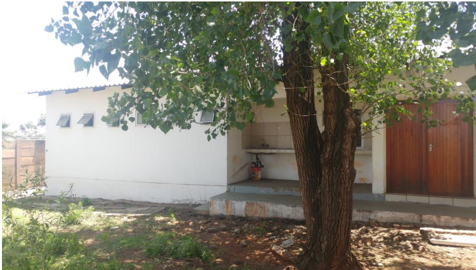
Figure 7: Example of one of the buildings on site.

The area thus shows short grass and other pioneers species such as weeds, as well as a few alien trees, in between roads and open patches of soil (Figure 9-11). The topography of the site is mostly flat. No outstanding natural features are present.