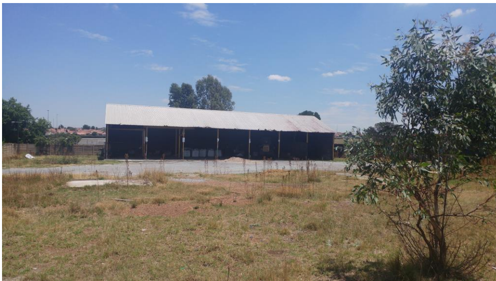
Figure 8: A temporary structure on site.