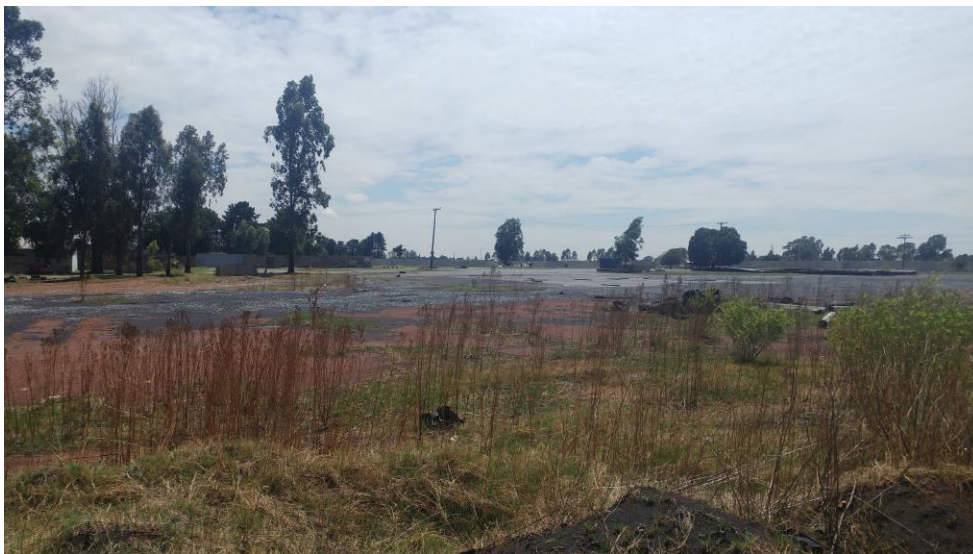
Figure 10: Roads and pioneer plant species in the surveyed area.