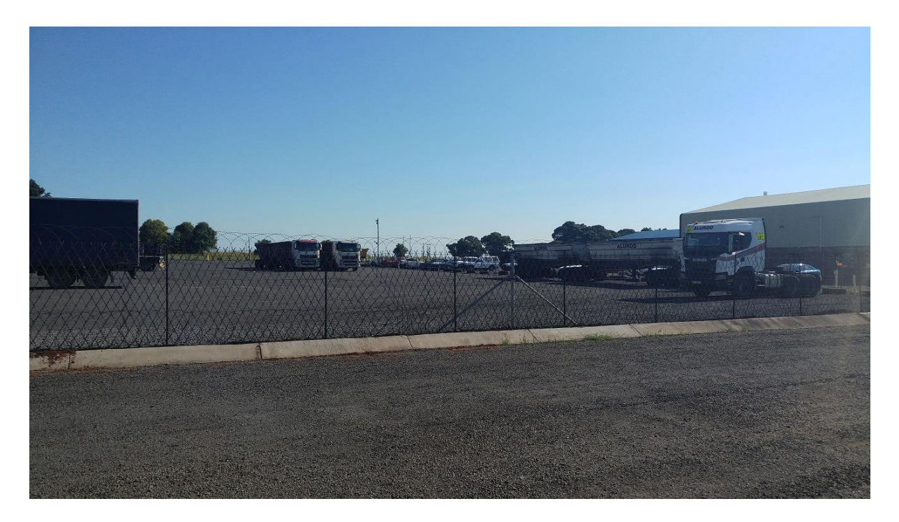
FIGURE 6: TRUCK STOP IN SURVEYED AREA.