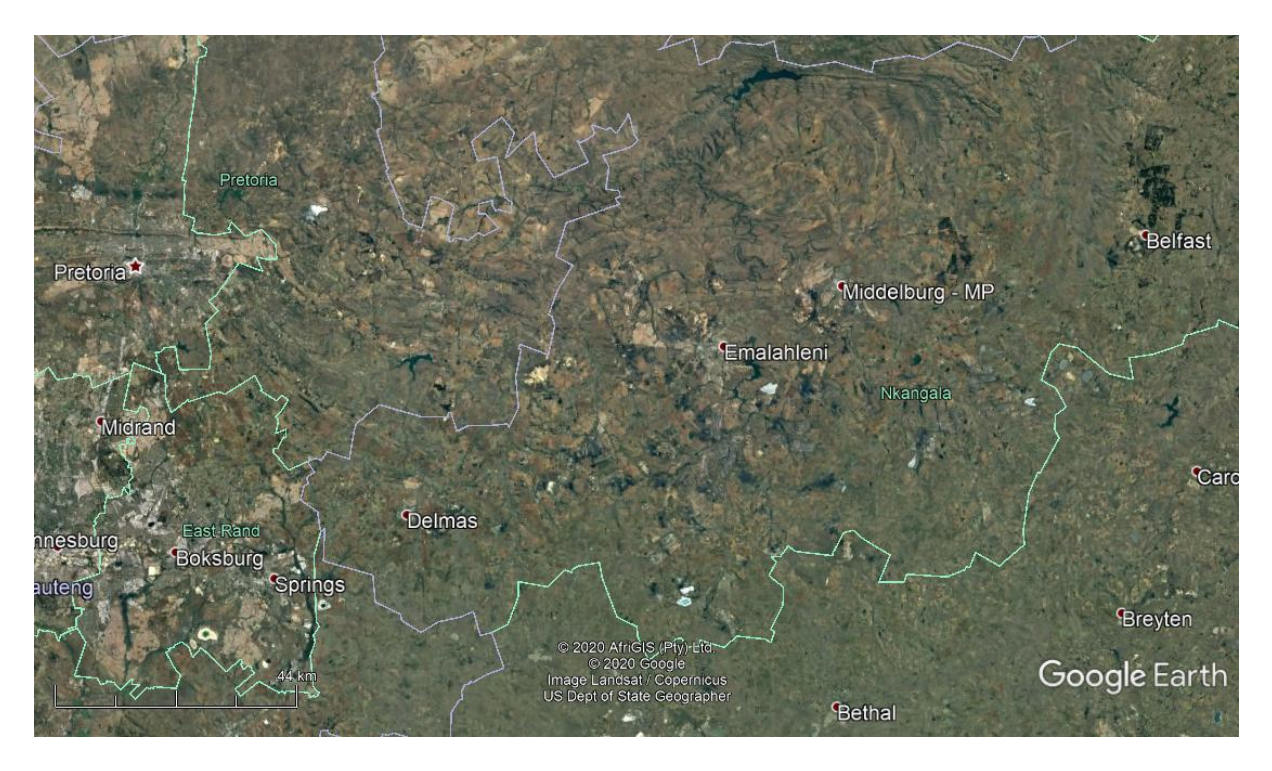
FIGURE 1: LOCATION OF MIDDELBURG IN THE MPUMALANGA PROVINCE.

The project entails the development of a light industrial area (for the purpose of e.g. motor showrooms, workshops, etc.). The heritage study forms part of an Environmental Impact Assessment. The Client indicated the area to be surveyed. This was done on foot and via off-road vehicle in February 2020. A central coordinate for the development is 25°50'01.31"S and 29°27'51.06"E.