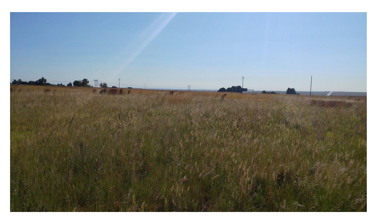
FIGURE 9: VIEW OF VEGETATION IN THE SURVEYED AREA.