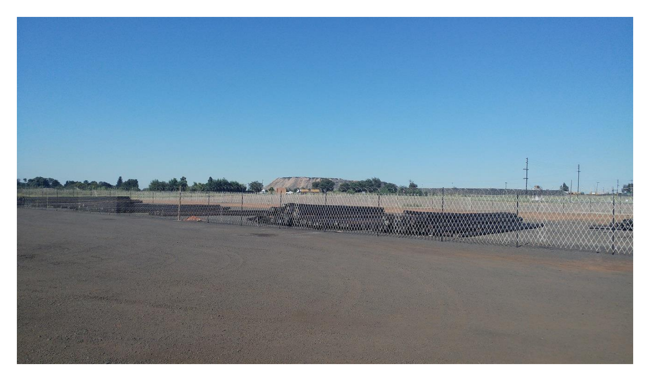
FIGURE 7: OPEN STORAGE IN THE SURVEYED AREA.