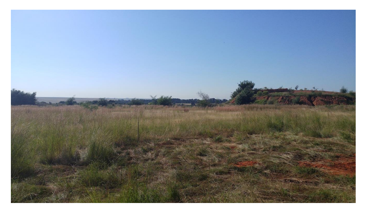
FIGURE 10: OPEN GRASSY FIELD WITH SCATTERED SCRUBS AND TREES IN THE SURVEYED AREA.