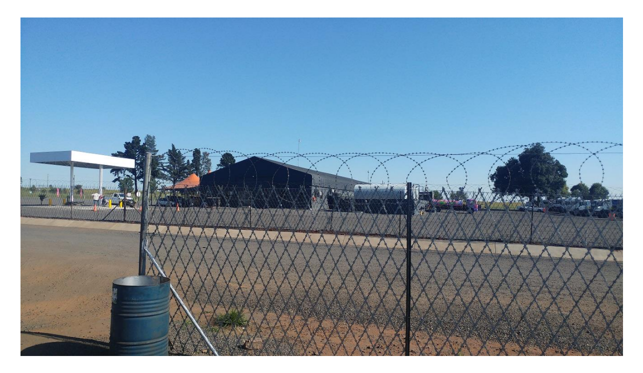
FIGURE 8: PROCESSING OR STORAGE BUILDING AT THE SURVEYED AREA.