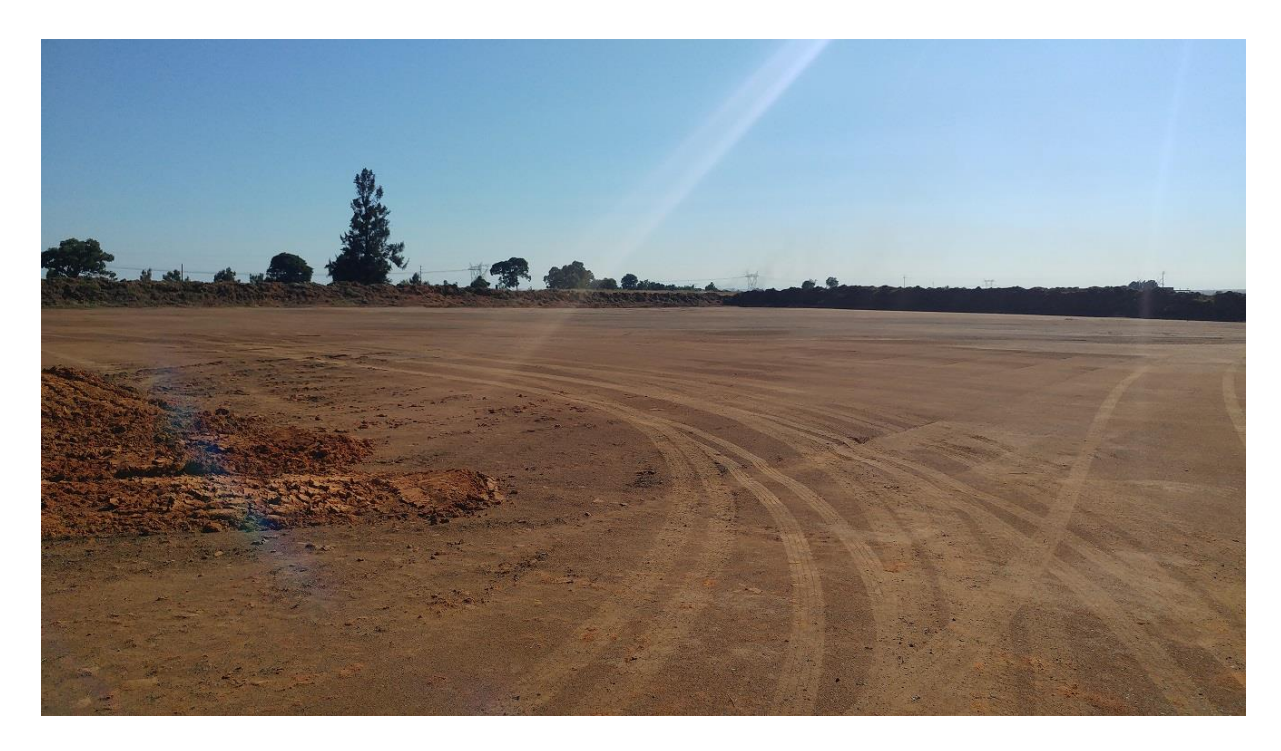
FIGURE 11: EARTHWORK ACTIVITIES IN THE SURVEYED AREA