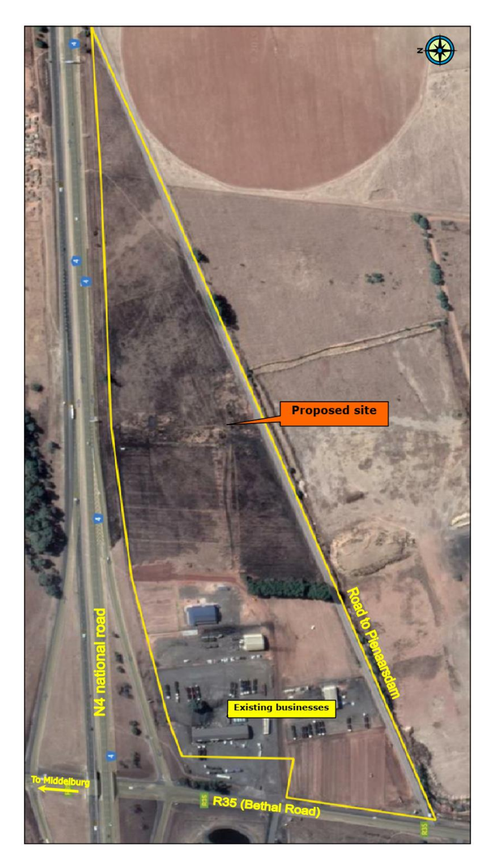
FIGURE 3: ZOOMED IN VIEW OF SURVEYED SITE (ADIENVIRONMENTAL).