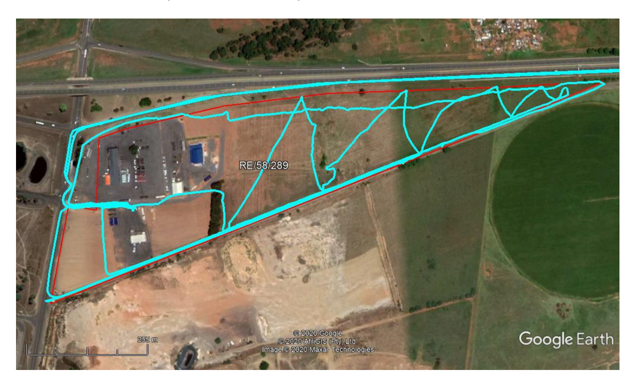
FIGURE 5: GPS TRACK OF THE SURVEY.

• Potential to answer present research questions.