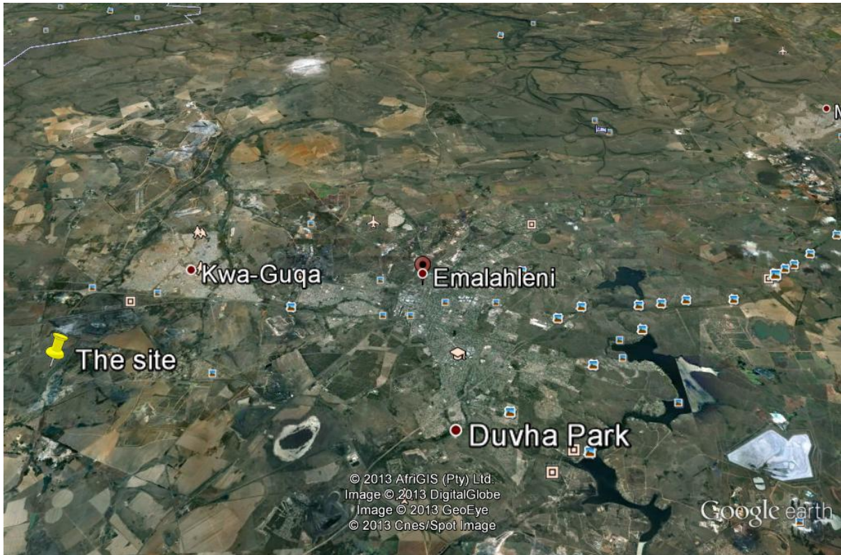
Figure 2 Location of the site in relation to Emalahleni. North reference is to the top.