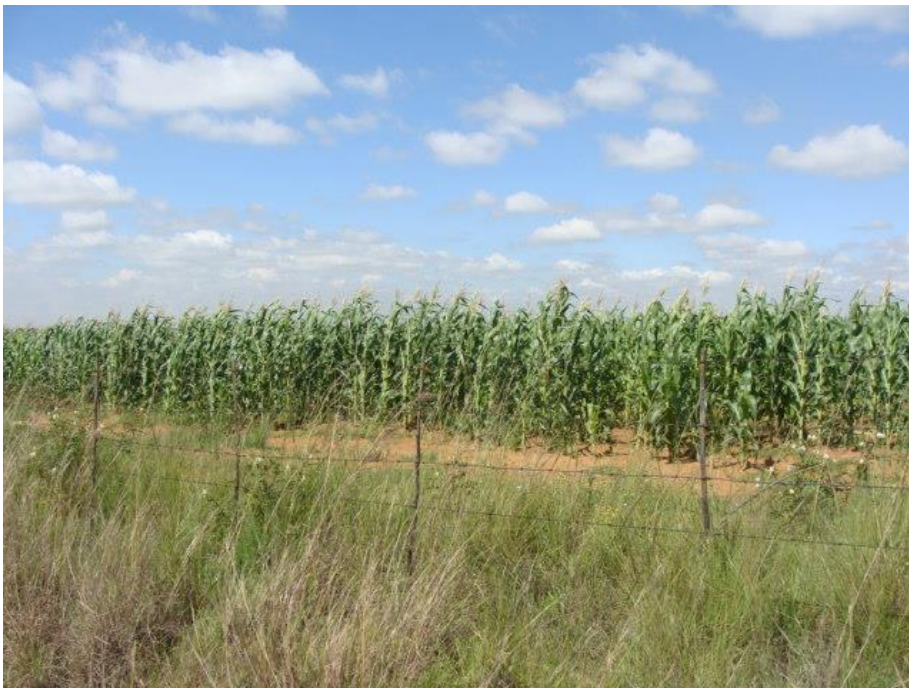
Figure 6 Another view of the surveyed area showing maize crops.