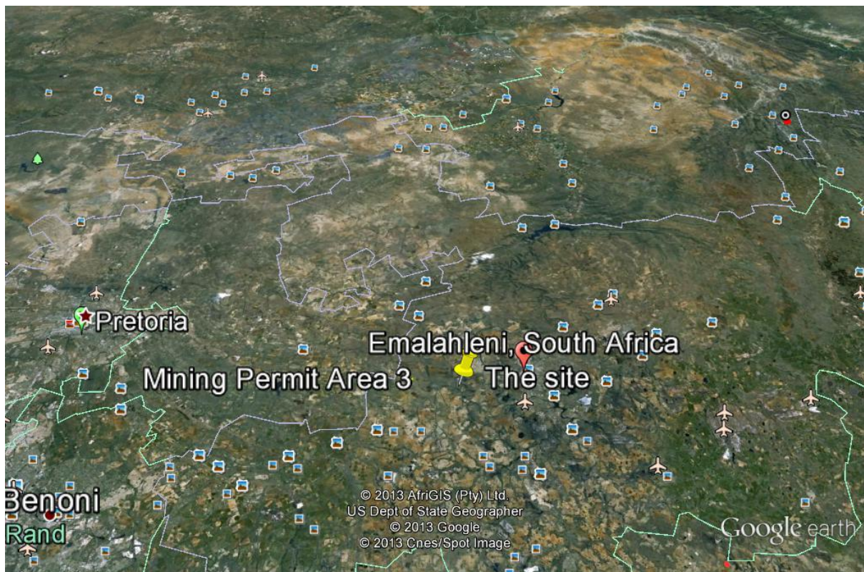
Figure 1 Location of the town of Emalahleni in Mpumalanga. North reference is to the top of the map.

The project is aimed at the eventual mining of coal. Accordingly no mine plan is yet available. The client indicated the area where the proposed development is to take place. The field survey was confined to this area.