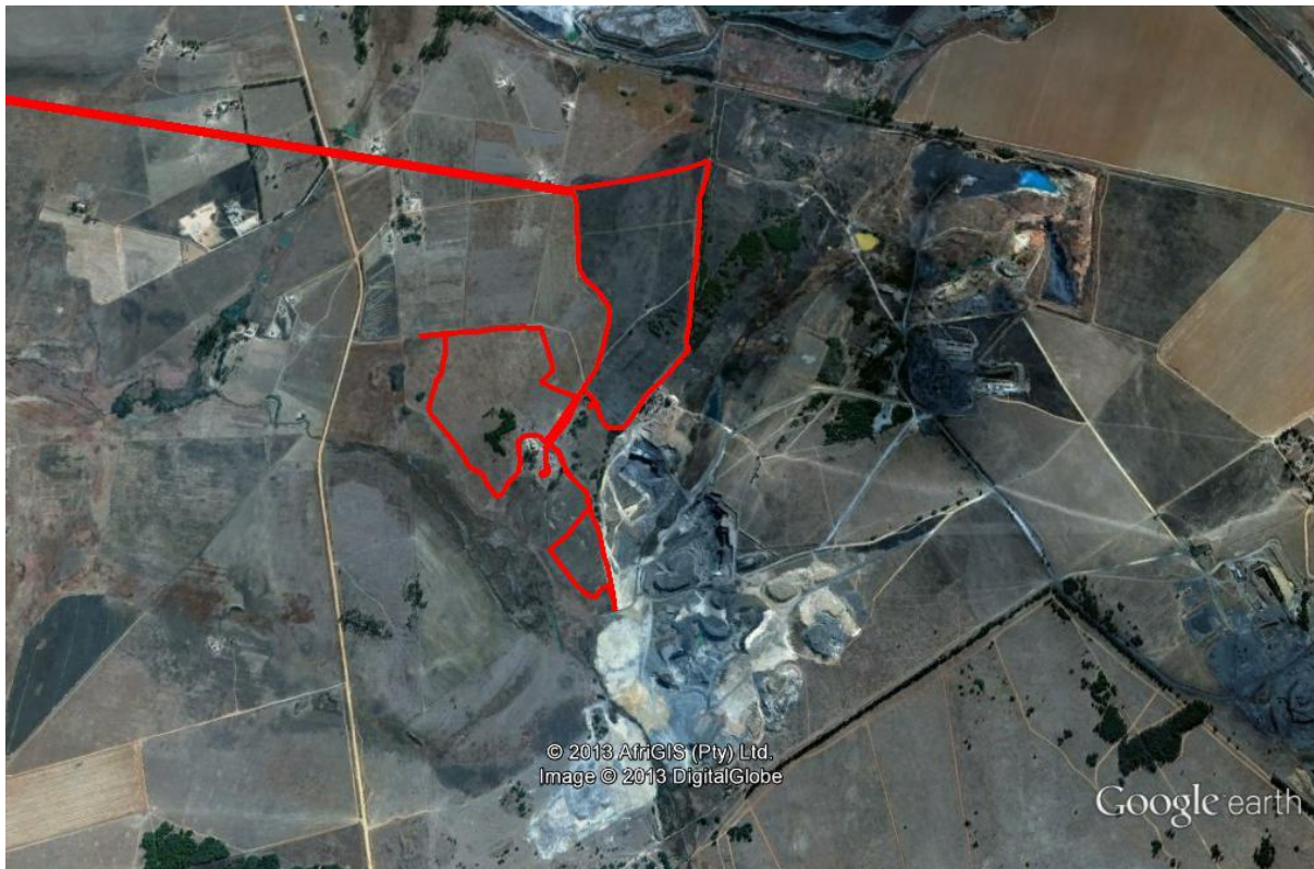
Figure 4 GPS track of the surveyed area. North reference is to the top.

If required, the location/position of any site was determined by means of a Global Positioning System (GPS) 1 , while photographs were also taken where needed. The survey was undertaken by a physical survey via off-road vehicle and on foot (Figure 4). Four hours were spent in the field.