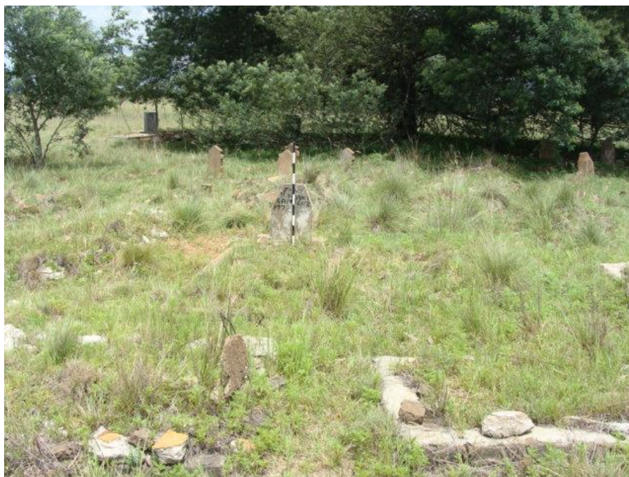
Figure 8 Some of the graves found at site no. 2.

The second option is to exhume the mortal remains and then to have it relocated. For this a specific procedure should be followed which includes social consultation. For graves younger than 60 years only an undertaker is needed. For those older than 60 years and unknown graves an undertaker and archaeologist is needed. Permits should be obtained from the Burial Grounds and Graves unit of SAHRA. This procedure is quite lengthy.