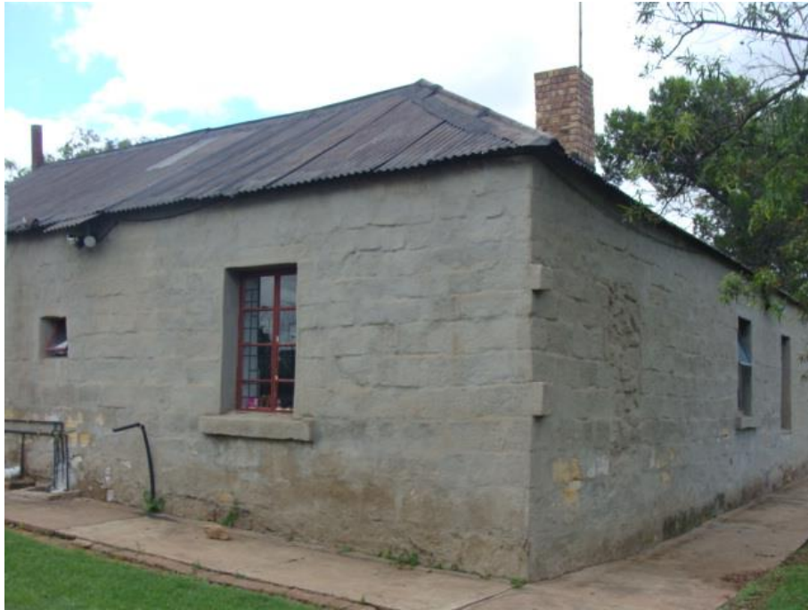
Figure 7 The farm house.

It is most likely not necessary as the coal seam does not go this far. However should it be demolished, a permit needs to be acquired from the Provincial Heritage Resources Agency of Mpumalanga.