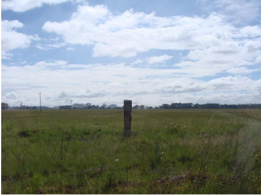
Figure 5 General view of the surveyed area.

years, mostly due to mining activities on adjacent farms. A few rock outcrops are visible.