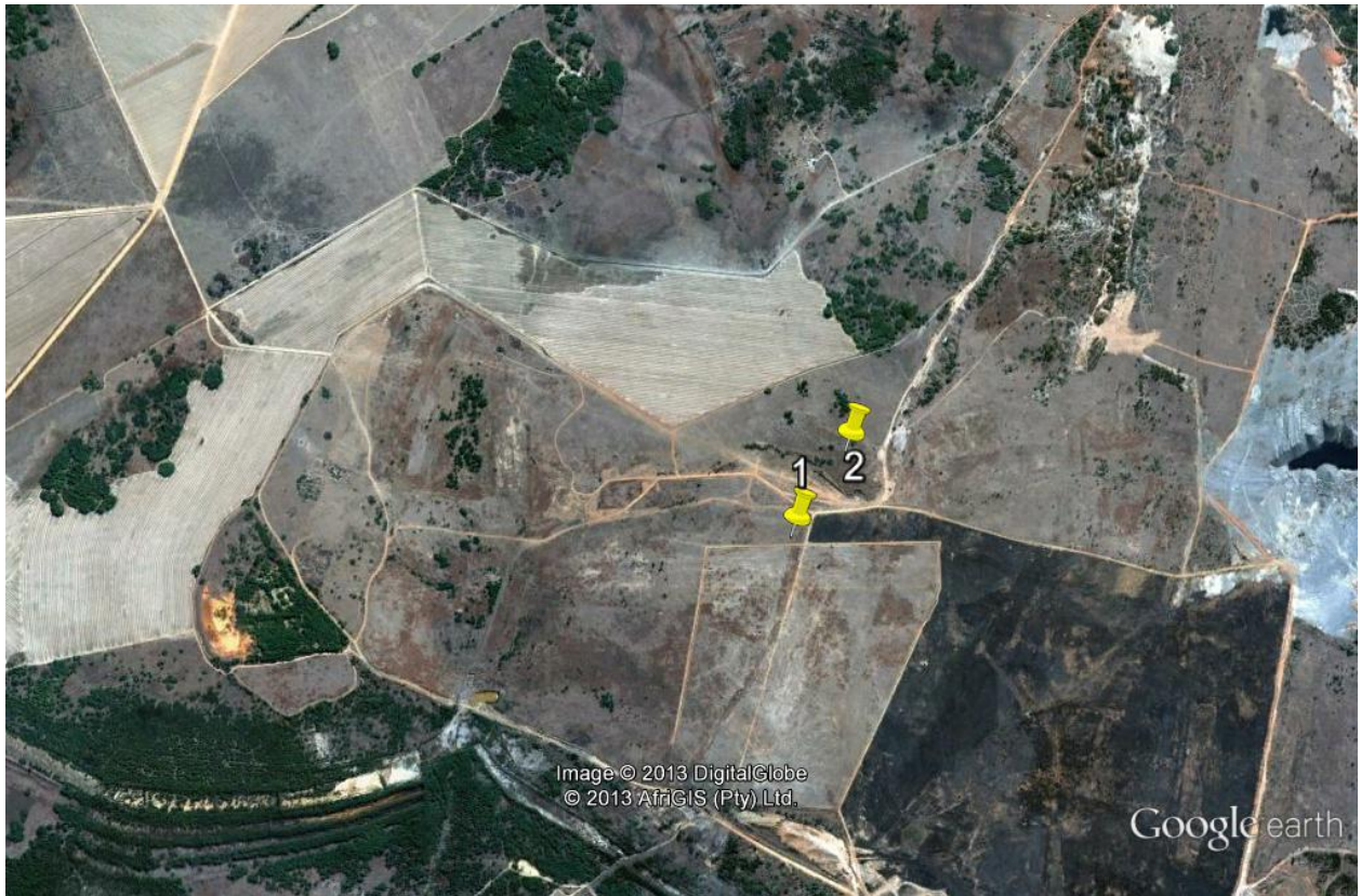
Figure 13 Google image indicating the sites found during the survey.