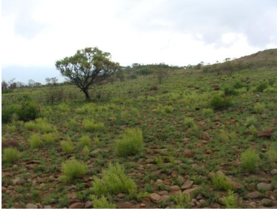
Figure 10 Foothills in the north-east.