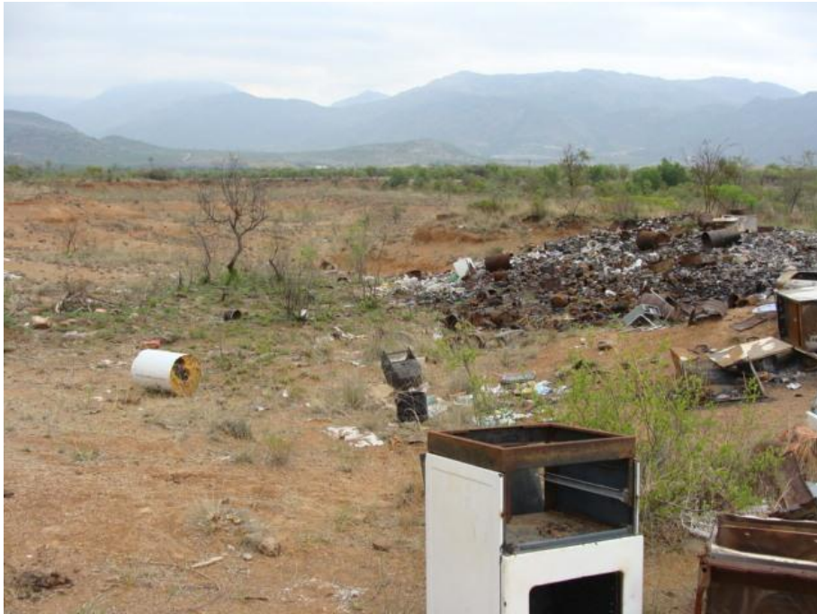
Figure 8 Refuse midden in one of the dongas.