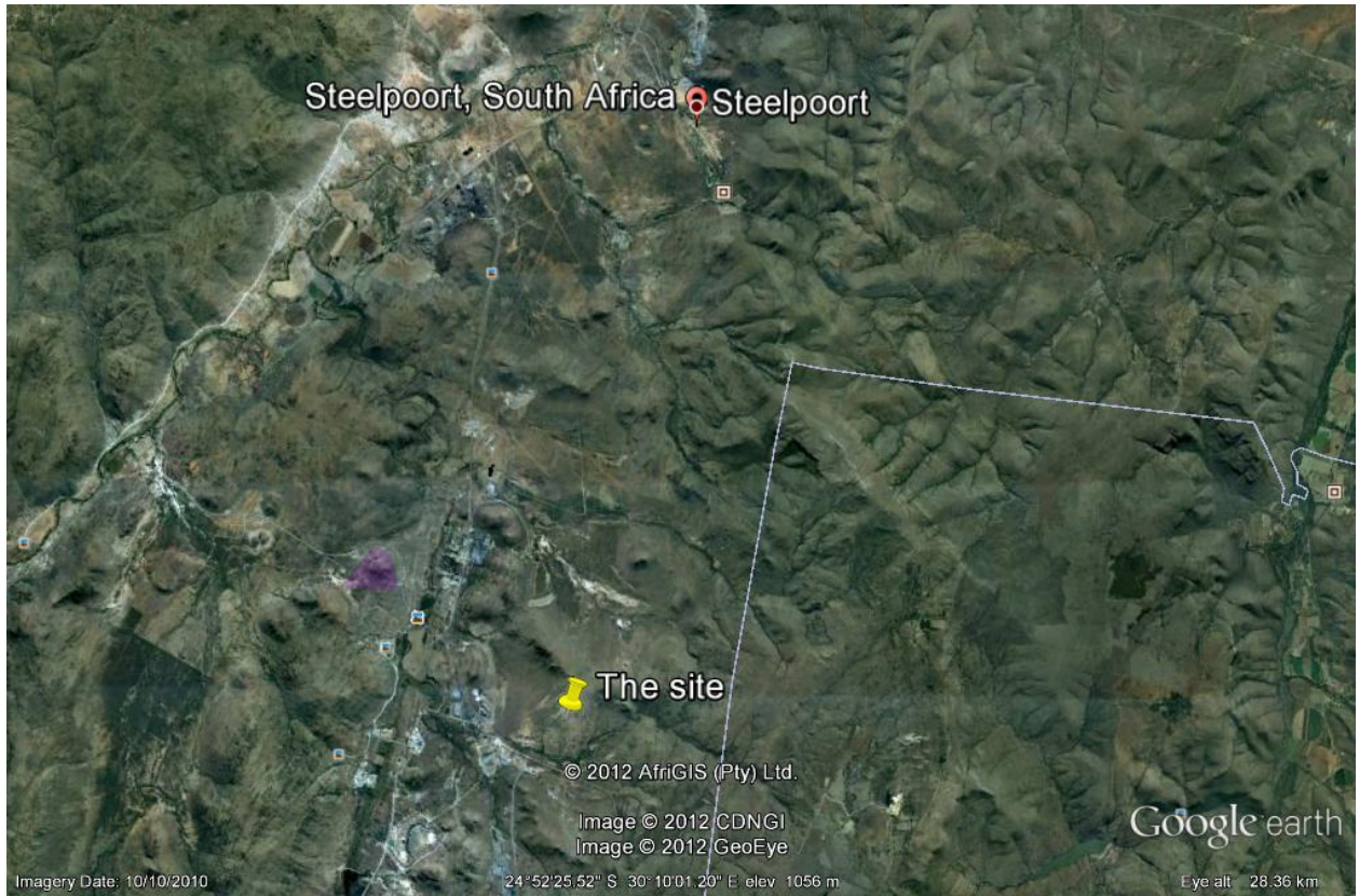
Figure 2 Location of the site in relation to Steelpoort. North reference is to the top.