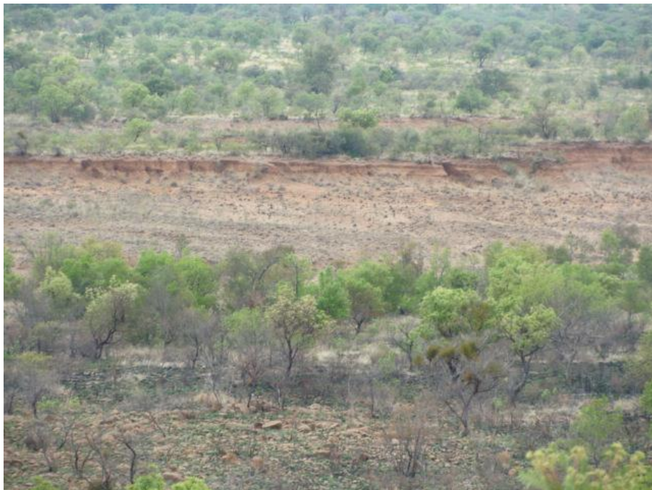
Figure 7 One of the erosion dongas in the surveyed area.