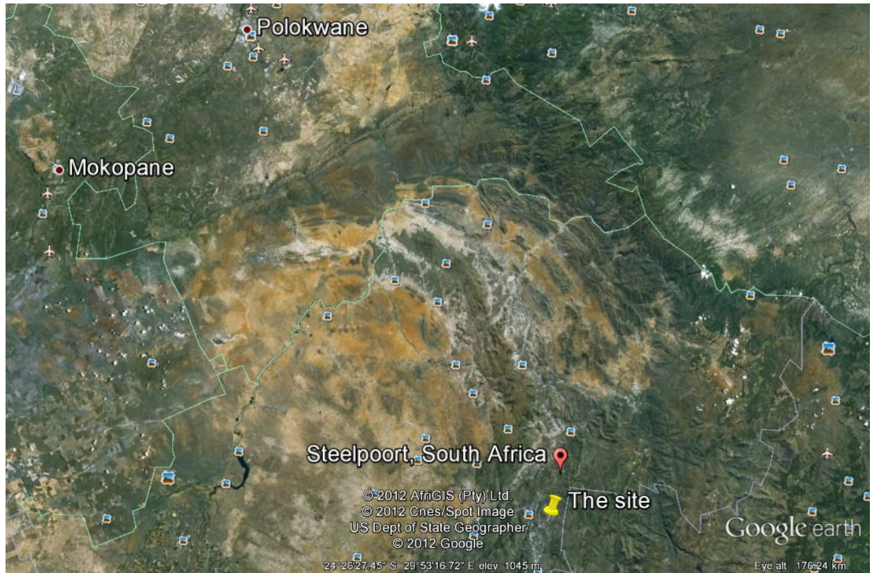
Figure 1 Location of the site and the town of Steelpoort in the Limpopo Province. North reference is to the top of the map.

The client indicated the area where the proposed development is to take place. The field survey was confined to this area, which has a size of 158.3 Ha.