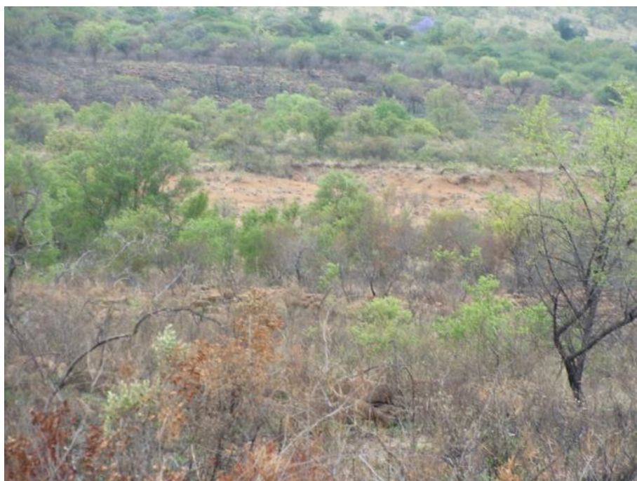
Figure 5 General view of the surveyed area.

A number of farm and other buildings are found along a road in the south-east. None of these have any heritage significance. A power line also runs from south to north in the west of the area.