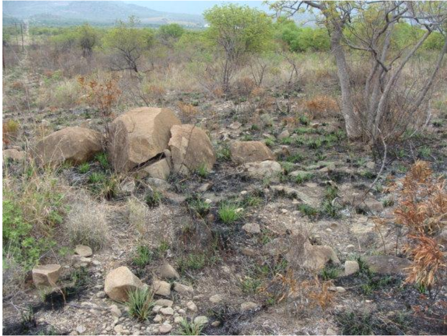
Figure 6 General view of the surveyed area showing indications of recent veld fire.