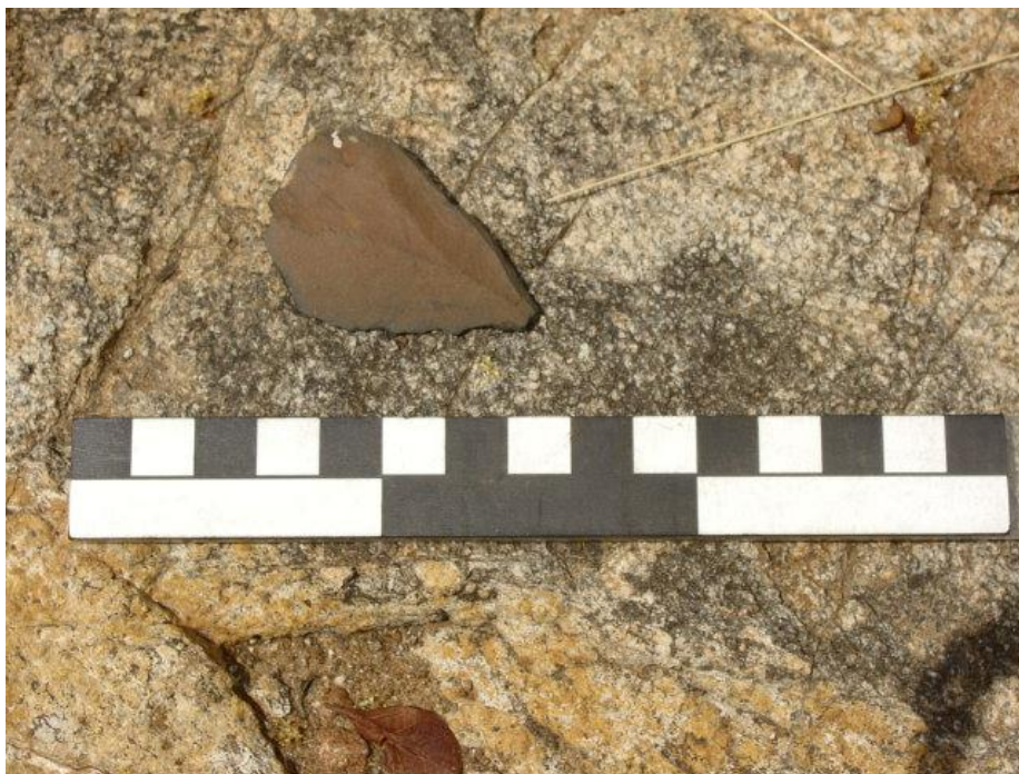
Figure 11 Middle Stone Age tool found during the survey.

Three Middle Stone Age tools were indeed found in different locations during the survey. These were most likely washed down from the top. One of these (Figure 11) is a very fine example of a point which was also used as a scraper.