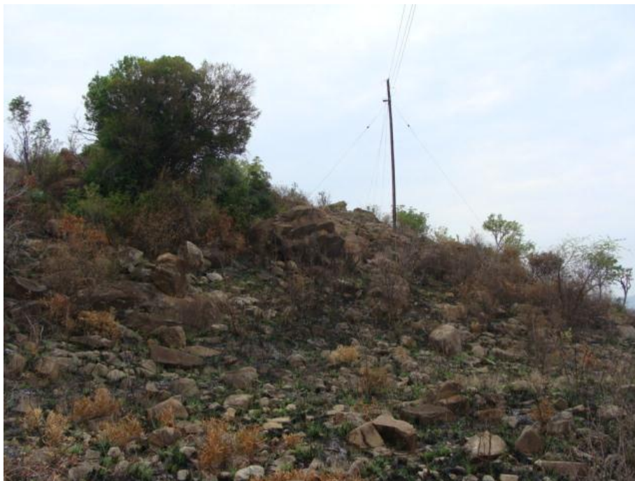
Figure 9 One of the foothills in the north-west.