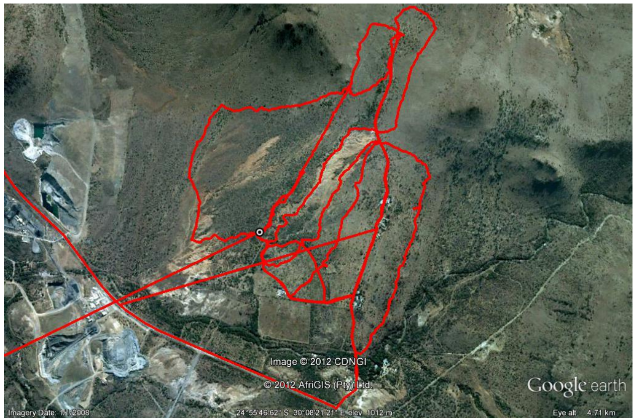
Figure 4 GPS track of the surveyed area 2 . North reference is to the top.

information was added to the description in order to facilitate the identification of each locality.