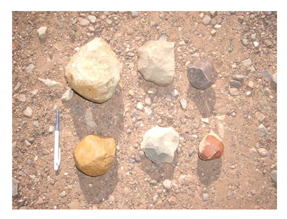
Figure 5. Archaeological Scoping proposed Worcester Waterfront development. Collection of stone tools.