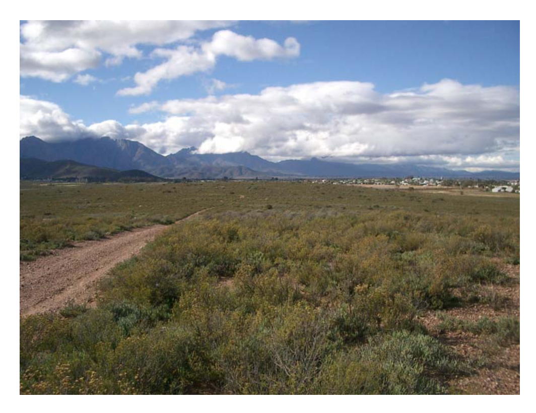
Figure 3. Archaeological Scoping proposed Worcester Waterfront development. The site facing east.