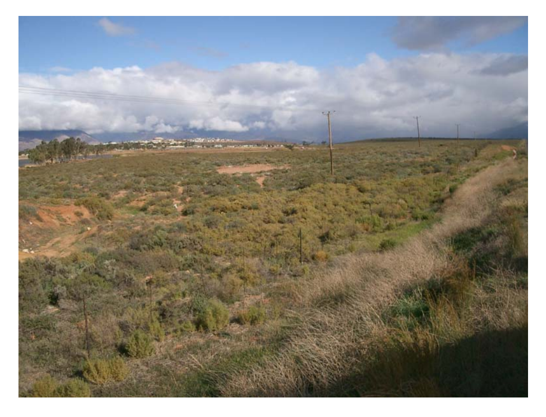
Figure 4. Archaeological Scoping proposed Worcester Waterfront development. The site facing south west. Note the Worcester dam in the corner of the plate.