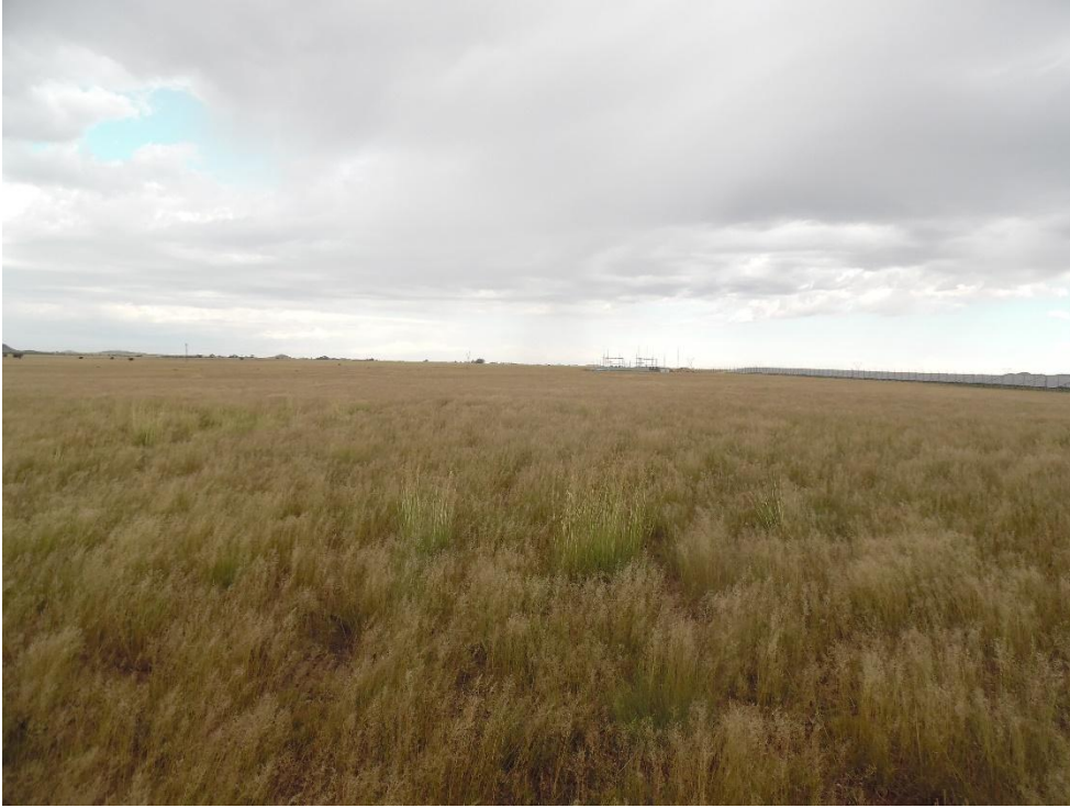
Photograph 5: Site characteristics Pulida Alternative 1