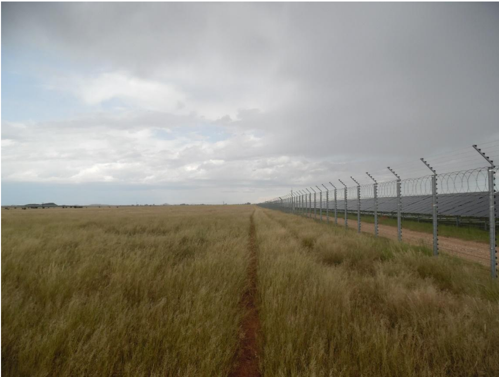
Photograph 8: Site characteristics Pulida Alternative 2 (Preferred)