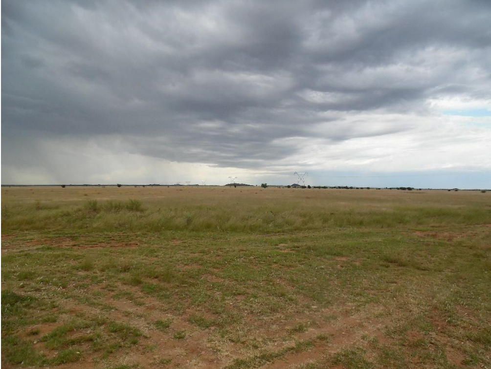
Photograph 1: Site characteristics Alternative 1