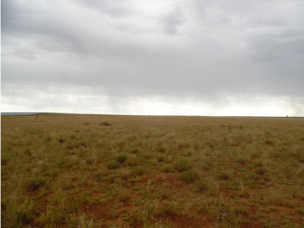
Photograph 3: Site characteristics Alternative 1