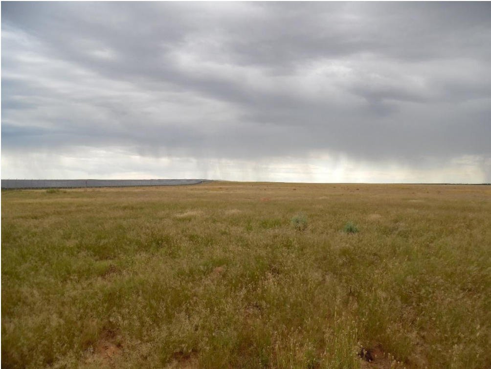
Photograph 2: Site characteristics Alternative 1