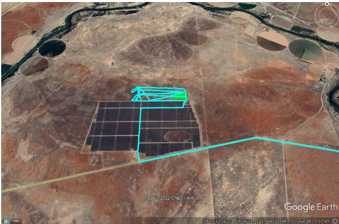
Figure 3: Track route