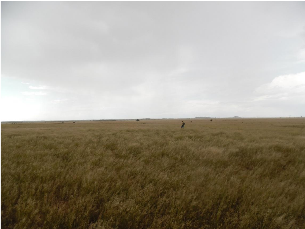
Photograph 6: Site characteristics Pulida Alternative 2 (Preferred)