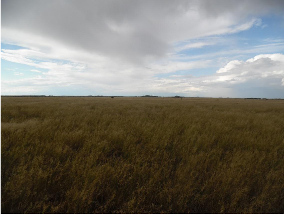
Photograph 7: Site characteristics Pulida Alternative 2 (Preferred)