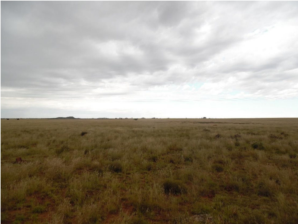
Photograph 4: Site characteristics Alternative 1